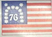
1777-BENNINGTON FLAG Carried at the Battle of Bennington.