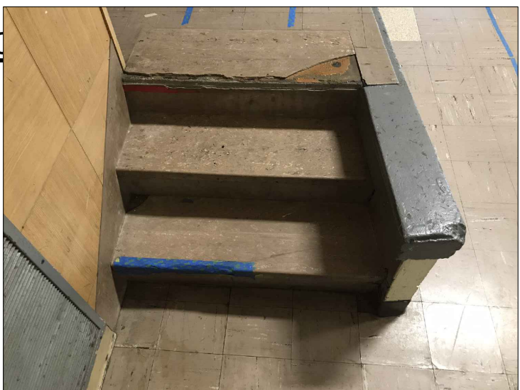
P1 VIEW OF LEFT STAIRS @ STAGE