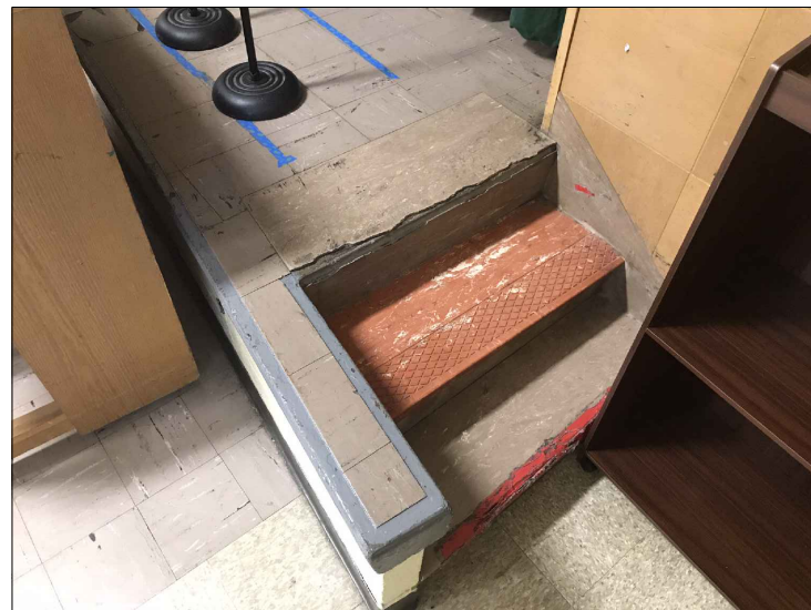
P3 VIEW OF RIGHT STAIRS @STAGE