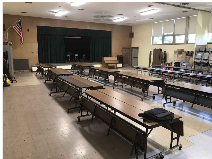
P4 VIEW OF STAGE