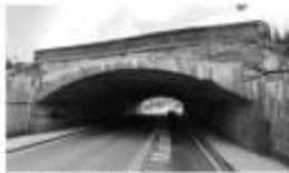
Madison Street Underpass Daytime Image Reference