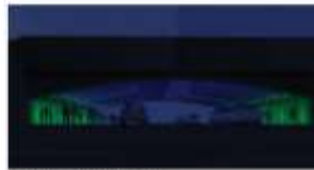
Madison Street Underpass Evening Rendered Image Reference