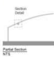
Partial Section NTS