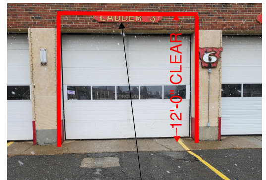
PHOTO 2 SOUTH BAY 2/LADDER 3

Existing Garage to door opening to be increased in height "By Others"