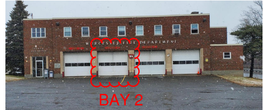
PHOTO 1 SOUTH ELEVATION