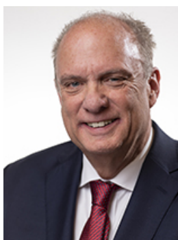
MAYOR JOSEPH M. PETTY