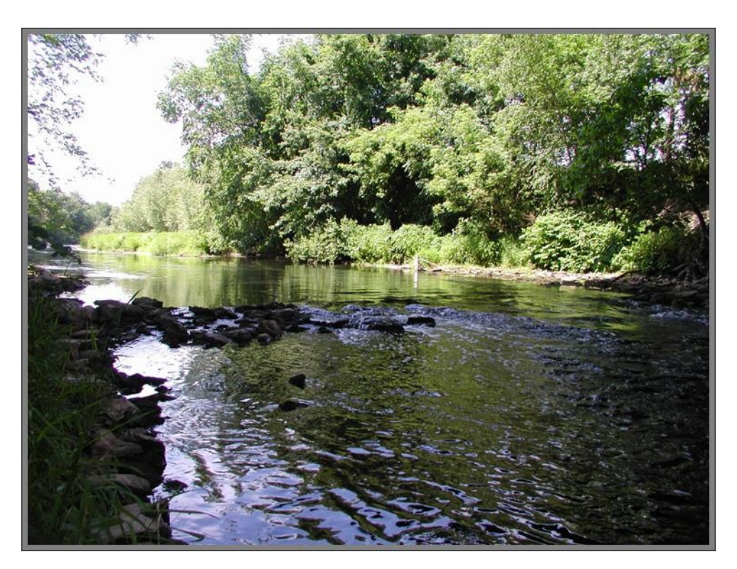
Blackstone River, Millbury, MA

For the period January 1 through December 31, 2022