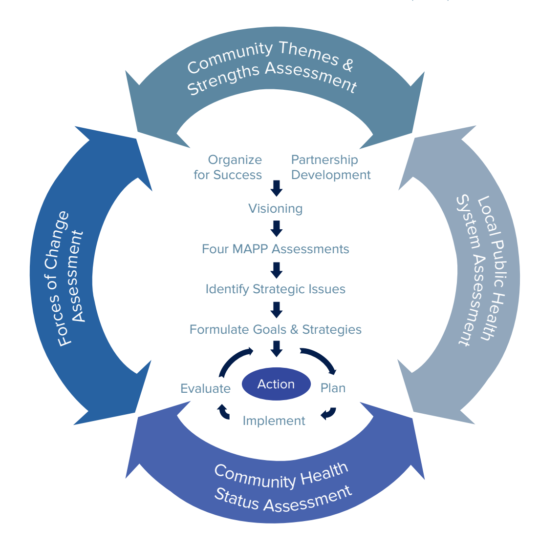
FIGURE 1. MOBILIZING FOR ACTION THROUGH PLANNING AND PARTNERSHIPS (MAPP)