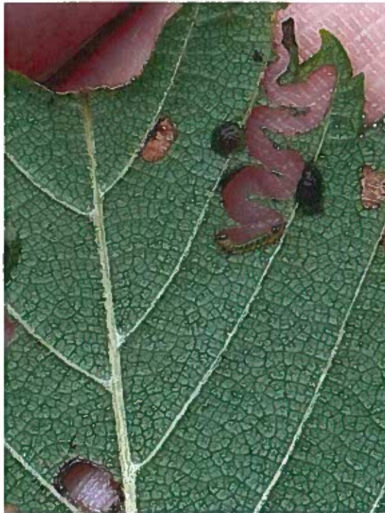
Elm zigzag sawfly feeding on an elm leaf in Berkshire County, MA on 8/16/2023.

Female elm zigzag sawflies cause a tiny amount of damage to the edges of host plant leaves as they lay their eggs. Tiny scars are formed as a result of female egg laying. Eggs hatch and young sawfly caterpillars (the most destructive life stage of the insect) begin their characteristic zig-zag patterned feeding. These zig-zag shaped notches in the leaf can extend 5-10 mm into the leaf from the edge. Multiple caterpillars can feed on a single leaf and entire leaves can be completely stripped, leaving only veins behind. Heavily infested trees can suffer partial or complete defoliation.