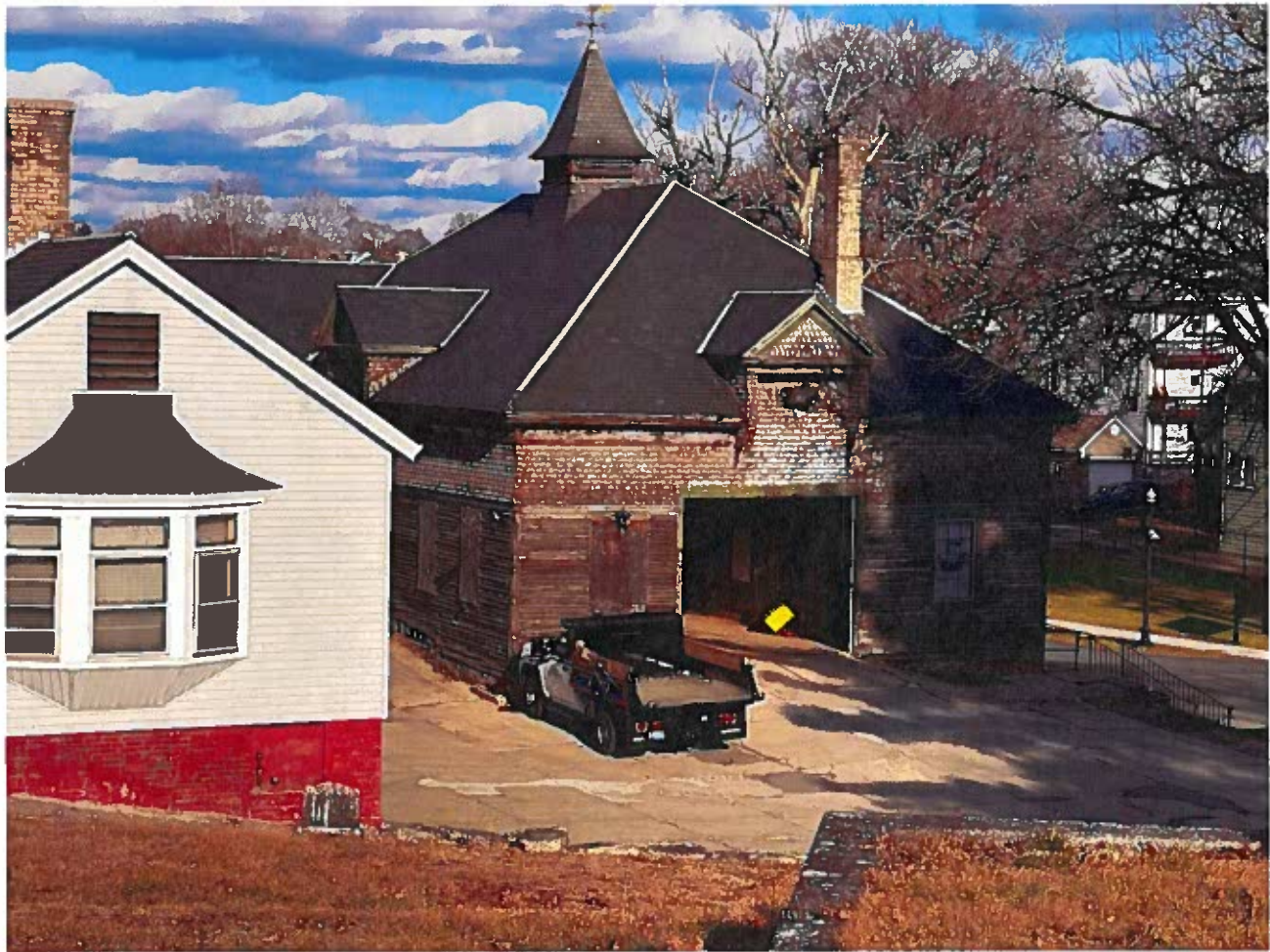
The barn at Hope Cemetery, as seen in photographs taken in December, has fallen into disrepair and Cemetery Commissioners are seeking funding to either raze and replace or restore it

WORCESTER—Despite having been listed as an endangered historic building four times, Hope Cemetery Commissioners are asking the Commissioner of Public Works and Parks to prioritize funding for the barn at Hope Cemetery with the possibility of razing the 142-year-old structure.