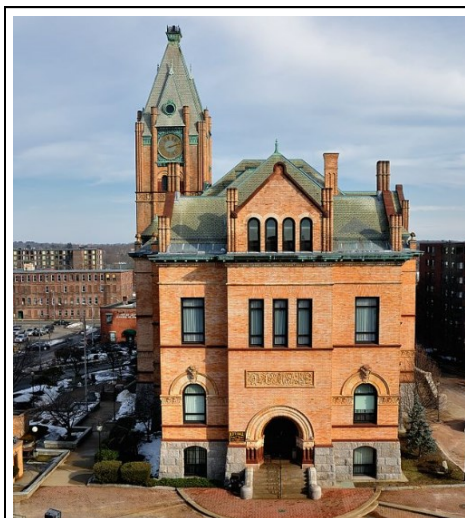
Brockton City Hall.

OCPF will assist candidates in the eight cities to set up in the new system. More information about joining the depository system is available at OCPF’s “getting started” page here .