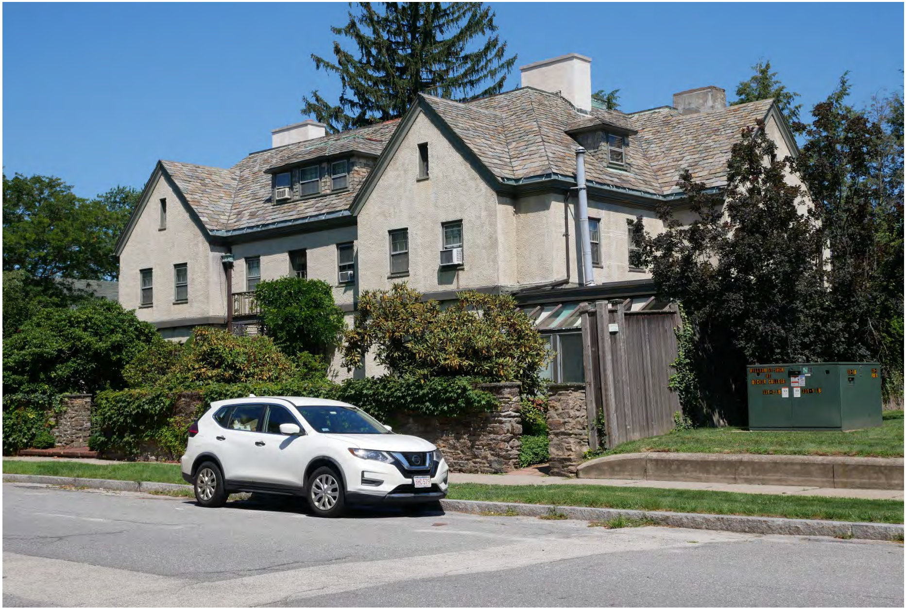
180. 74 William Street, looking northwest. Integrity rating: excellent