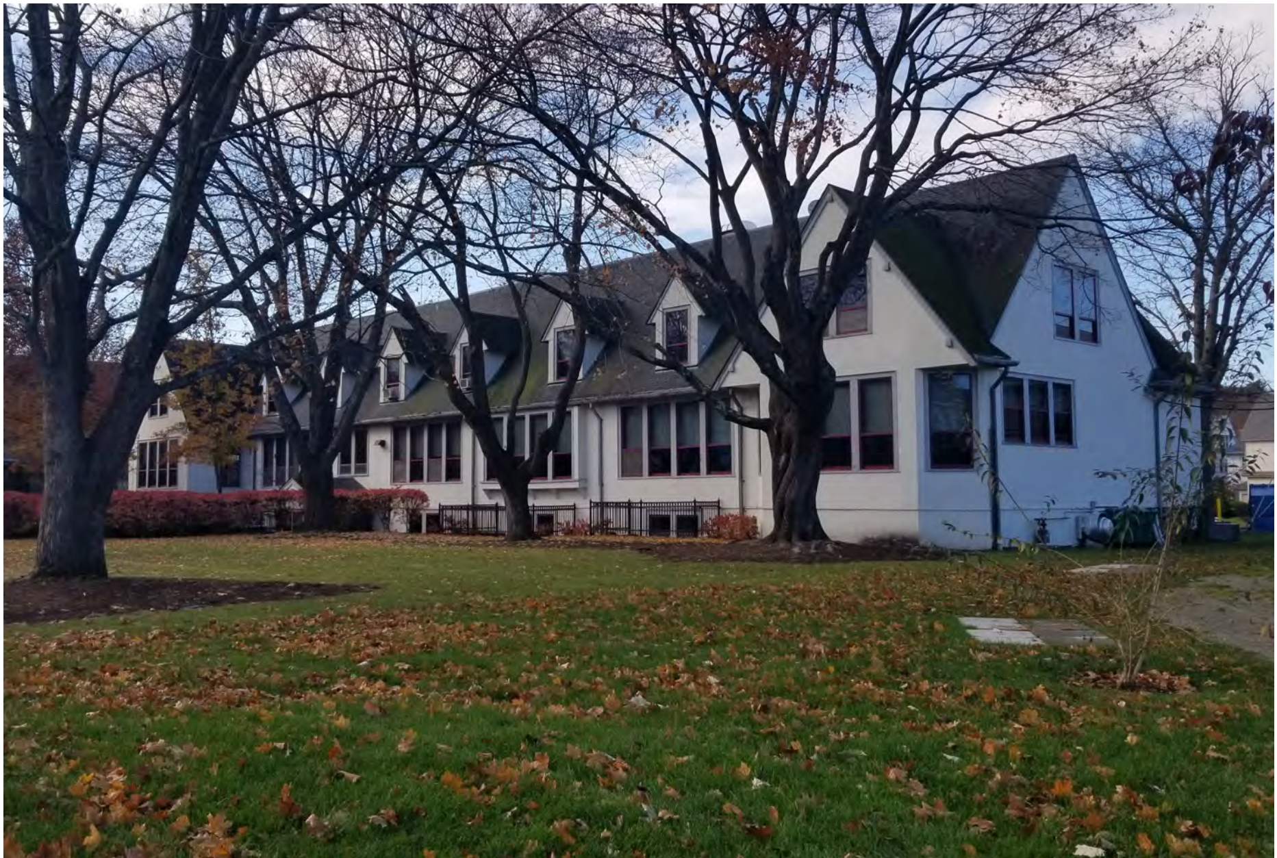
137. 61 Sever Street, looking southwest. Integrity rating: very good