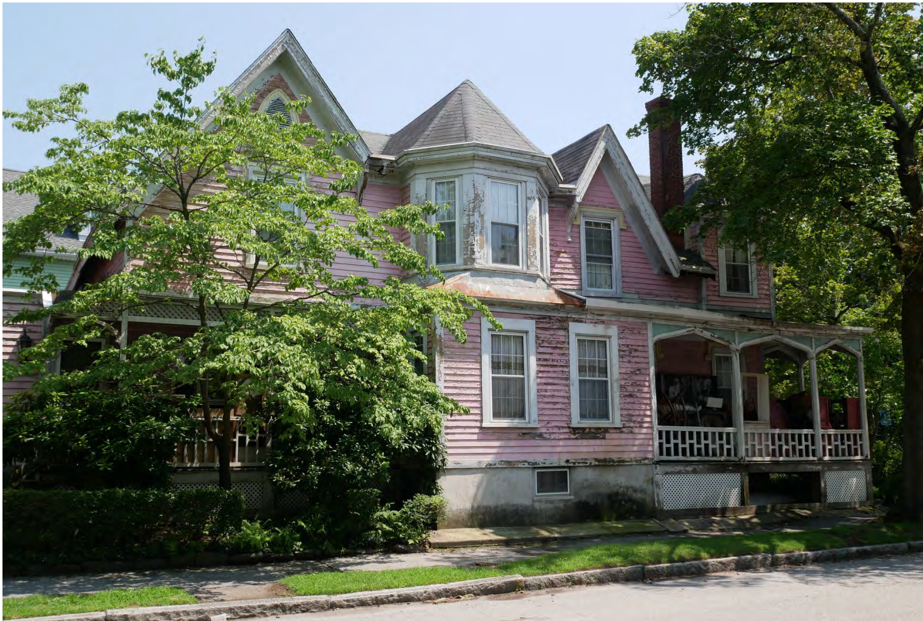
25. 22 Dayton Street, looking southeast. Integrity rating: good to very good