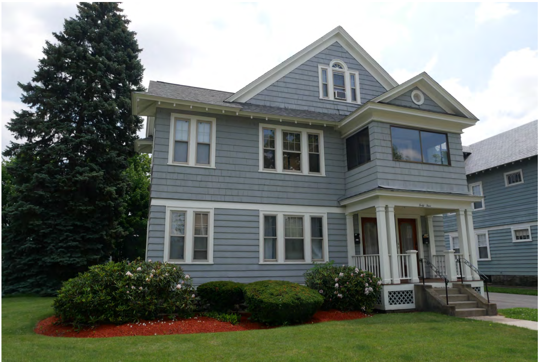
162. 44 Somerset Street, looking southeast. Integrity rating: good