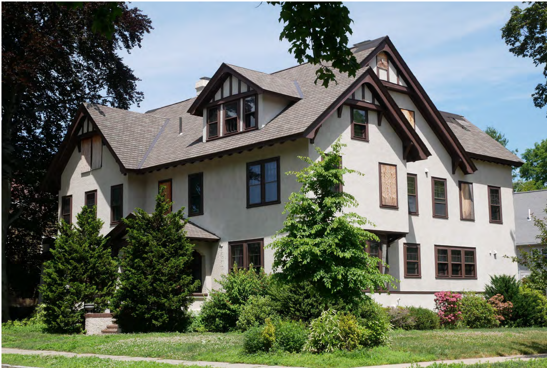
191. 96 William Street, looking northwest. Integrity rating: very good (assuming fire damage mitigation measures)