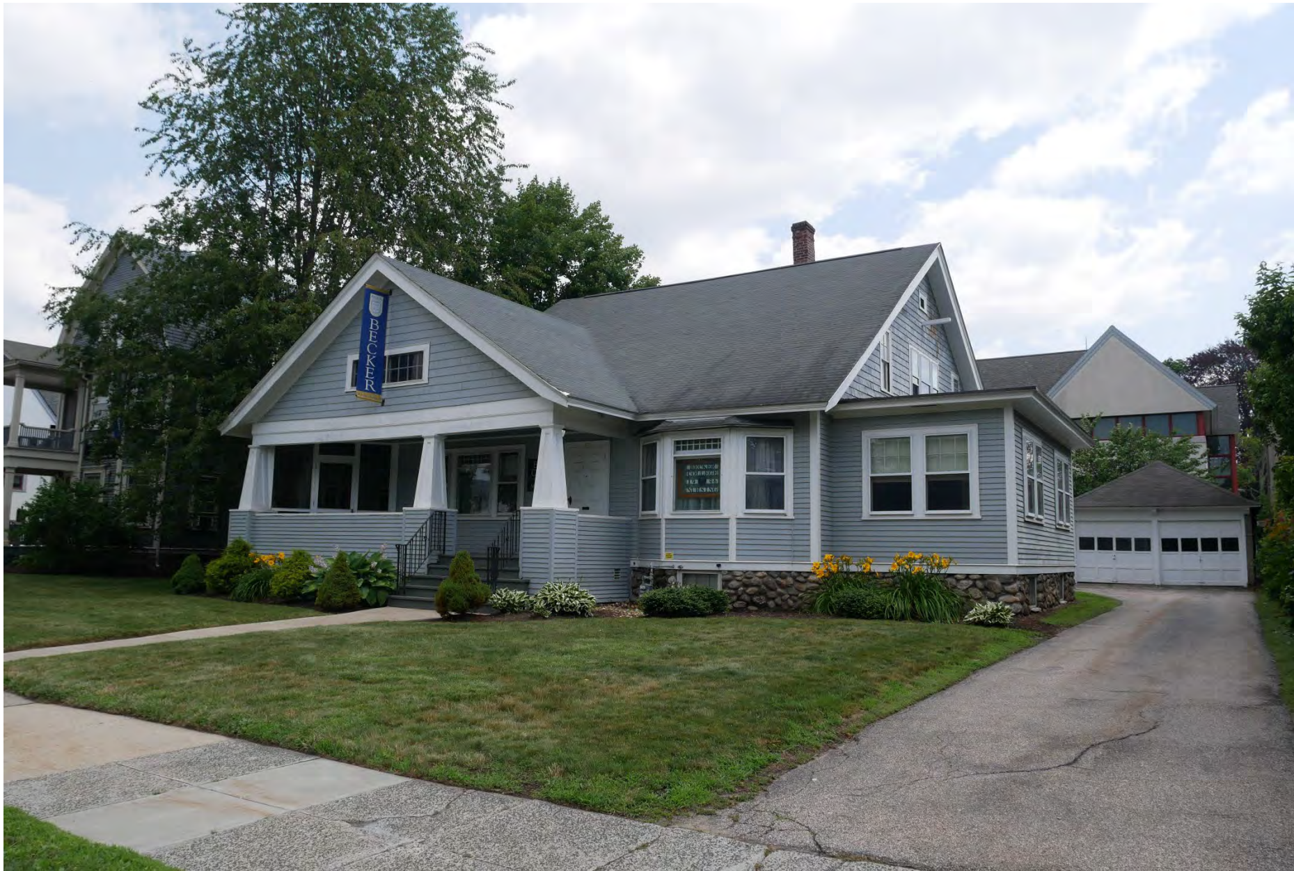
94. 12 Roxbury Street, house and garage, looking northeast. Integrity rating: very good