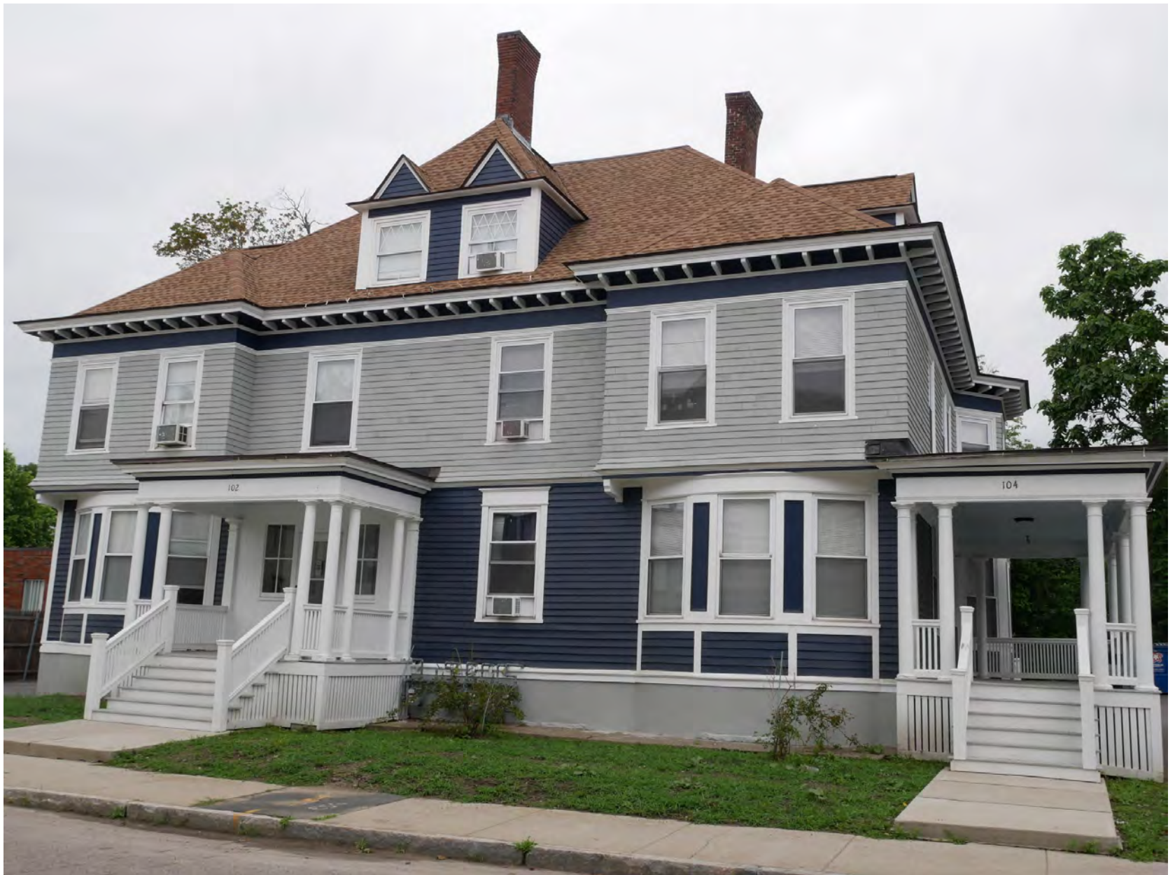
91. 102-104 Merrick Street, looking southwest. Integrity rating: good to very good