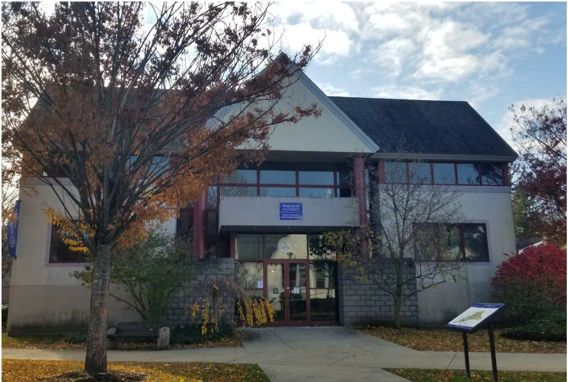
135. 51 Sever Street, looking south from quad. Integrity rating: Excellent (non-historic)