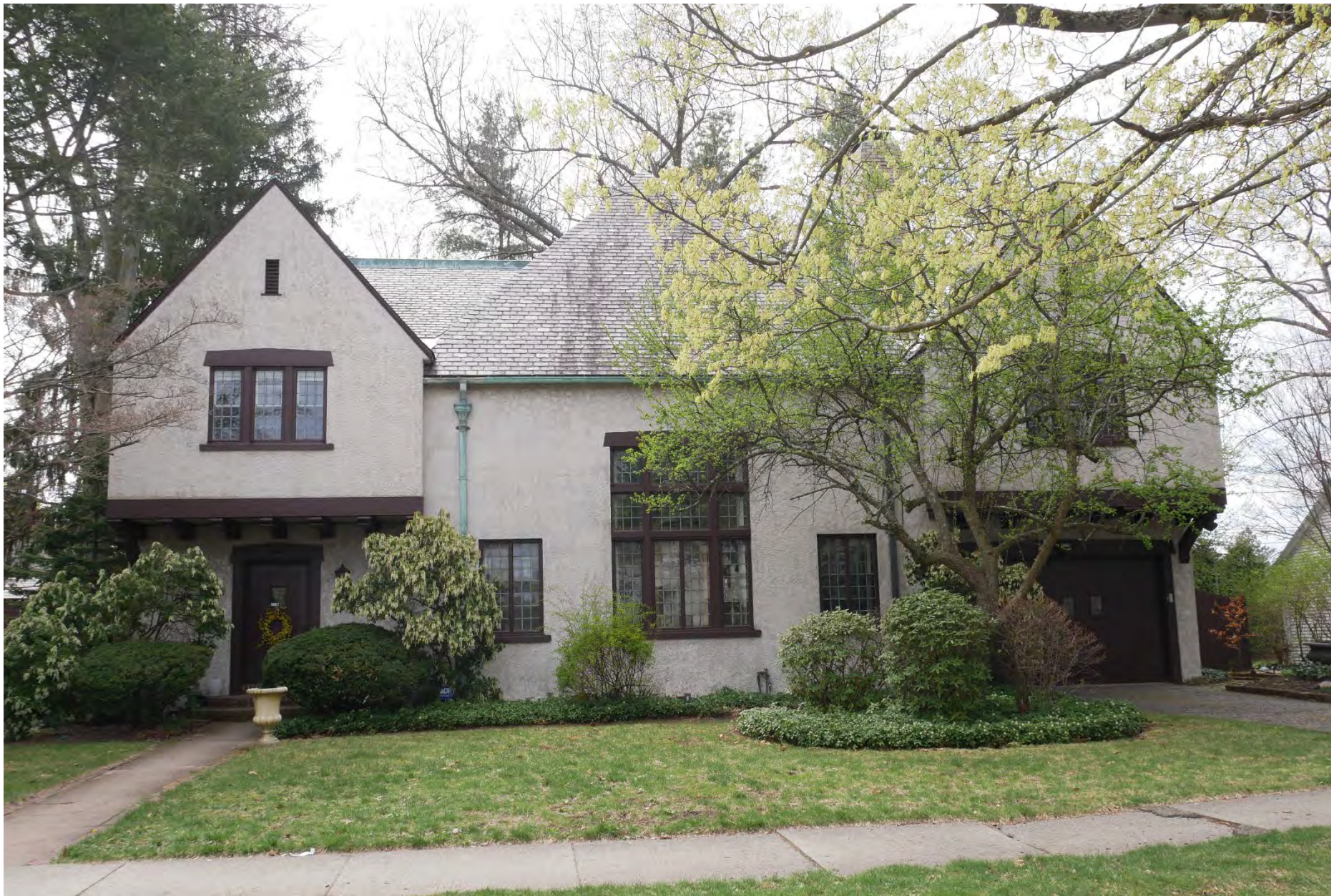
188. 87 William Street, looking south. Integrity rating: excellent