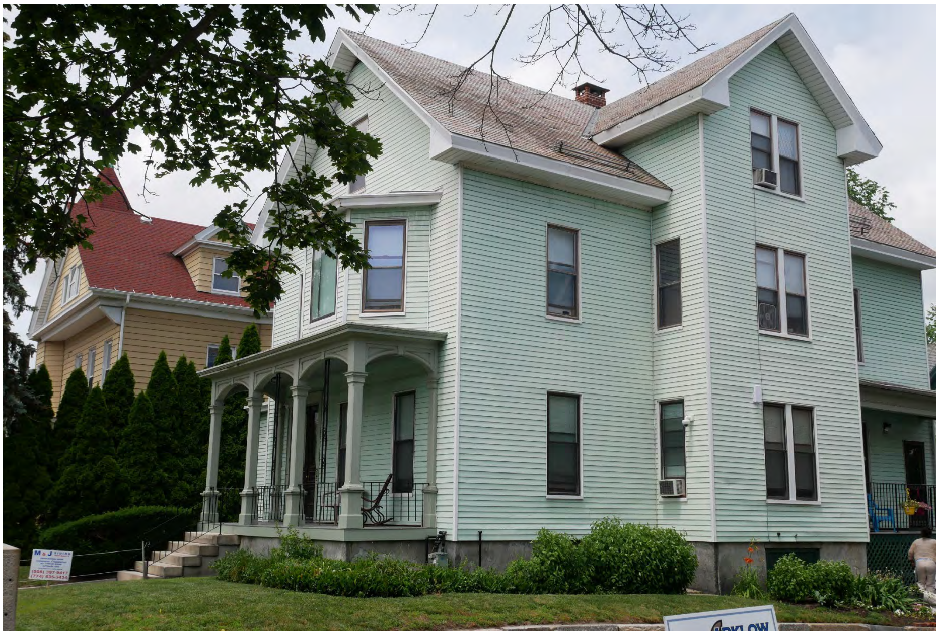
30. 85 Elm Street, looking northwest. Integrity rating: good