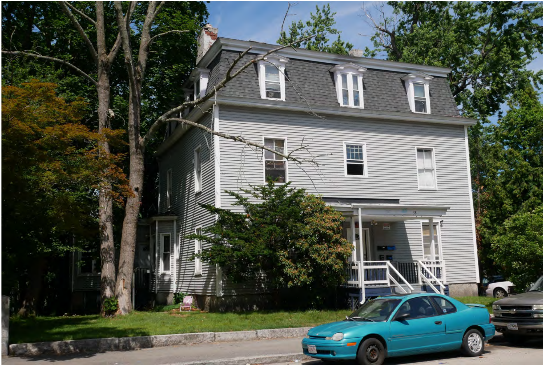
166. 58 West Street, looking northwest. Integrity rating: good