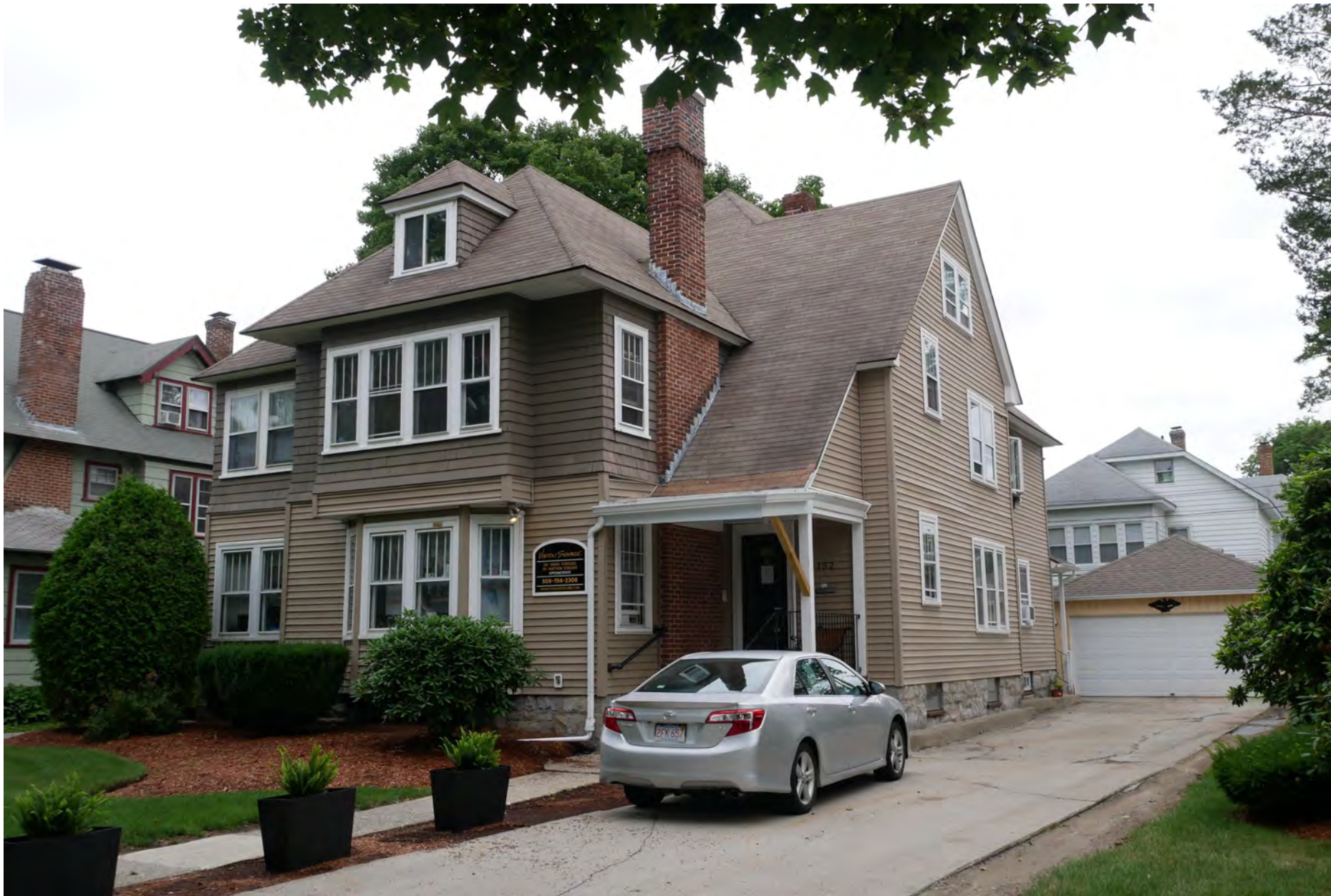
120. 152 Russell Street, house and garage, looking northeast. Integrity rating: good