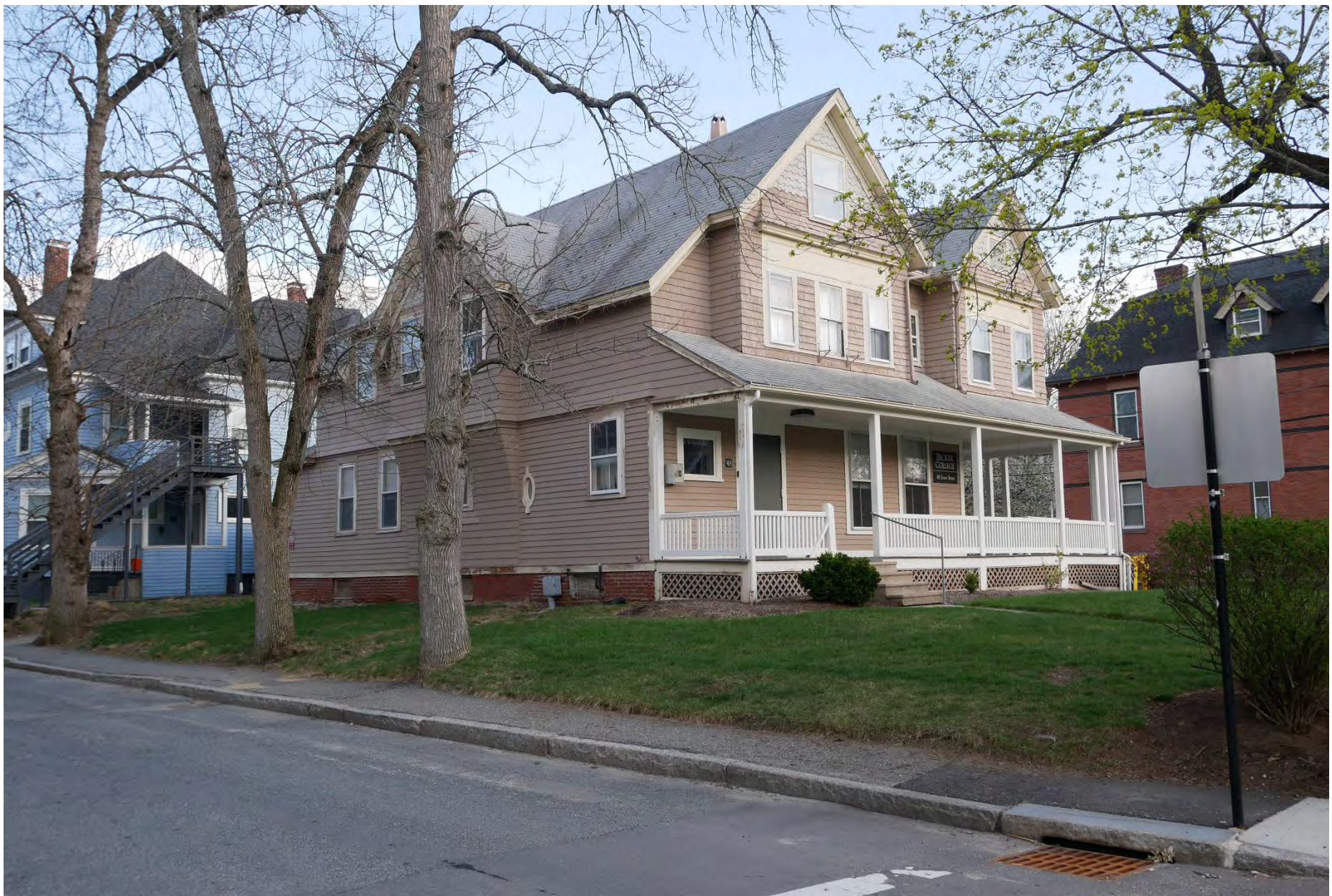
134. 48 Sever Street, looking southeast. Integrity rating: very good