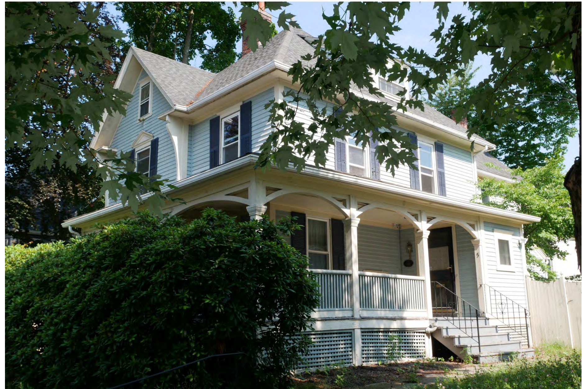
88. 5 Marston Way, looking northeast. Integrity rating: very good