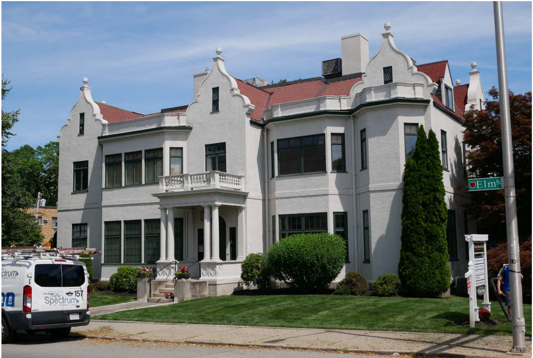
26. 71 Elm Street, northwest. Integrity rating: excellent