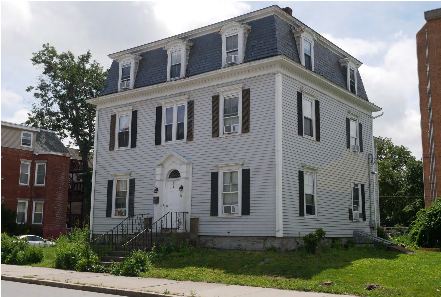
34. 94 Elm Street, looking southeast. Integrity rating: very good