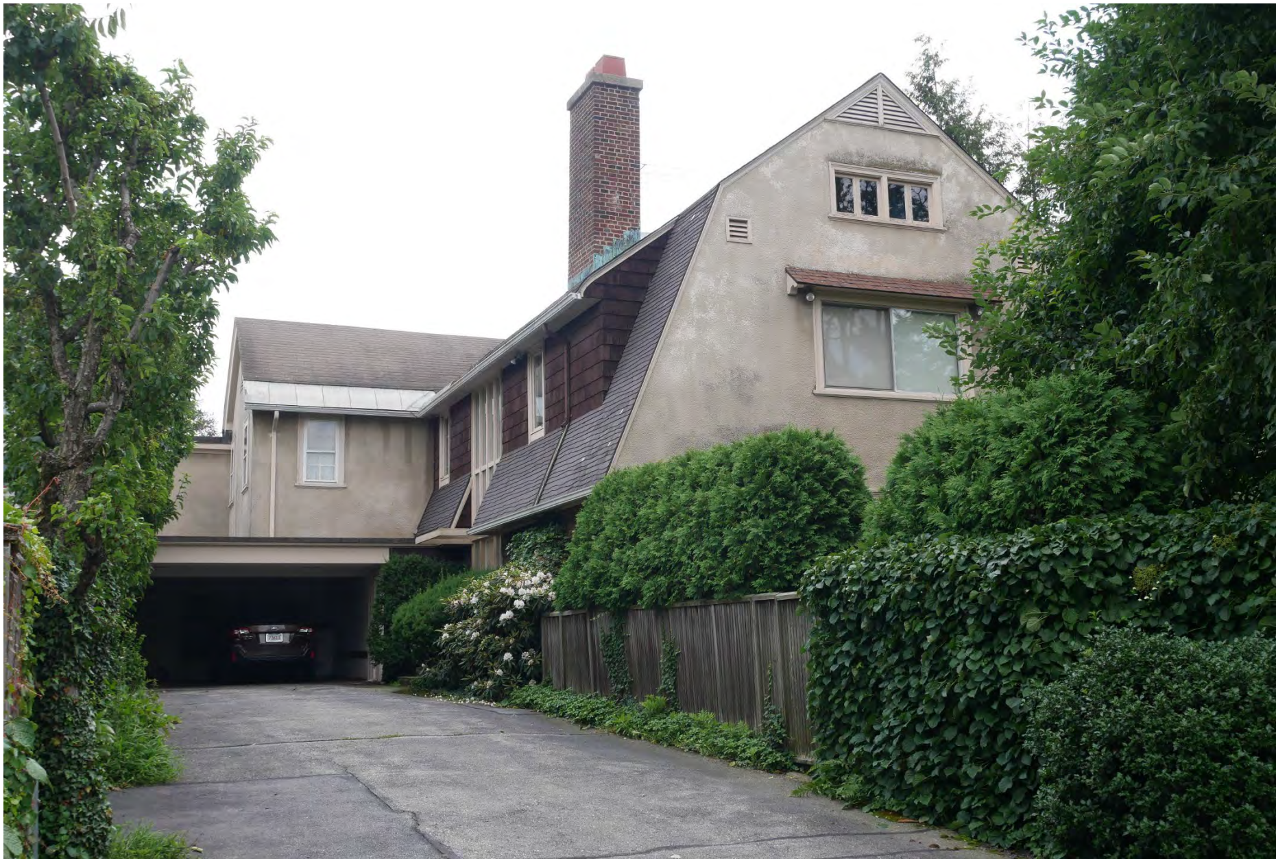
93. 10 Roxbury Street, looking southeast. Integrity rating: good