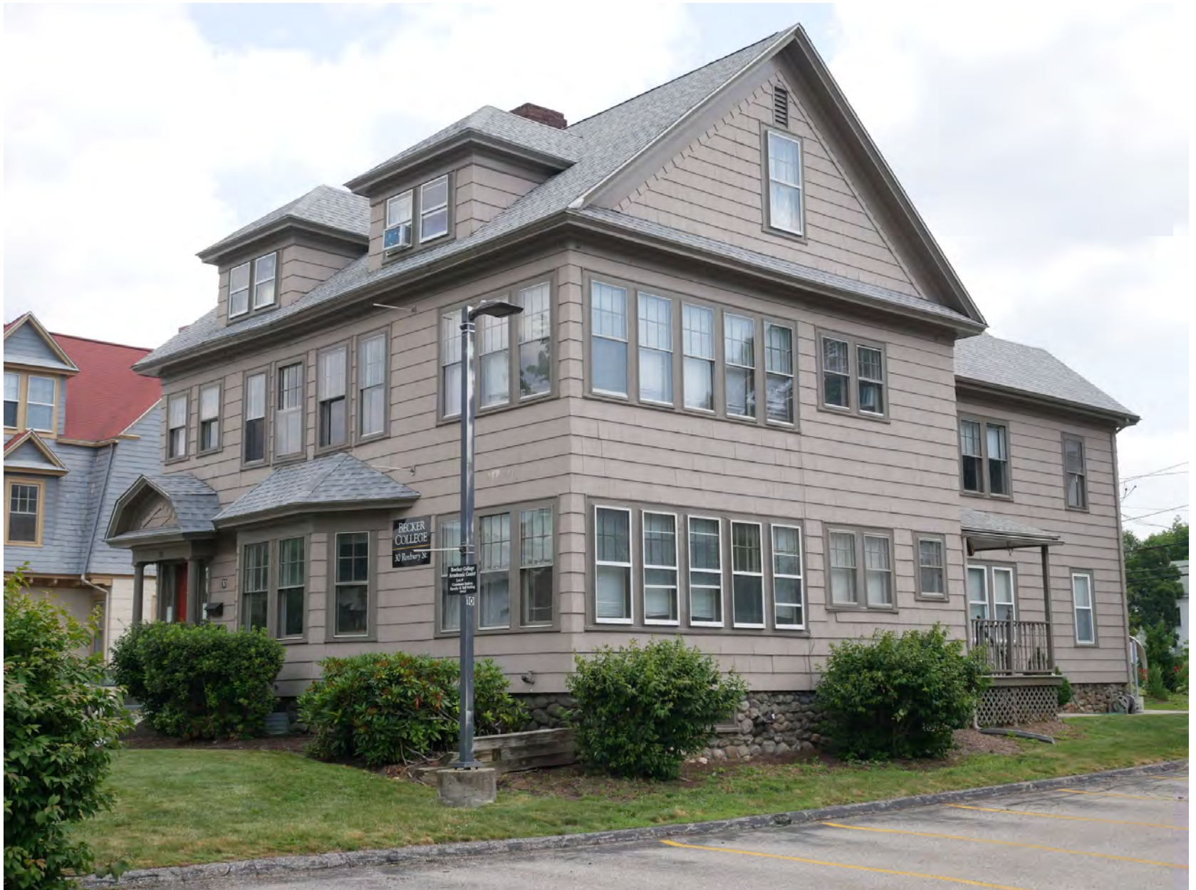
101. 30 Roxbury Street, looking northeast. Integrity rating: very good