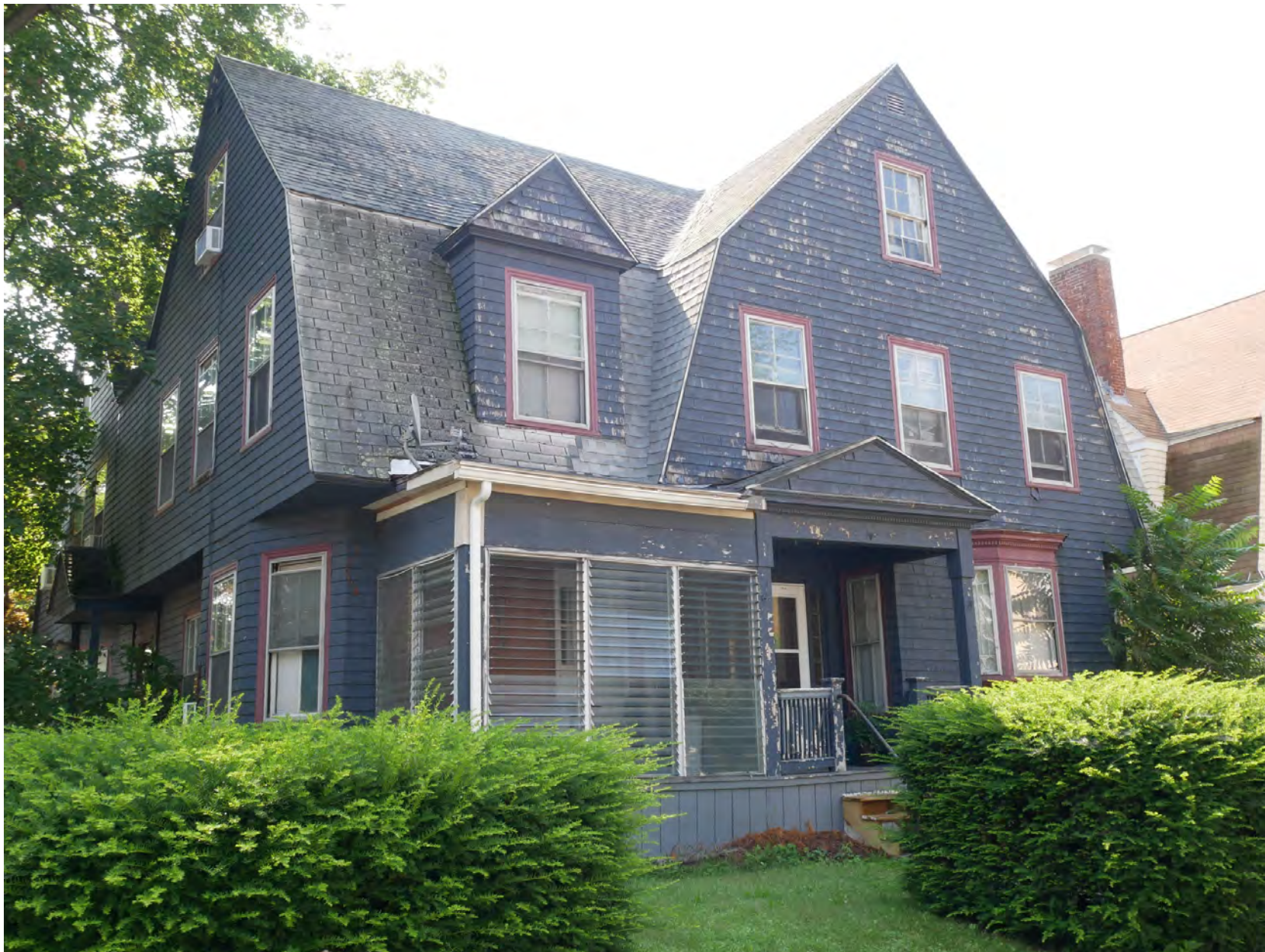
75. 50 Fruit Street, looking southeast. Integrity rating: very good