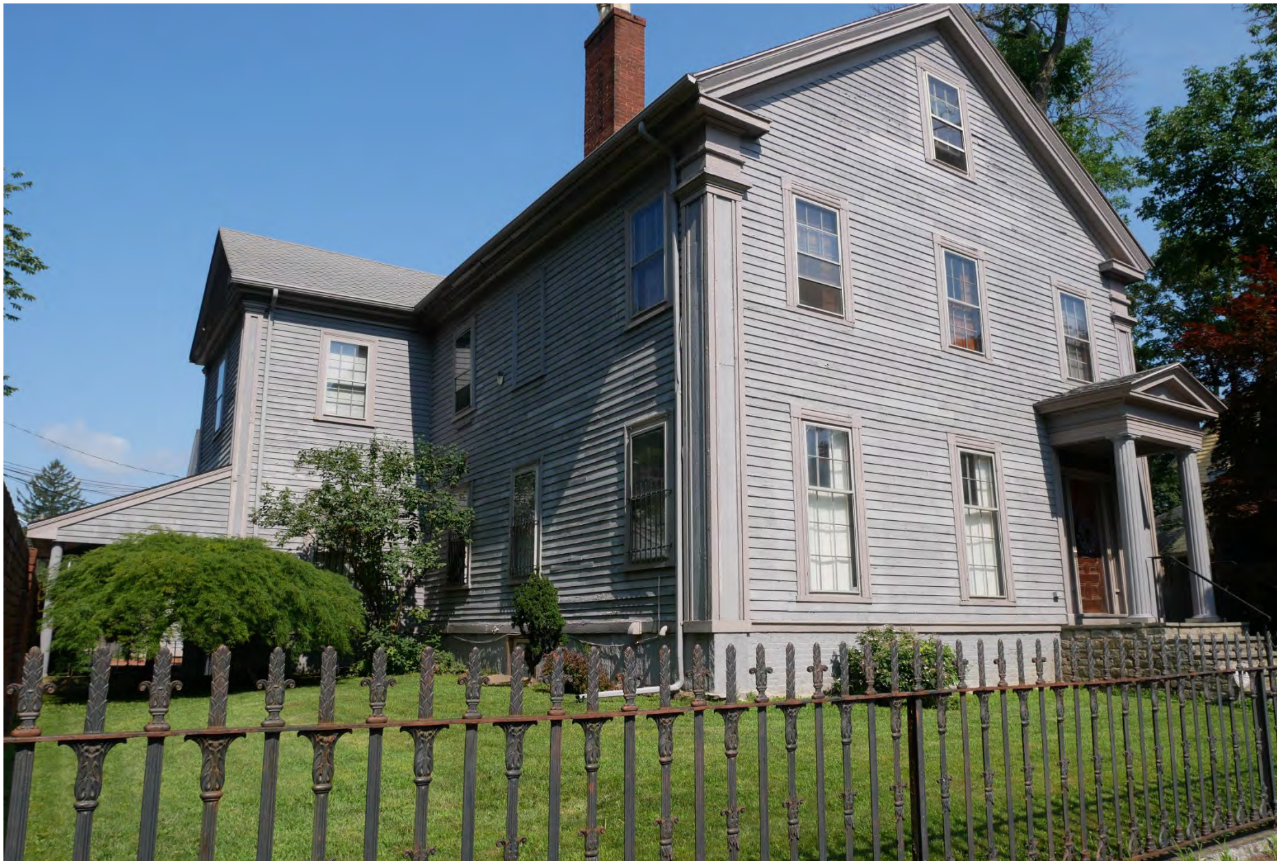
70. 41 Fruit Street, looking northwest. Integrity rating: very good