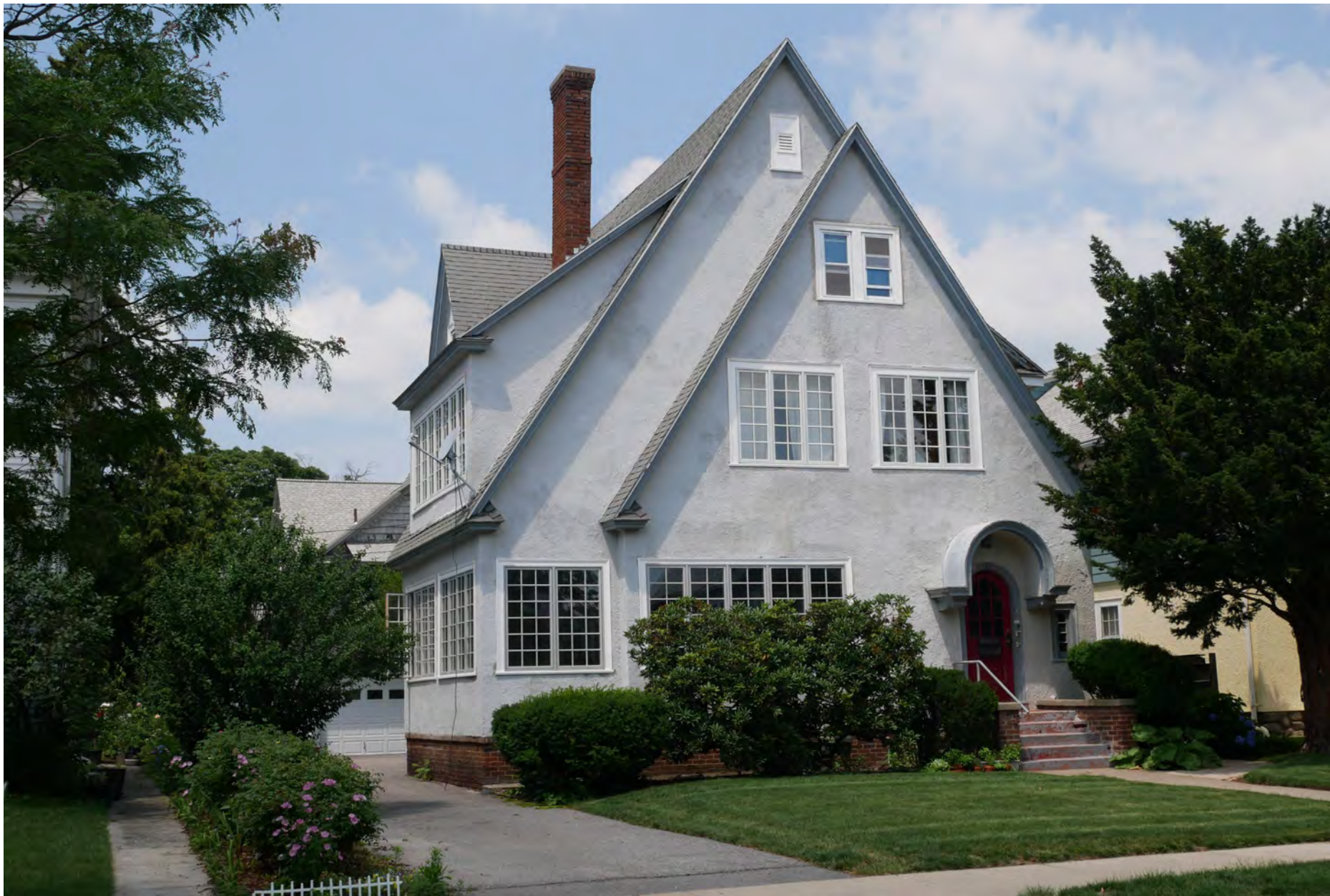
159. 37 Somerset Street, house and garage, looking northwest. Integrity rating: very good