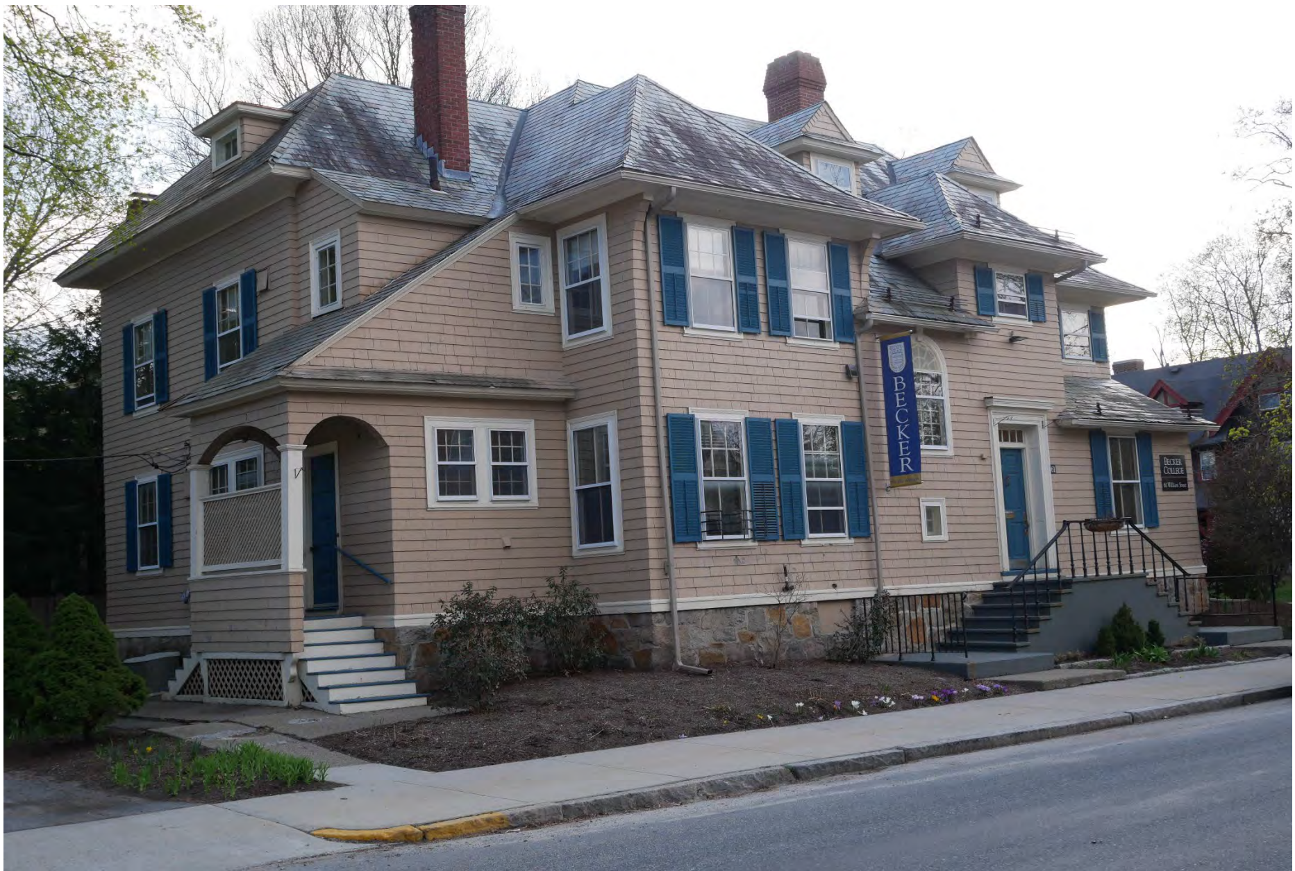
177. 61 William Street, looking southwest. Integrity rating: very good