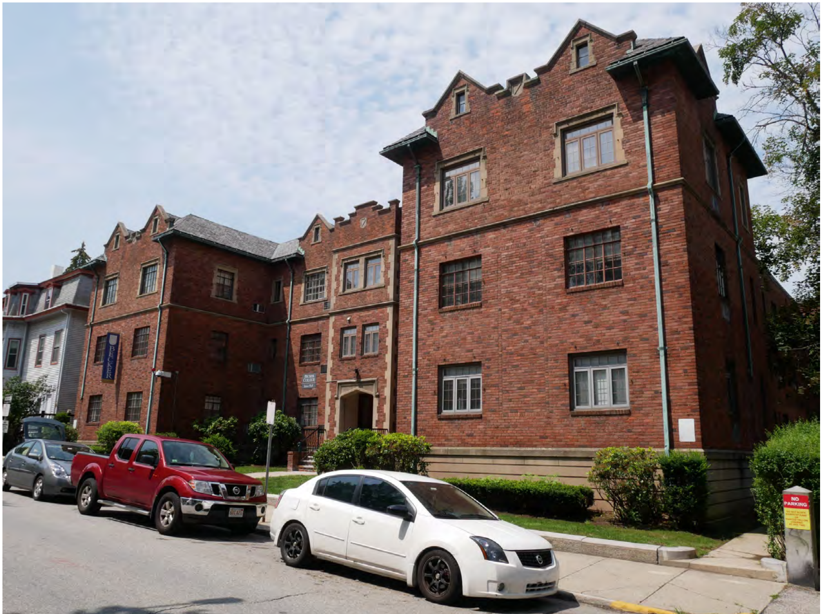
60. 21 Fruit Street, looking southwest. Integrity rating: excellent