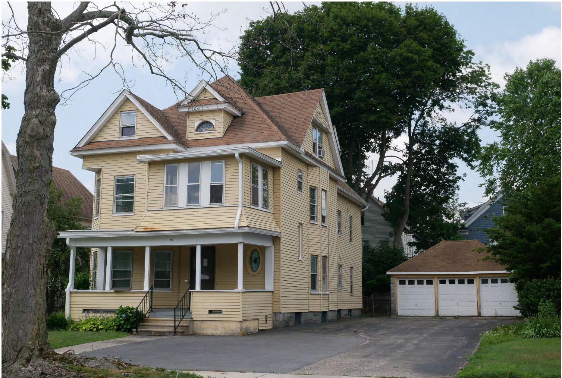
100. 29 Roxbury Street, house and garage, looking southwest. Integrity rating: fair