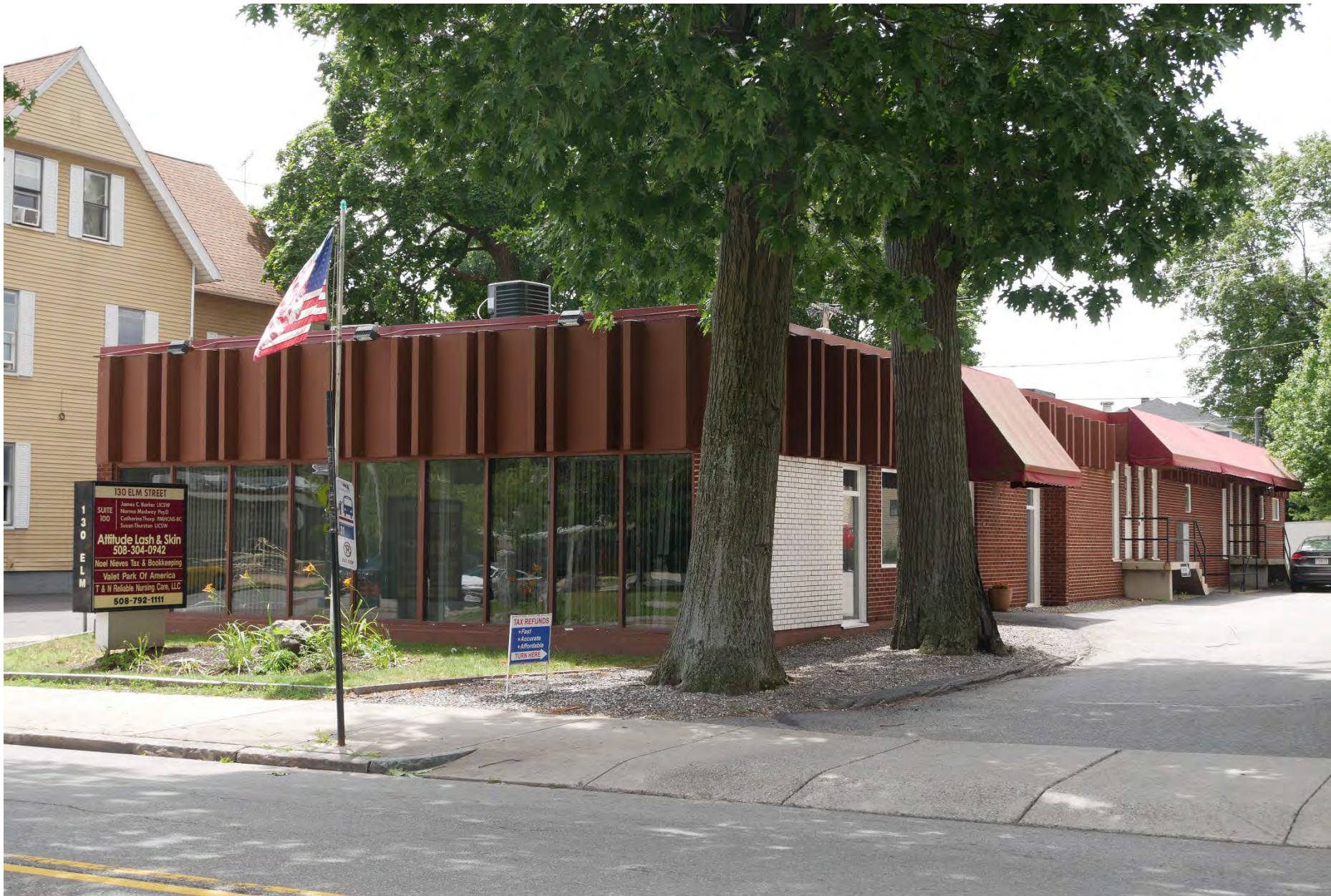
50. 130 Elm Street, looking southeast. Integrity rating: excellent