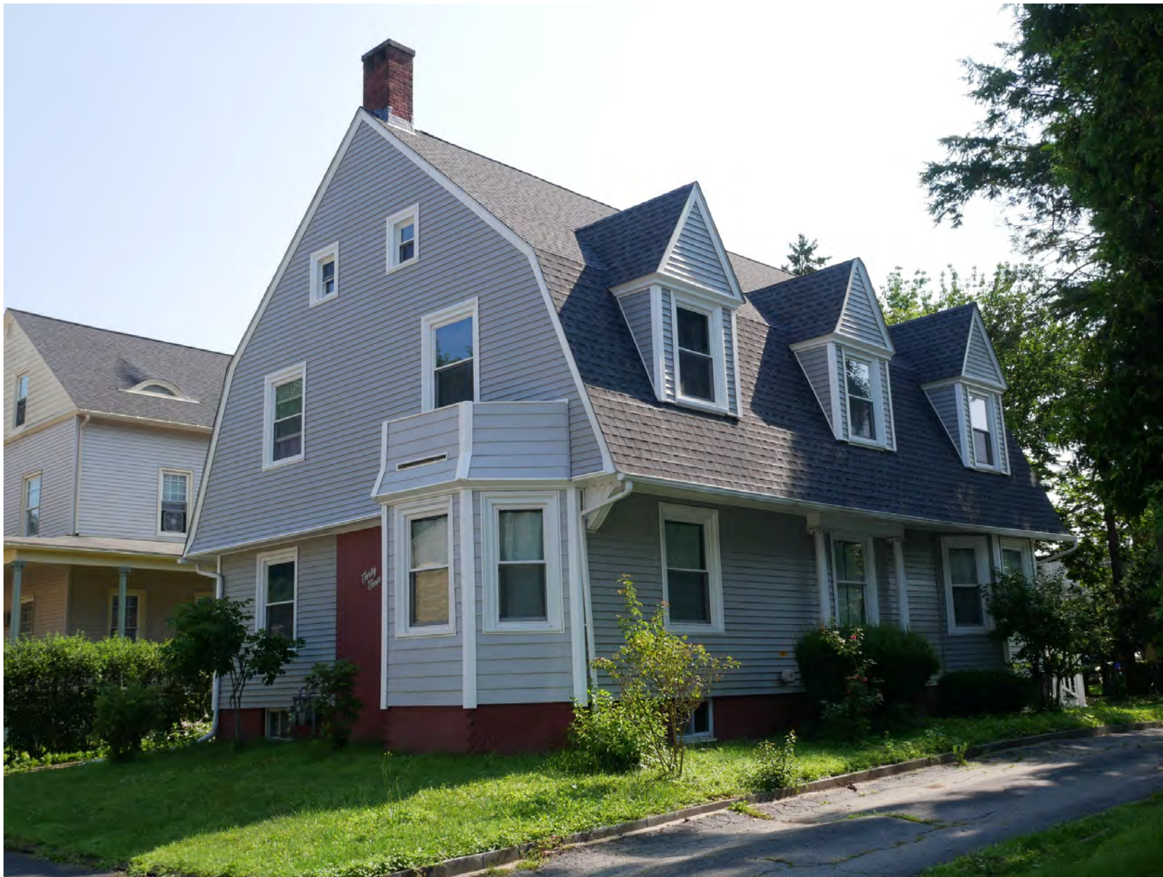
72. 44 Fruit Street, looking northeast. Integrity rating: good