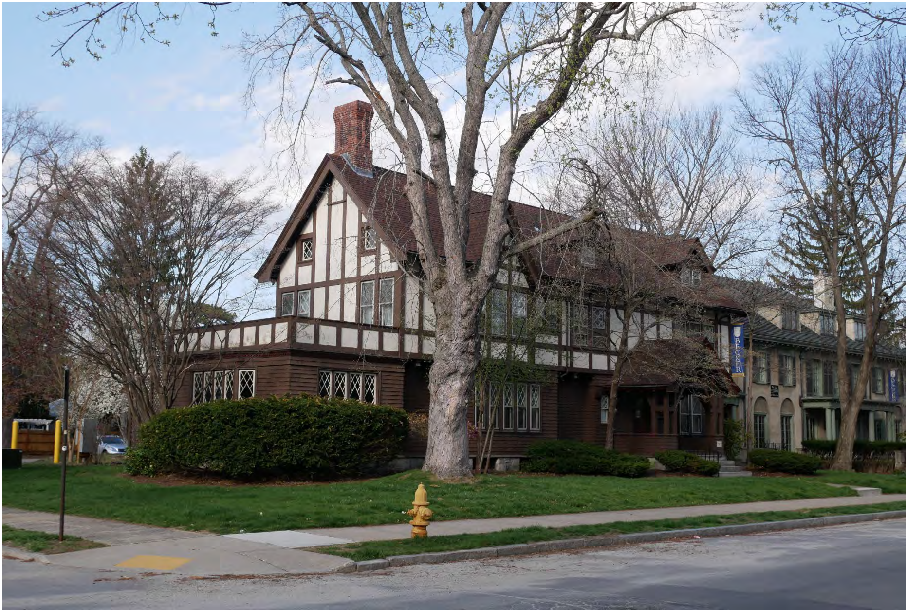
186. 84 William Street, looking northeast. Integrity rating: very good