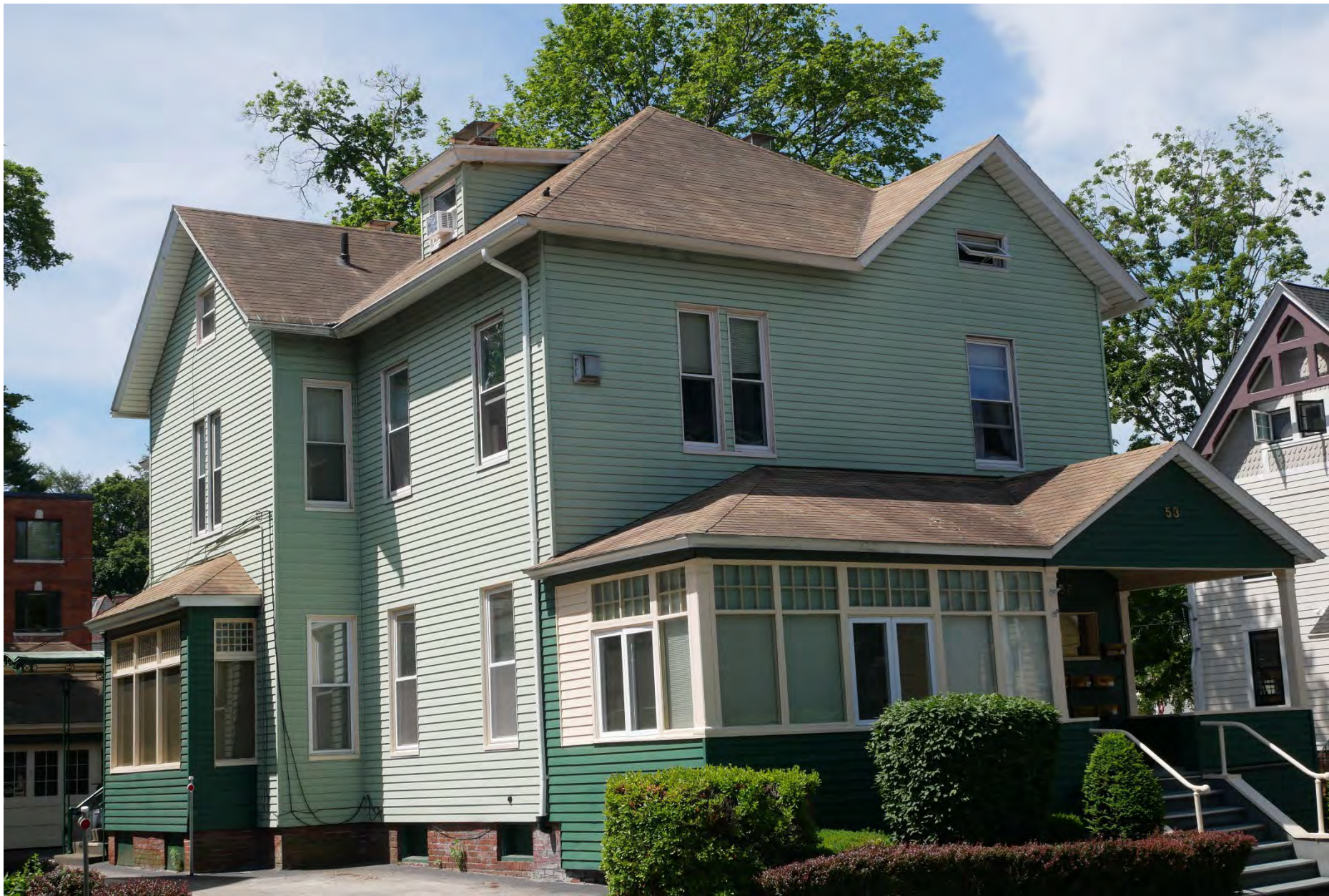
173. 53 William Street, house and garage, looking southwest. Integrity rating: fair