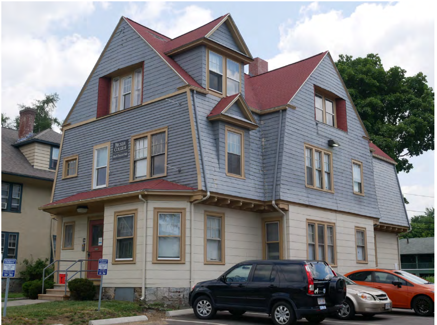
104. 36 Roxbury Street, looking northeast. Integrity rating: good