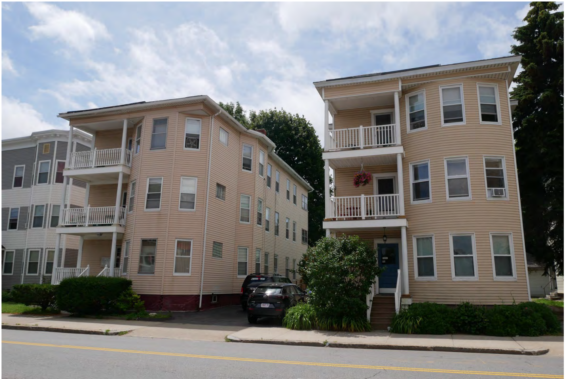
47. 120 Elm Street (R), looking southeast. Integrity rating: fair