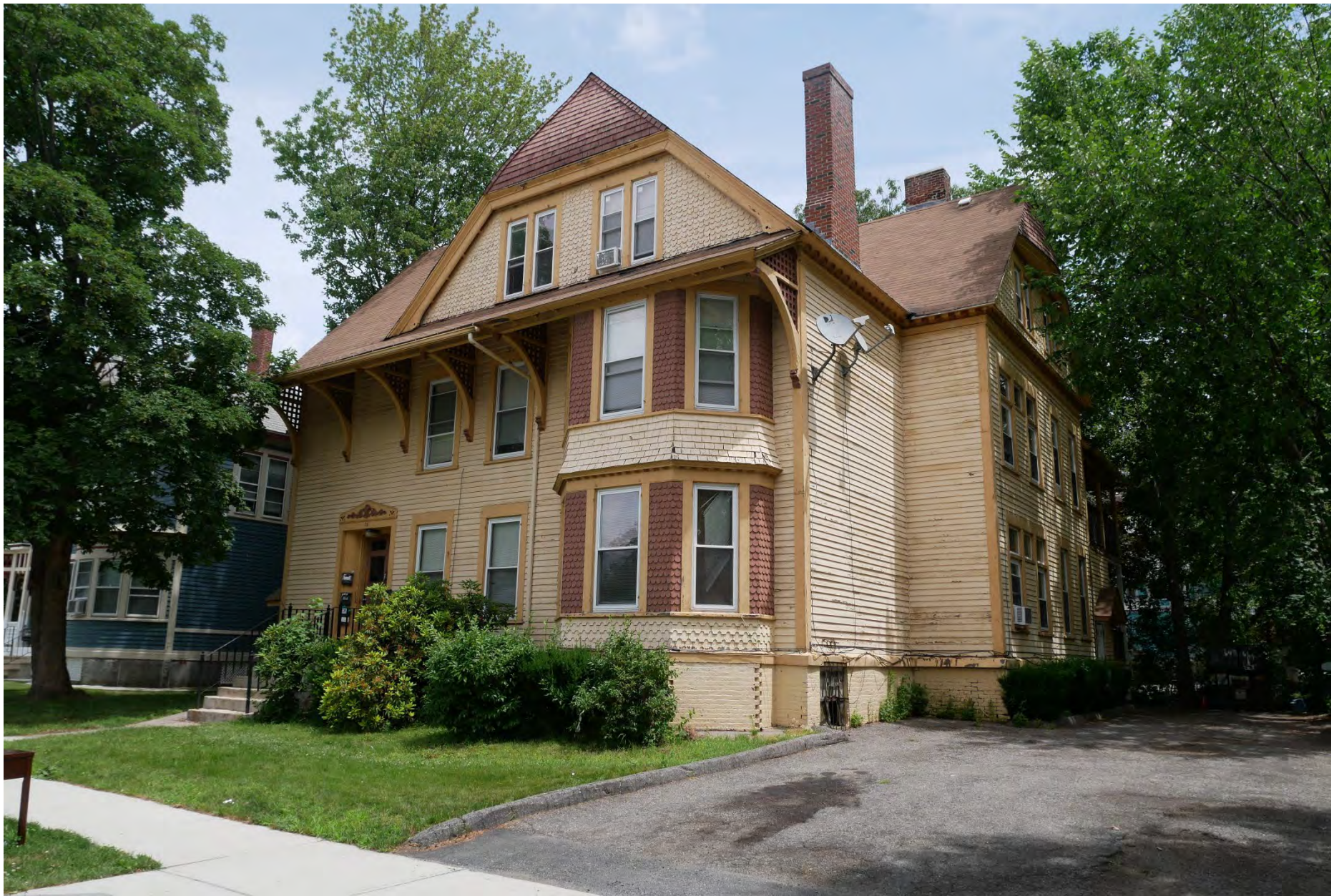
127. 28 Sever Street, looking northeast. Integrity rating: very good