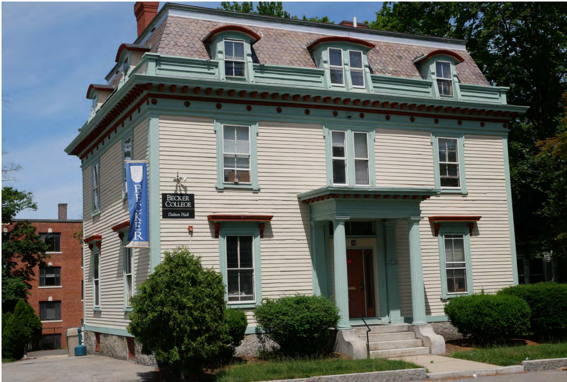
165. 54 West Street, looking northwest. Integrity rating: excellent