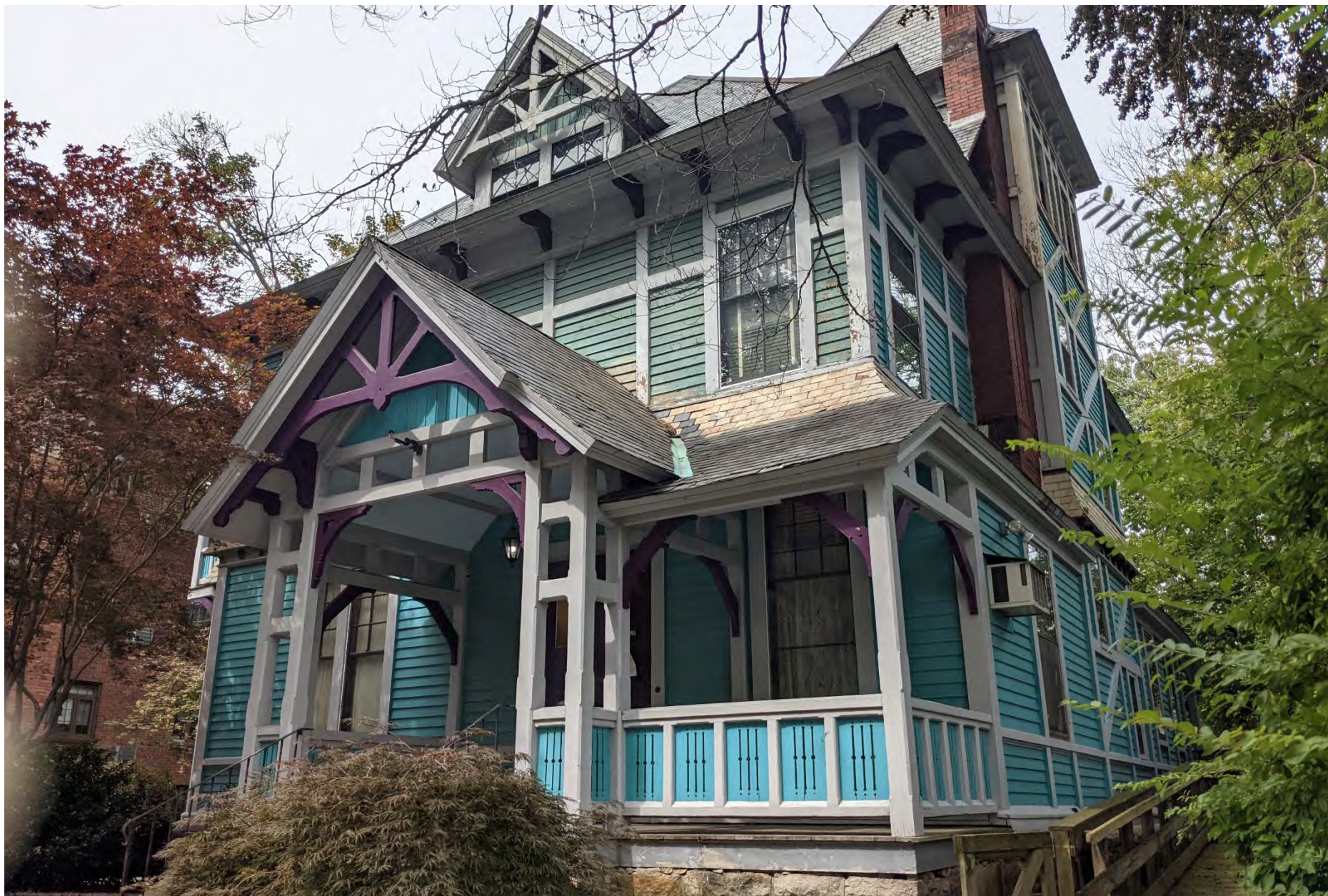
61. 23 Fruit Street, looking southwest. Integrity rating: excellent