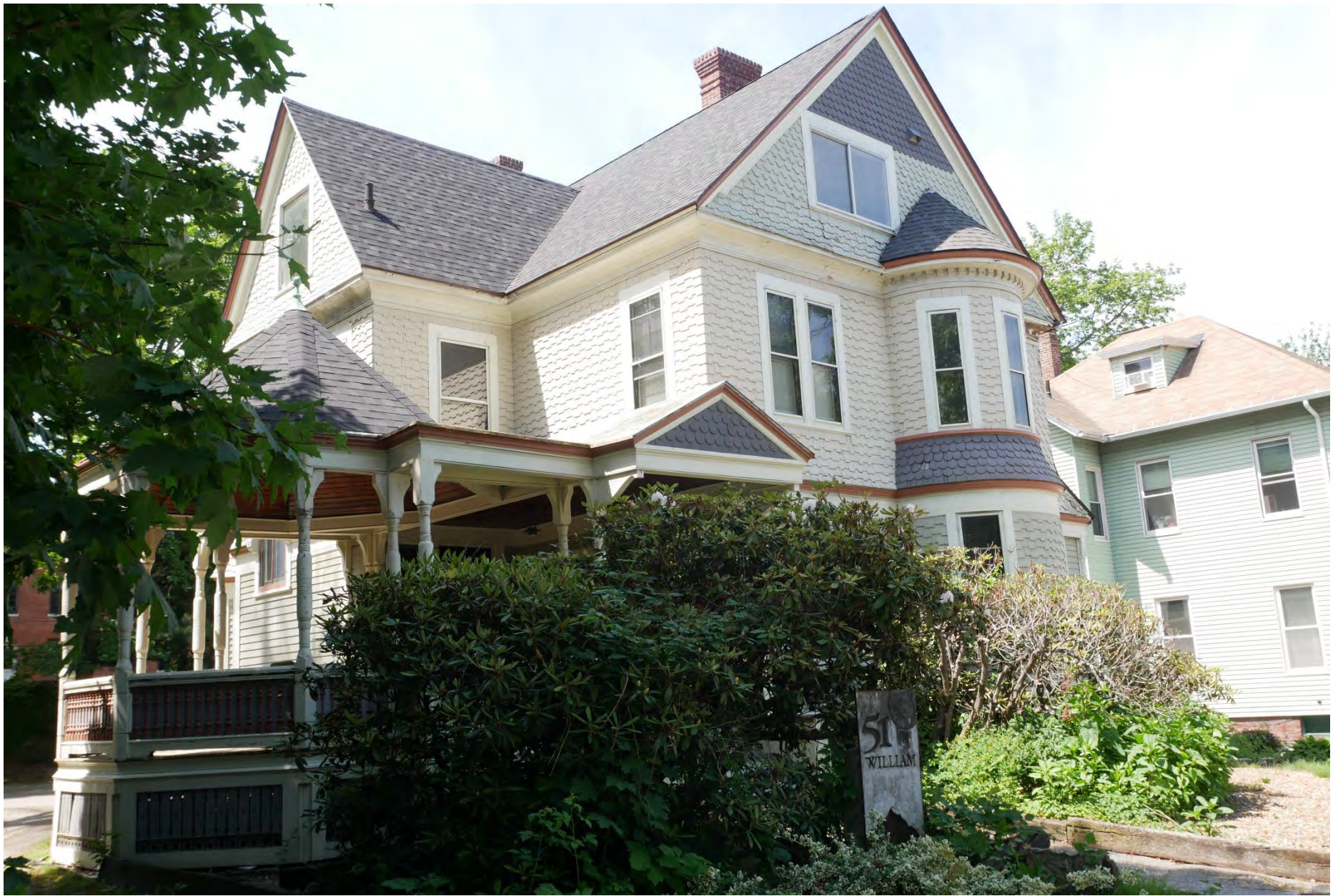
171. 51 William Street, looking southwest. Integrity rating: good