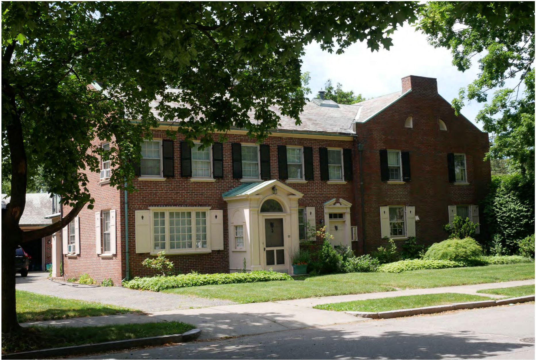
190. 93 William Street, house and garage, looking southwest. Integrity rating: very good