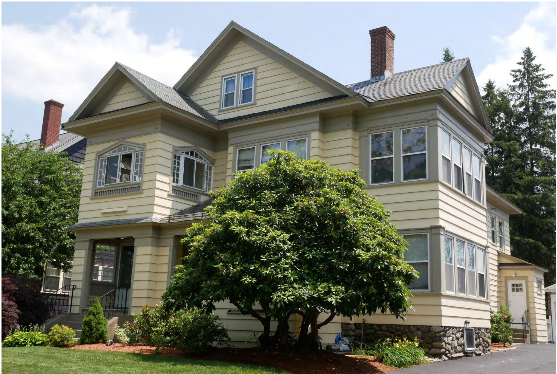
144. 16 Somerset Street, looking northeast. Integrity rating: fair