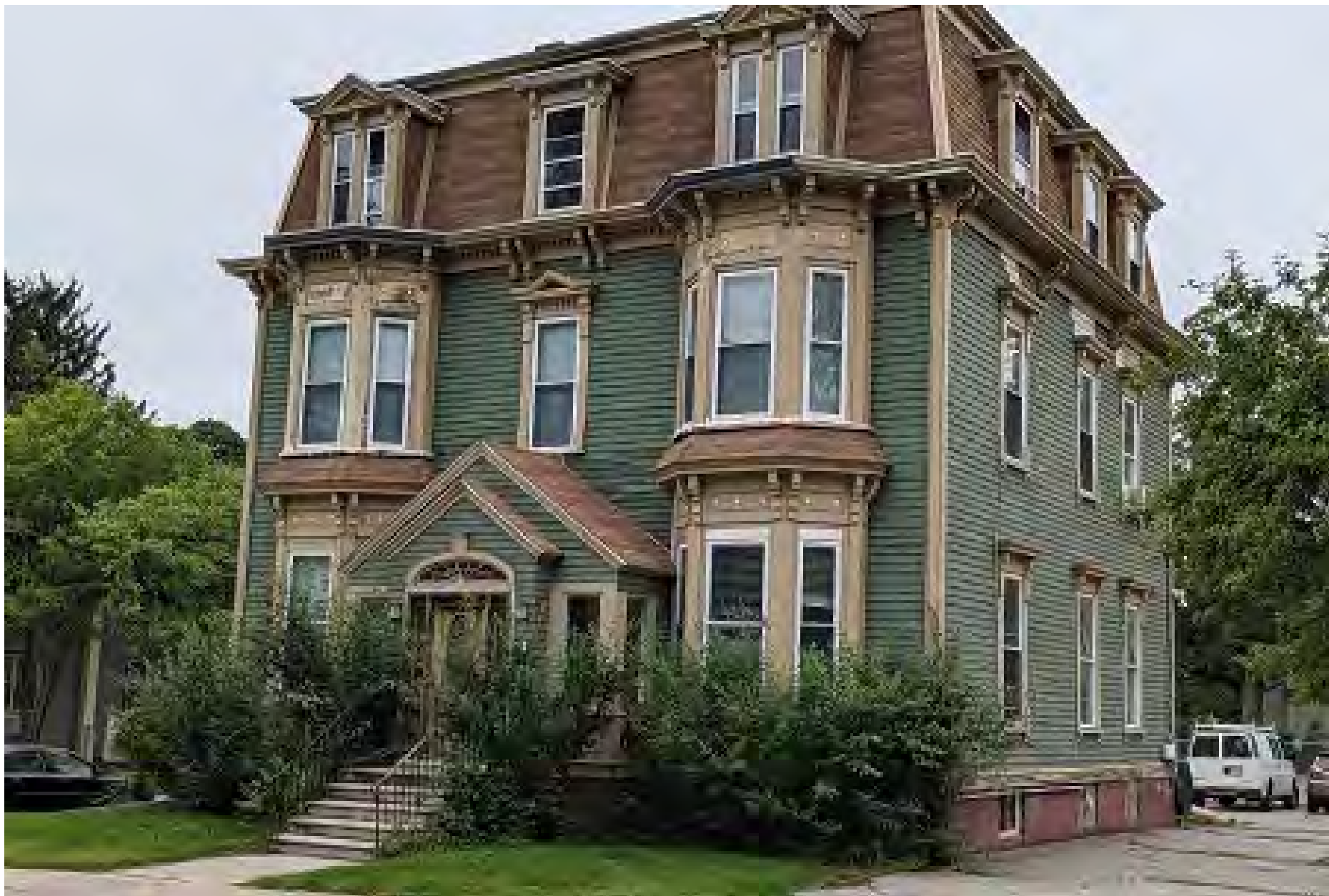
8. 44 Cedar Street, looking northwest. Integrity rating: very good