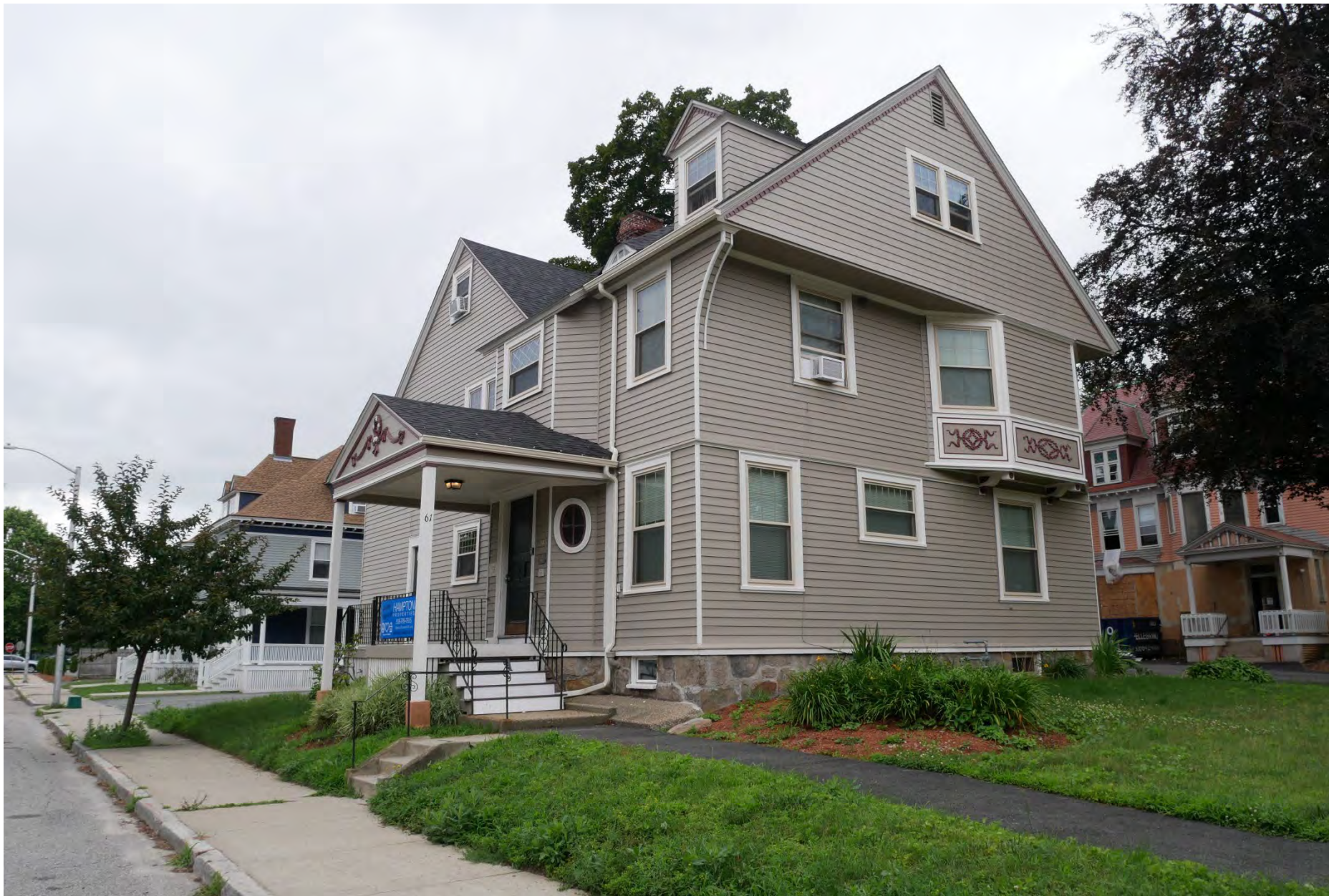
20. 61 Cedar Street, looking southwest. Integrity rating: good