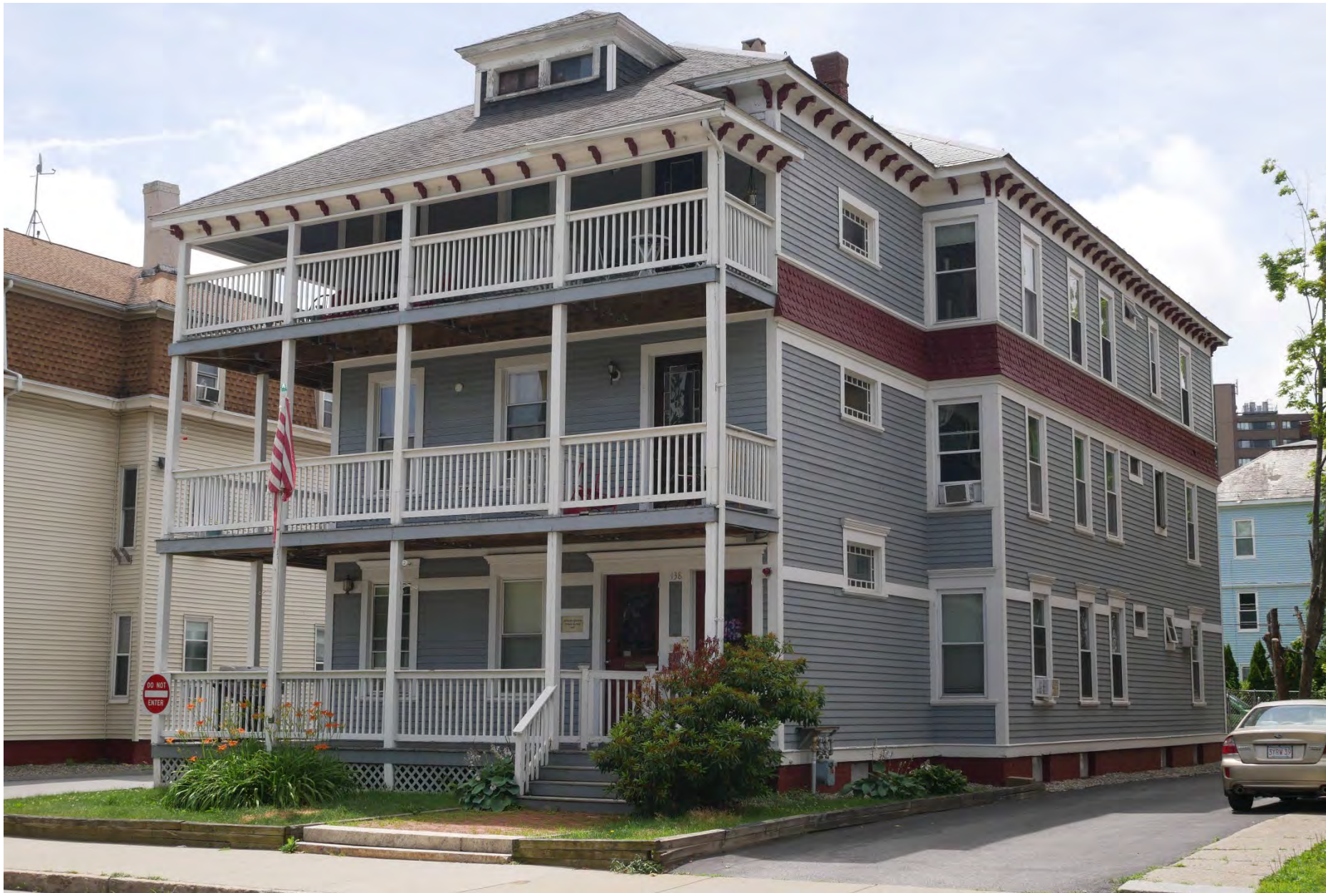
54. 138 Elm Street, looking southeast. Integrity rating: very good