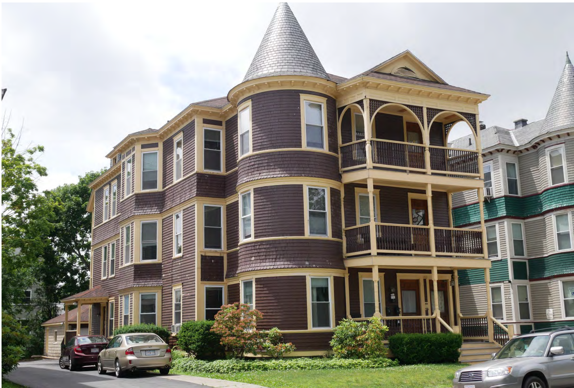
55. 140 Elm Street, looking southwest. Integrity rating: very good