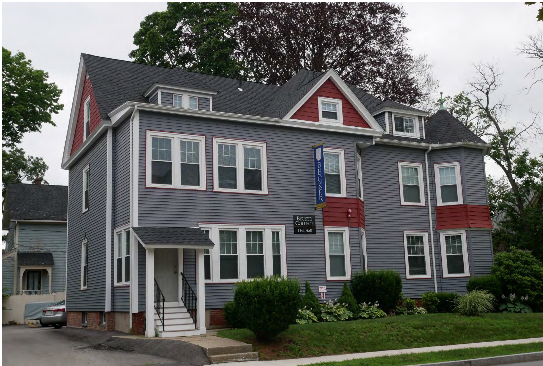
89. 7 Marston Way, looking southeast. Integrity rating: Fair to good