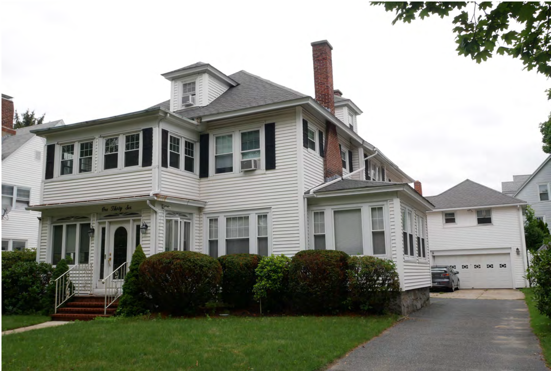
116. 136 Russell Street house and garage, looking northeast. Integrity rating: fair