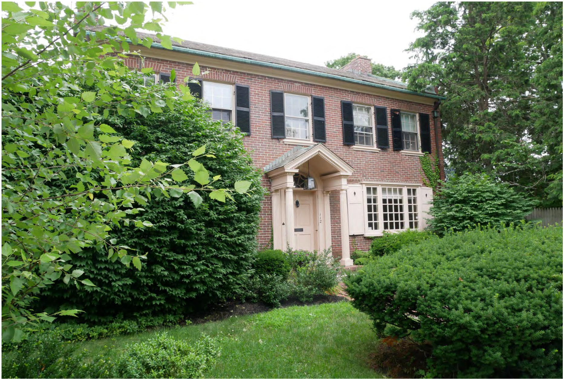
112. 112 Russell Street, looking southeast. Integrity rating: excellent