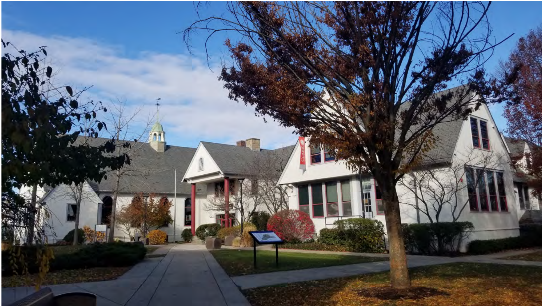
136. 61 Sever Street, looking northwest from quad. Integrity rating: very good