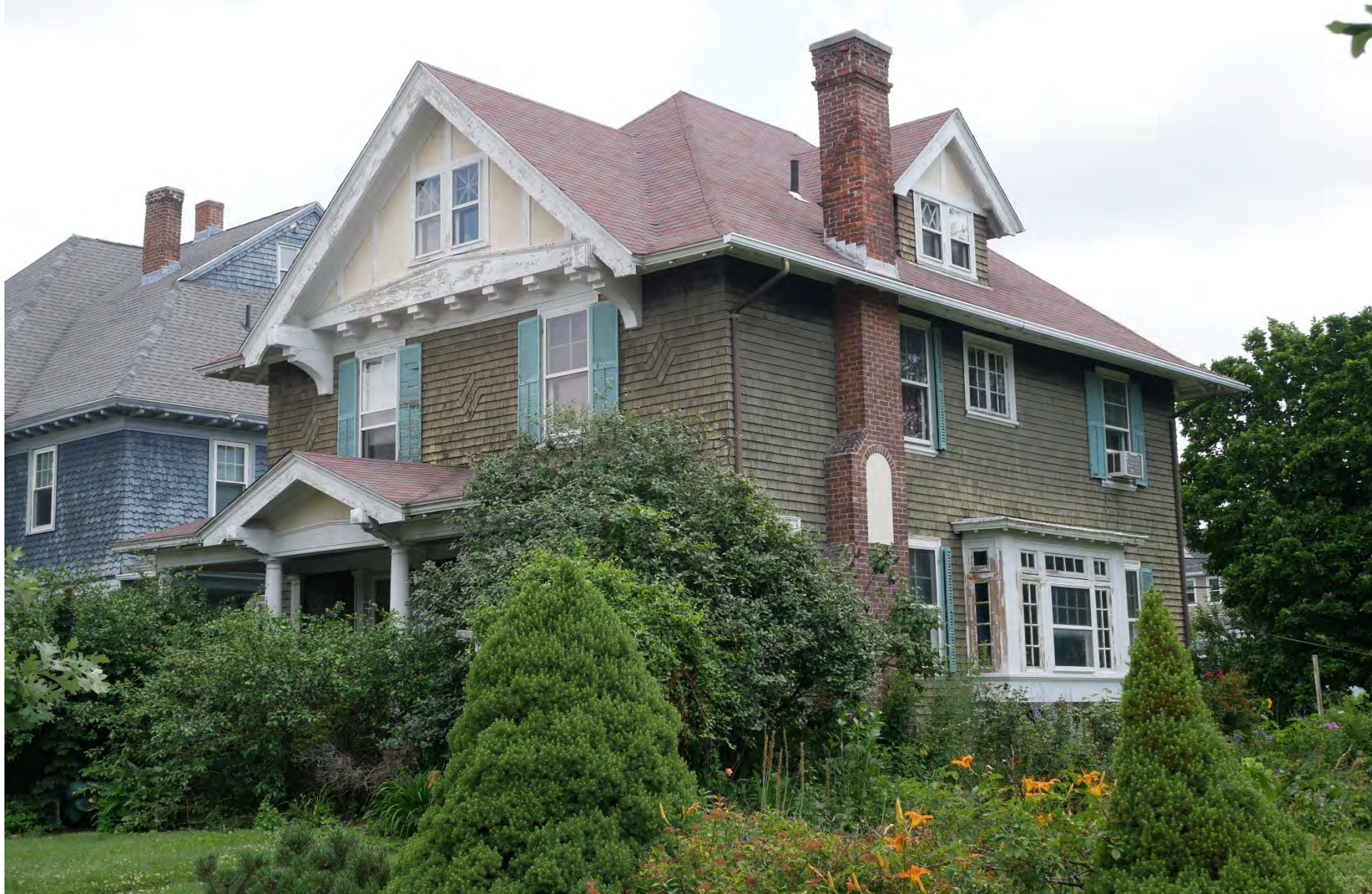
108. 44 Roxbury Street, looking northeast Integrity rating: very good