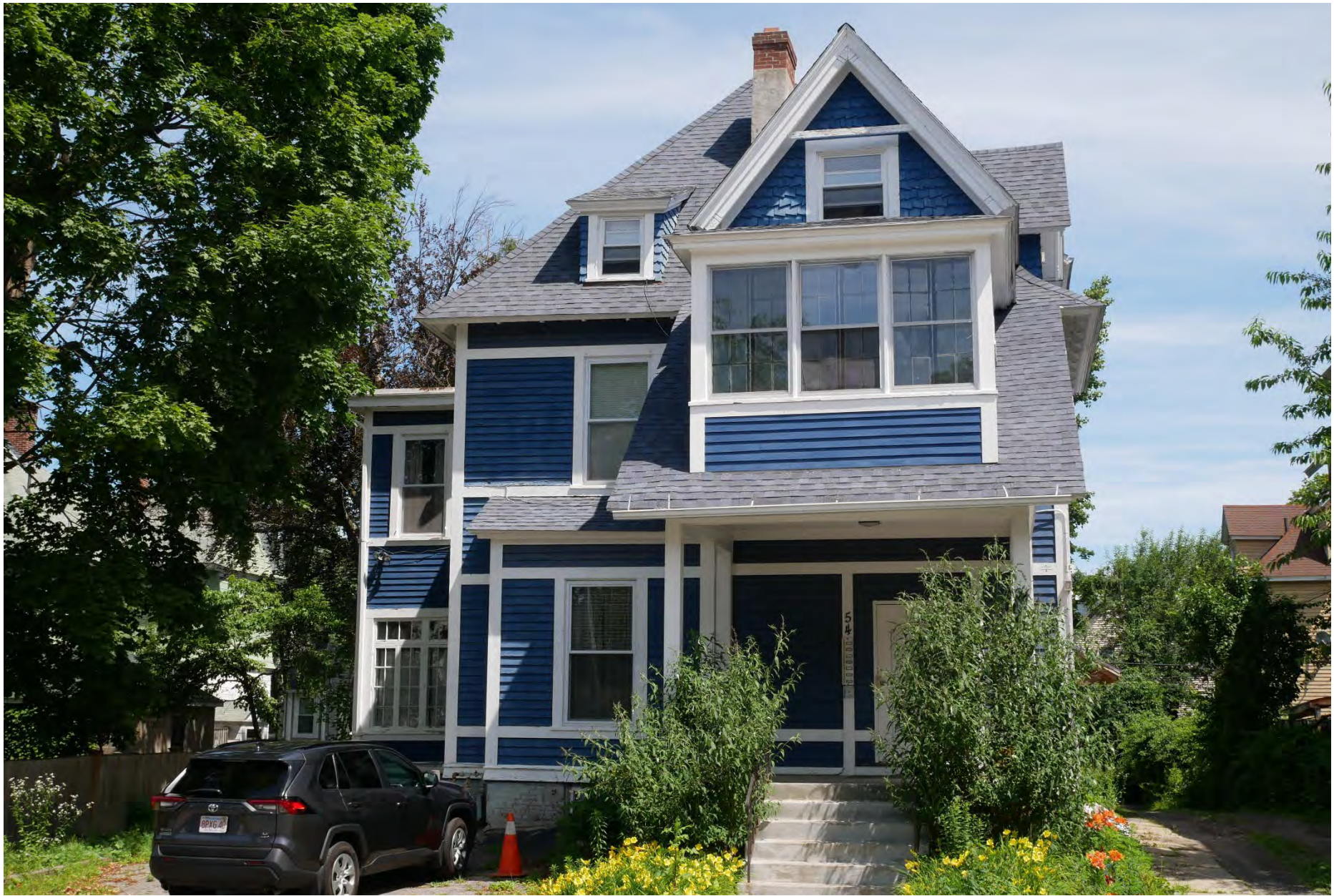
174. 54 William Street, looking north. Integrity rating: good