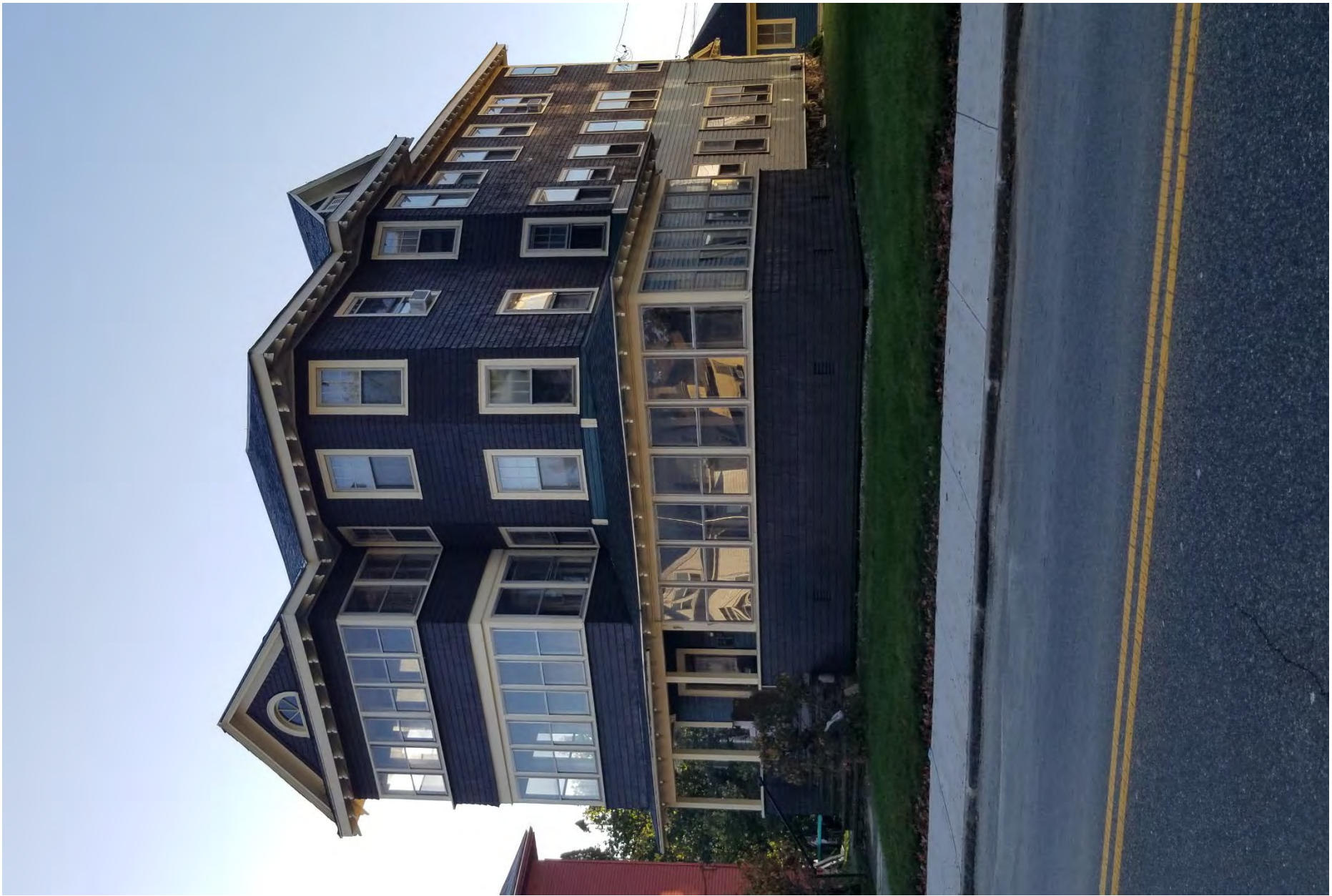
78. 171 Highland Street, looking southeast. Integrity rating: very good