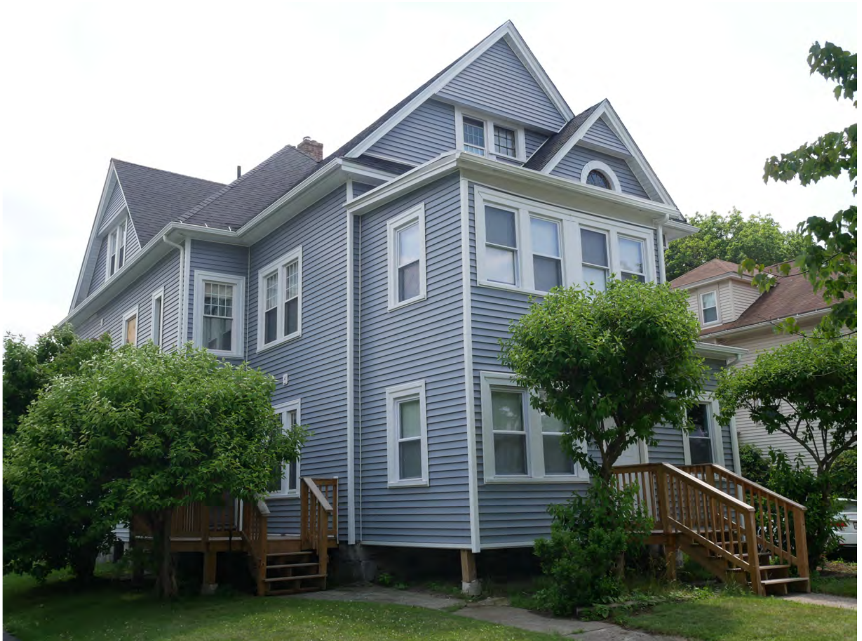
158. 36 Somerset Street, looking southeast. Integrity rating: poor