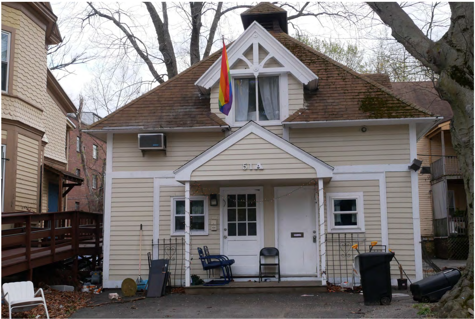
13. 51A Cedar Street, looking south. Integrity rating: fair