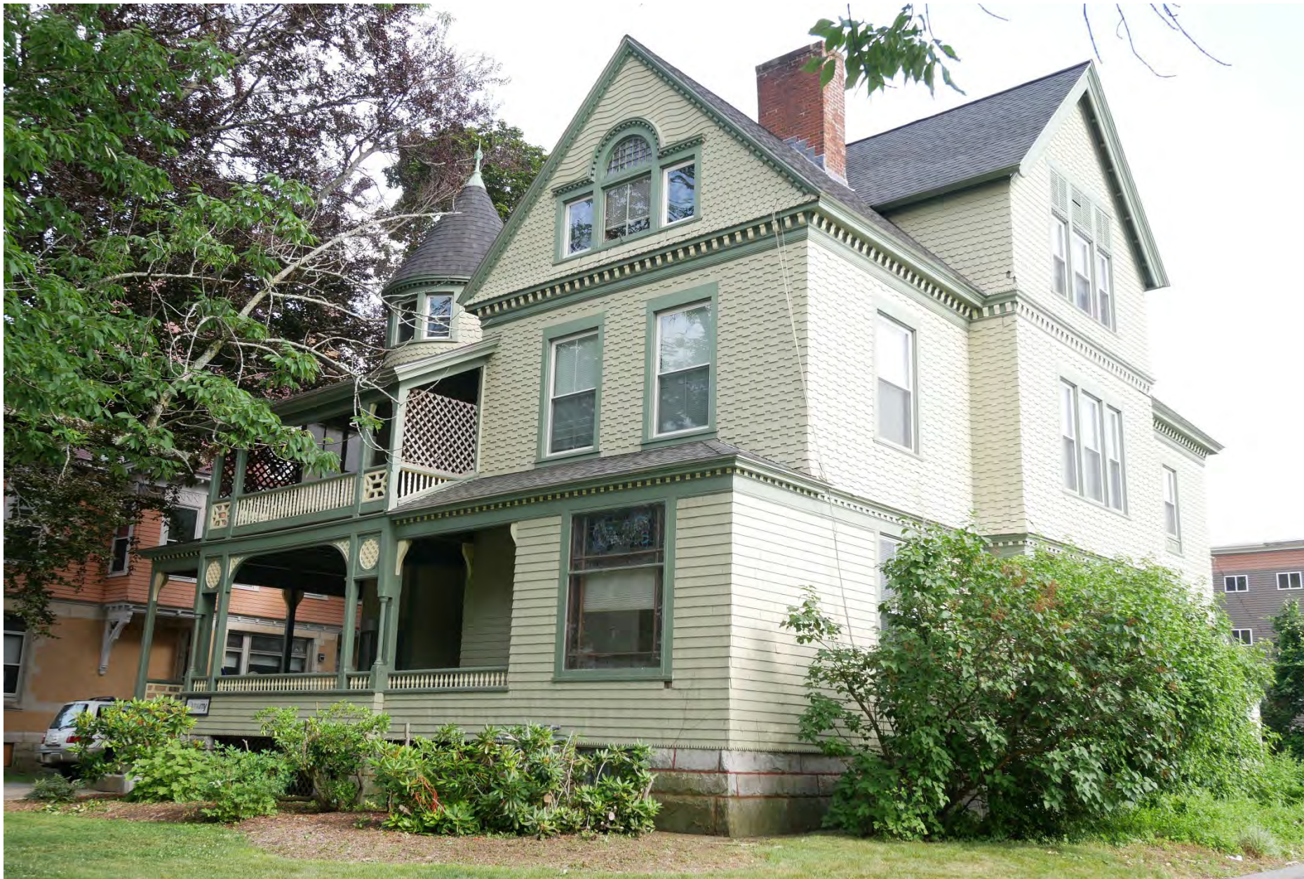
24. 67 Cedar Street, looking southwest. Integrity rating: very good