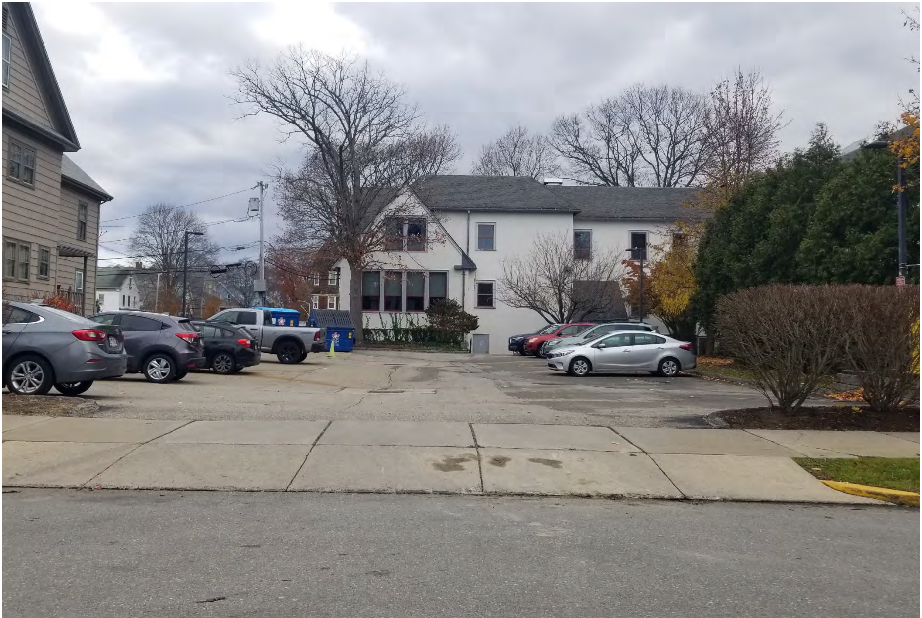
99. 28 Roxbury Street, looking east. Integrity rating: N/A