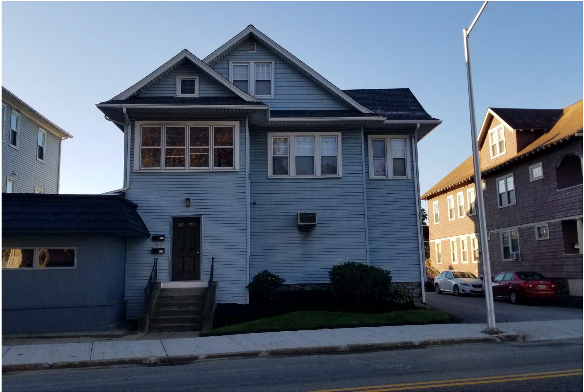
83. 185 Highland Street, looking south. Integrity rating: poor