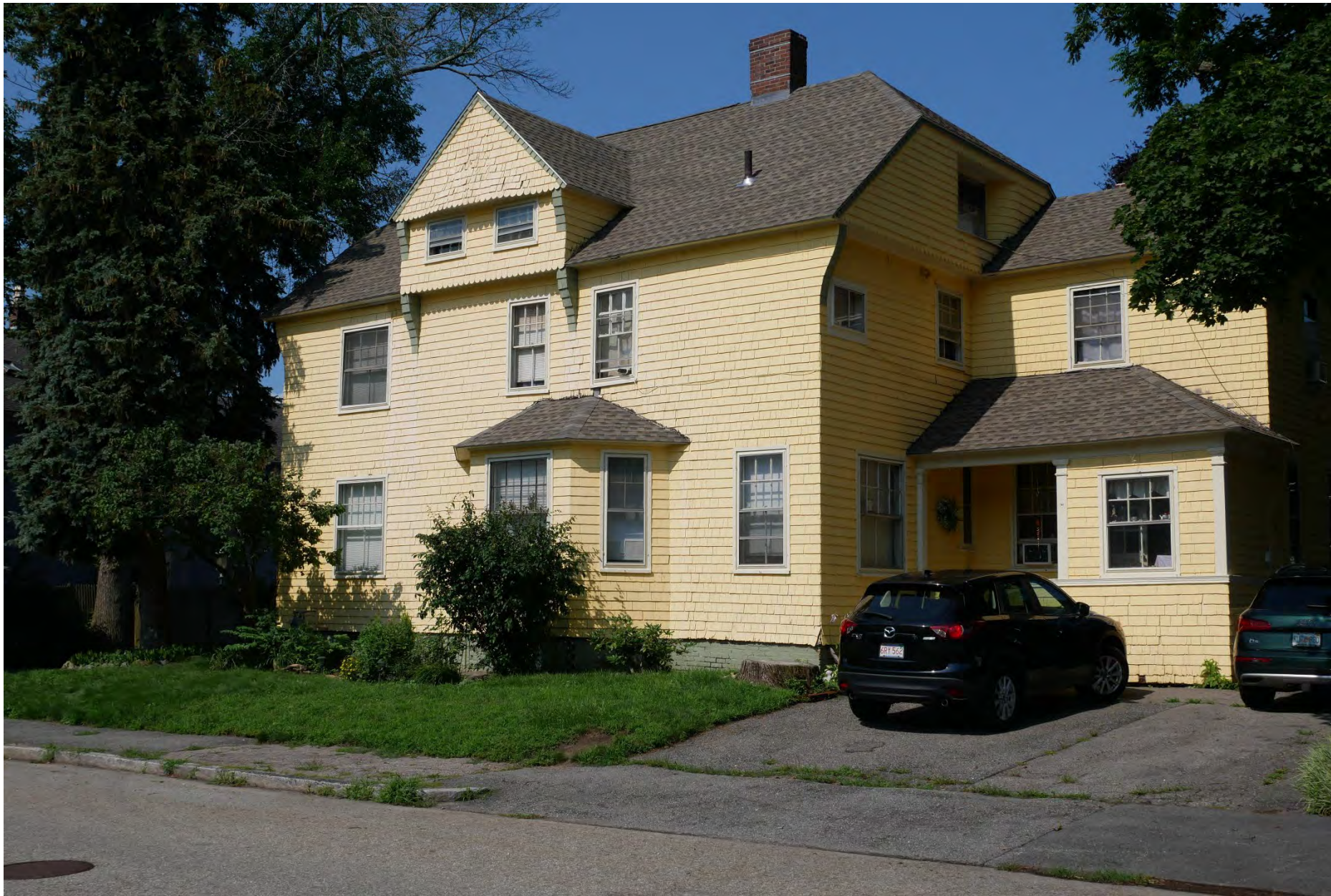
85. 1 Marston Way, looking southwest. Integrity rating: very good