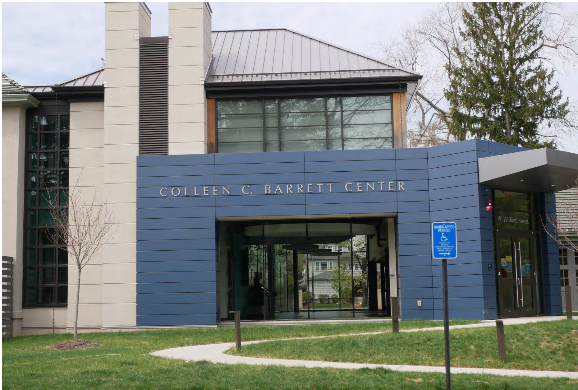
184. 80 William Street, looking west from Roxbury Street. (Well differentiated and reversible addition)