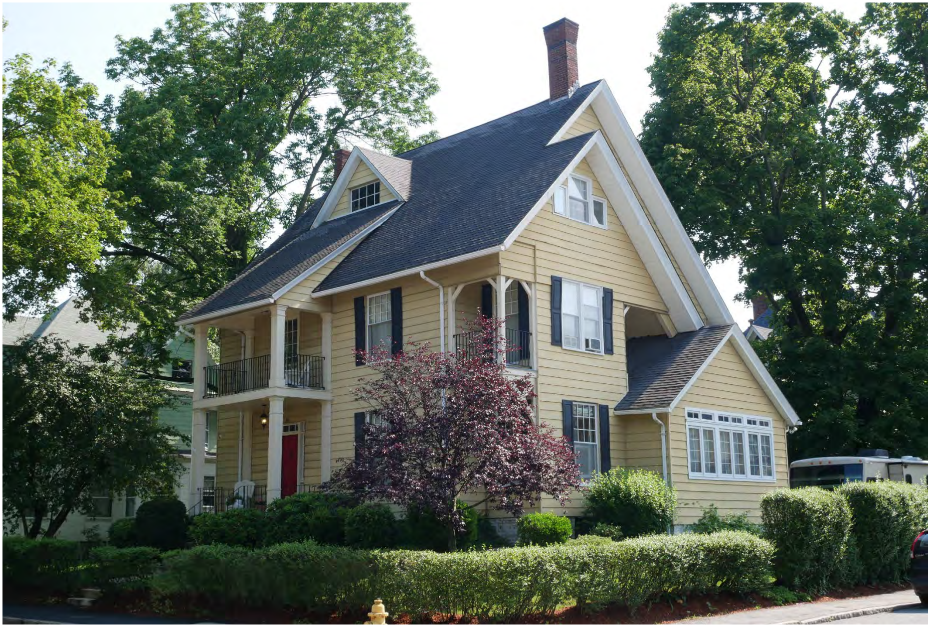
69. 40 Fruit Street, looking northeast. Integrity rating: good