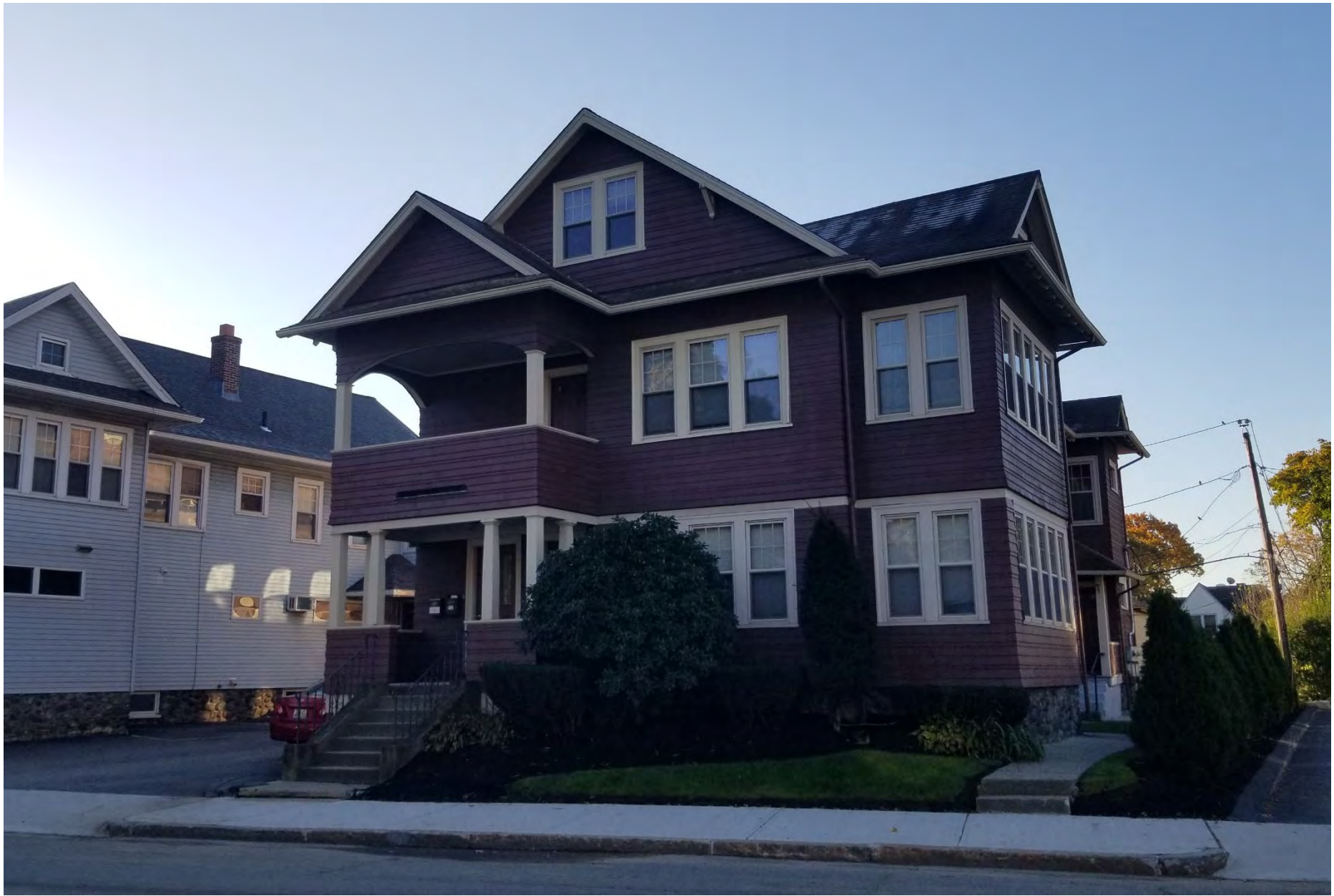
84. 187 Highland Street, looking southeast. Integrity rating: very good