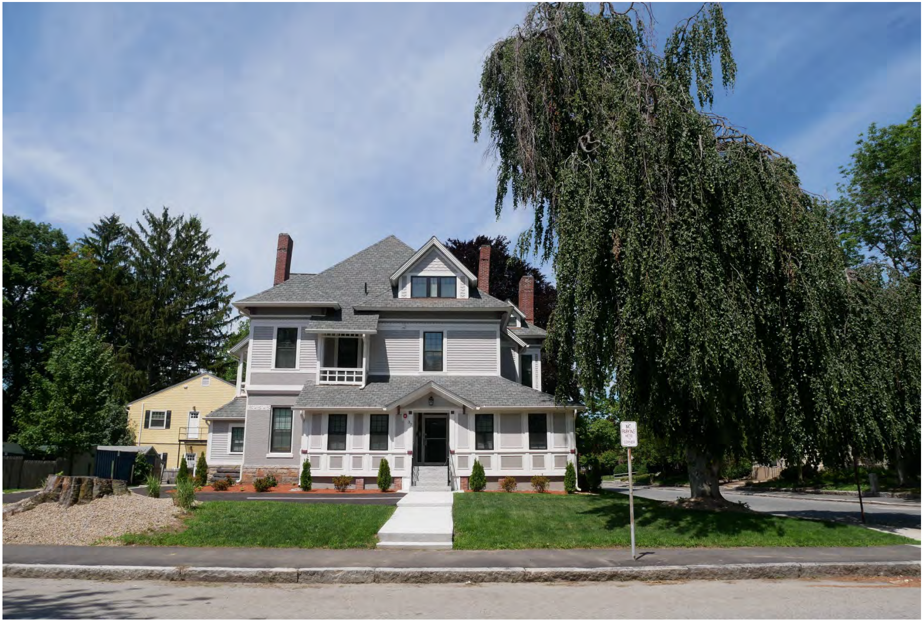
66. 37 Fruit Street, looking northwest. Integrity rating: very good