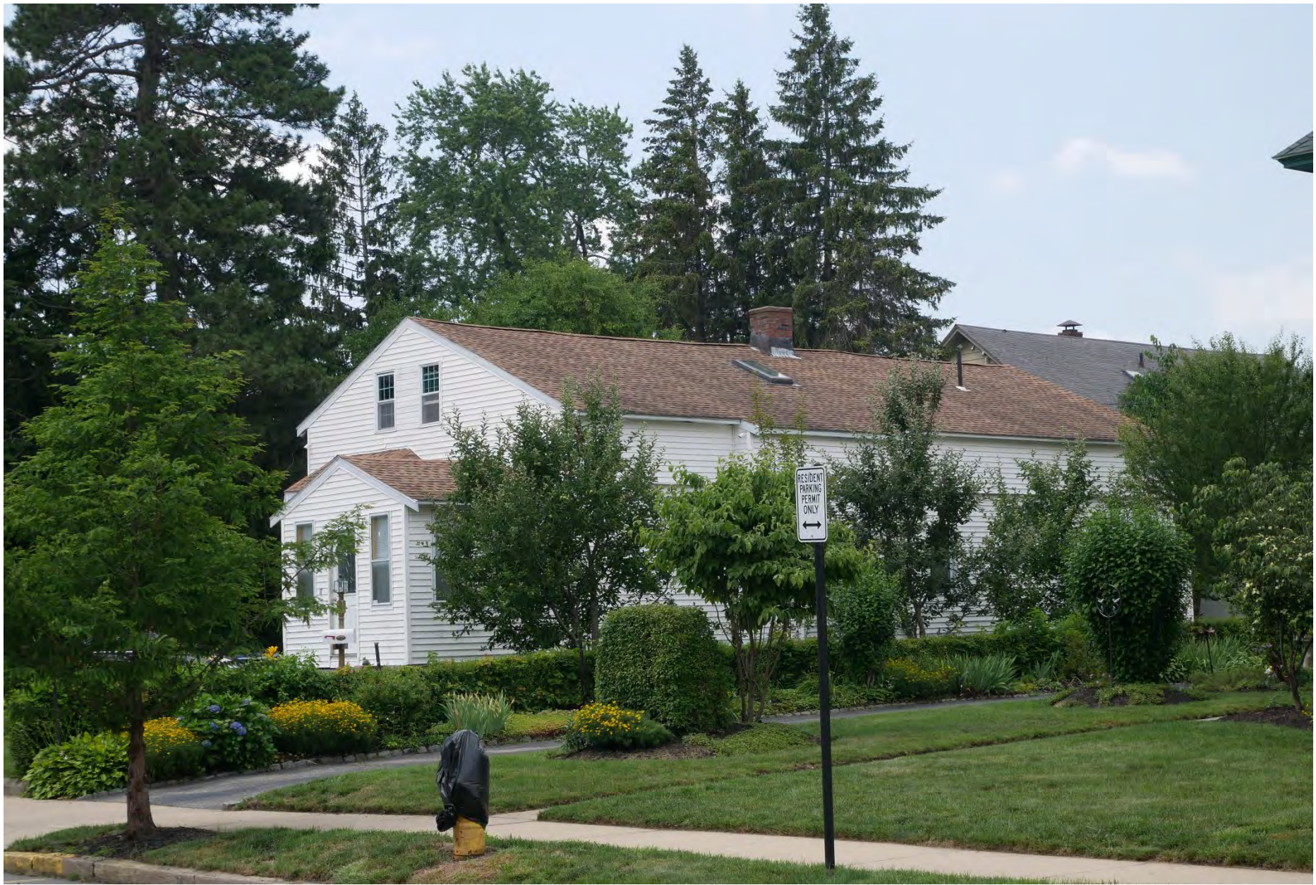
96. 17 Roxbury Street, looking southwest. Integrity rating: poor