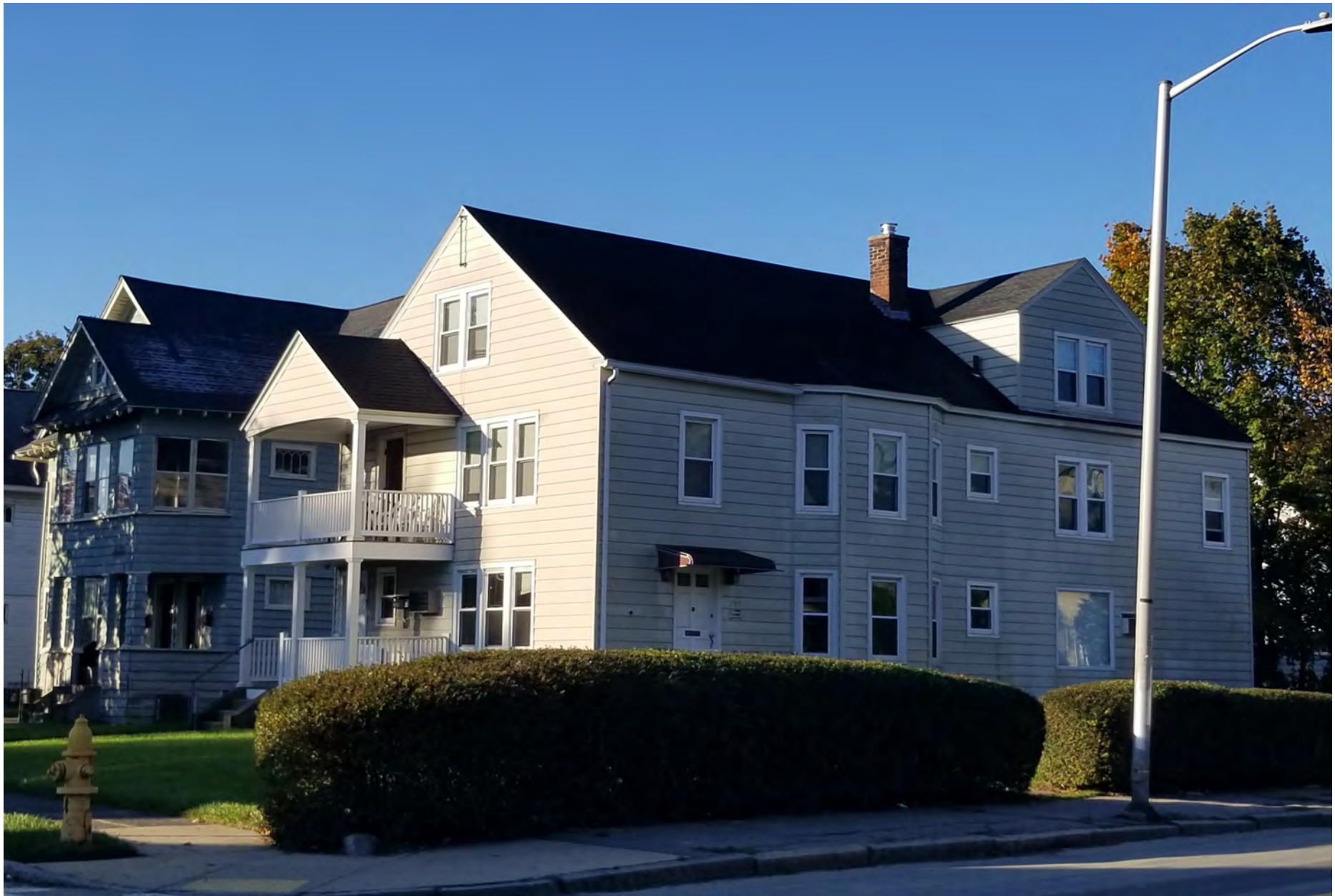
110. 49 Roxbury Street, looking southwest. Integrity rating: poor