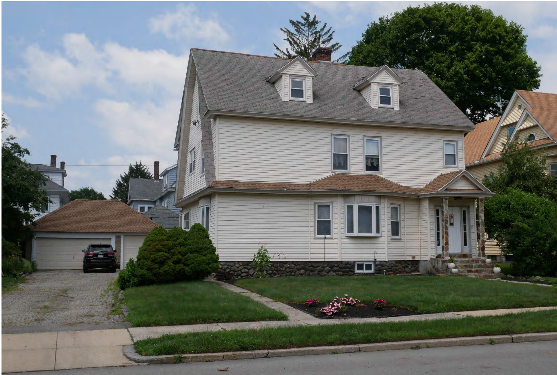
98. 25 Roxbury Street, house and garage, looking northwest. Integrity rating: fair