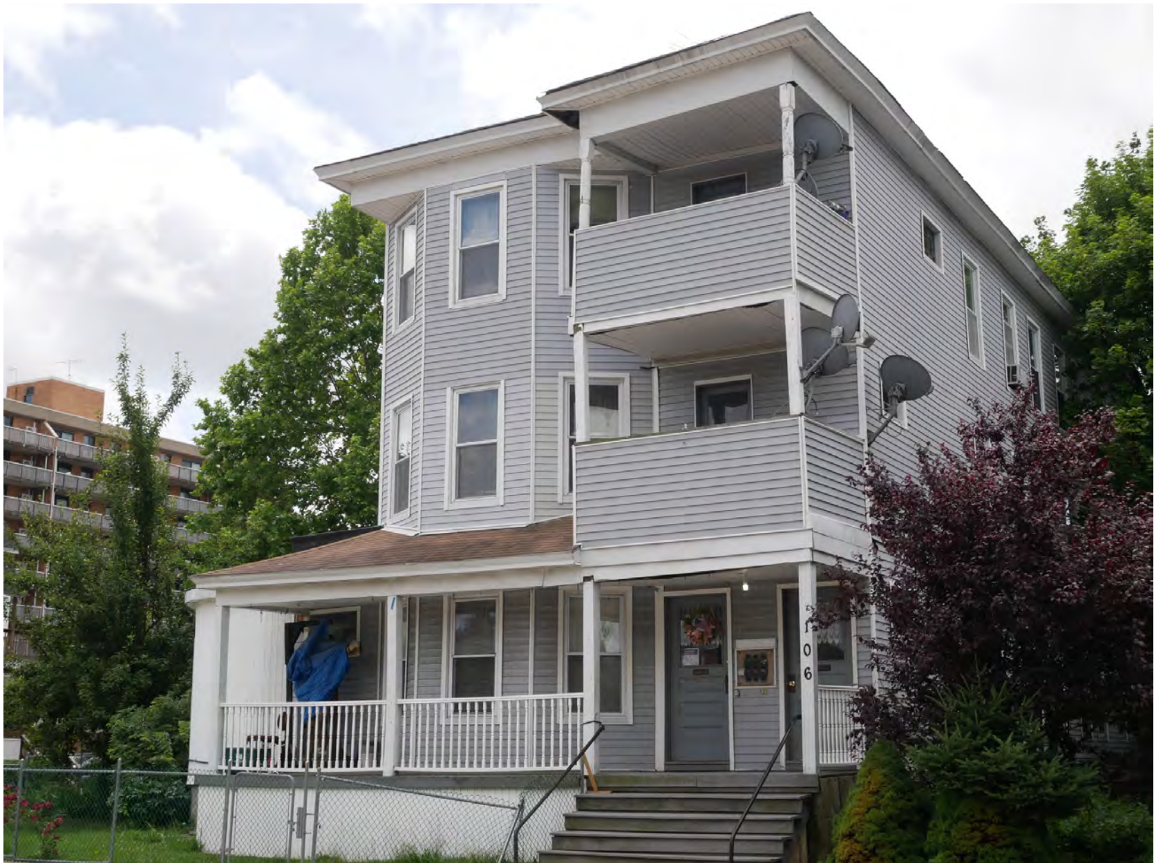
41. 106 Elm Street, looking southeast. Integrity rating: fair