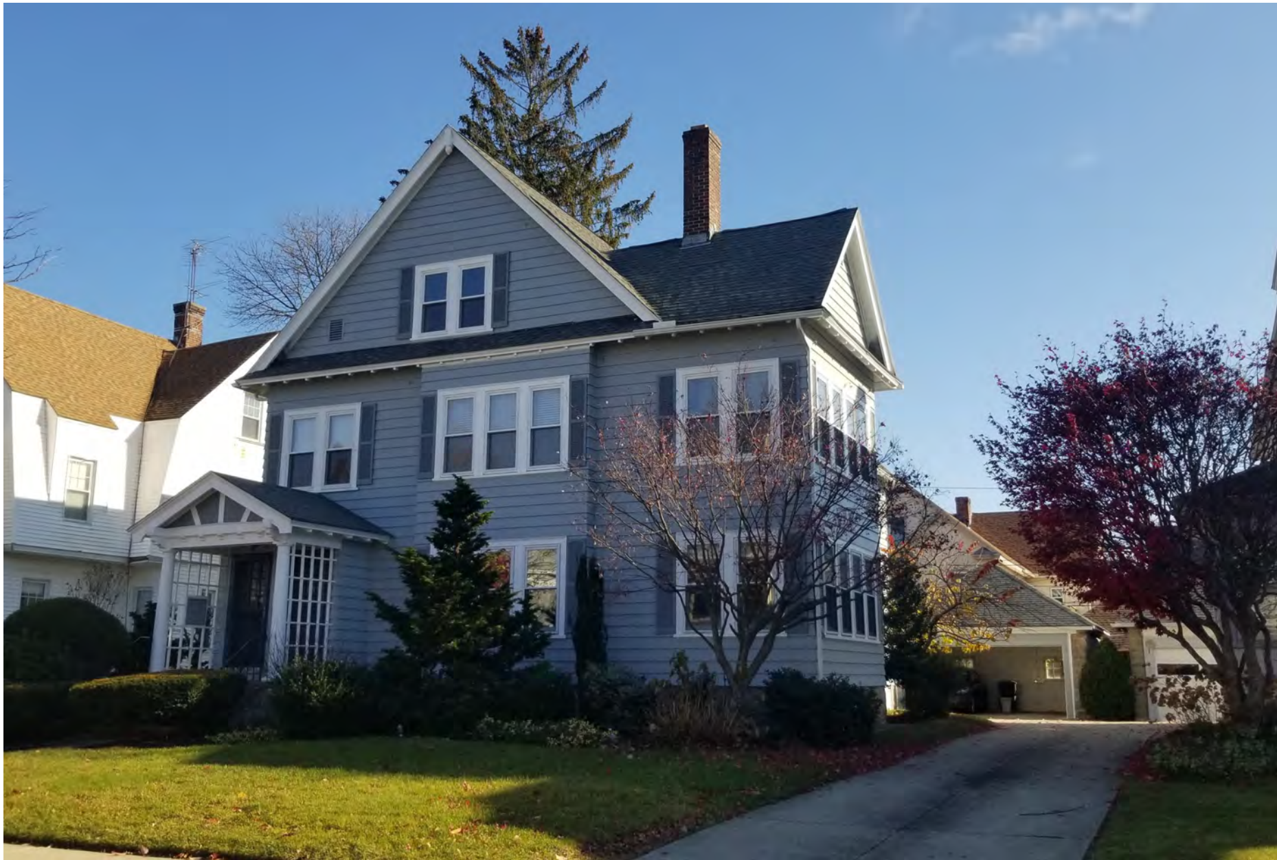
151. 26-28 Somerset Street, house and garage, looking northeast. Integrity rating: good