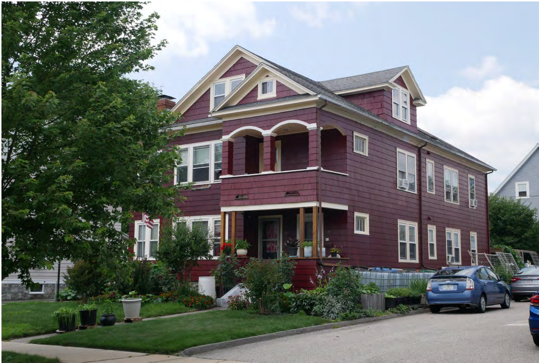
103. 35-37 Roxbury Street, looking southwest. Integrity rating: good