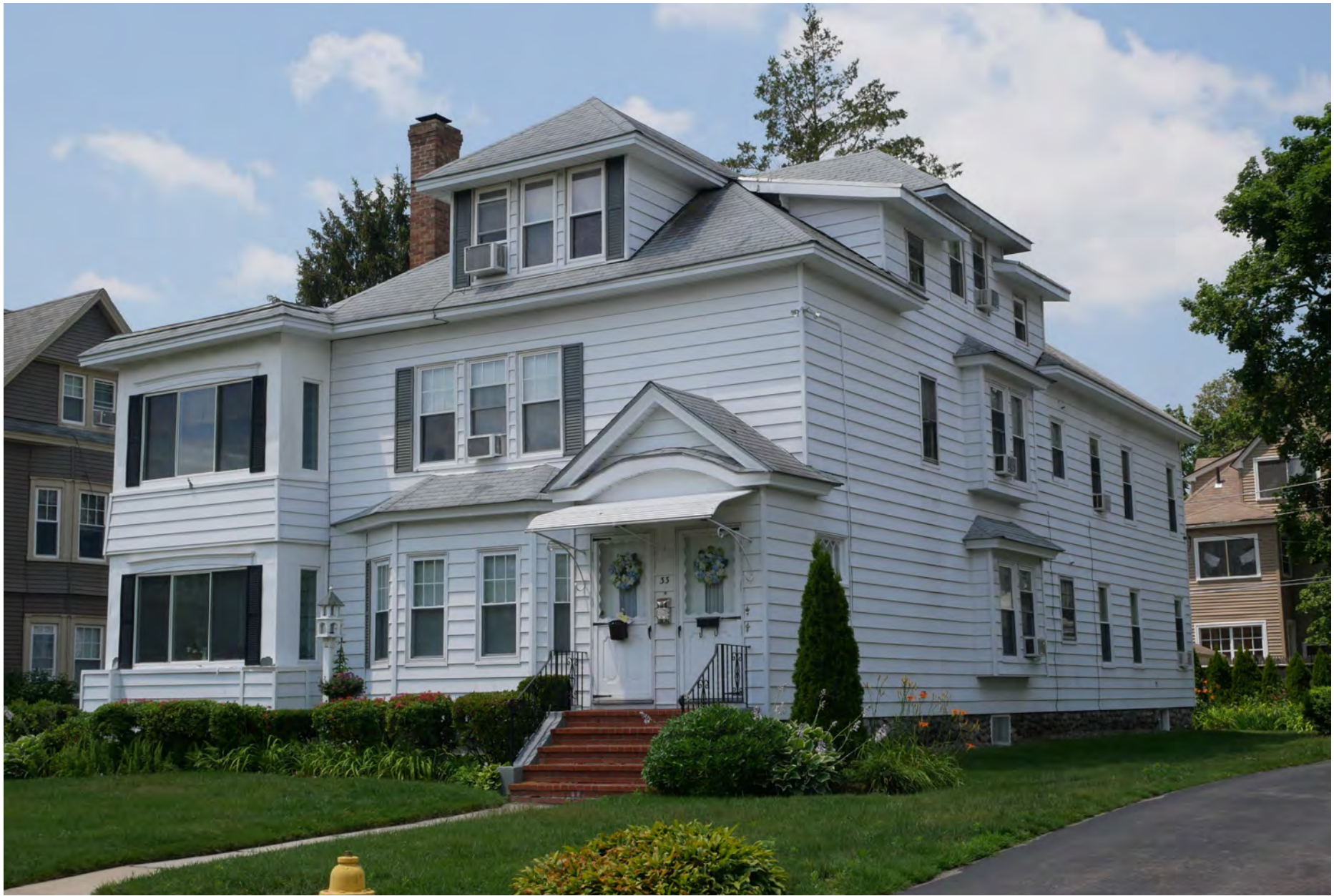
155. 33 Somerset Street, looking southwest. Integrity rating: poor to fair