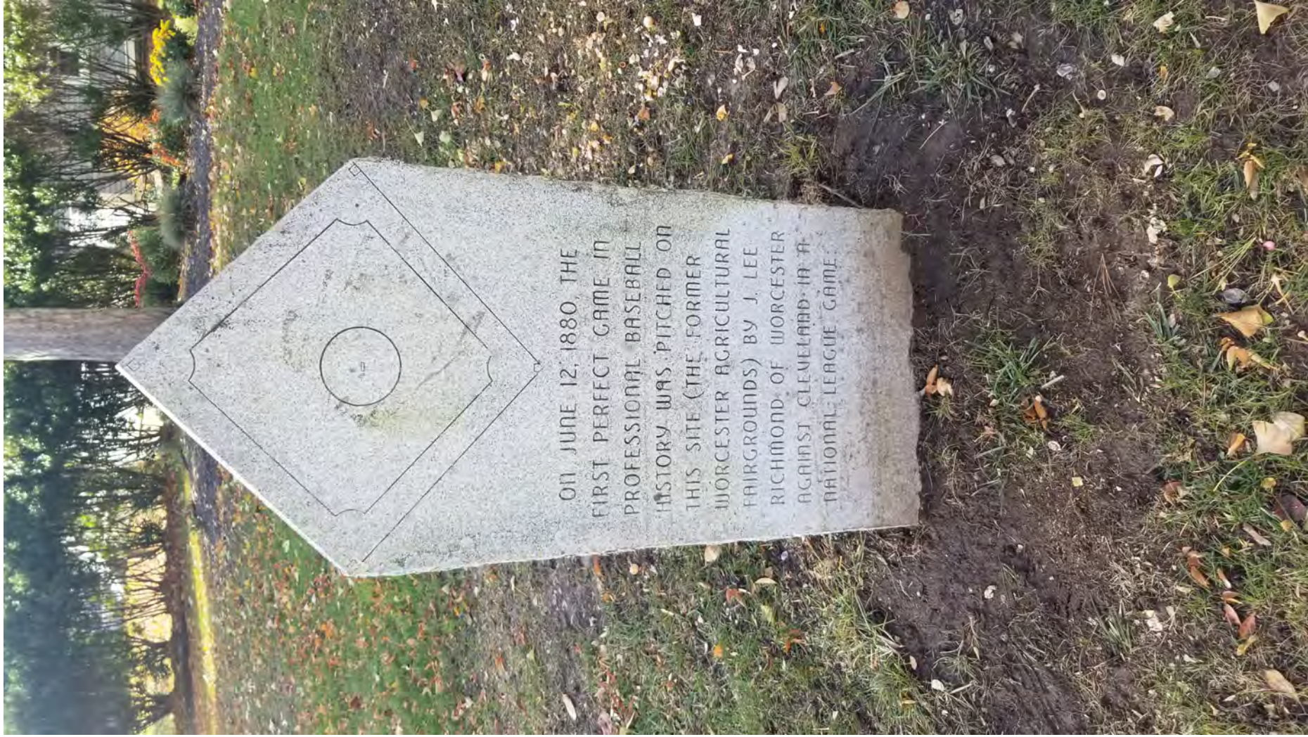
138. Commemorative marker, quad between 51 and 61 Sever Street, looking southwest.