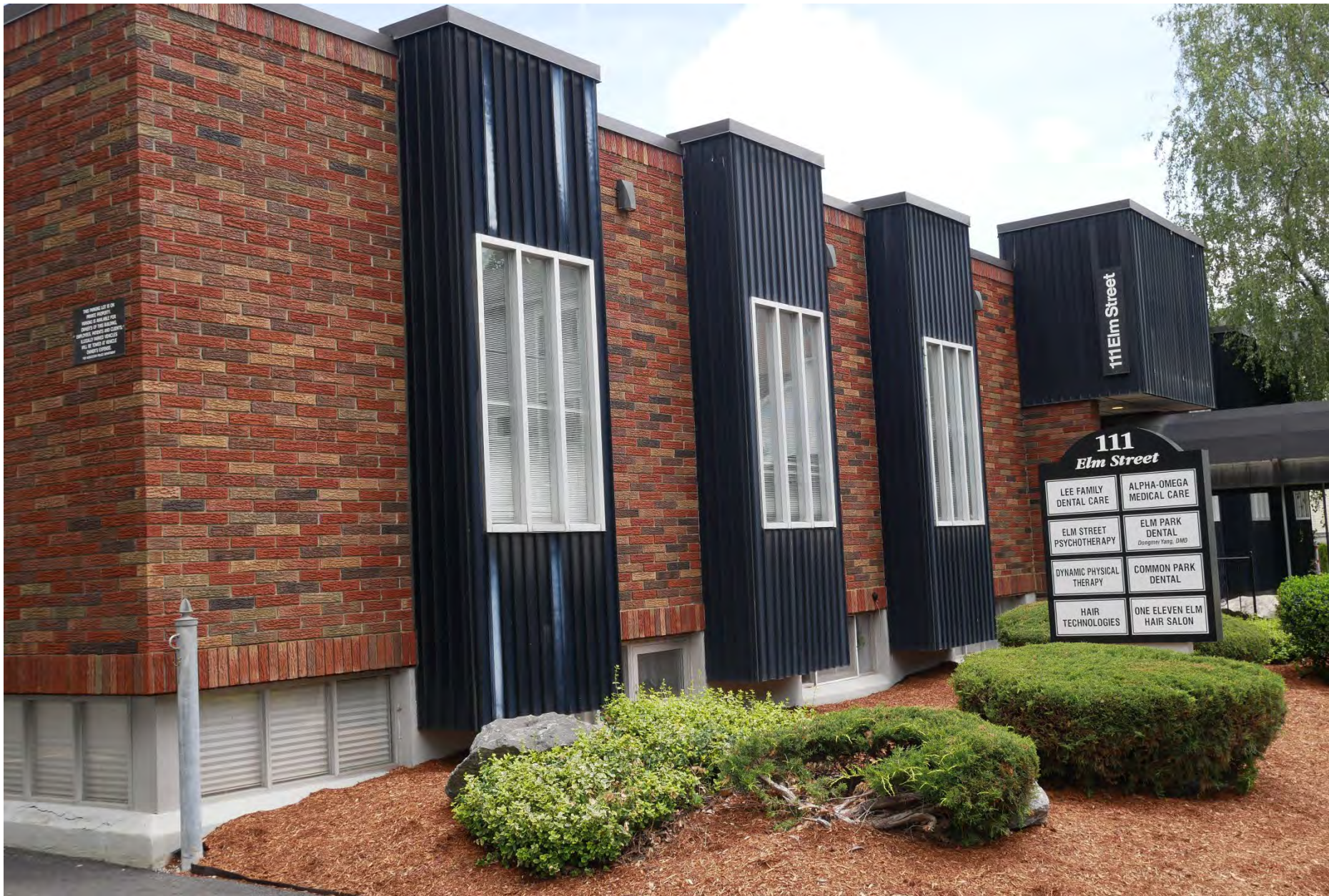
43. 111 Elm Street, looking northeast. Integrity rating: excellent