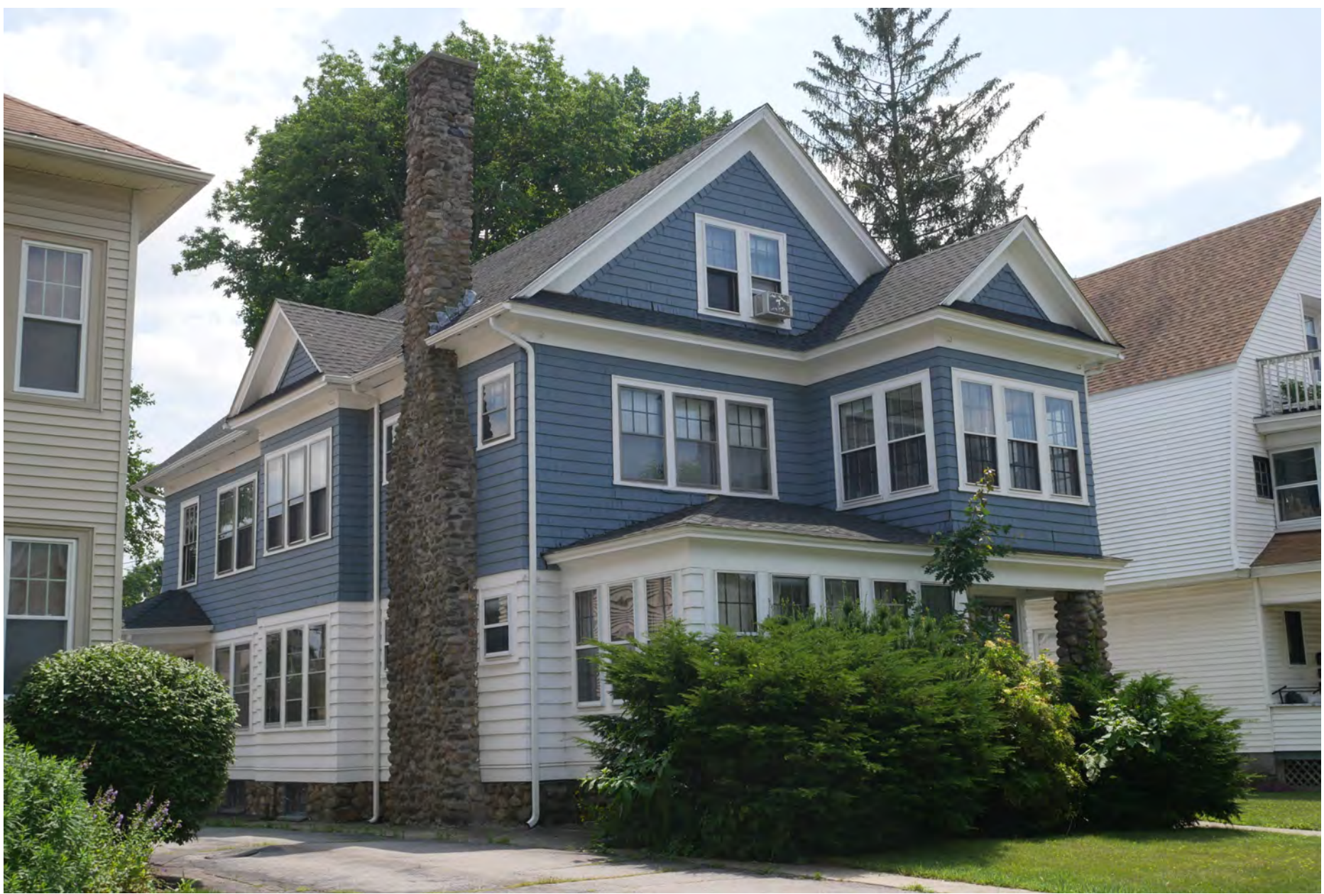
154. 32 Somerset Street, looking southeast. Integrity rating: very good