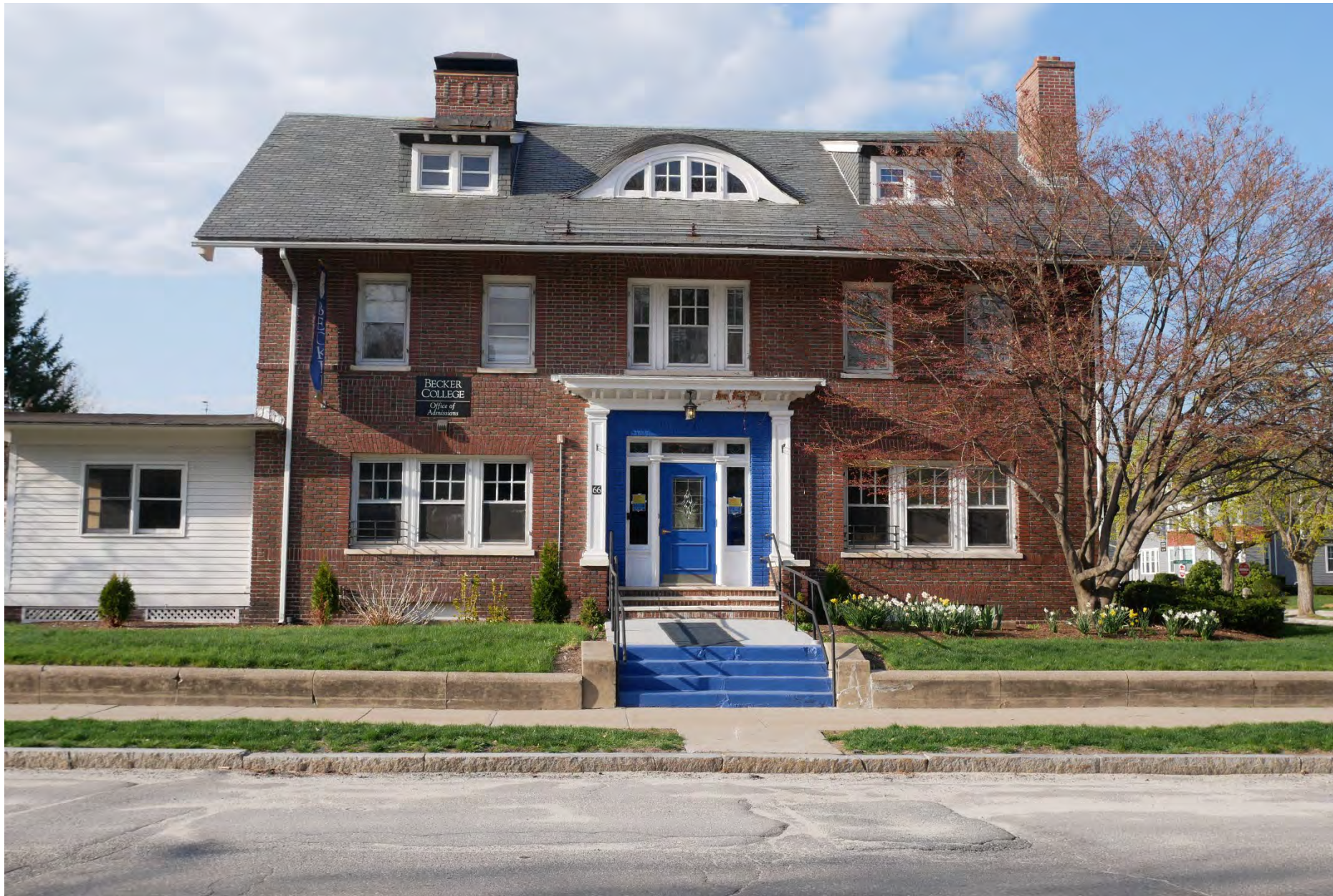
179. 66 William Street, looking north. Integrity rating: very good