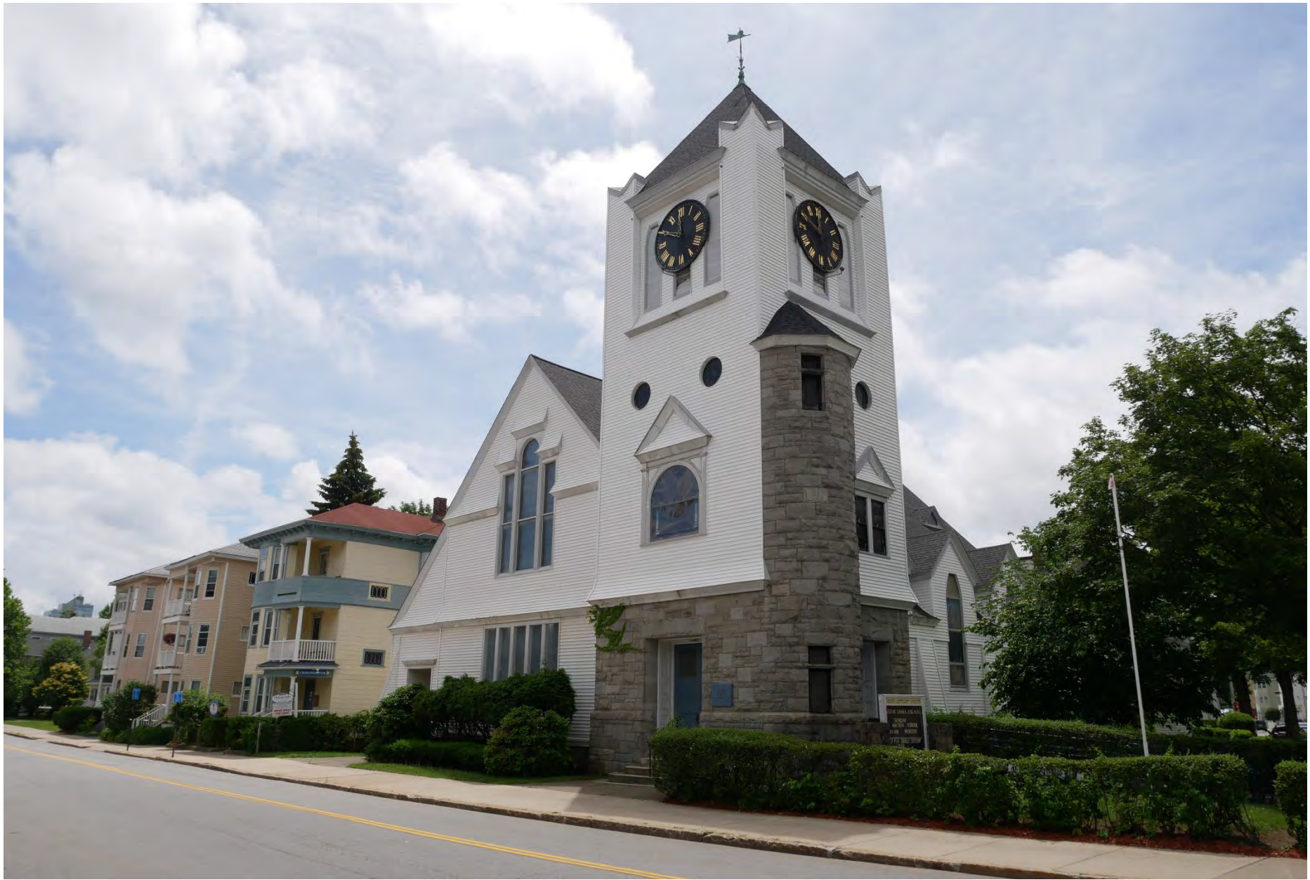
111. 80 Russell Street, looking southeast. Integrity rating: fair