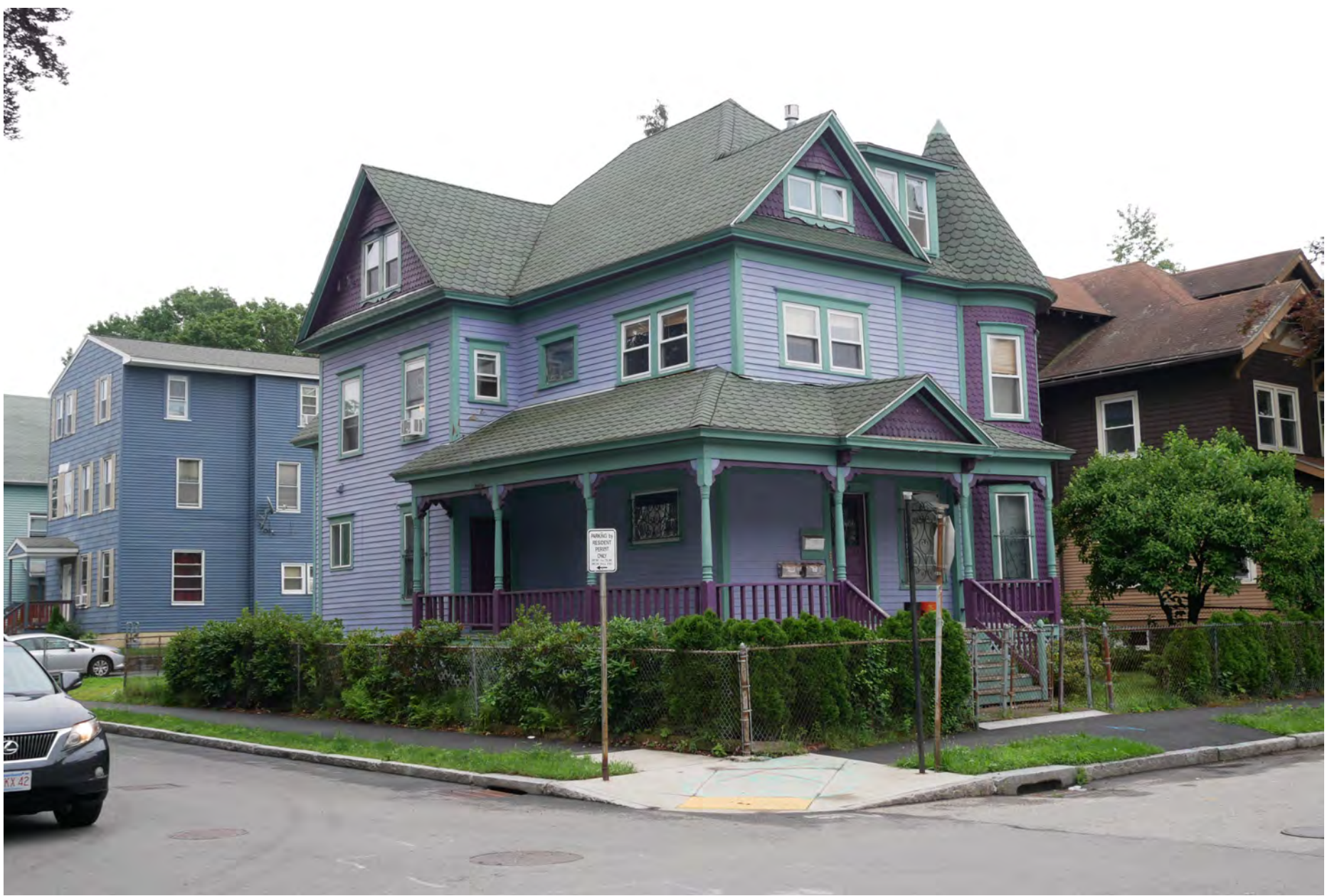
77. 54 Fruit Street, looking southeast. Integrity rating: very good