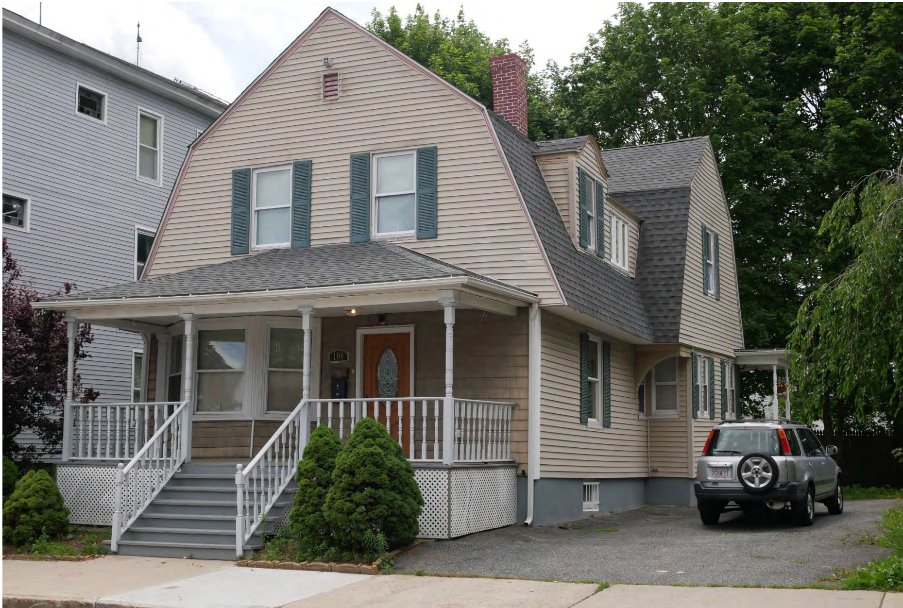
42. 108 Elm Street, looking southeast. Integrity rating: good