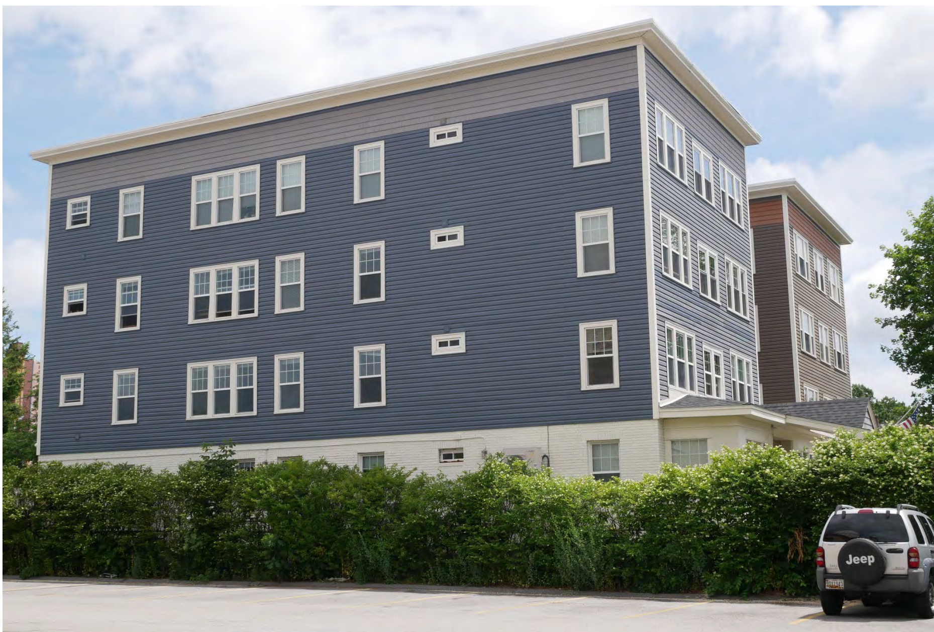
44. 115–113 (L-R) Elm Street, looking northeast. Integrity rating: fair