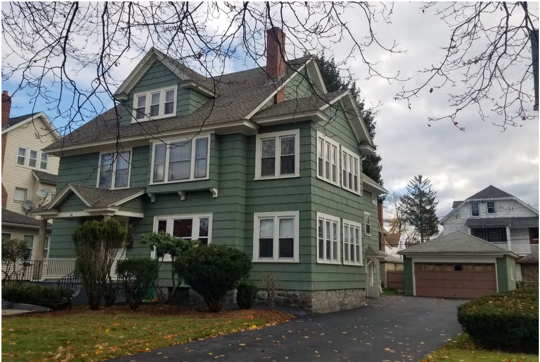
118. 144 Russell Street house and garage, looking northeast. Integrity rating: good