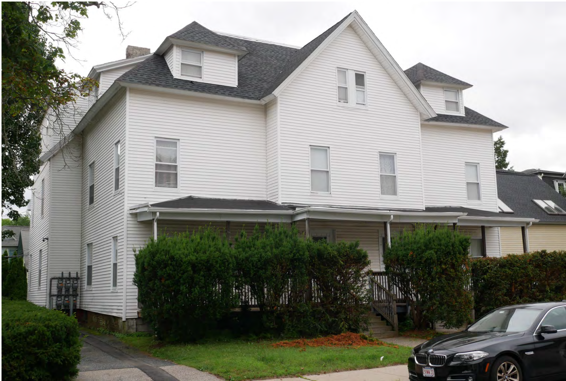
90. 101-103 Merrick Street, looking southeast. Integrity rating: poor