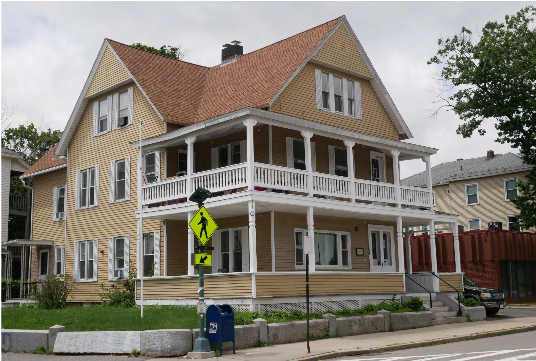
49. 128 Elm Street, looking southwest. Integrity rating: good