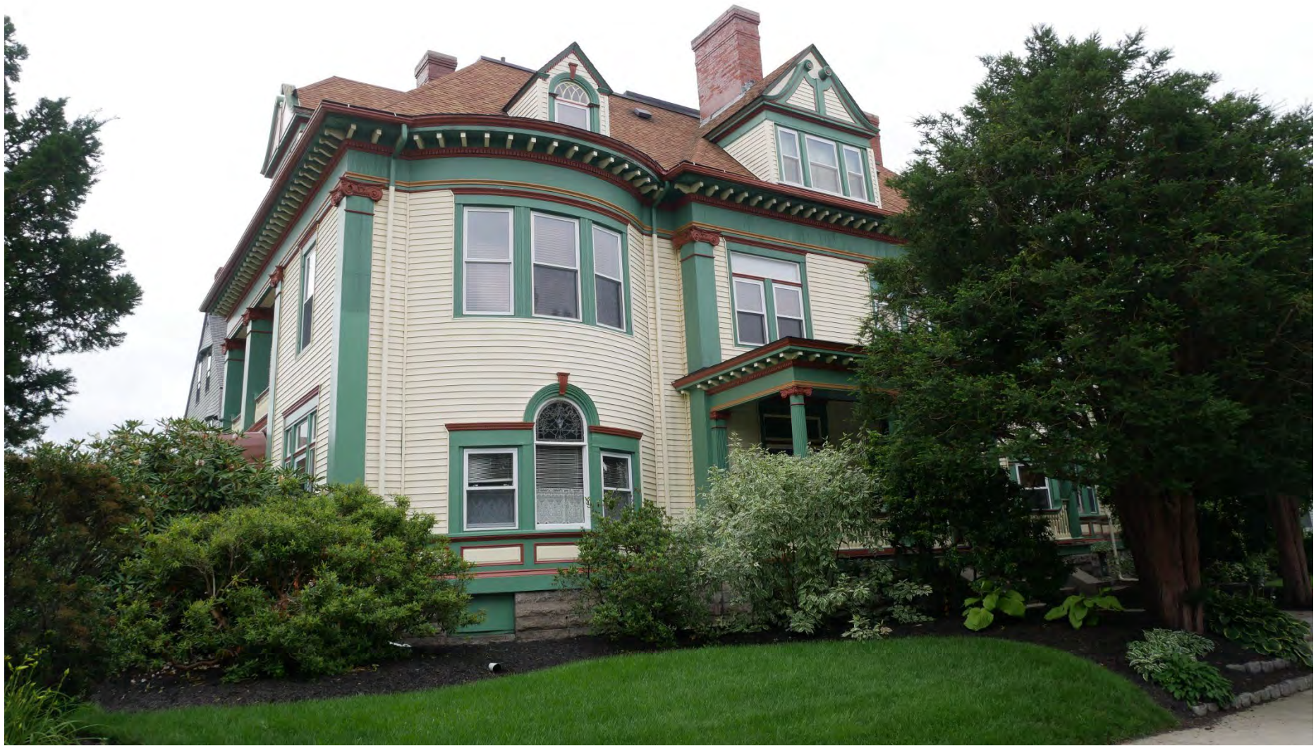
18. 57 Cedar Street, looking southeast. Integrity rating: very good