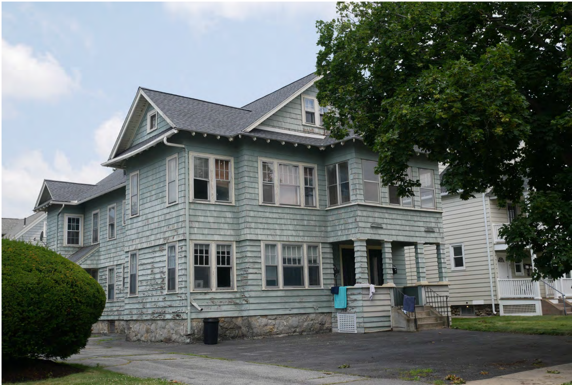
107. 43 Roxbury Street, looking northwest. Integrity rating: good