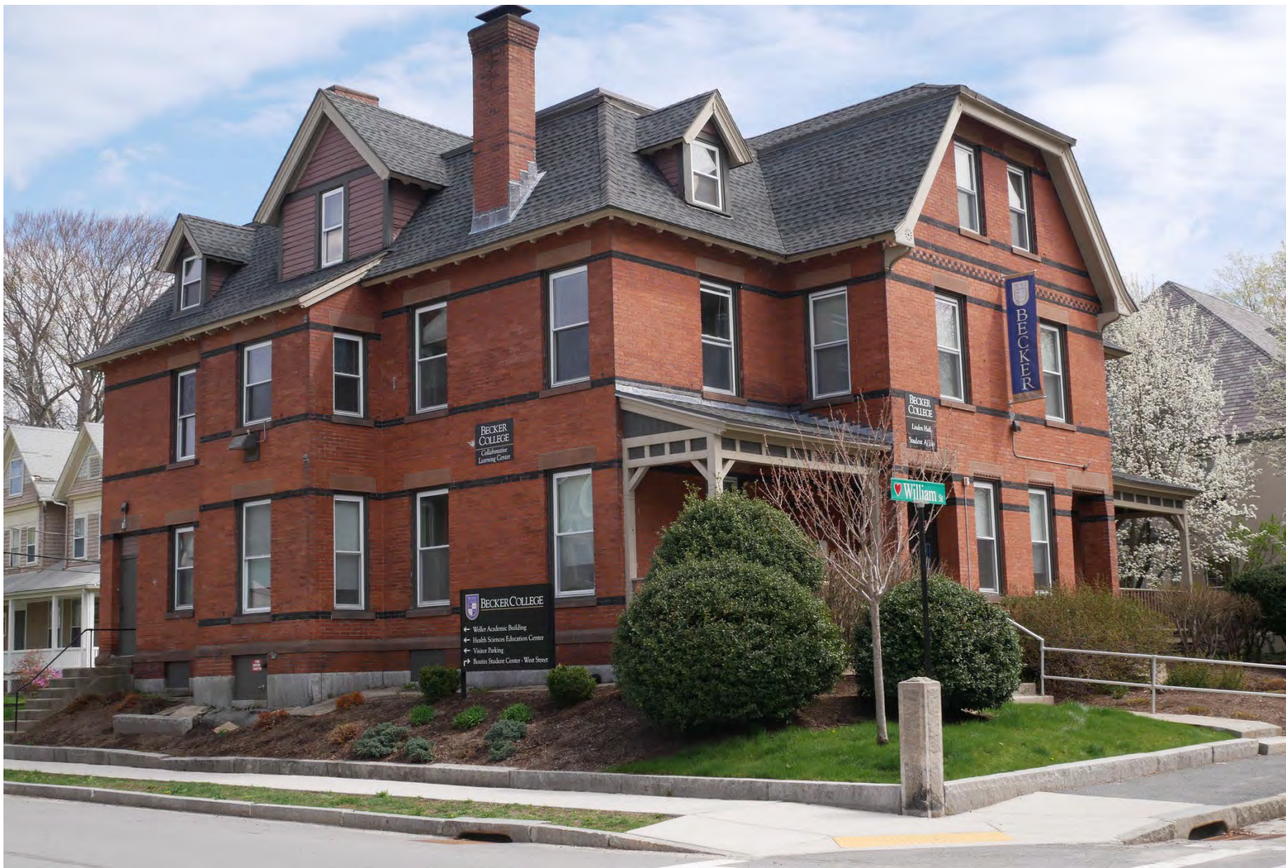
178. 62–64 William Street, looking northeast. Integrity rating: very good