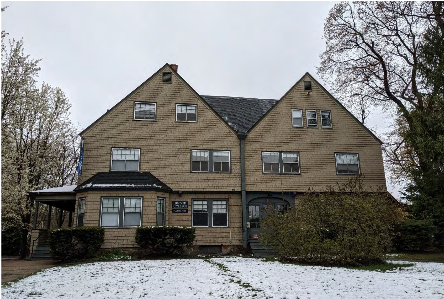
17. 56 Cedar Street, looking northwest. Integrity rating: very good