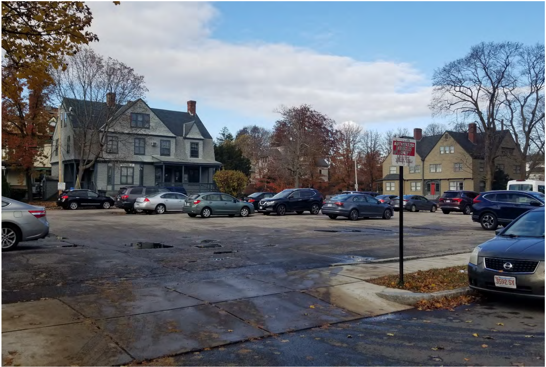
128. Parking lot at 29 Sever Street, looking northwest. Integrity rating: N/A