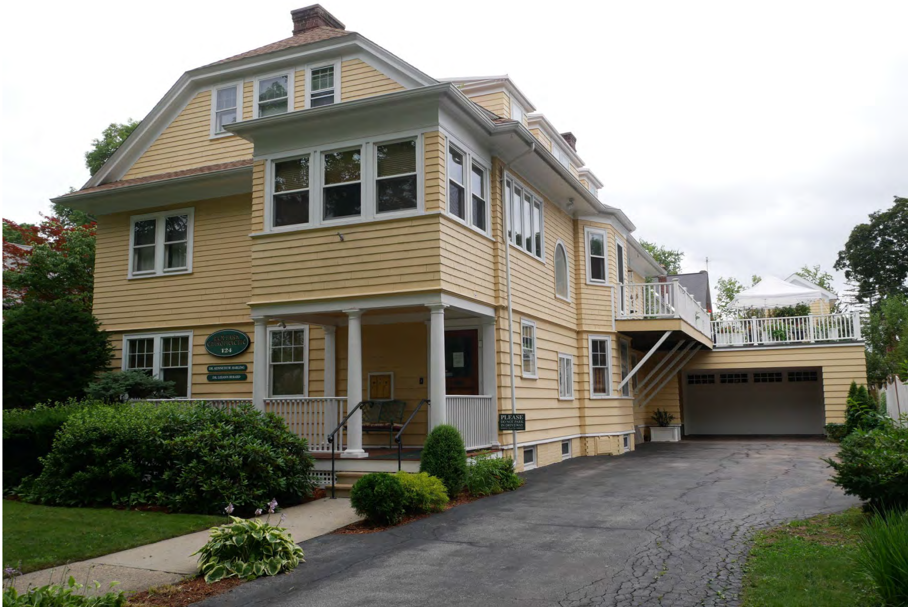
113. 124 Russell Street, looking northeast. Integrity rating: good