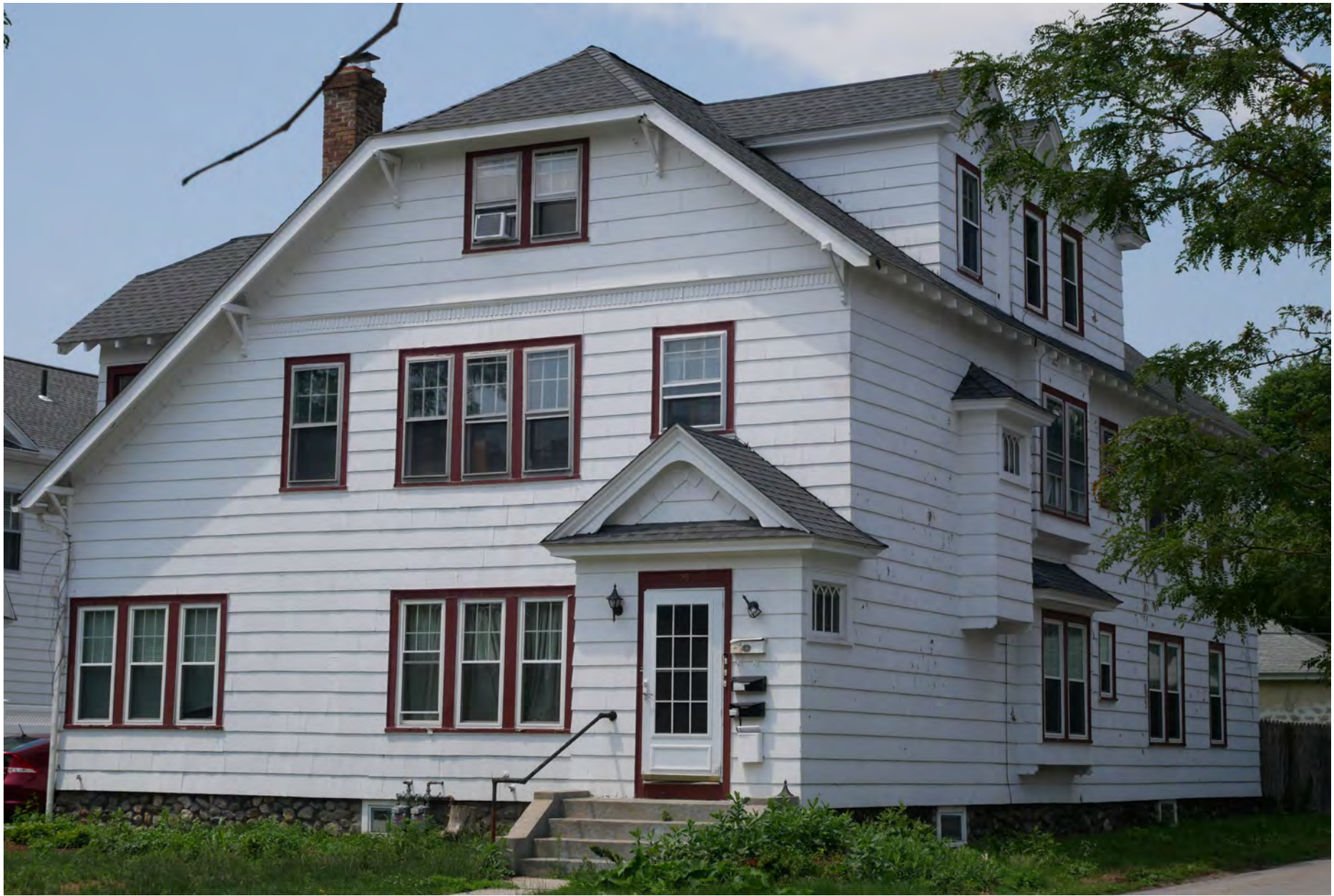
150. 25 Somerset Street, looking southwest. Integrity rating: very good