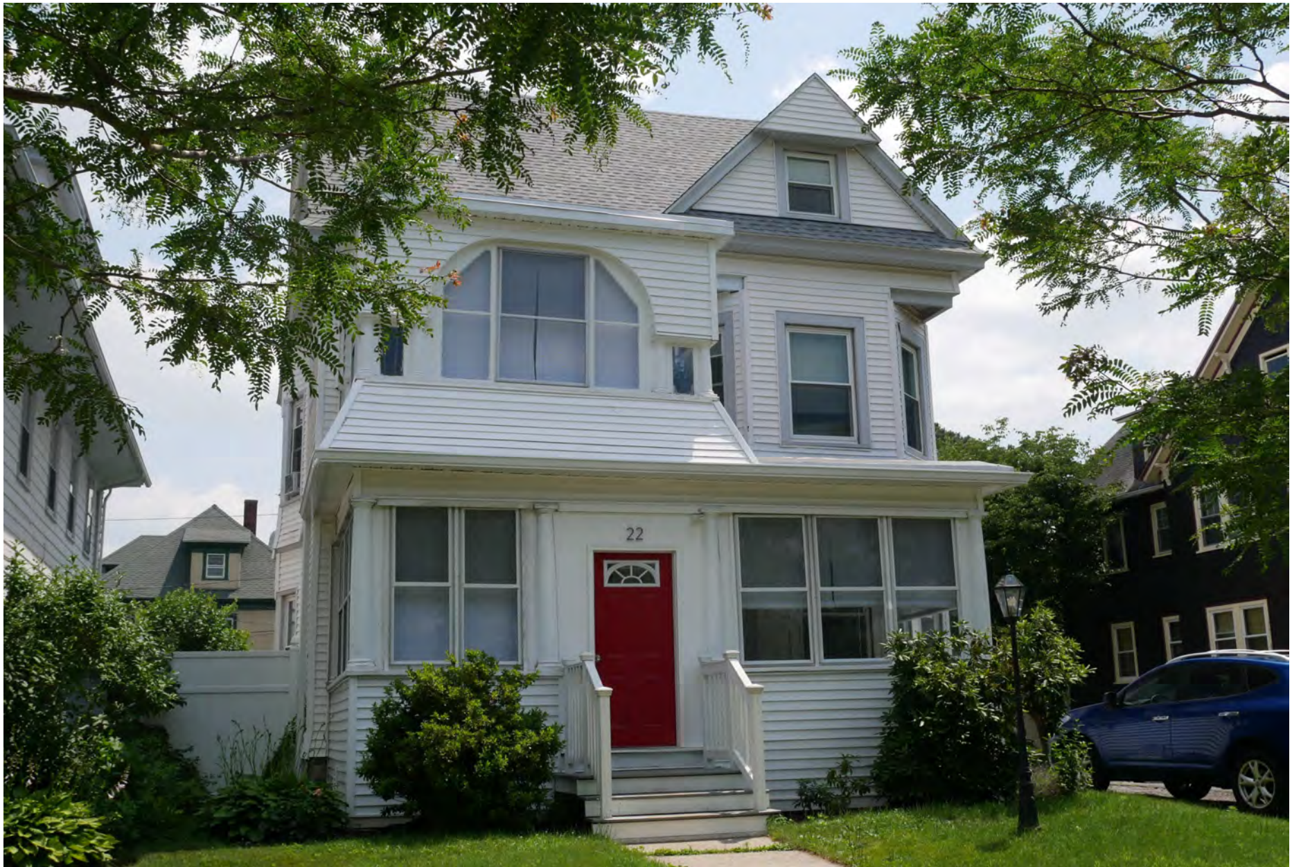
147. 22 Somerset Street, looking east. Integrity rating: fair