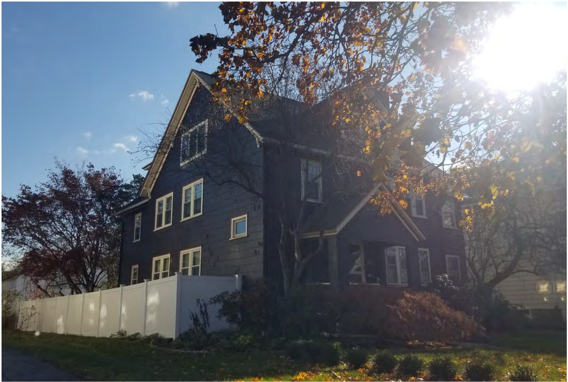
146. 20 Somerset Street, looking southeast. Integrity rating: fair to good