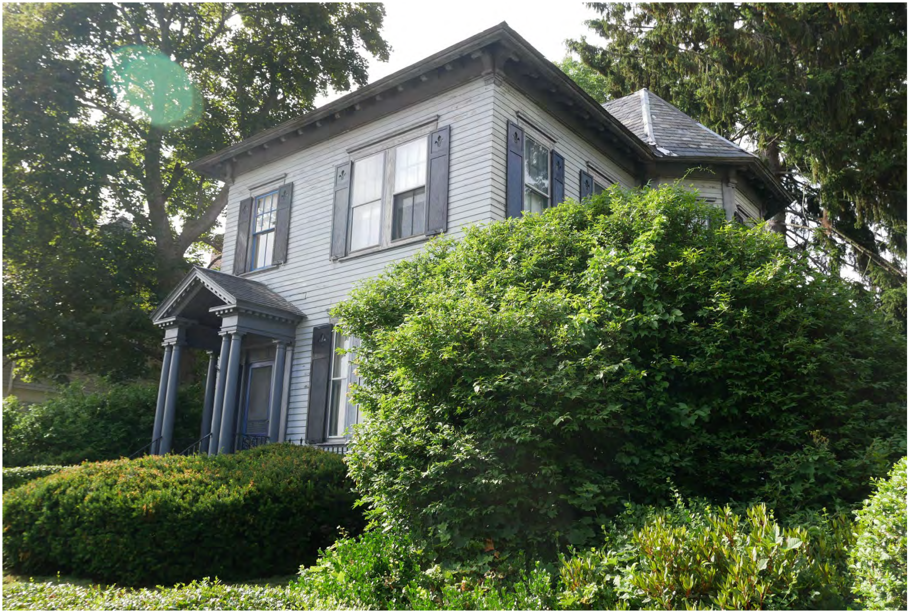
12. 50 Cedar Street, looking northwest. Integrity rating: excellent