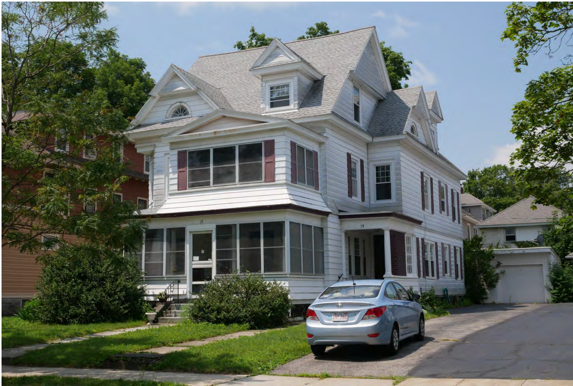
145. 17–19 Somerset Street, house and garage, looking southwest. Integrity rating: fair