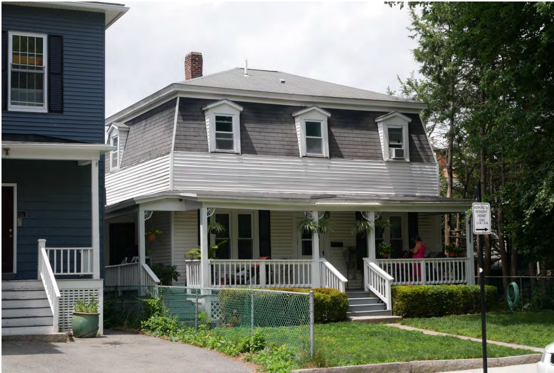
124. 25 Sever Street, looking southeast. Integrity rating: fair