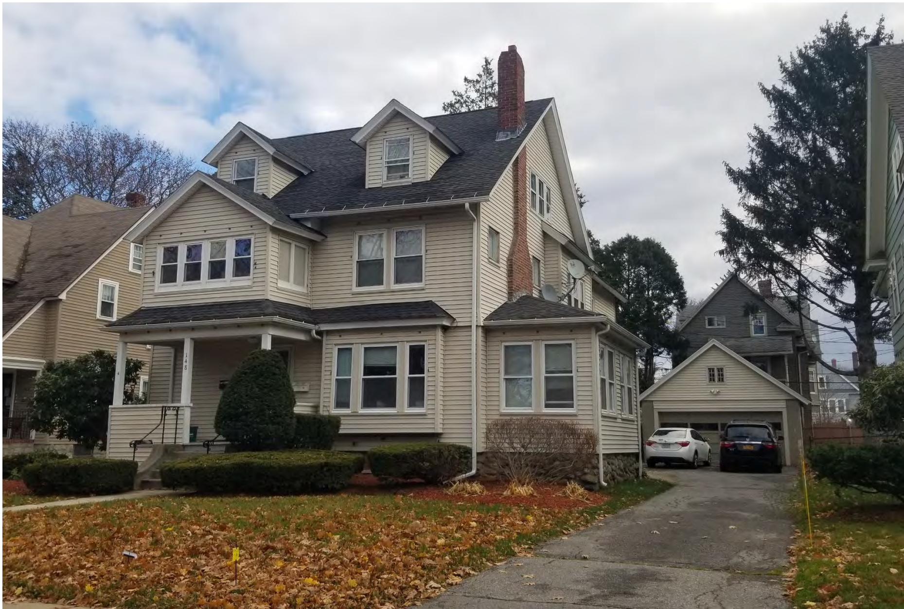
119. 148 Russell Street, house and garage, looking northeast. Integrity rating: fair