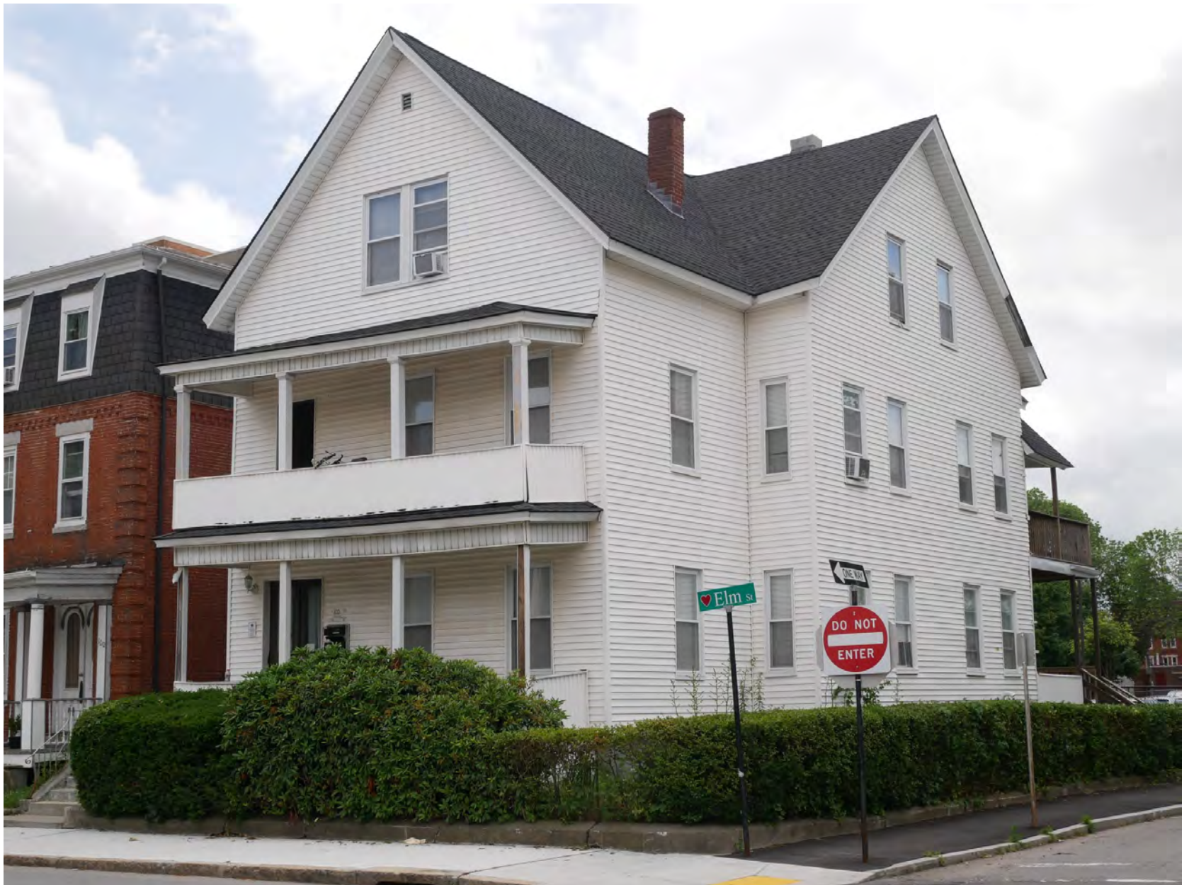
40. 102 Elm Street, looking southeast. Integrity rating: fair