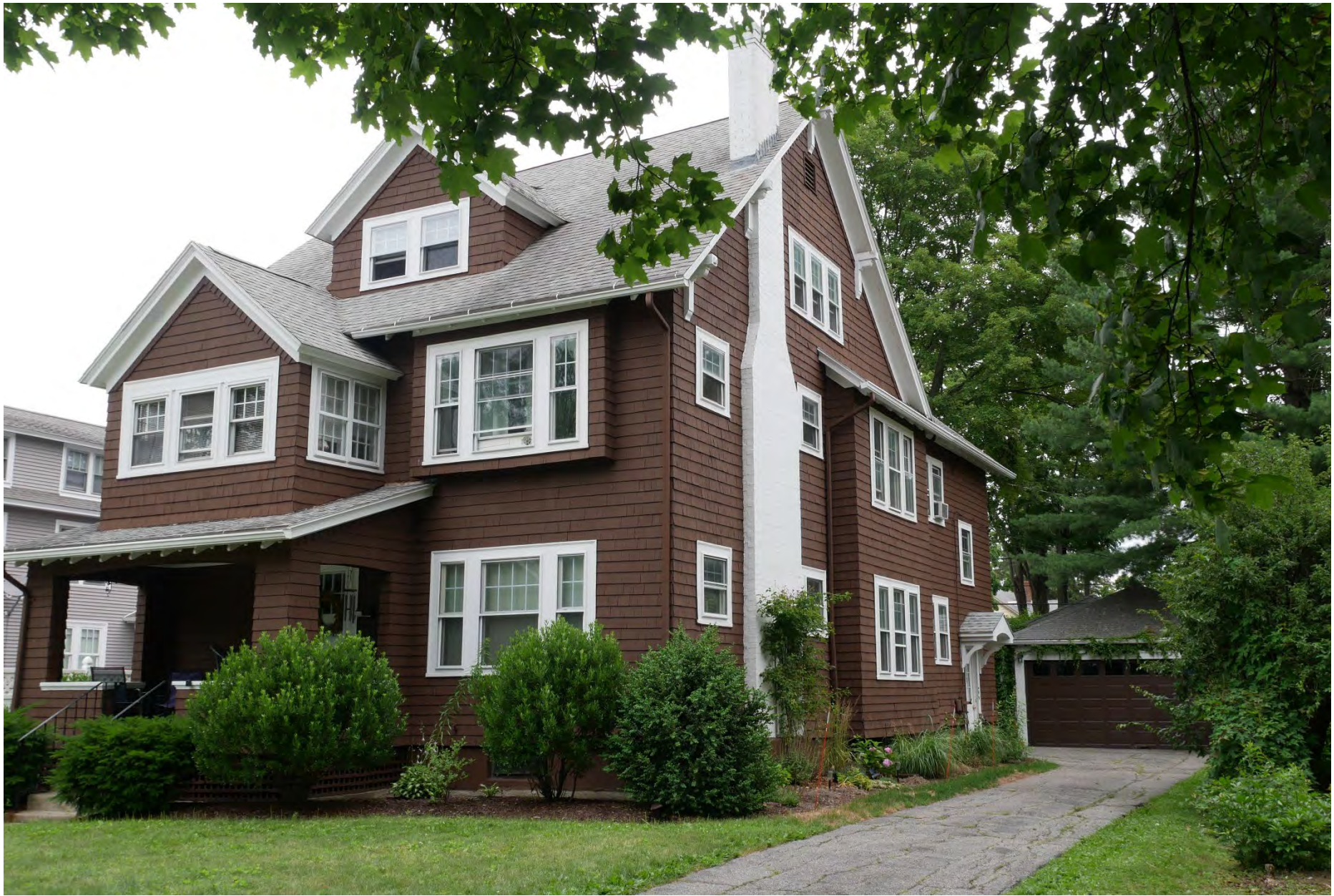
114. 128 Russell Street, house and garage, looking northeast. Integrity rating: good