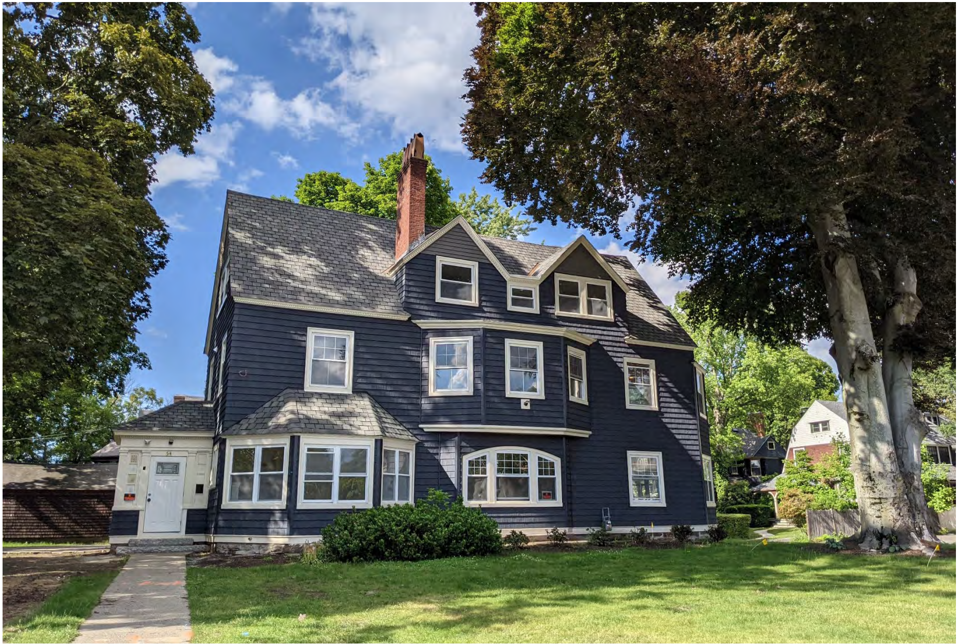
15. 54 Cedar Street, northeast. Integrity rating: very good