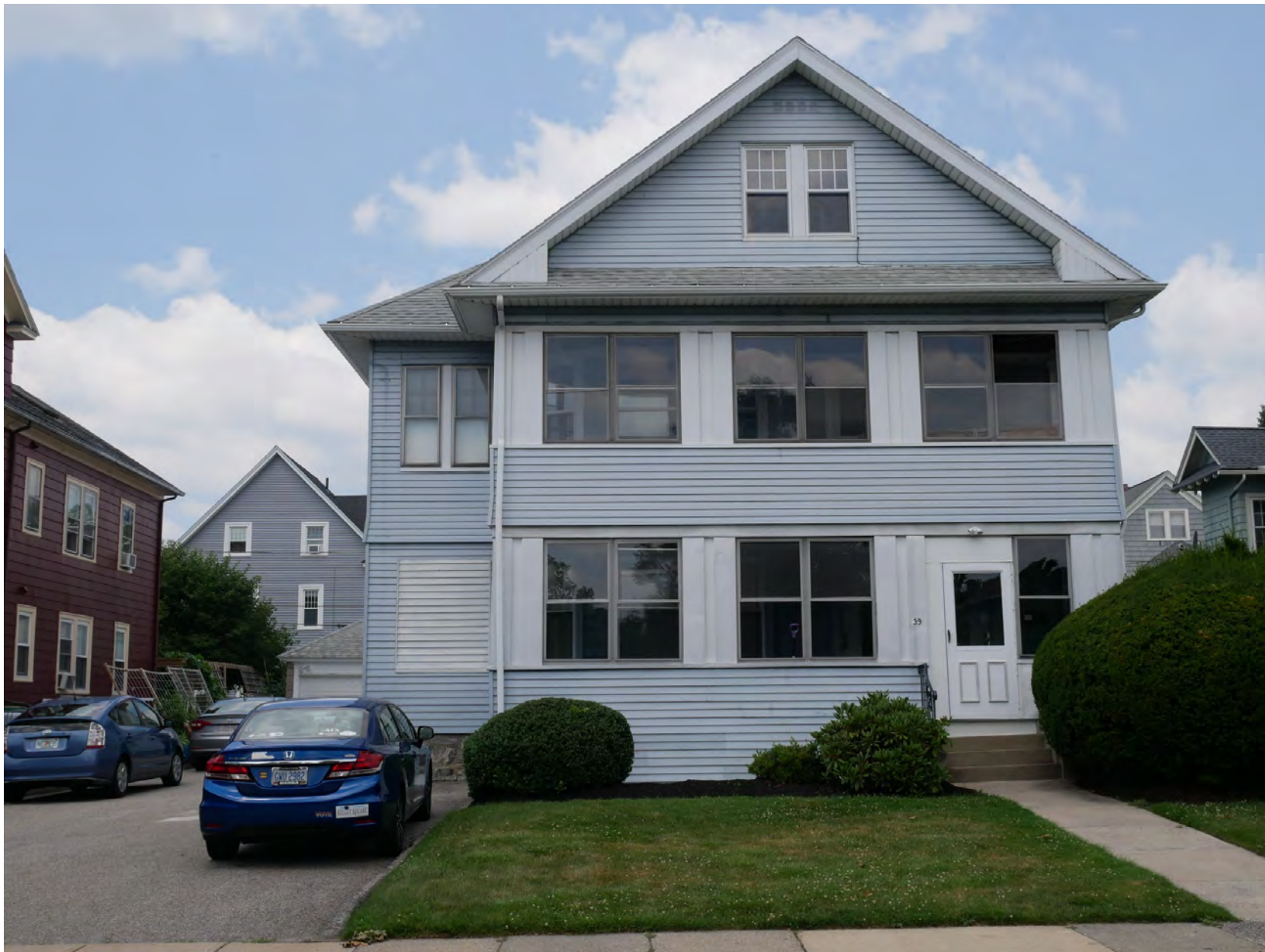
105. 39 Roxbury Street, looking west. Integrity rating: fair