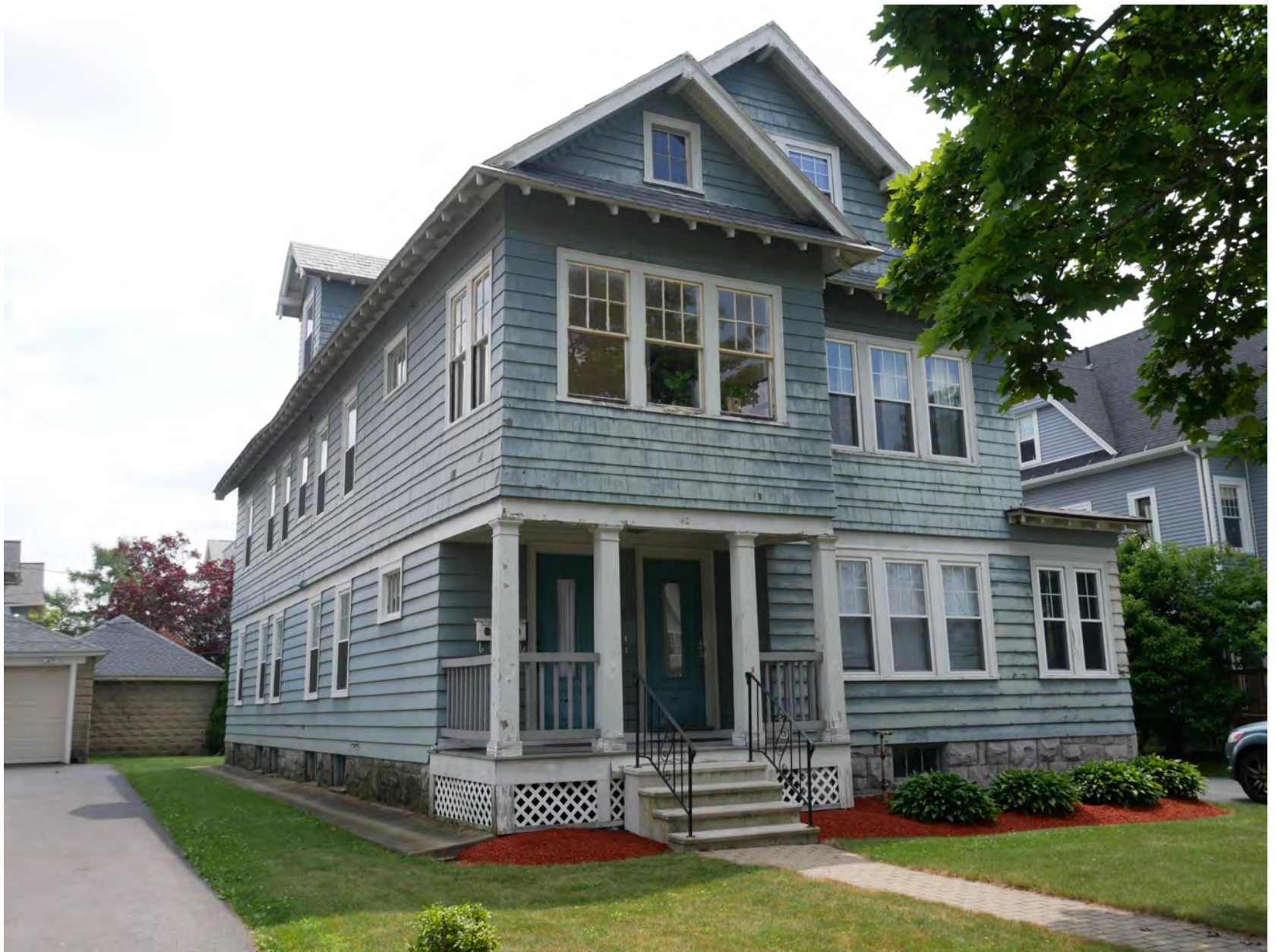
161. 42 Somerset Street, looking southeast. Integrity rating: very good