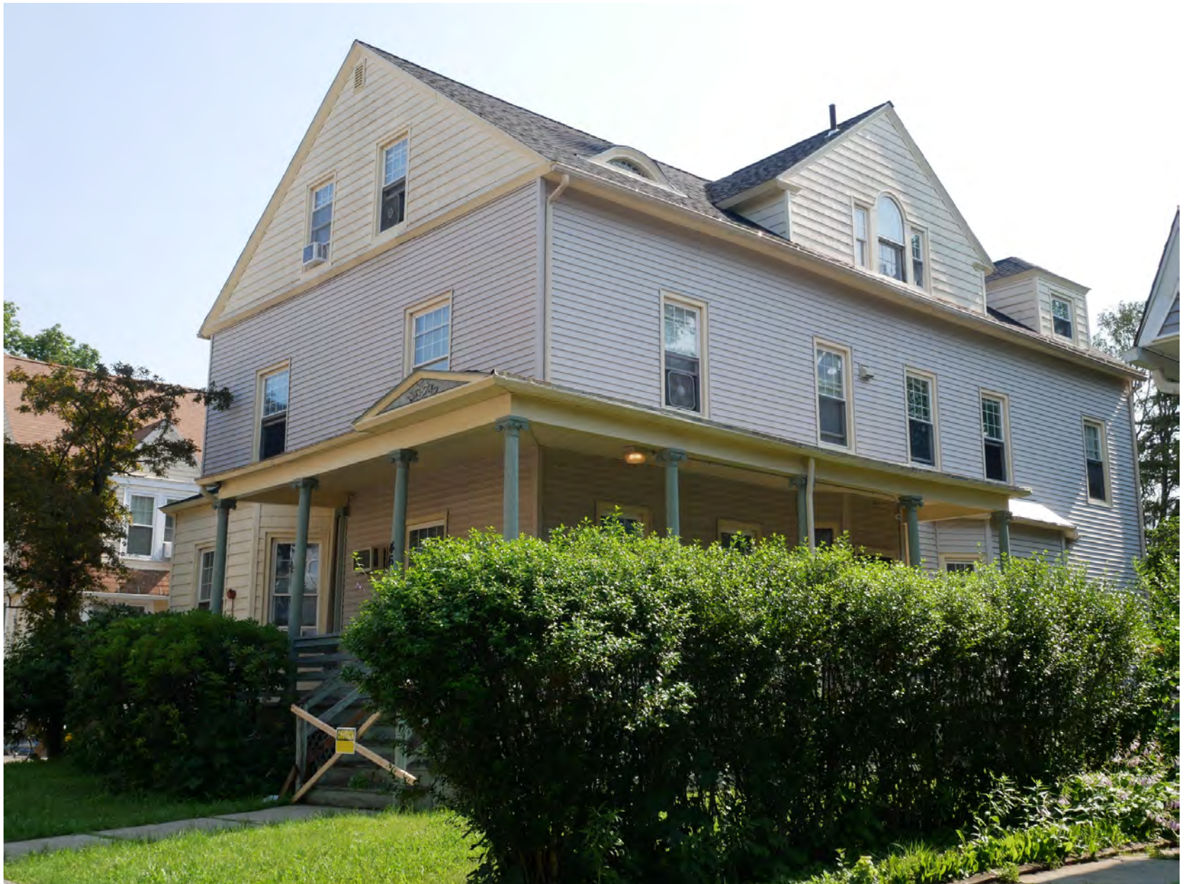
73. 46 Fruit Street, looking northeast. Integrity rating: fair