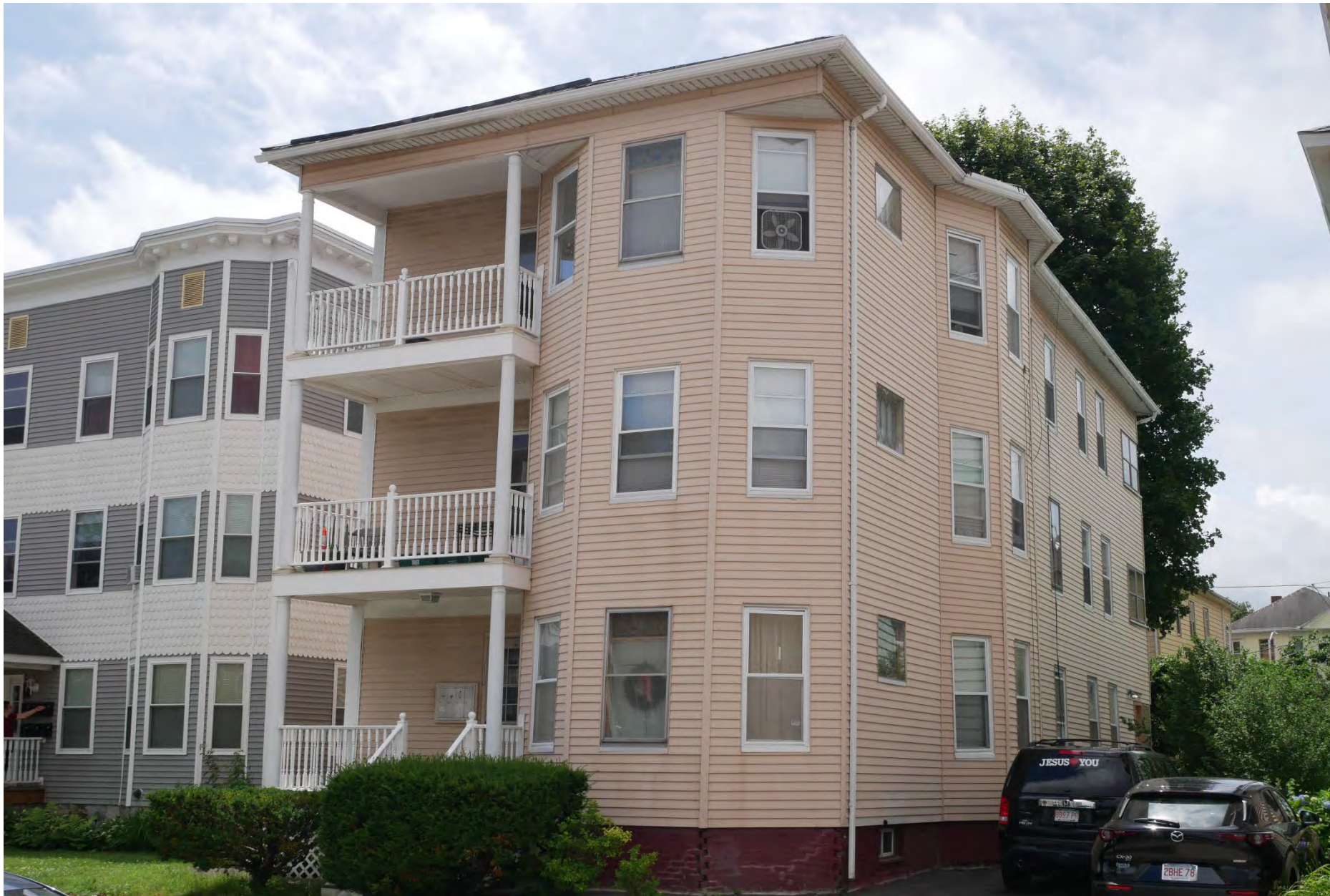
46. 118 Elm Street, looking southeast. Integrity rating: fair