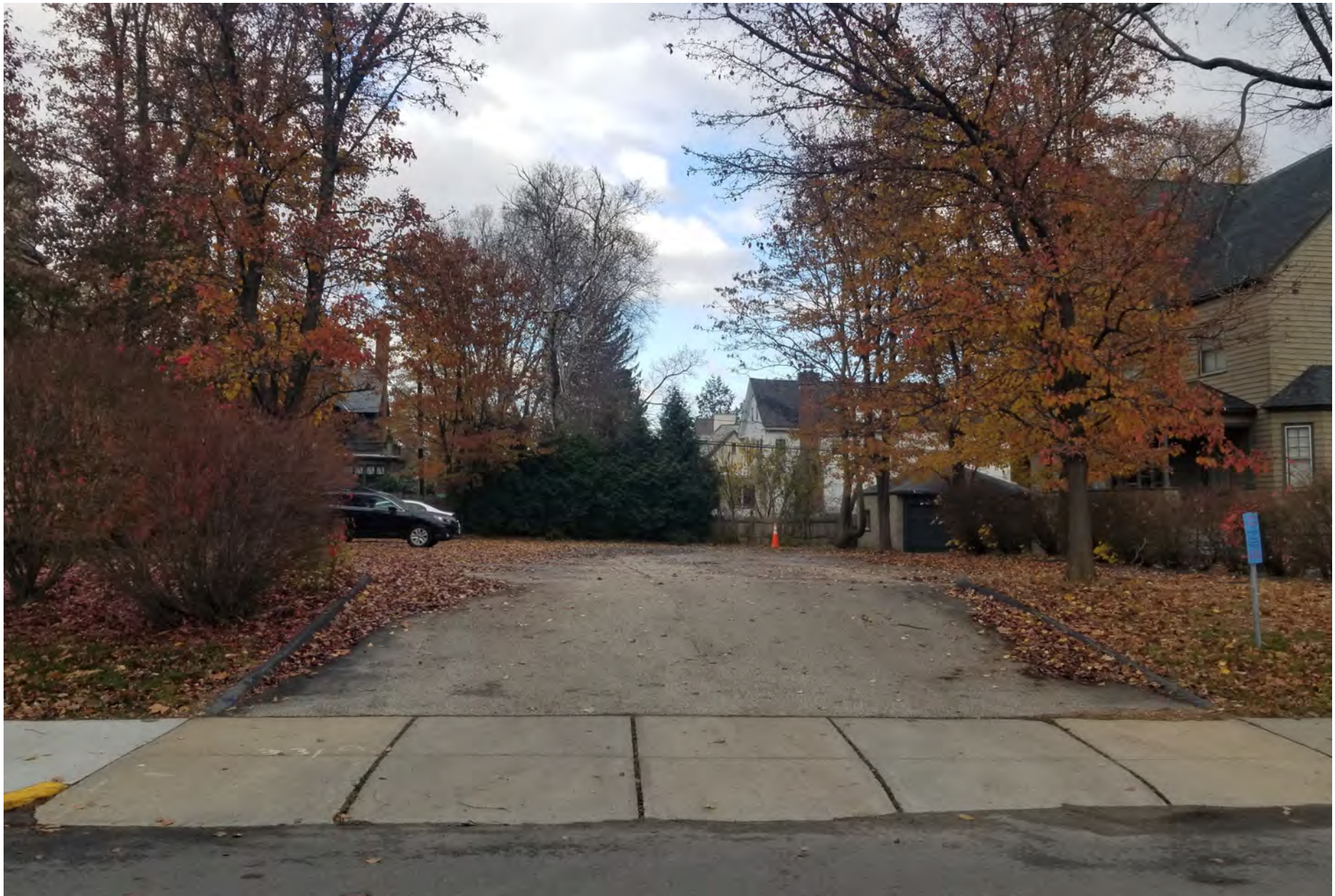
19. Parking lot at 60 Cedar Street, looking north. Integrity rating: N/A