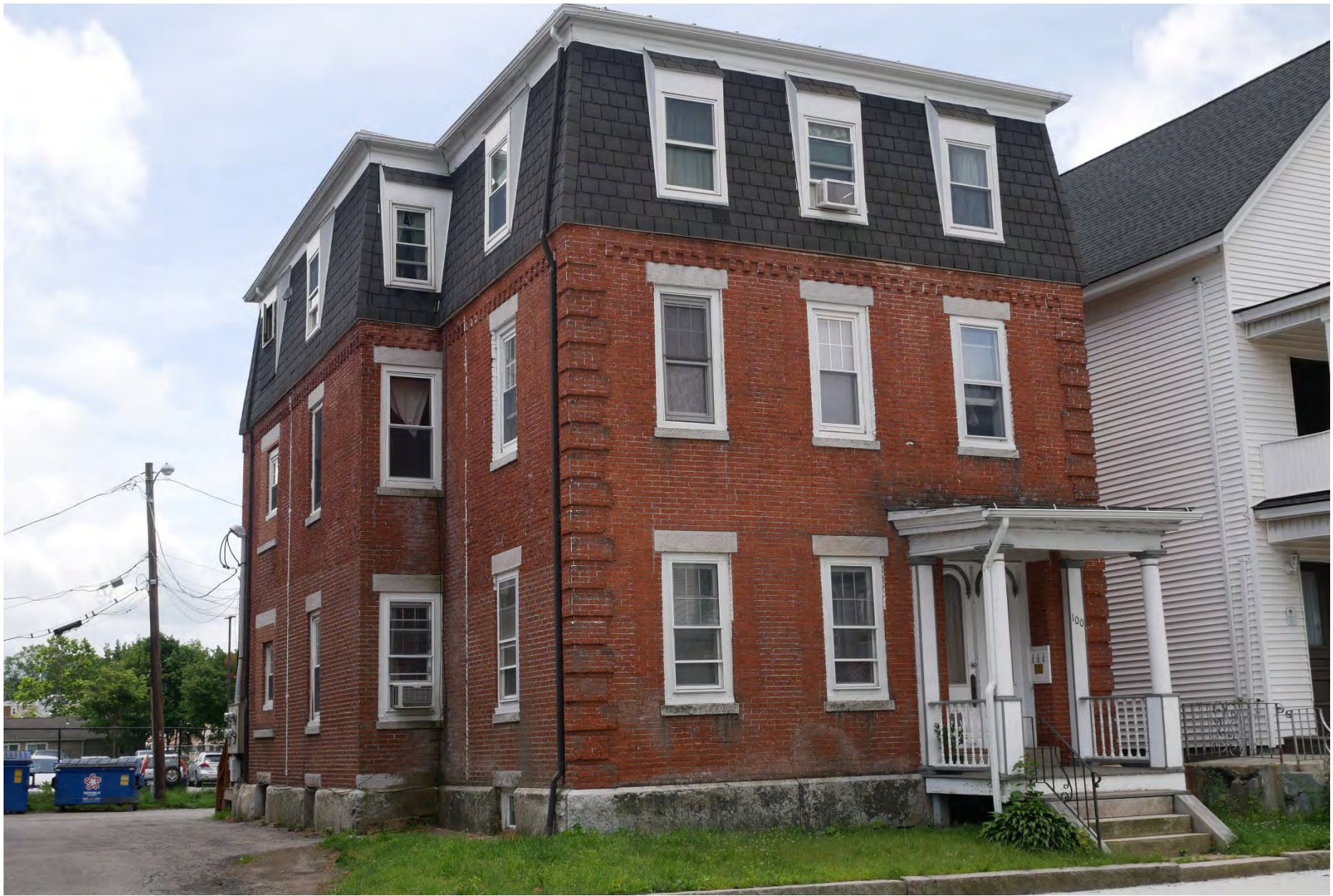
39. 100 Elm Street, looking southwest. Integrity rating: very good