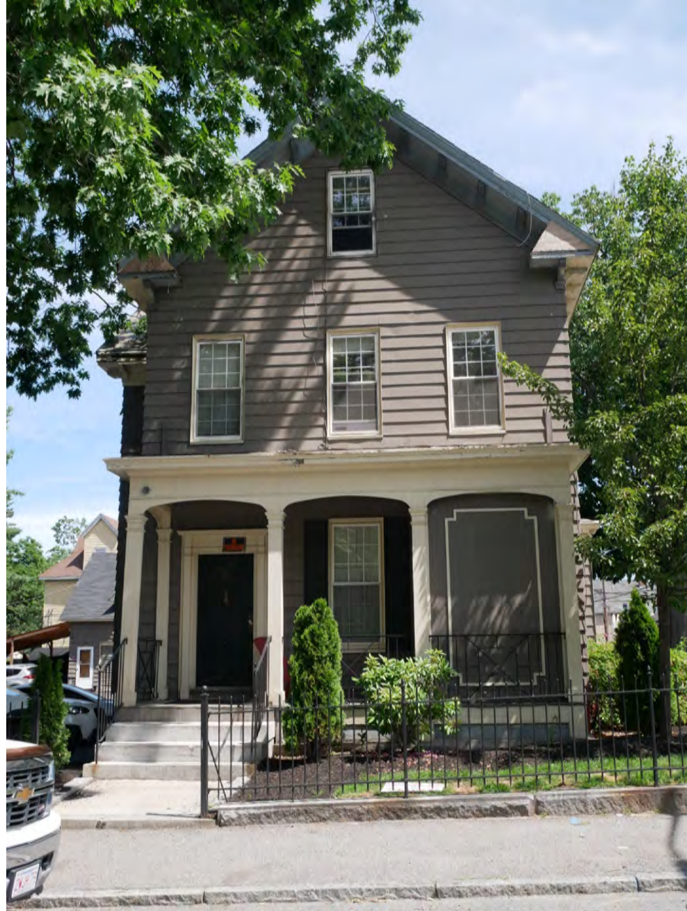
170. 50 William Street, looking north. Integrity rating: good