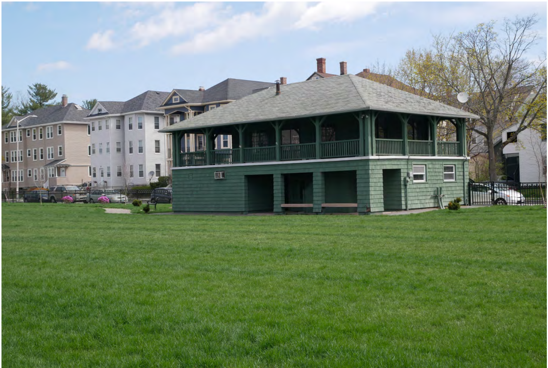
139. 69 Sever Street, looking northeast. Integrity rating: very good