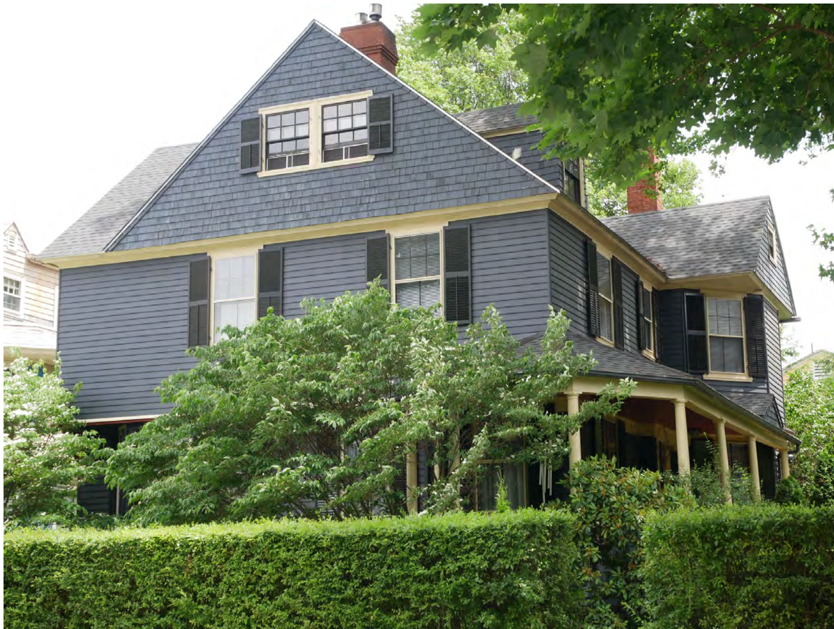
131. 38 Sever Street, looking northwest. Integrity rating: very good