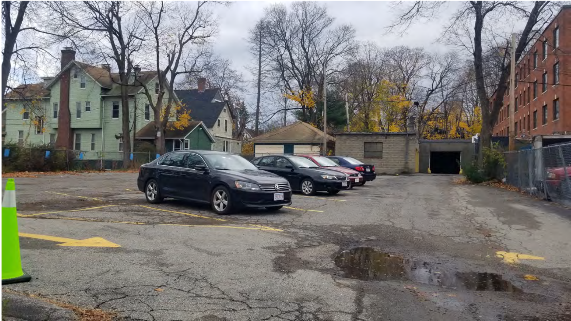
65. Parking lot at 36 Fruit Street, looking northeast. Integrity rating: N/A