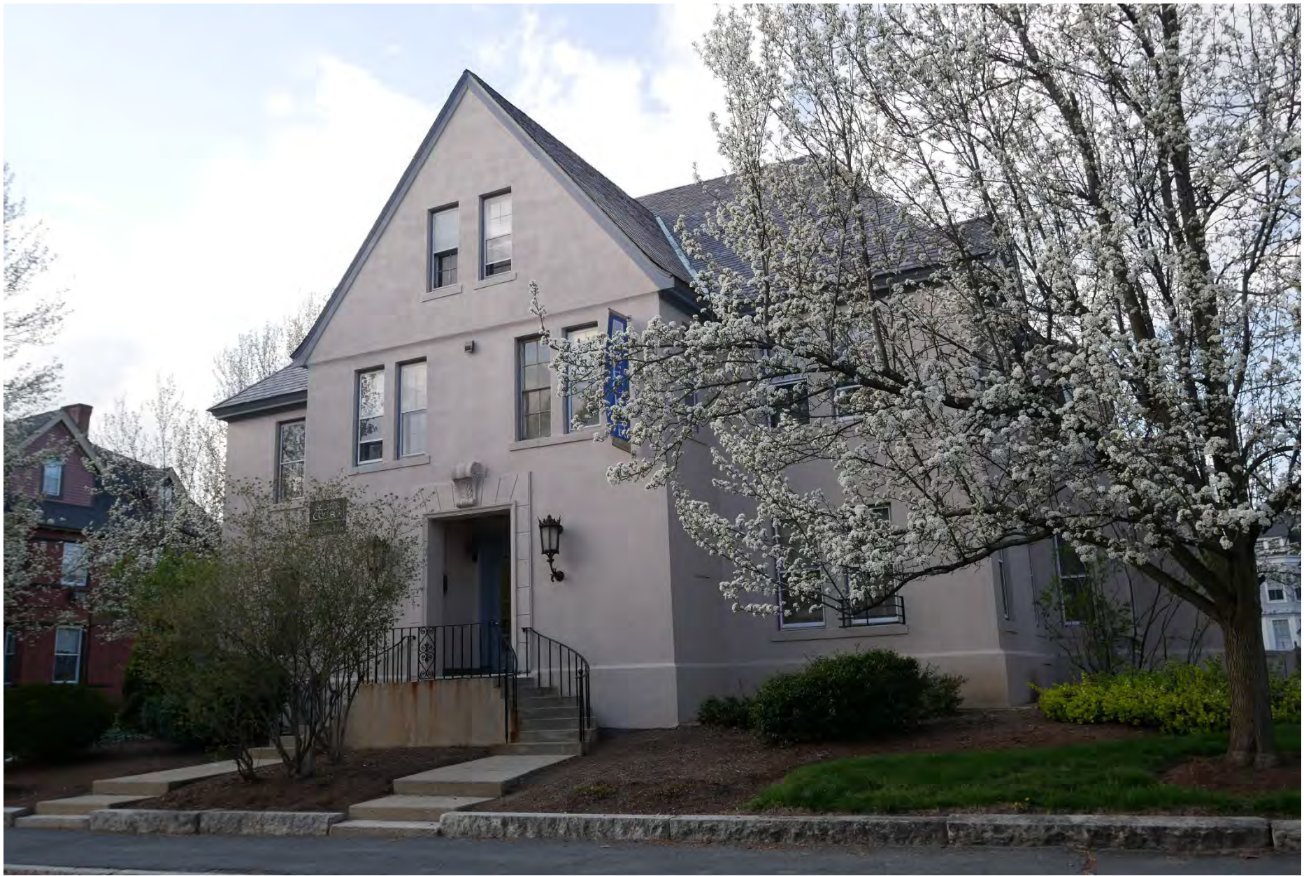
176. 60 William Street, looking northwest. Integrity rating: very good