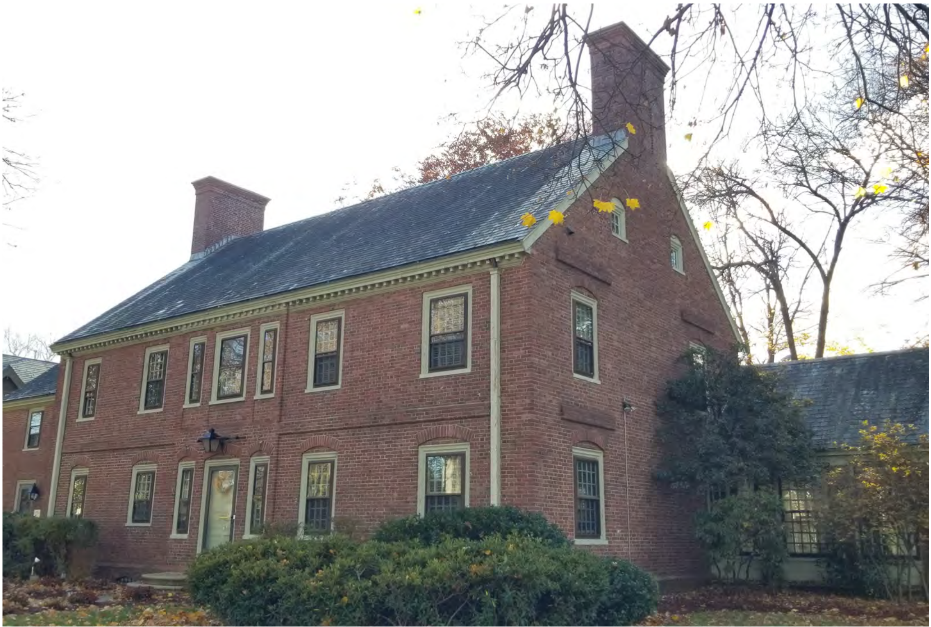
185. 81 William Street, looking southeast. Integrity rating: excellent