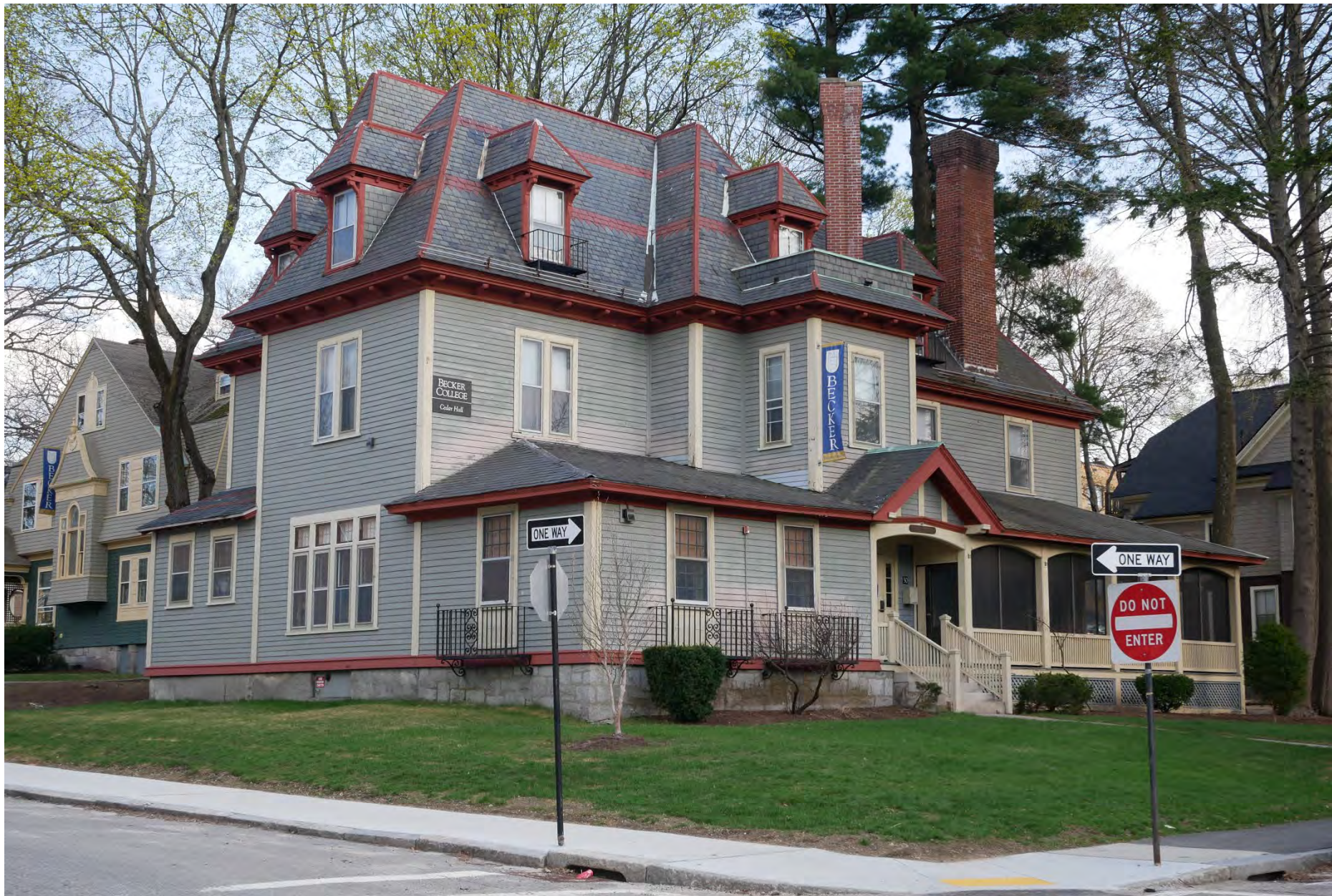
63. 30 Fruit Street, looking southeast. Integrity rating: very good