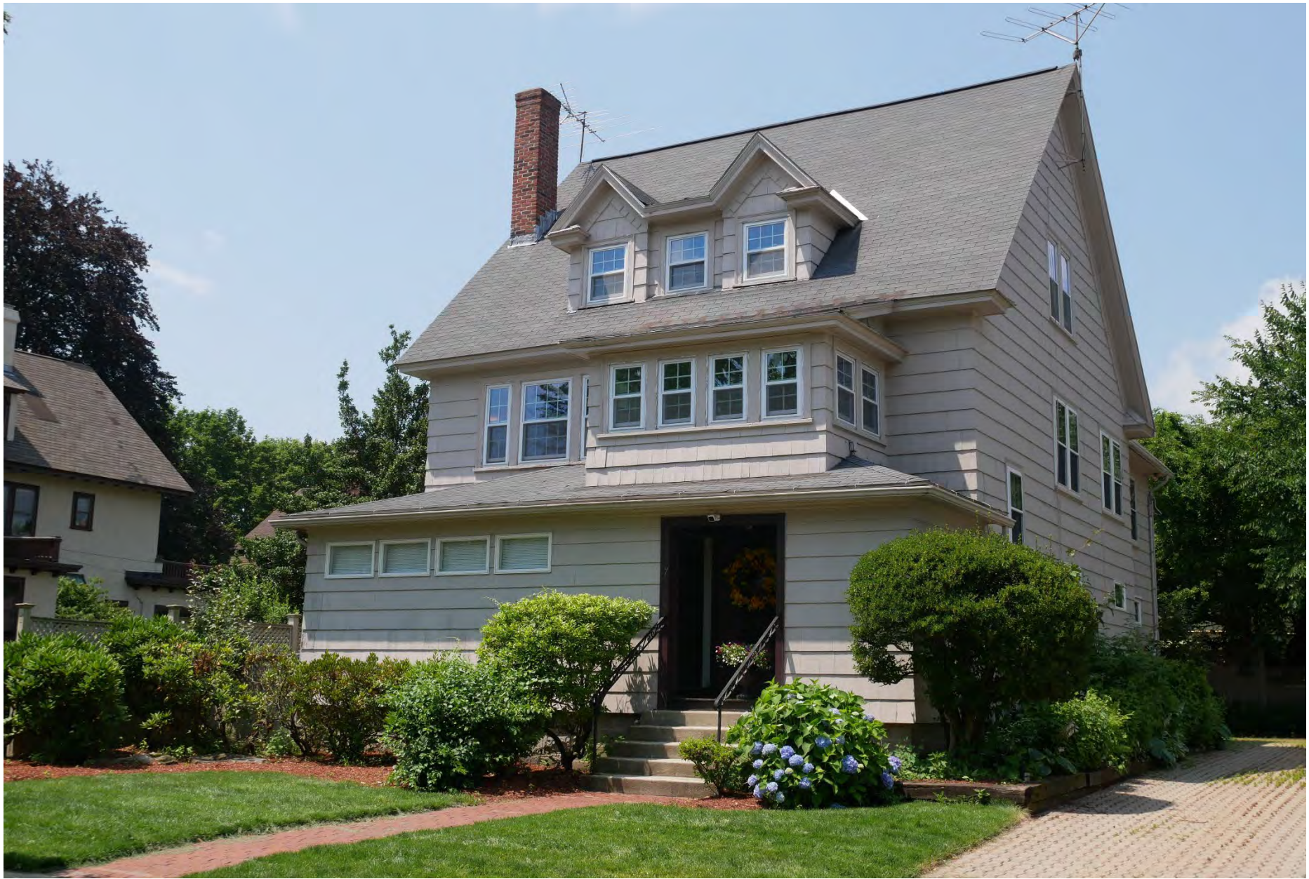
140. 7 Somerset Street, looking southwest. Integrity rating: fair to good