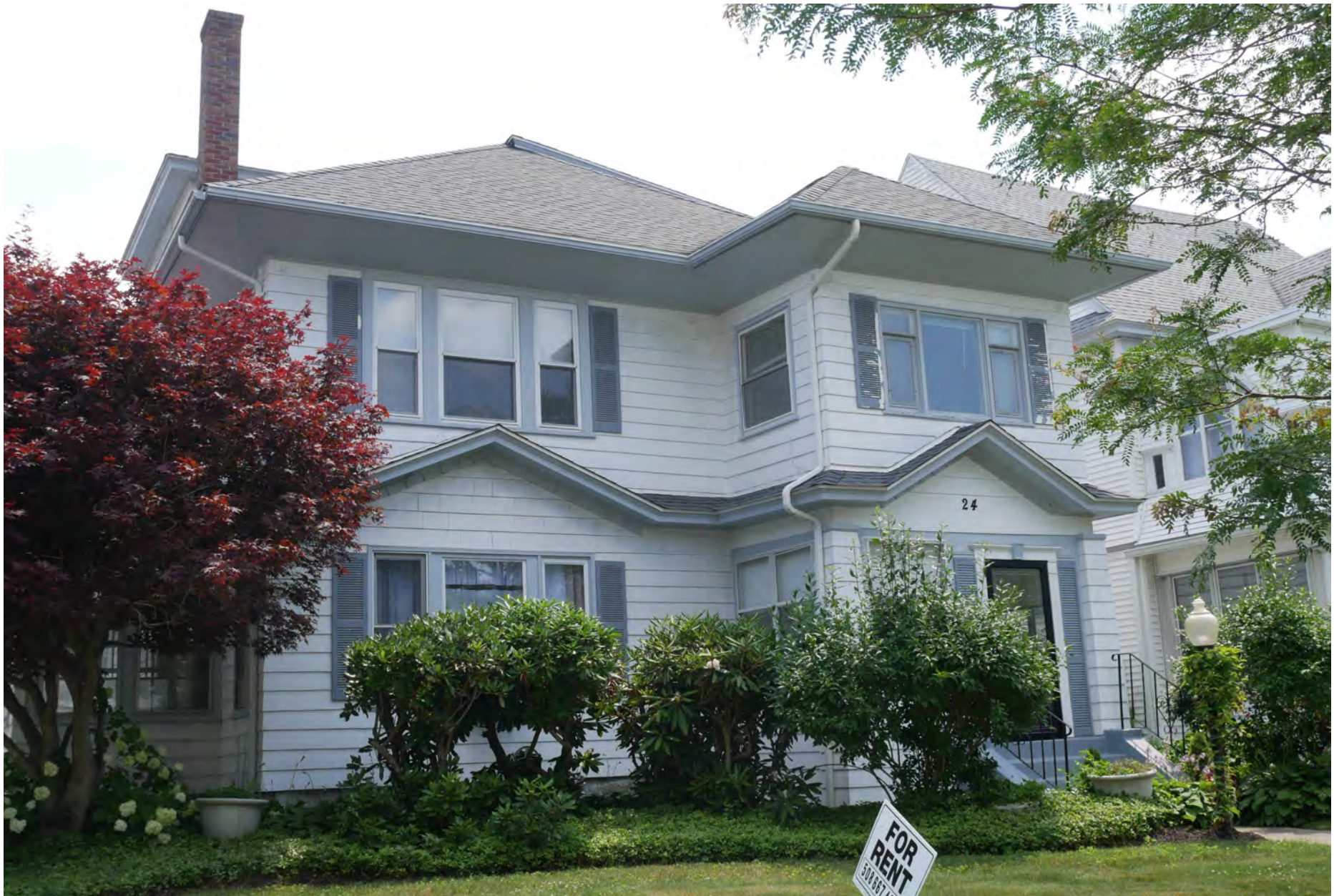
149. 24 Somerset Street, looking southeast. Integrity rating: fair