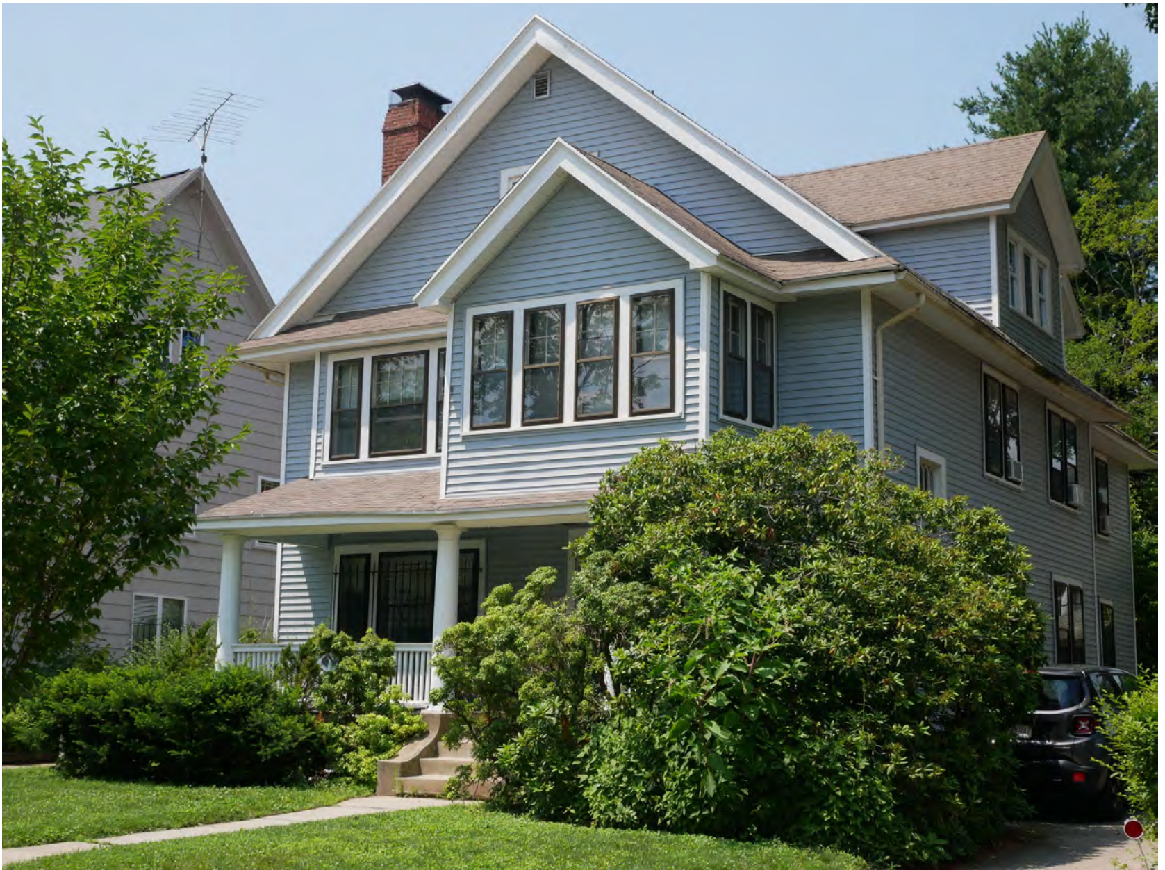
141. 9 Somerset Street, looking southwest. Integrity rating: fair to good