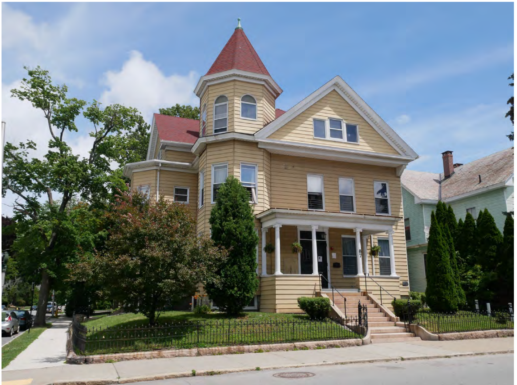
31. 87 Elm Street, looking northeast. Integrity rating: good