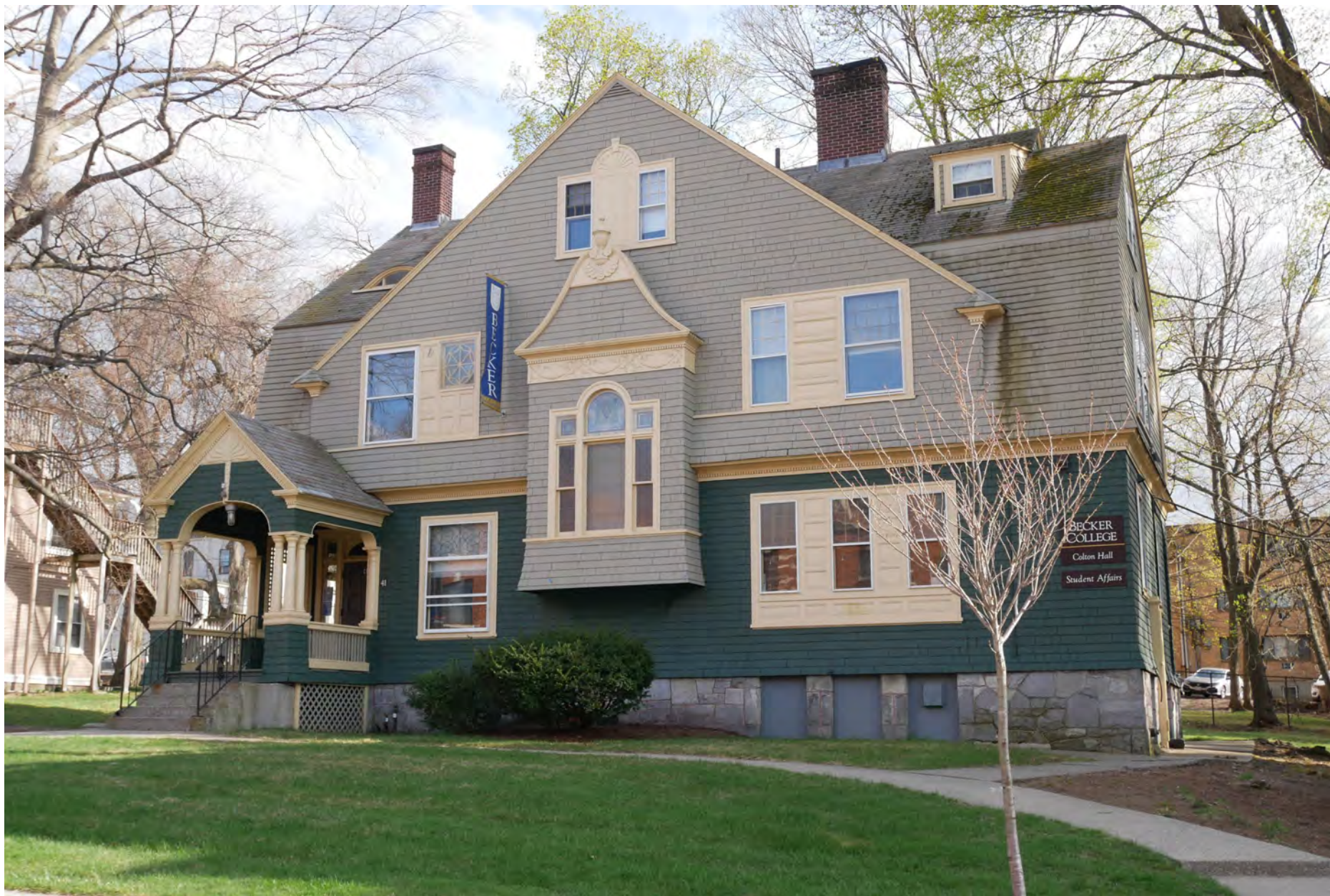
7. 41 Cedar Street, looking southeast. Integrity rating: very good