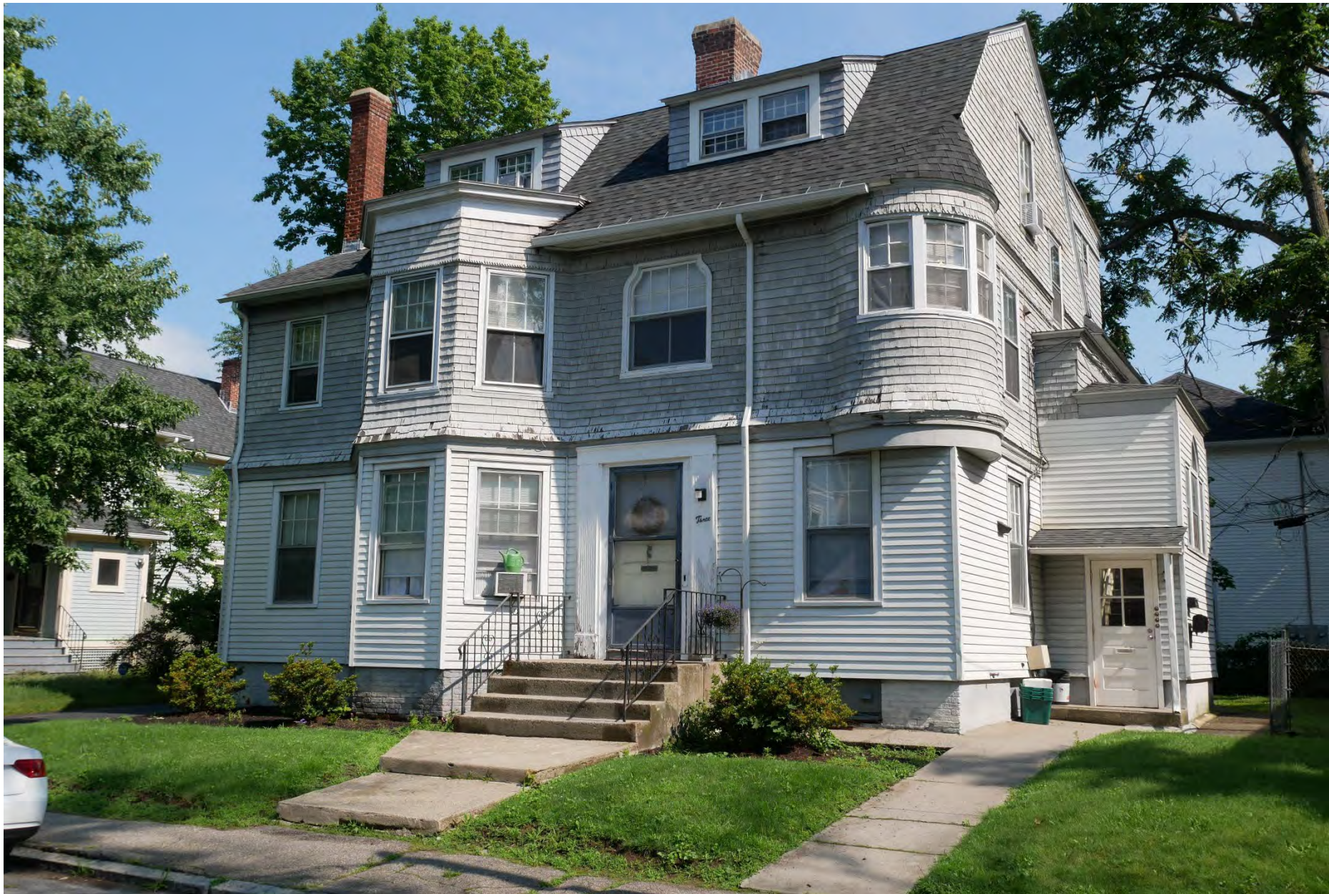
86. 3 Marston Way, looking northwest. Integrity rating: good