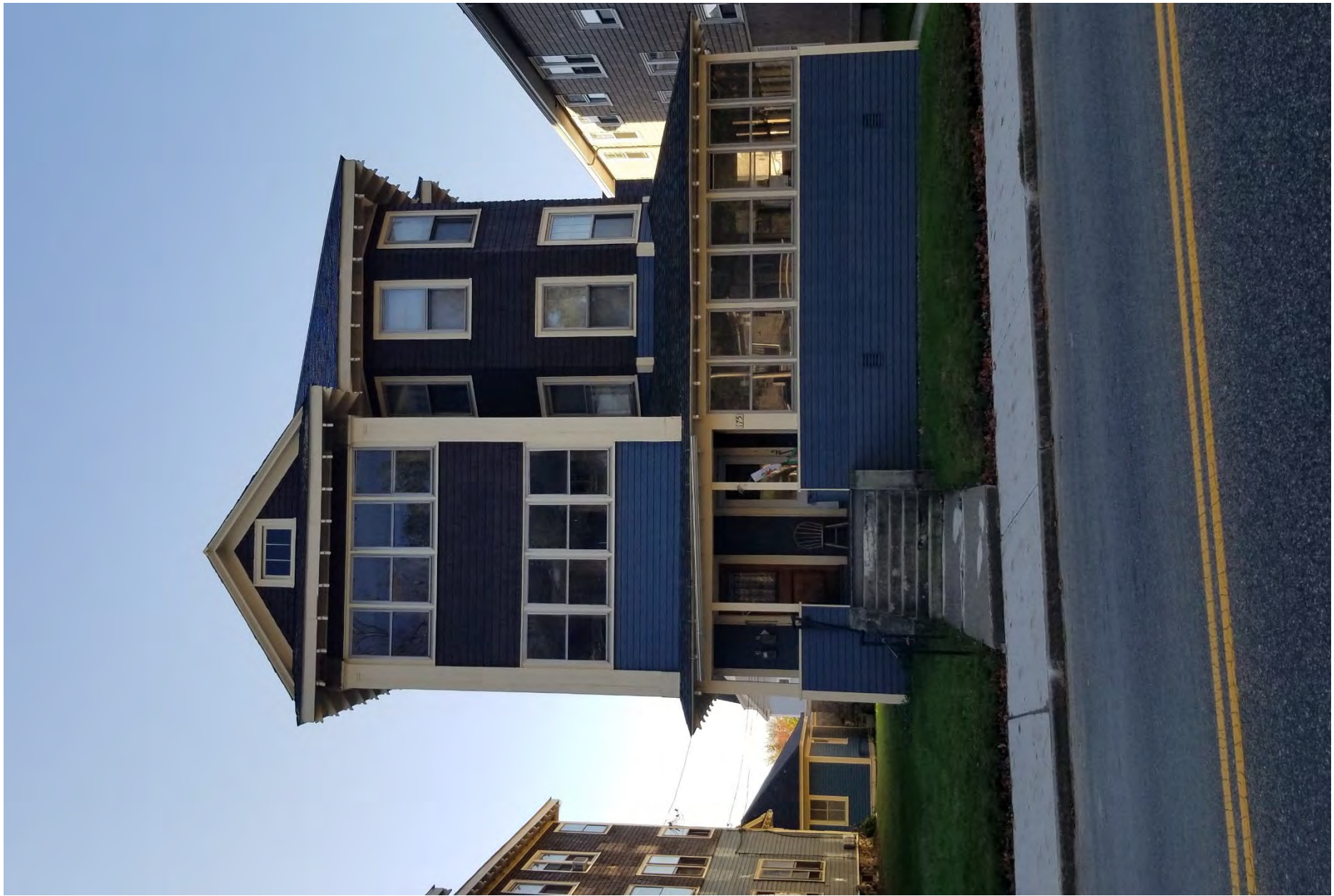
79. 175 Highland Street, looking south. Integrity rating: very good