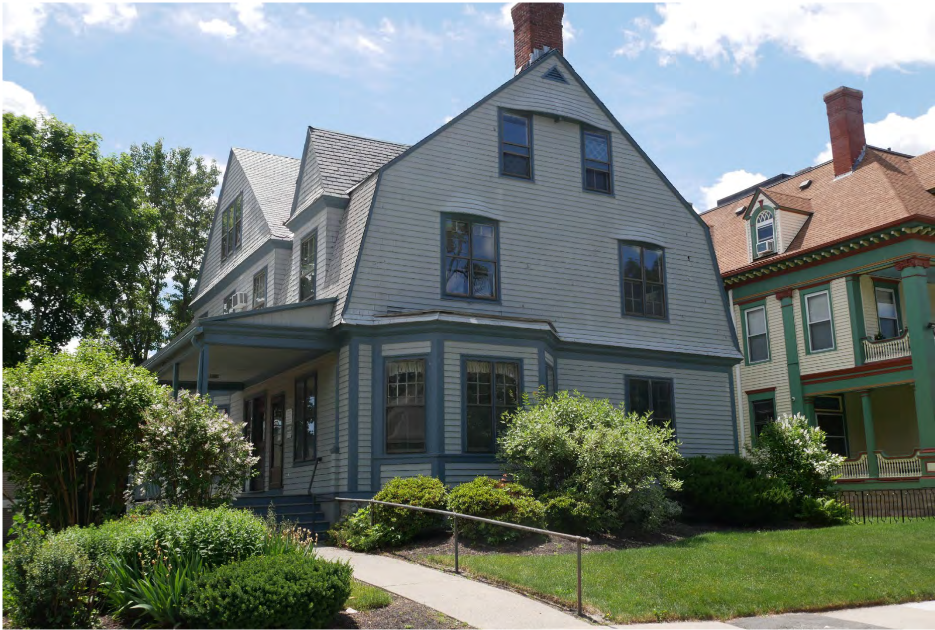
16. 55 Cedar Street, looking southwest. Integrity rating: very good