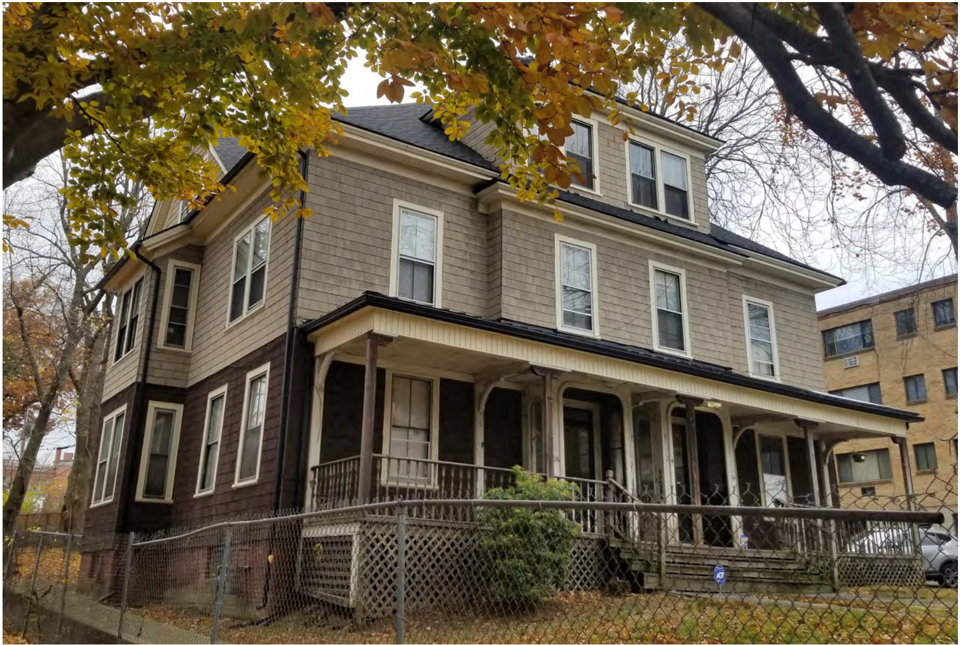
62. 24-26 Fruit Street, looking southeast. Integrity rating: very good