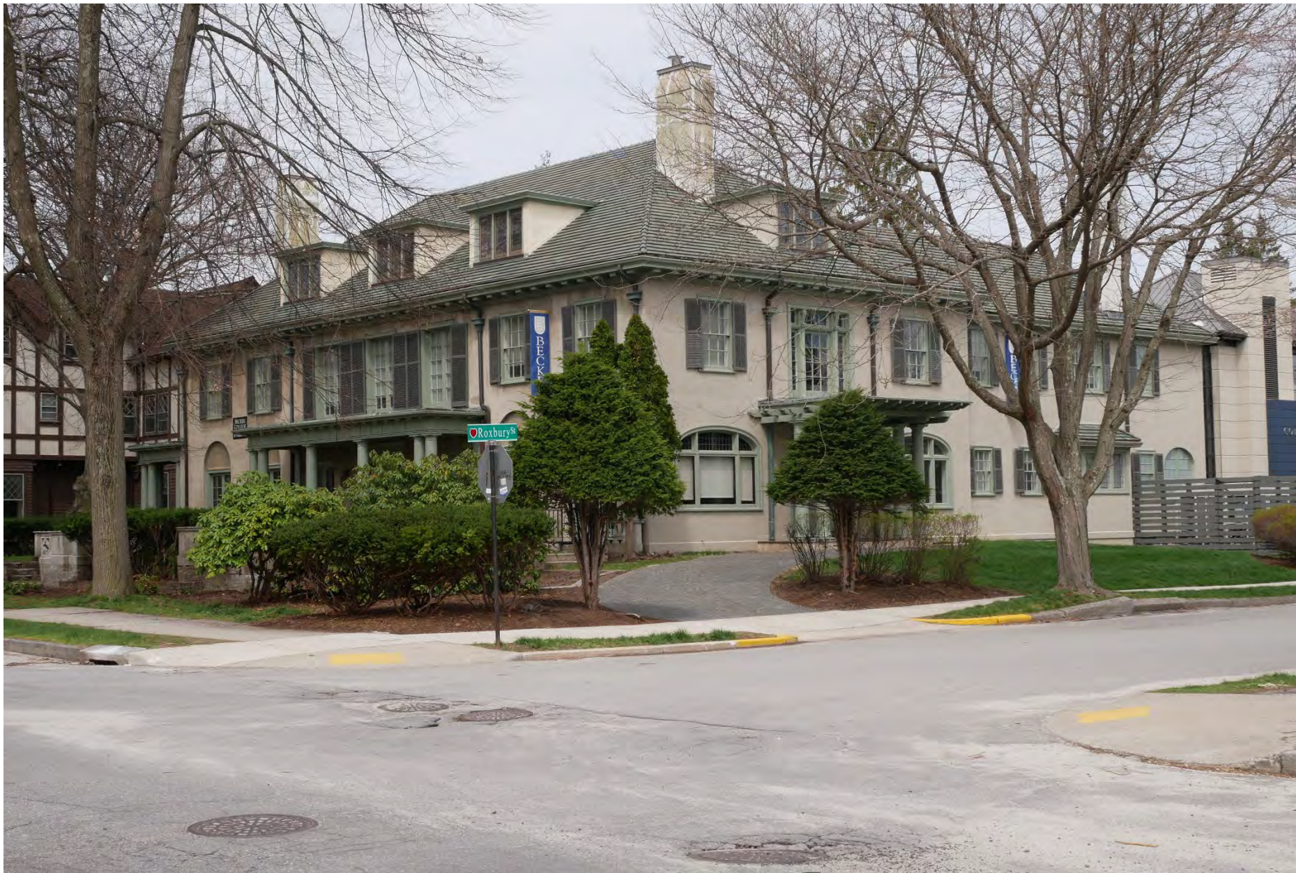
183. 80 William Street, looking northwest from William Street. Integrity rating: excellent