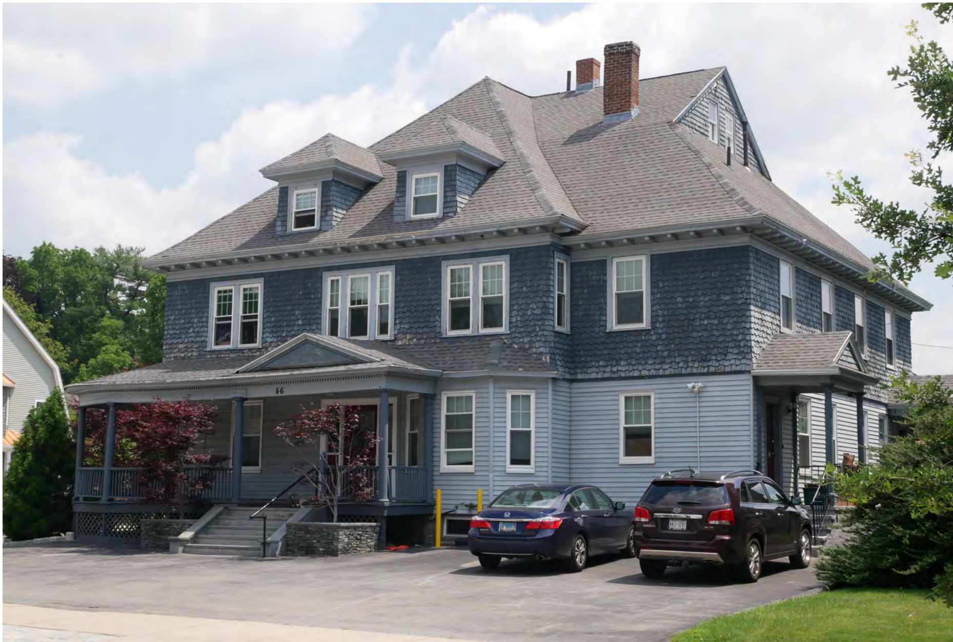
109. 46 Roxbury Street, looking northeast. Integrity rating: good