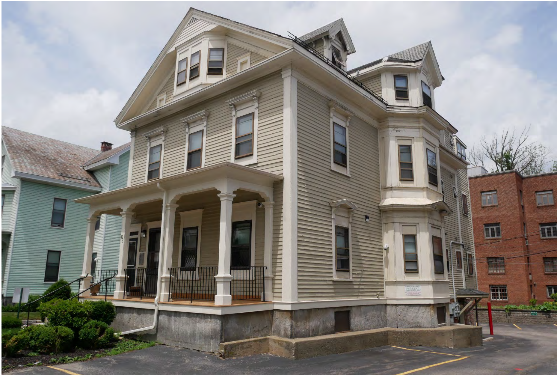
29. 83 Elm Street, looking northwest. Integrity rating: very good