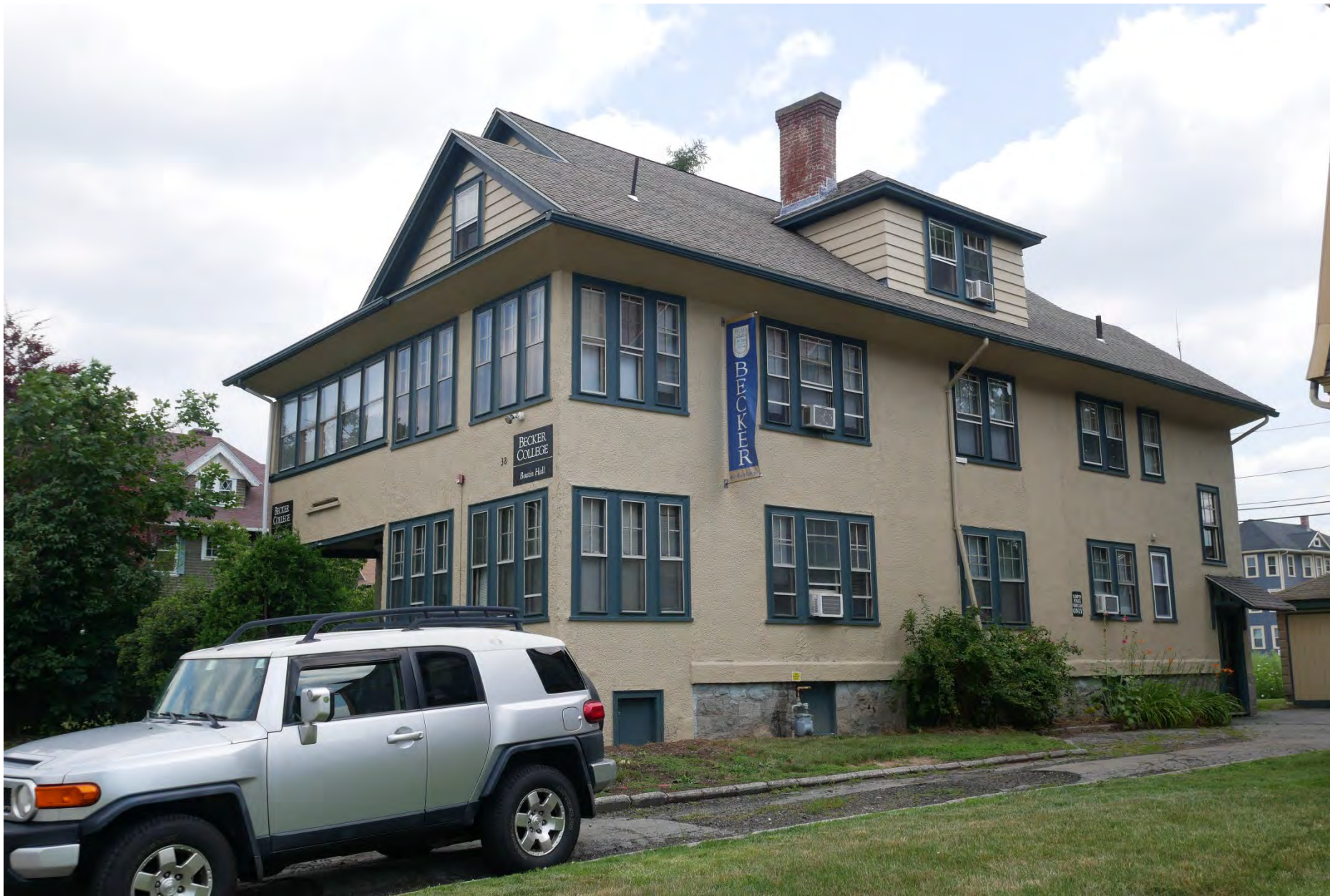
106. 40 (AKA 38) Roxbury Street, looking northeast. Integrity rating: good