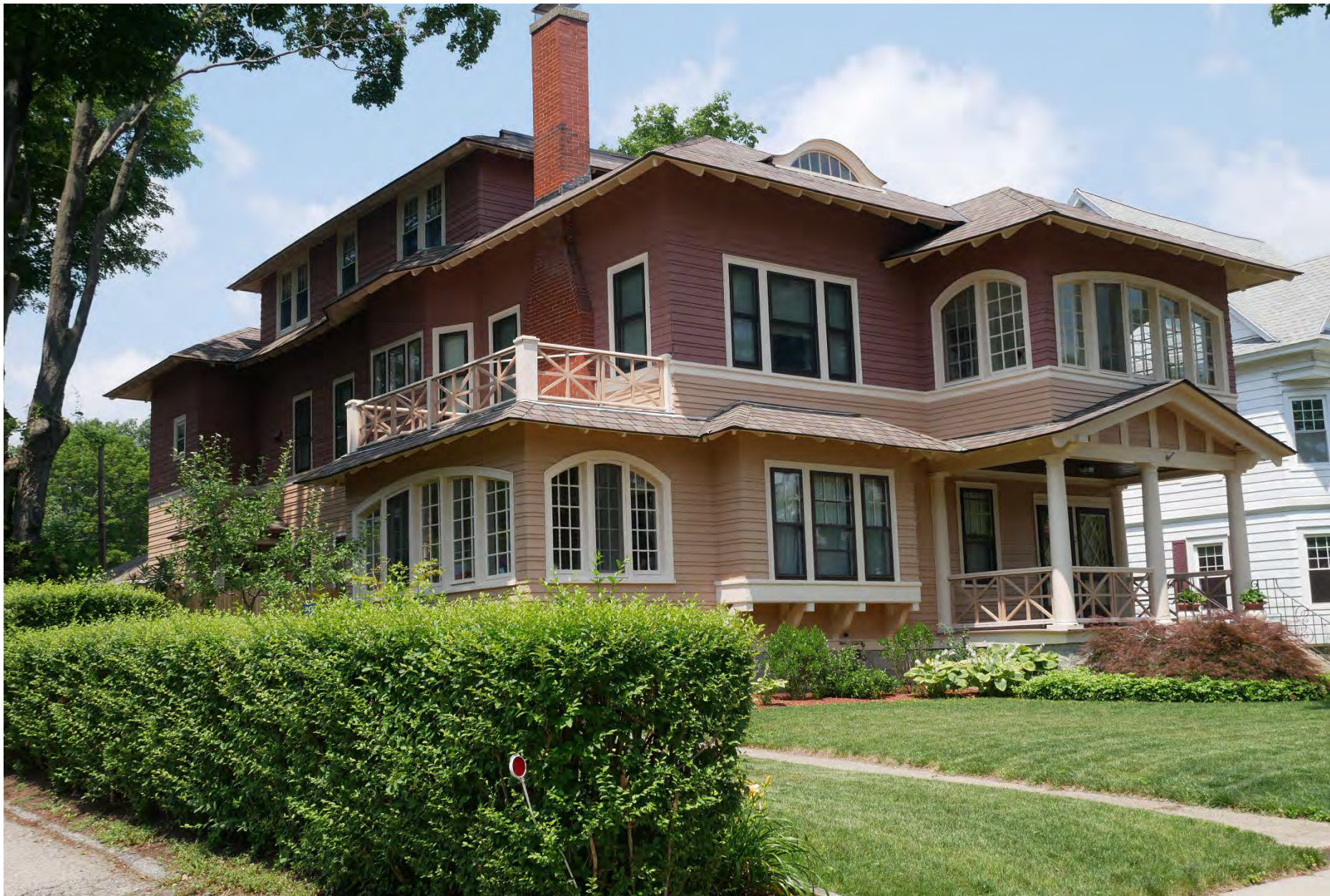
143. 15 Somerset Street, looking northwest. Integrity rating: very good