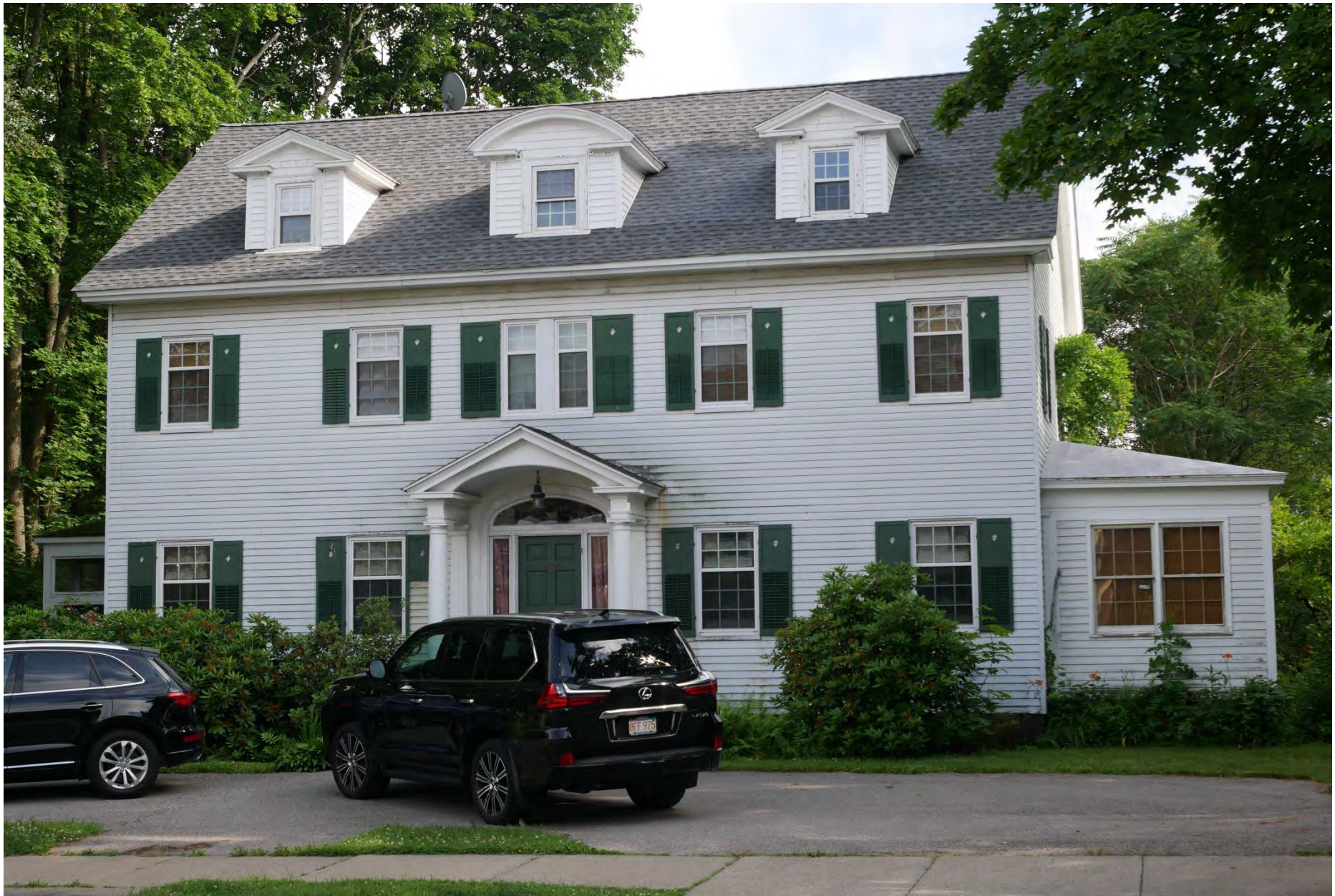
181. 75 William Street, looking south. Integrity rating: good