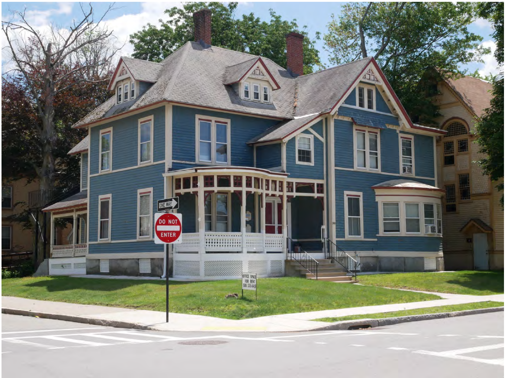
129. 30 Sever Street, looking southeast. Integrity rating: very good