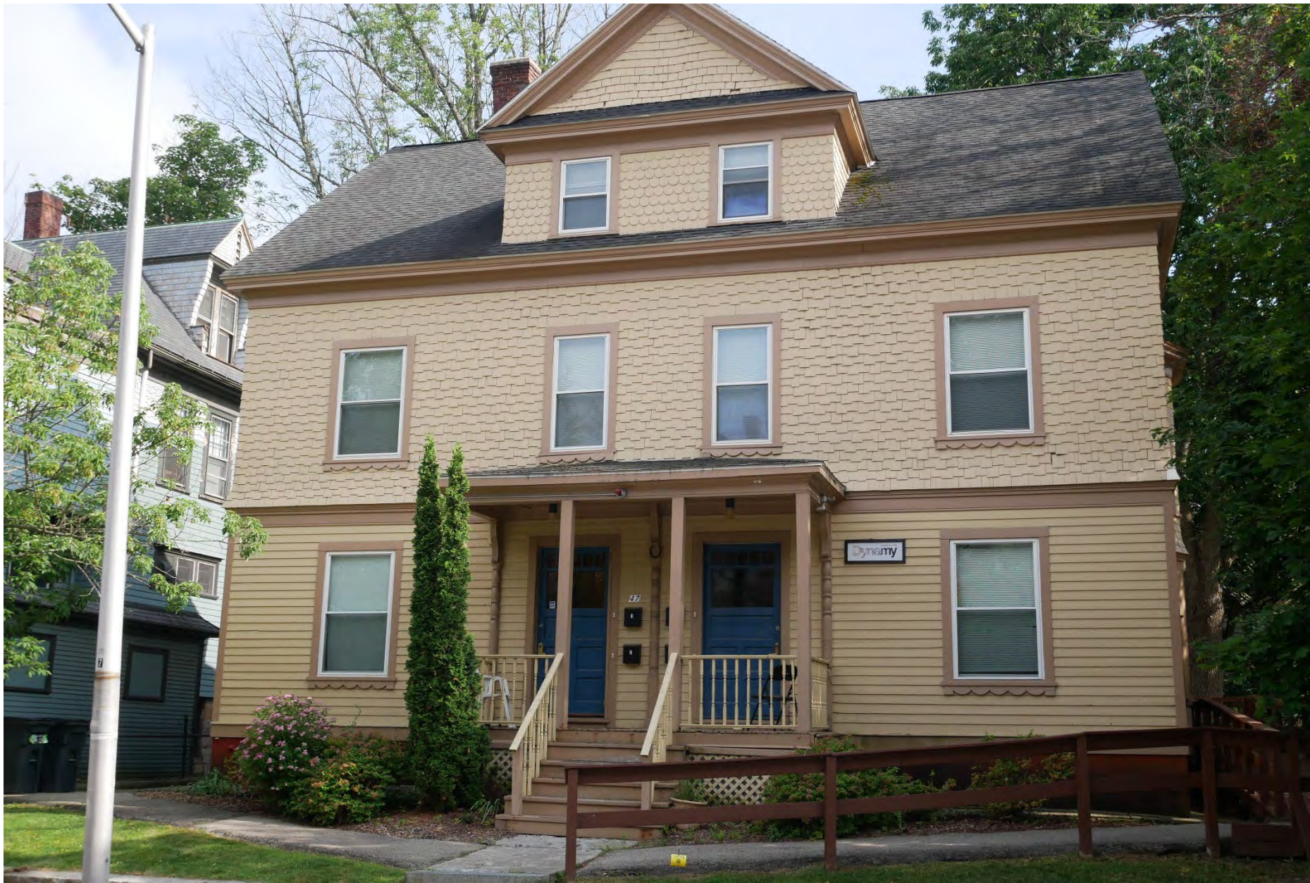
10. 47 Cedar Street, looking southwest. Integrity rating: very good