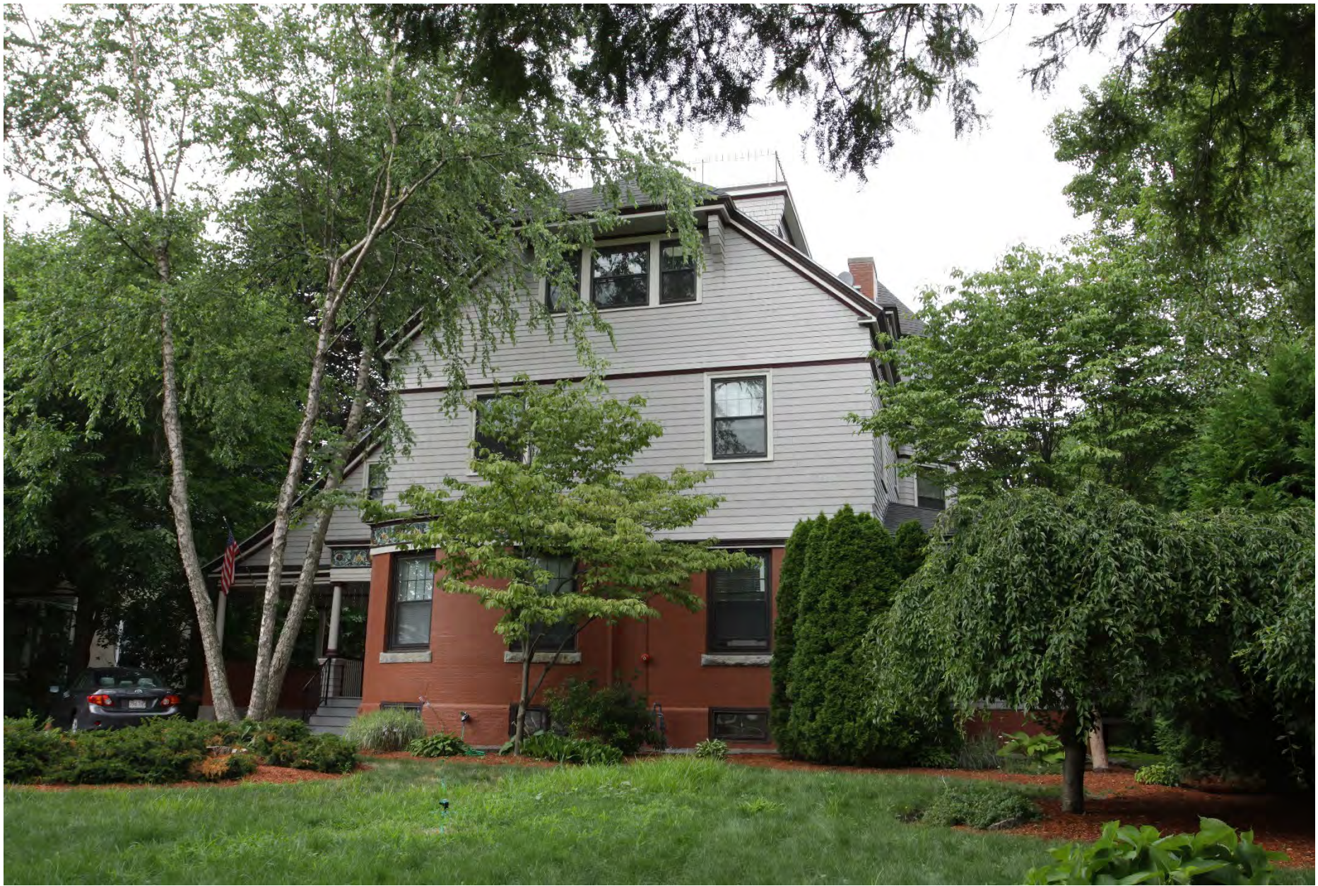
21. 62 Cedar Street, looking northwest. Integrity rating: very good