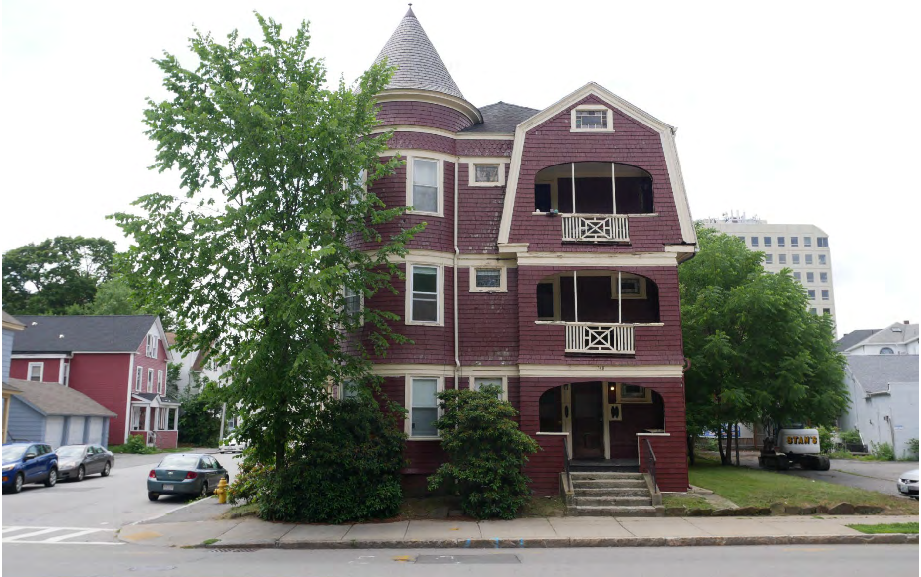
59. 148 Elm Street, looking south. Integrity rating: very good