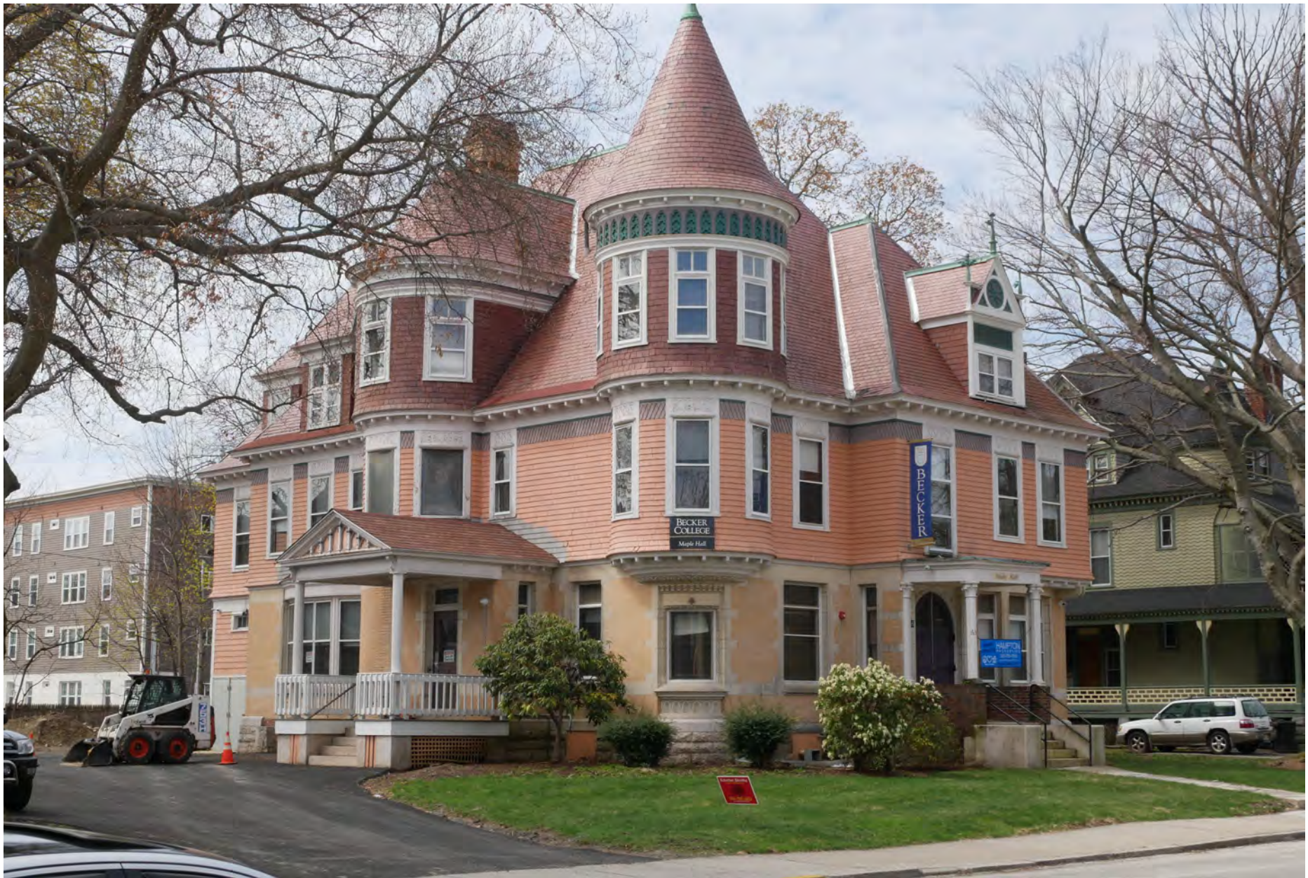
23. 65 Cedar Street, looking southwest. Integrity rating: very good