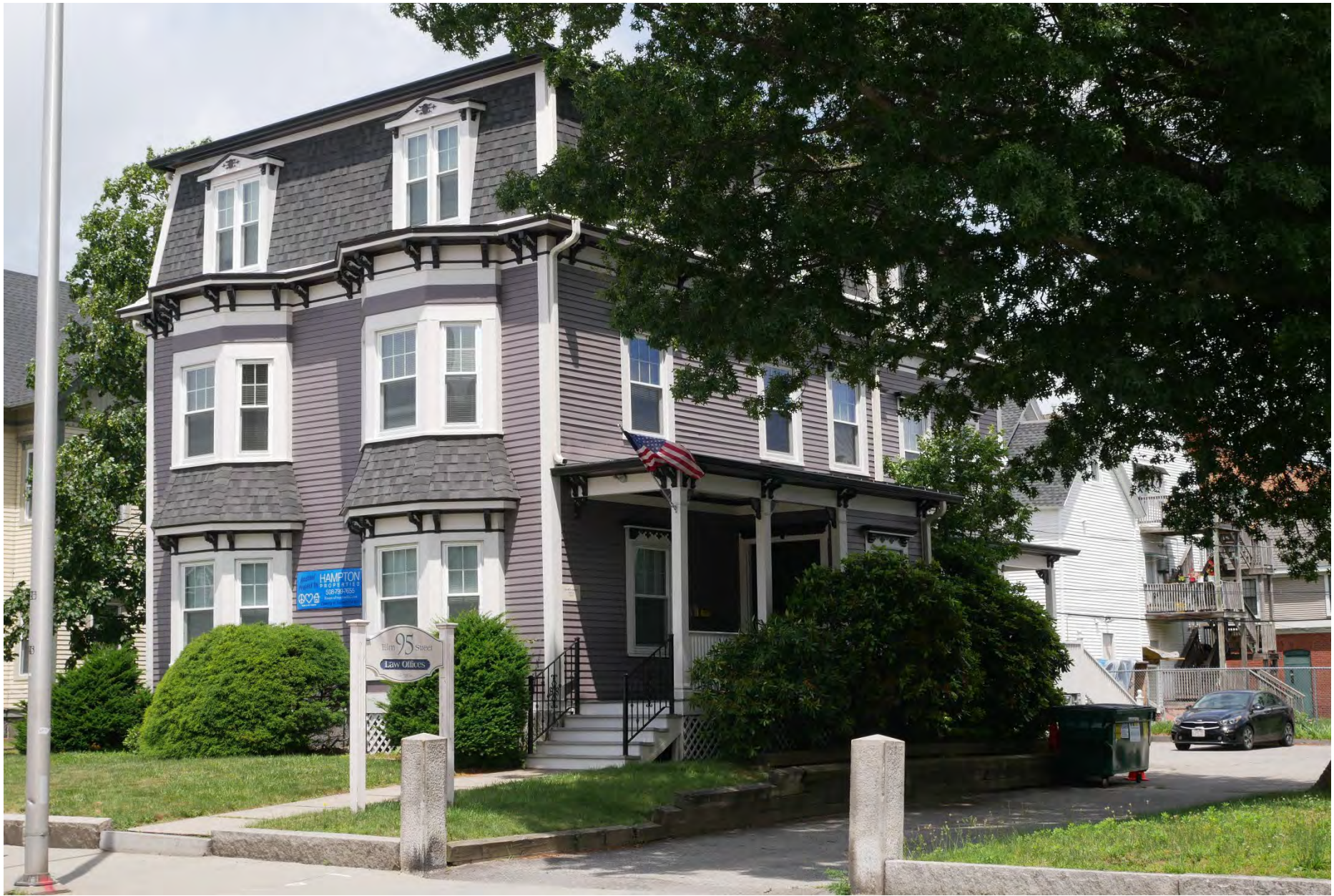
35. 95 Elm Street, looking northwest. Integrity rating: very good