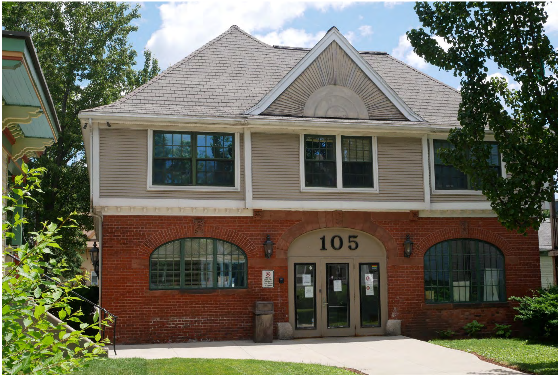
92. 105 Merrick Street, looking southeast. Integrity rating: good