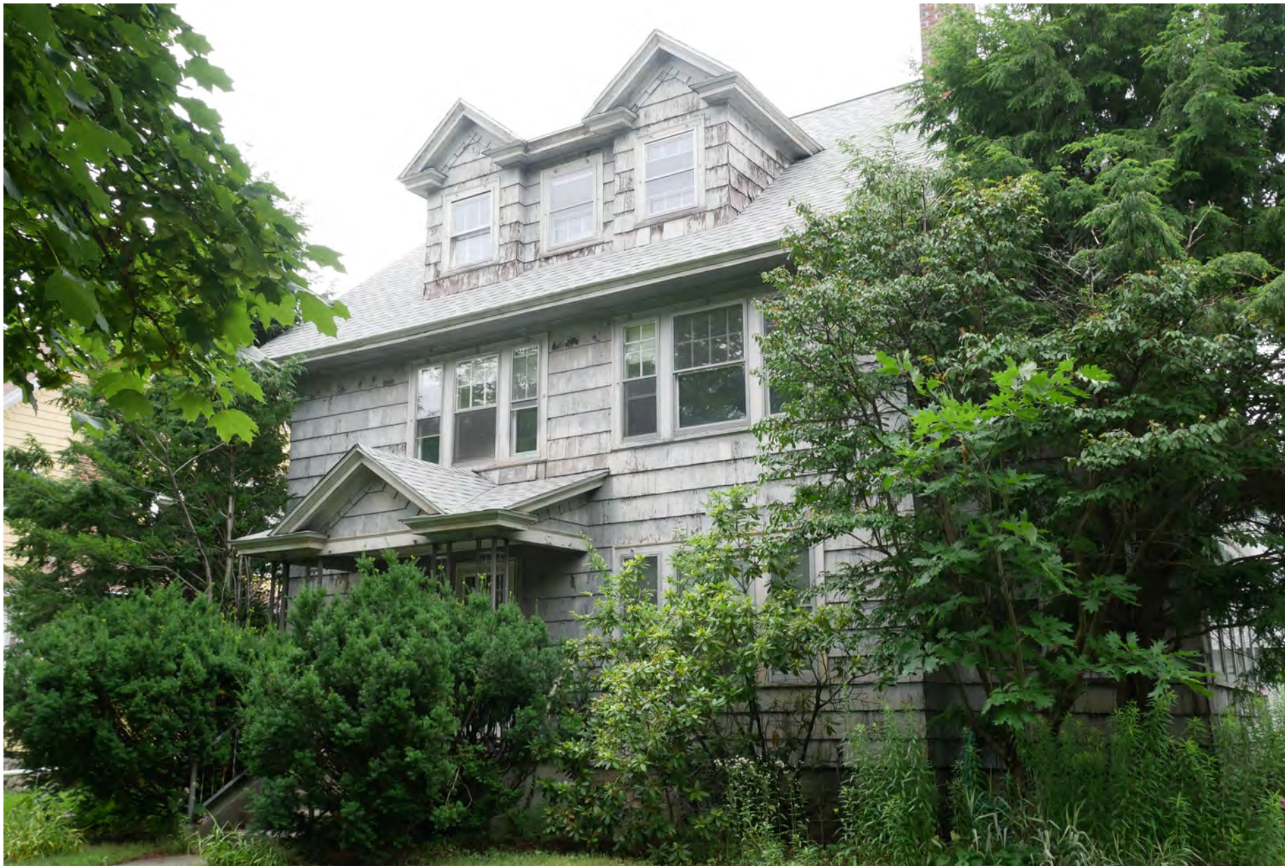
122. 160 Russell Street, looking northeast. Integrity rating: very good