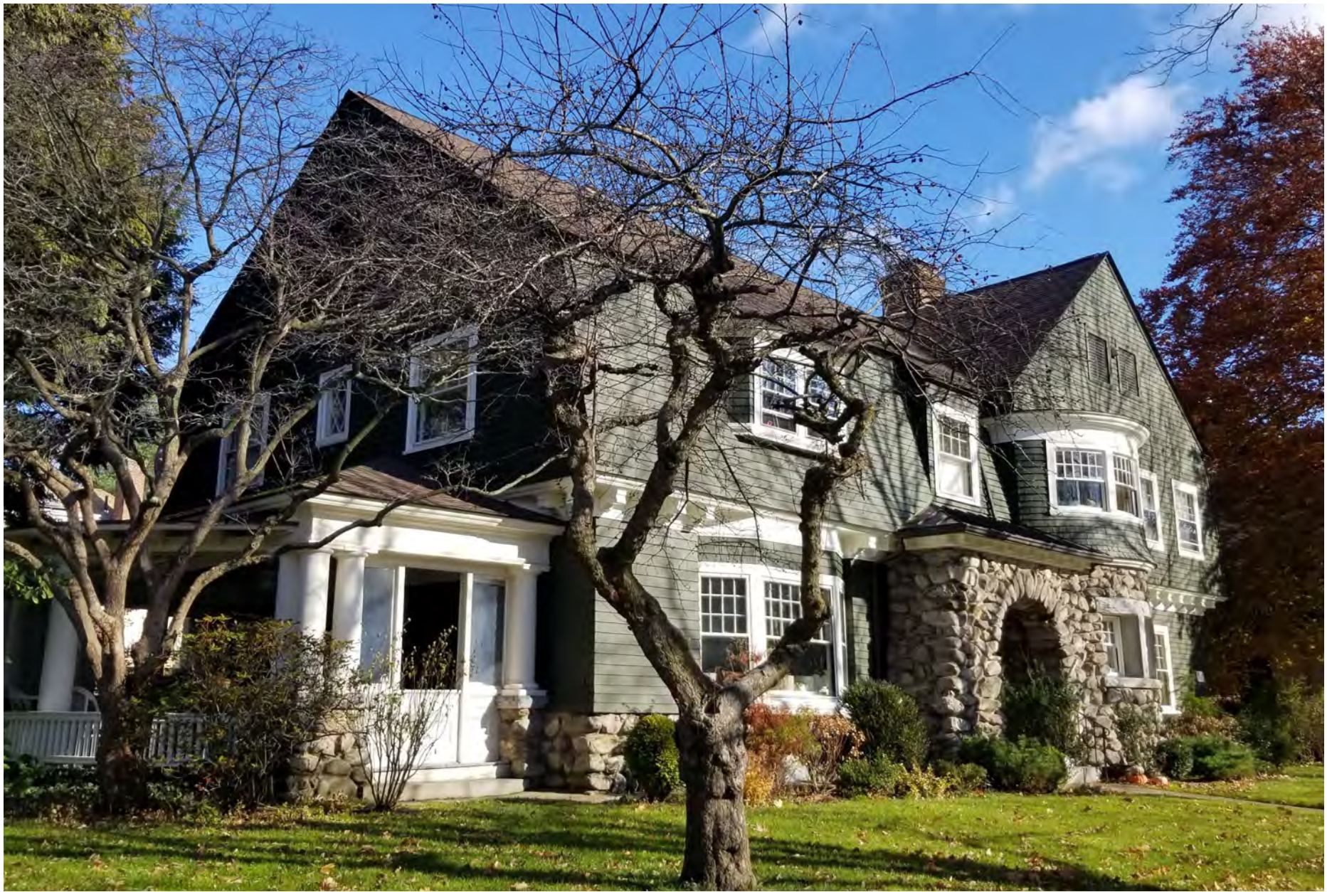
192. 98 William Street, looking northeast. Integrity rating: very good