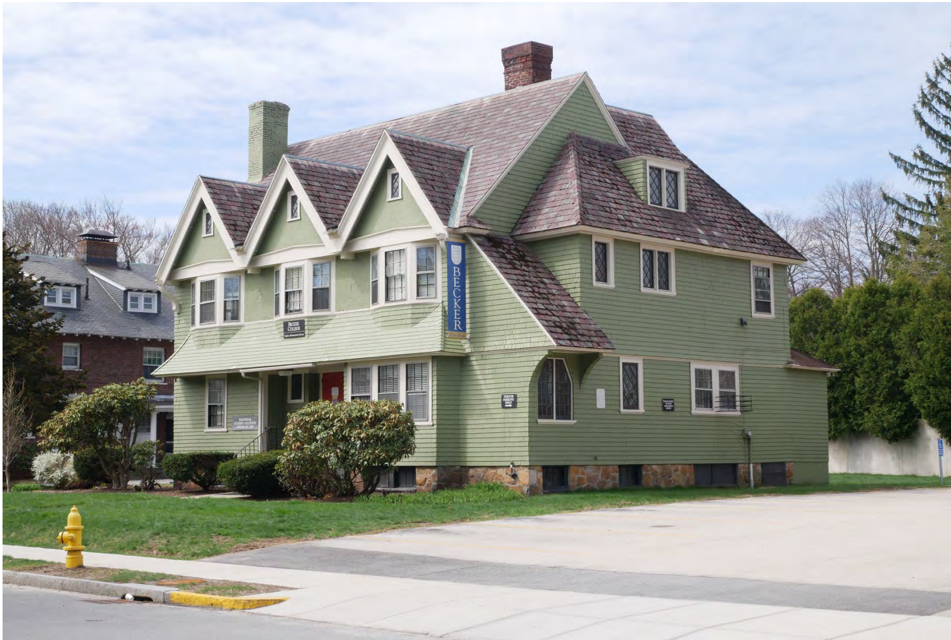
133. 47 Sever Street, looking southwest. Integrity rating: excellent