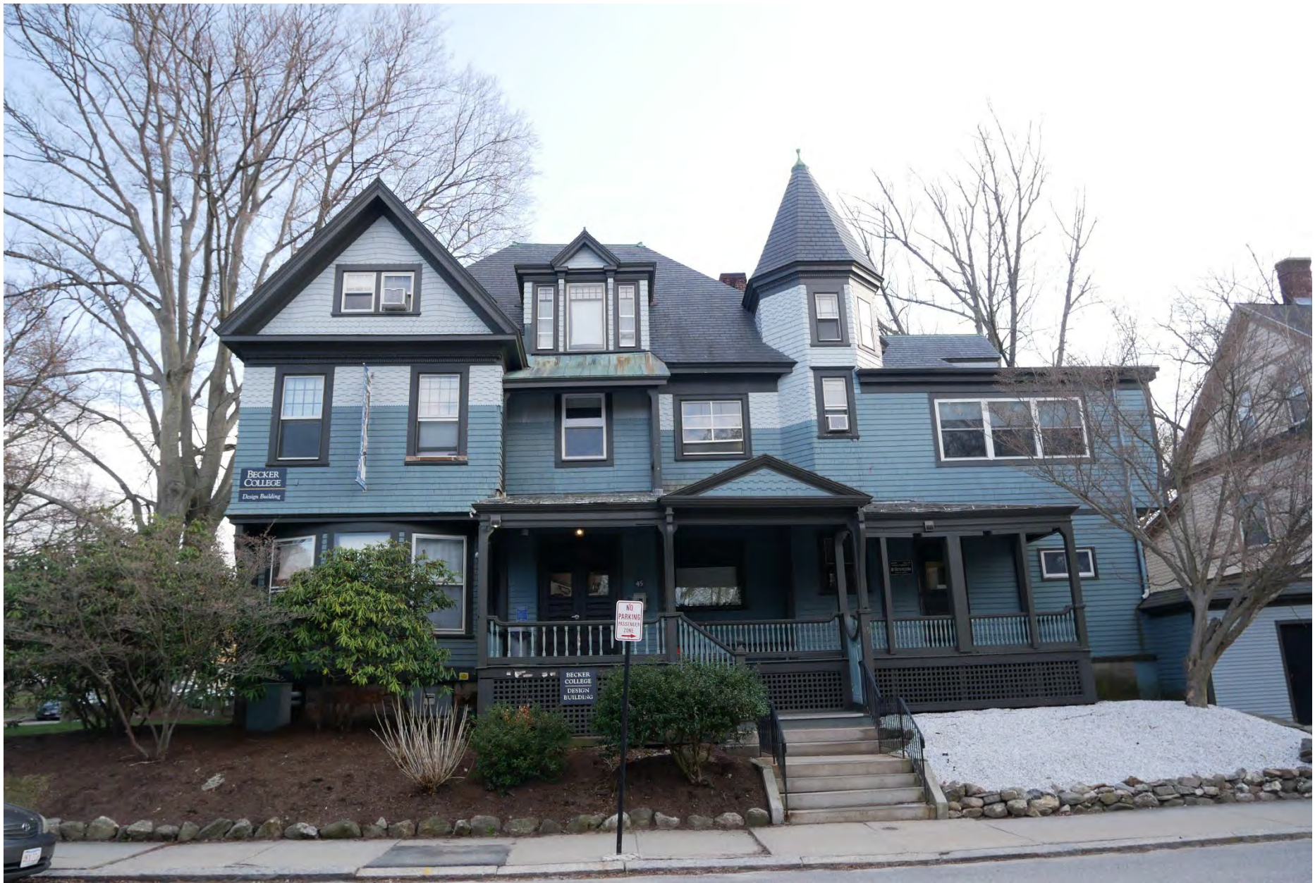
9. 45 Cedar Street, looking south. Integrity rating: excellent