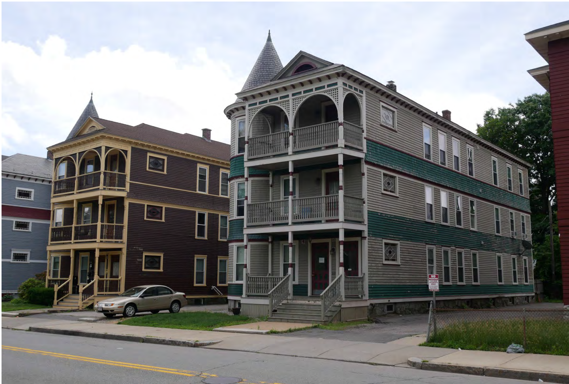
56. 142 (R) Elm Street, looking southeast. Integrity rating: very good