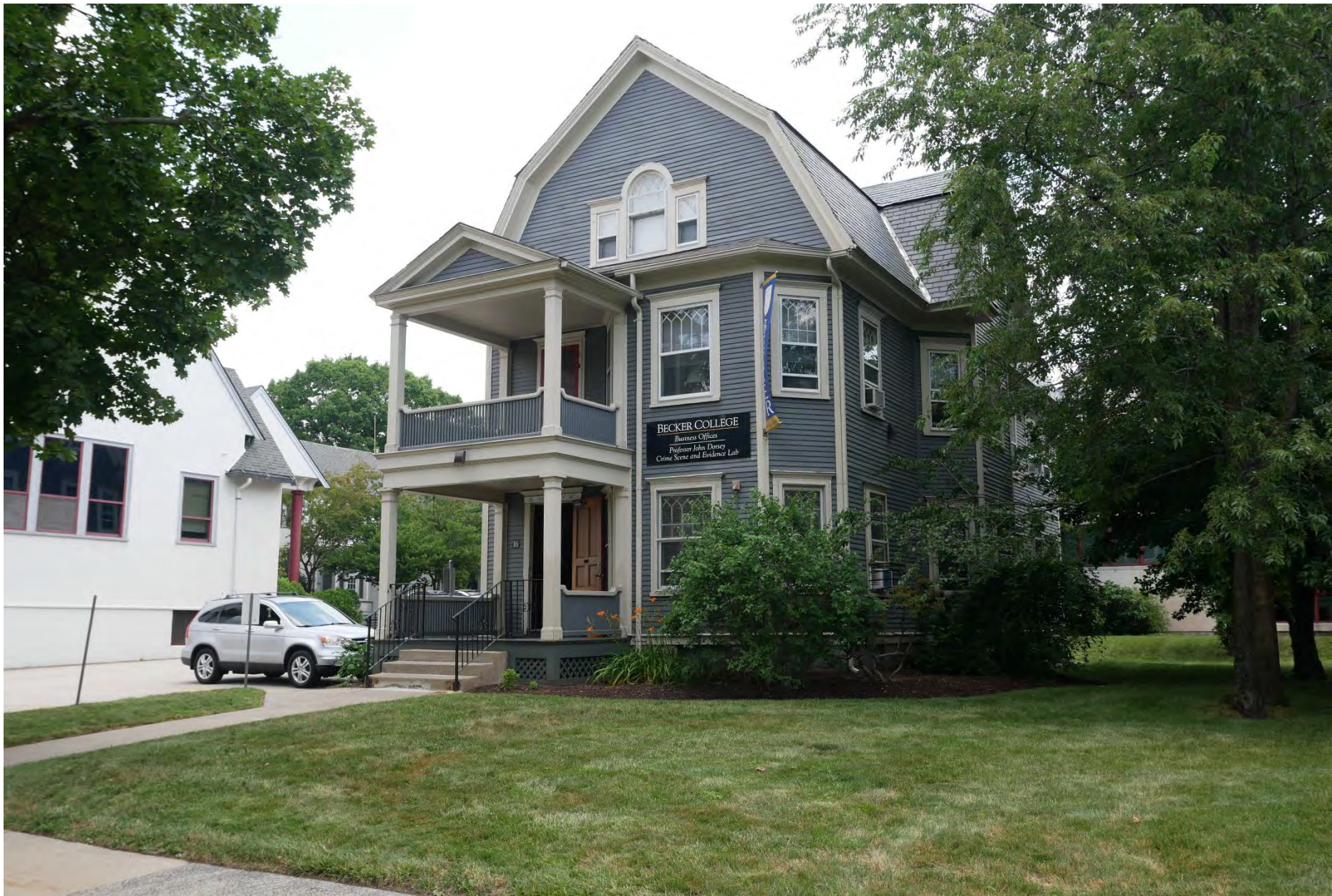
95. 16 Roxbury Street, looking northeast. Integrity rating: excellent