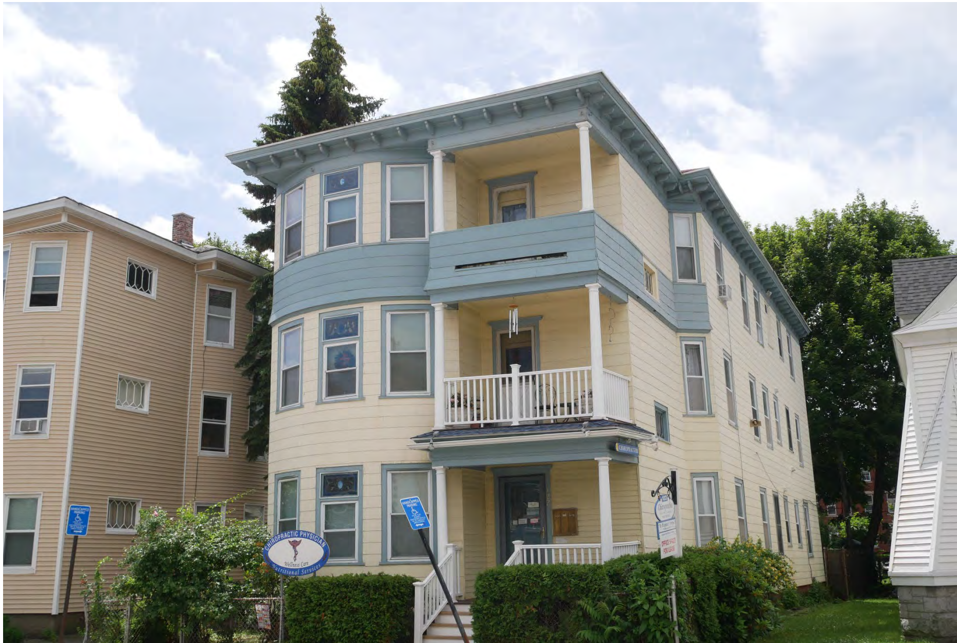
48. 122 Elm Street, looking southeast. Integrity rating: good