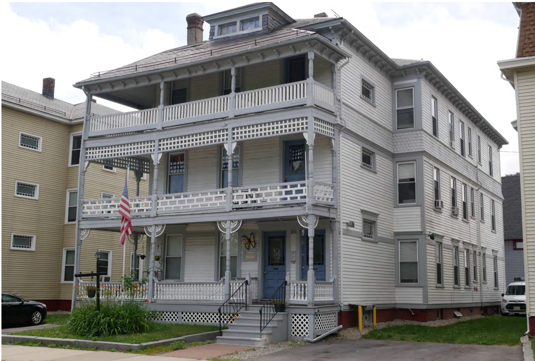
52. 134 Elm Street, looking southeast. Integrity rating: very good