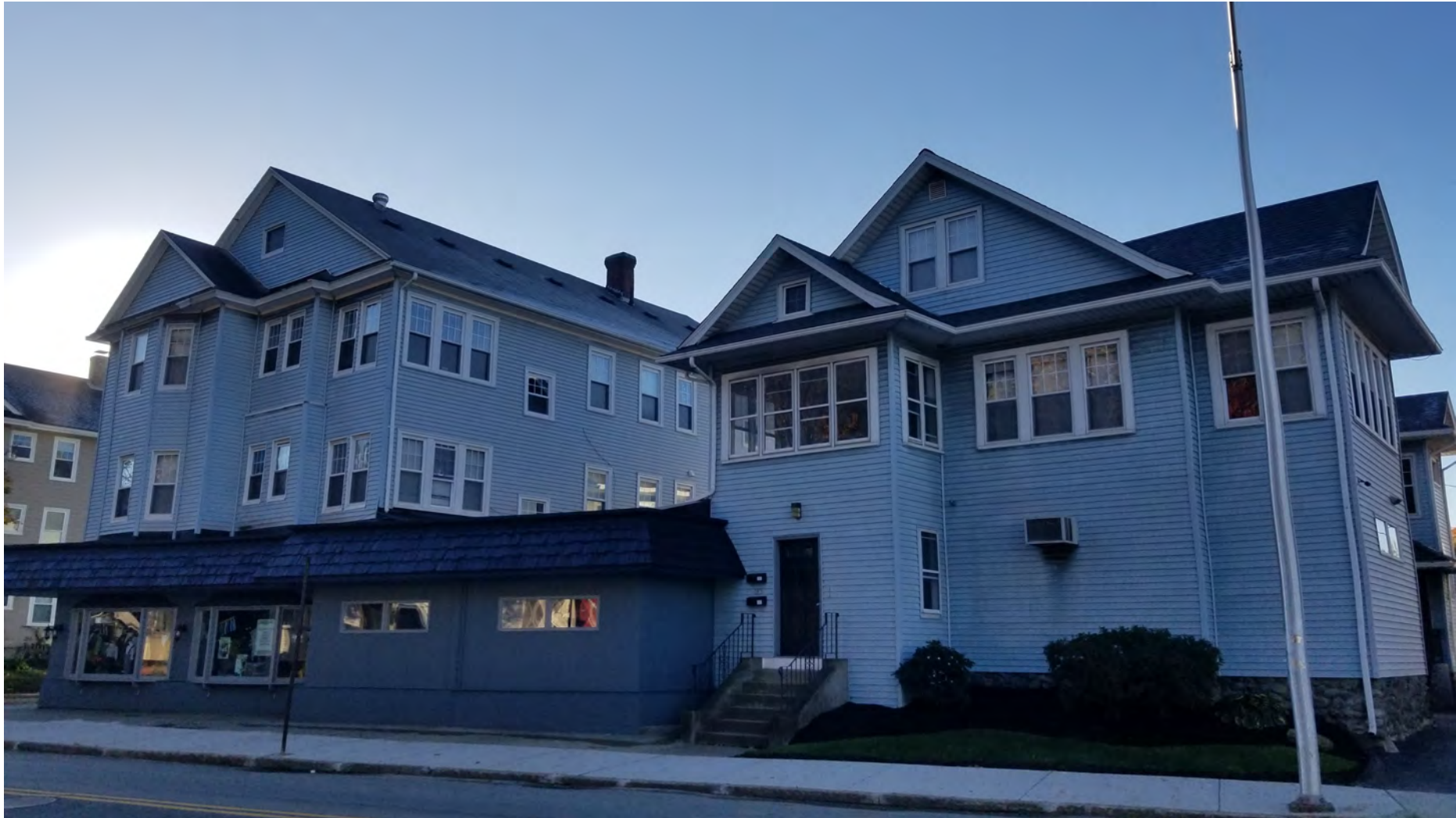
81. 179–185 Highland Street, looking southeast. Integrity rating: poor