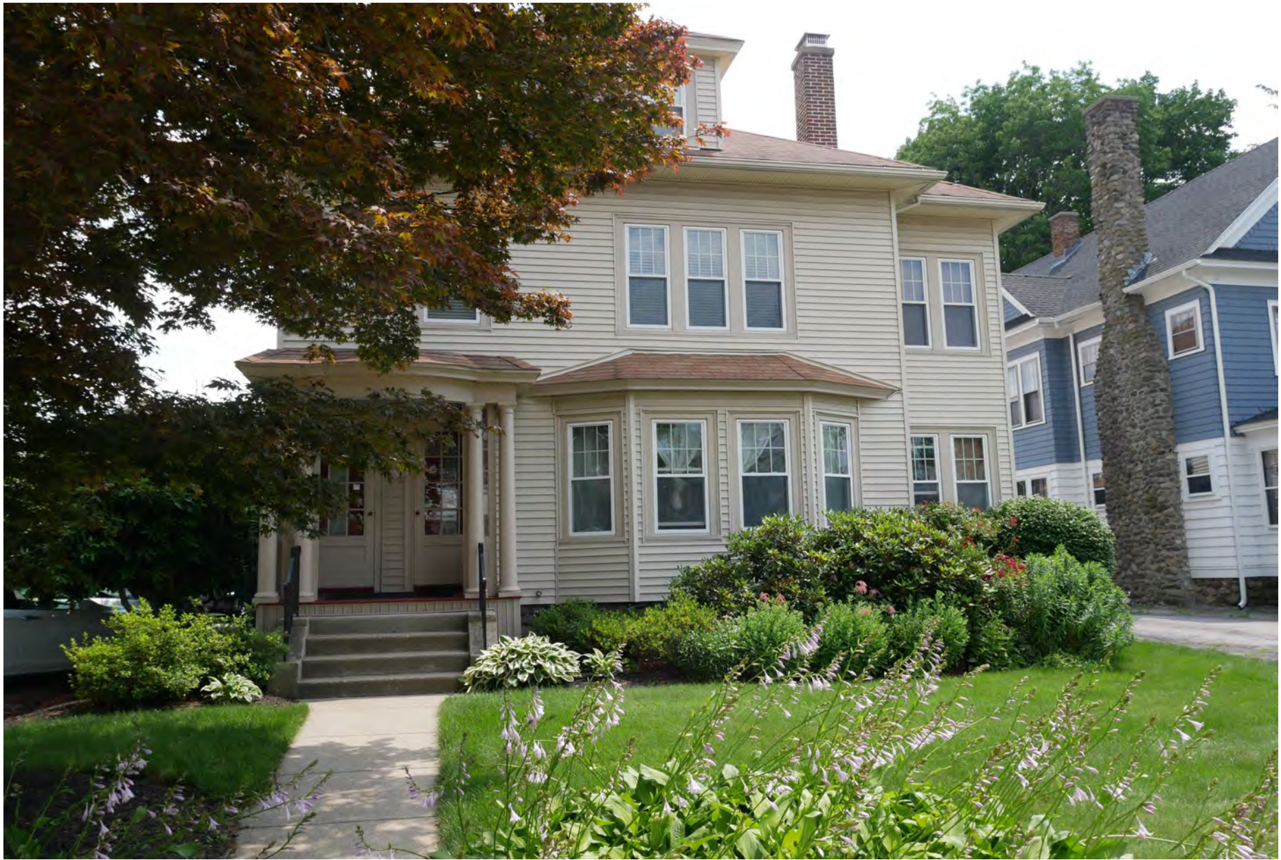
156. 34 Somerset Street, looking east. Integrity rating: fair