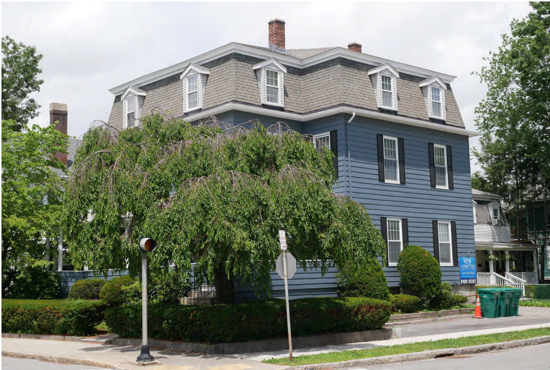
32. 91 Elm Street, looking northwest. Integrity rating: good