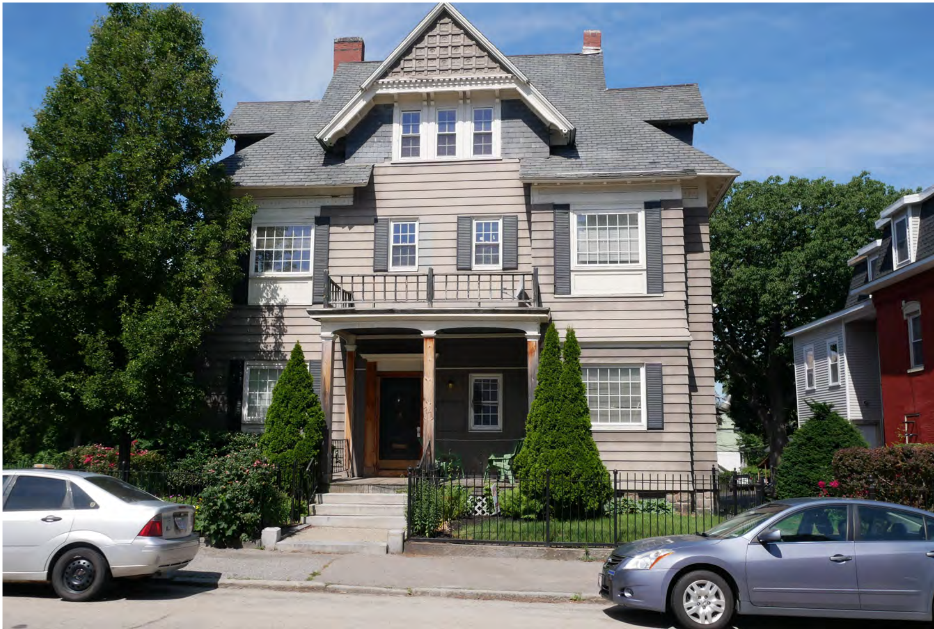
168. 72 West Street, looking west. Integrity rating: fair