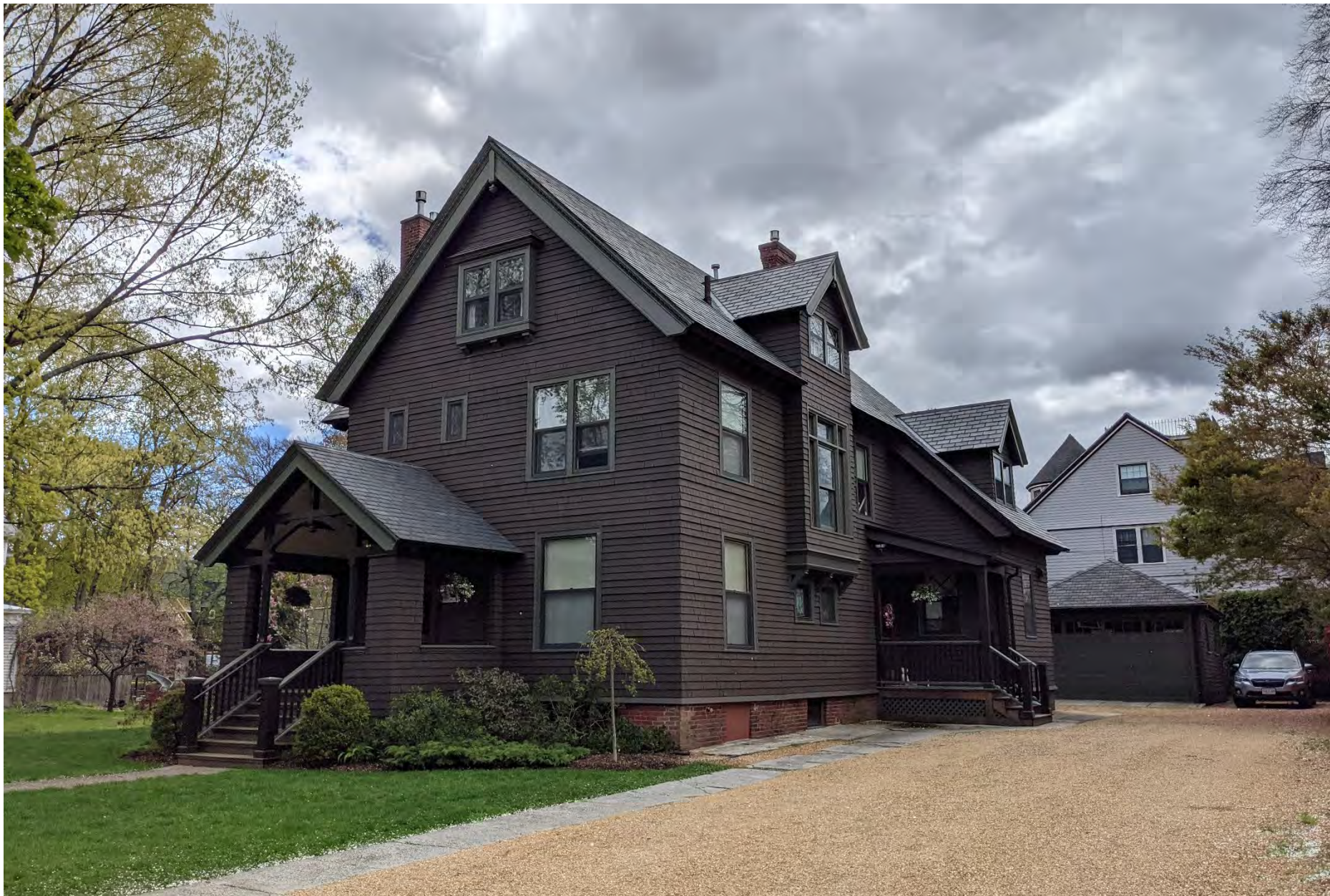
182. 79 William Street, house and garage, looking southeast. Integrity rating: very good