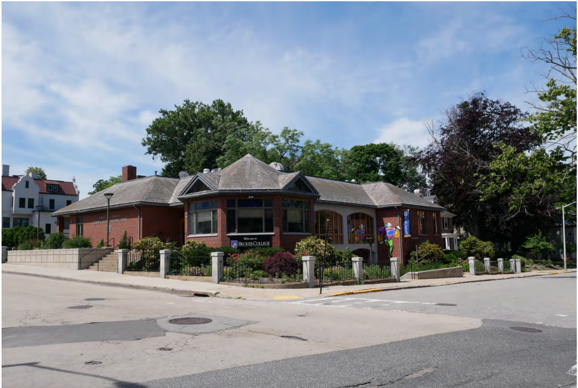
164. 44 West Street, looking southwest. Integrity rating: excellent (non-historic)