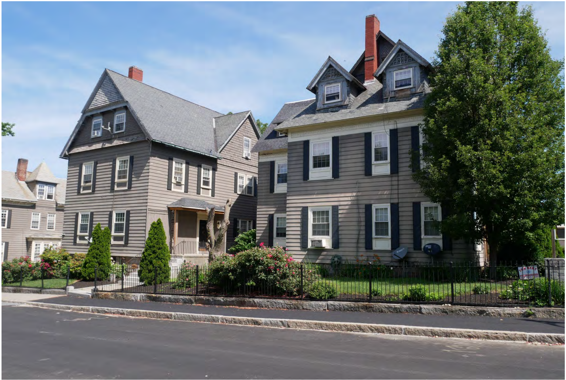
169. 48 William Street (L) and 72 West Street (R), looking northwest. Integrity rating: Good, Fair