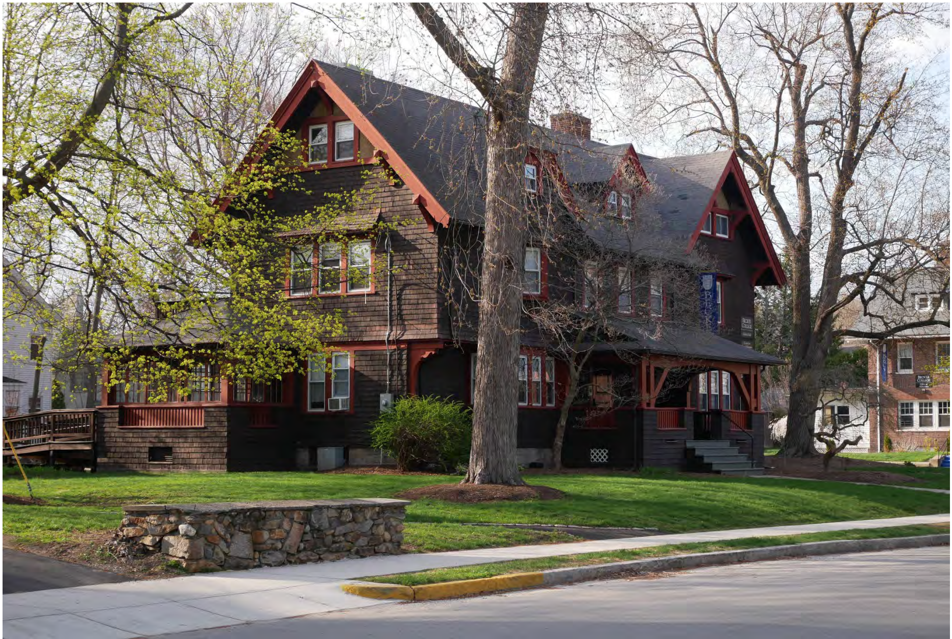
132. 41 Sever Street, looking northwest. Integrity rating: very good