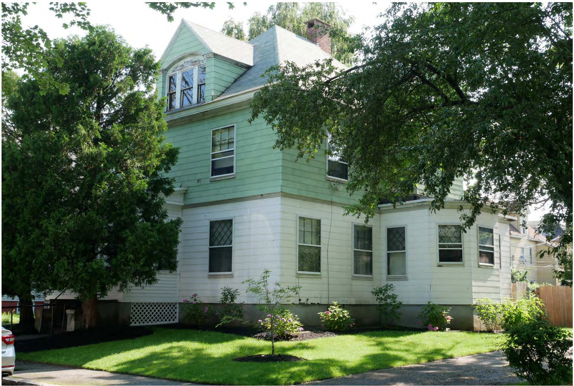
71. 42 Fruit Street, looking northeast. Integrity rating: fair