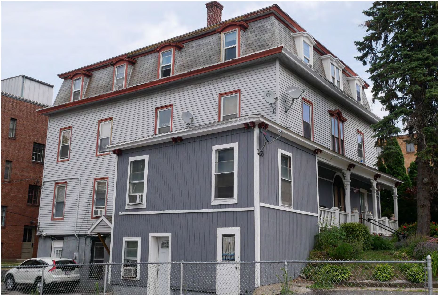
28. 81 Elm Street, looking northeast. Integrity rating: fair