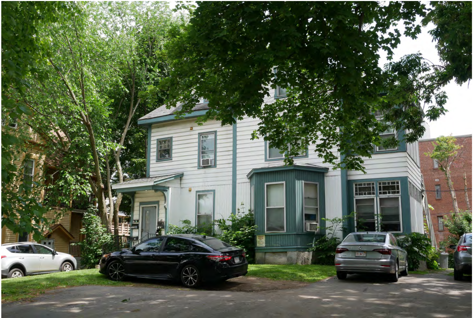
125. 26 Sever Street, looking northeast. Integrity rating: good