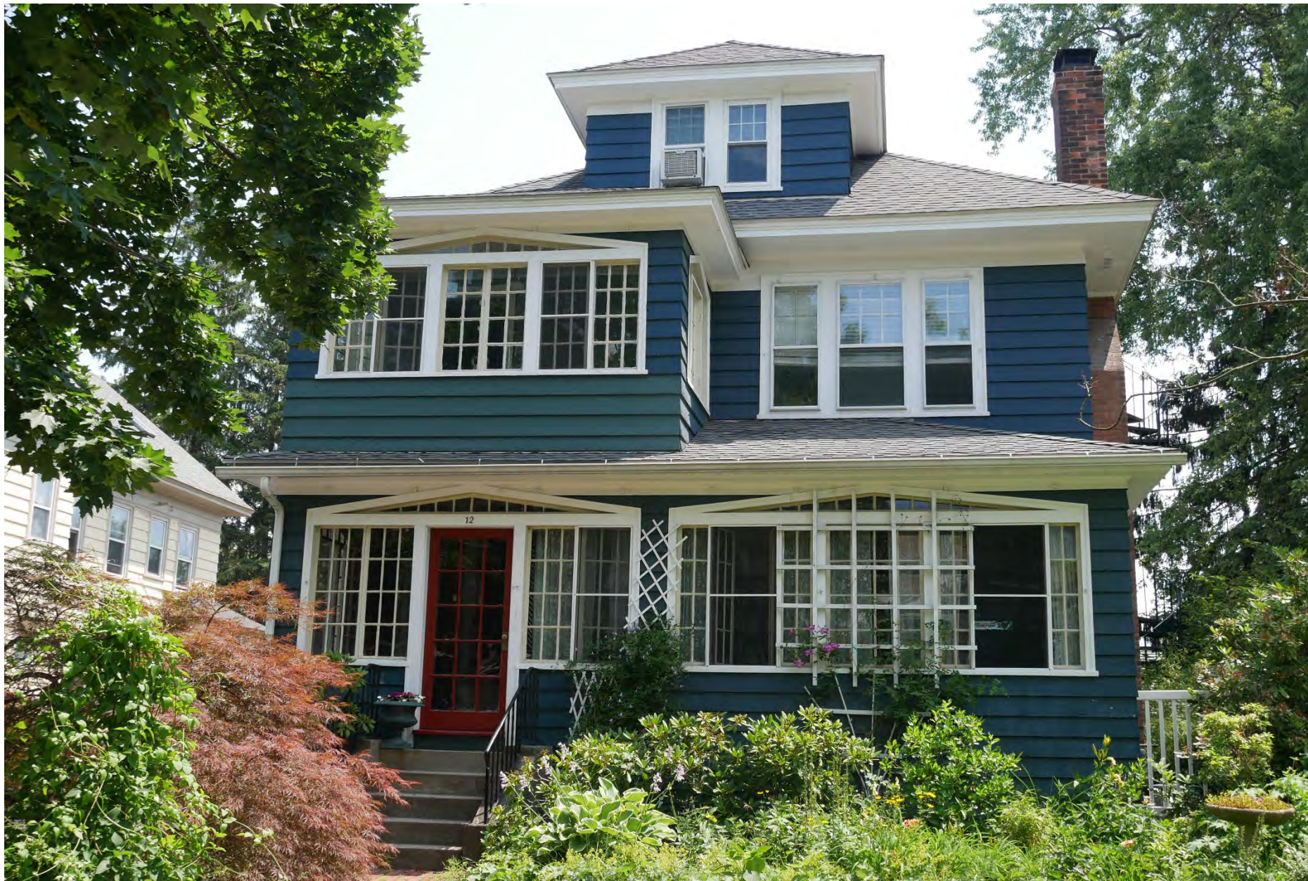
142. 12 Somerset Street, looking east. Integrity rating: very good