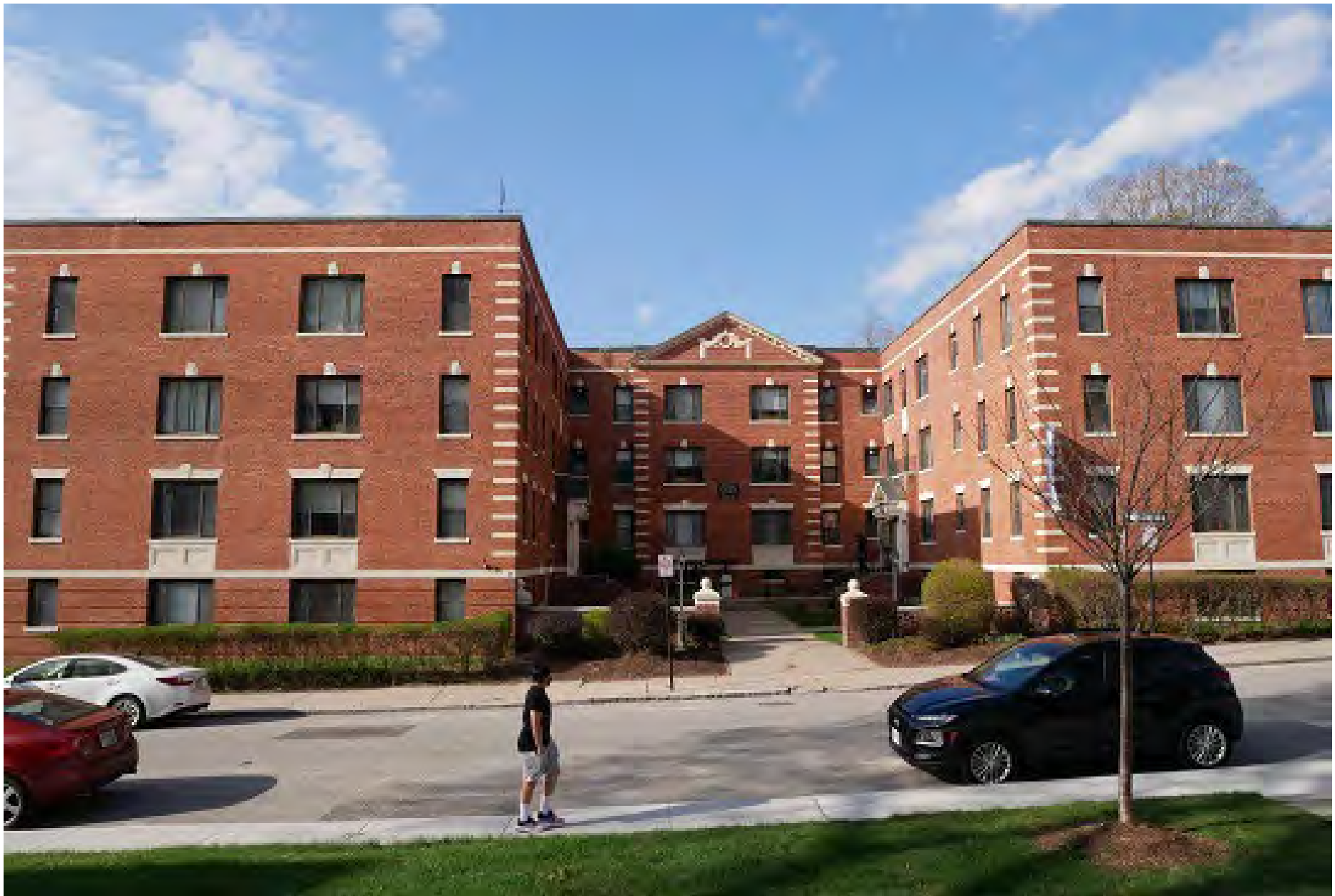
5. 38 Cedar Street, looking north. Integrity rating: very good