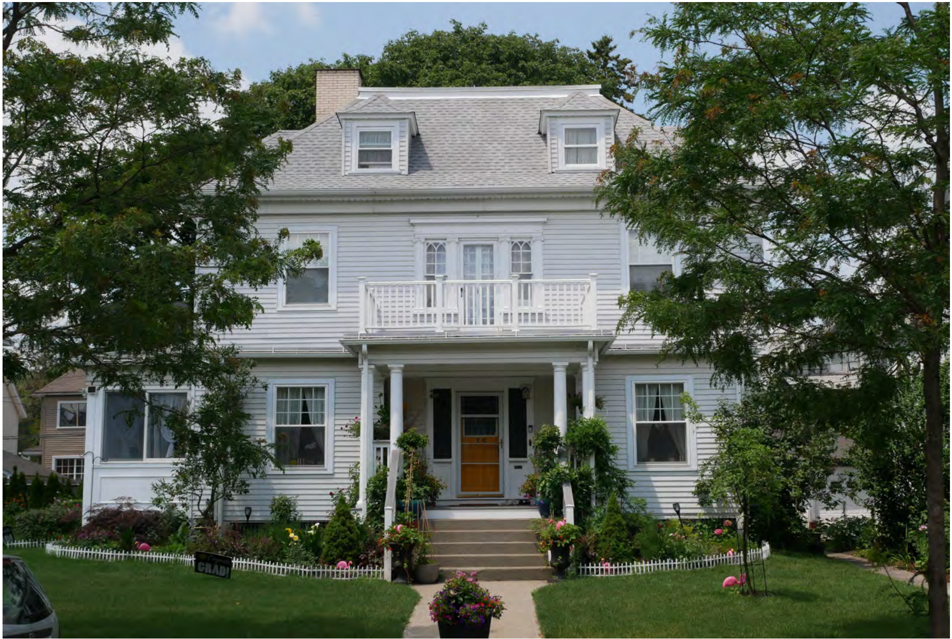
157. 35 Somerset Street, looking west. Integrity rating: good