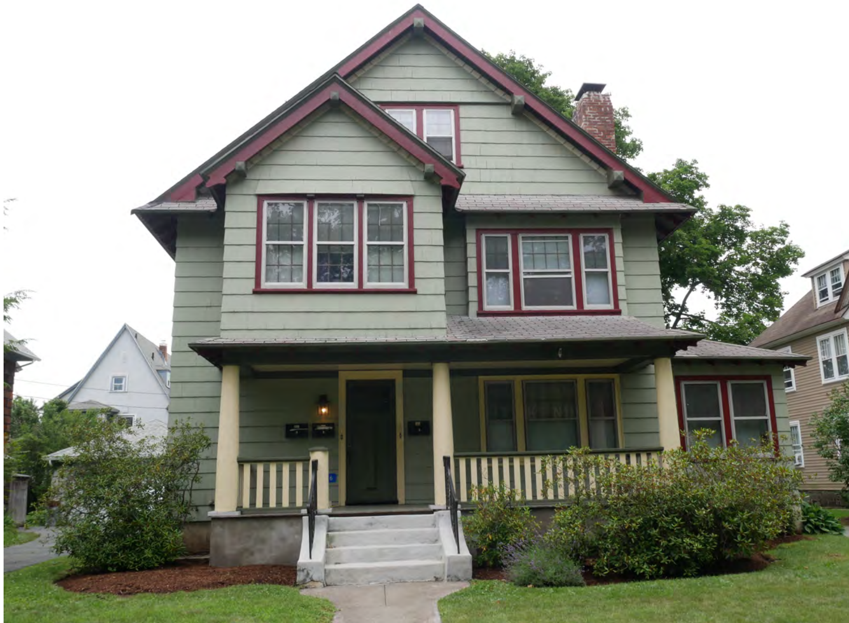
121. 156 Russell Street, looking east. Integrity rating: very good