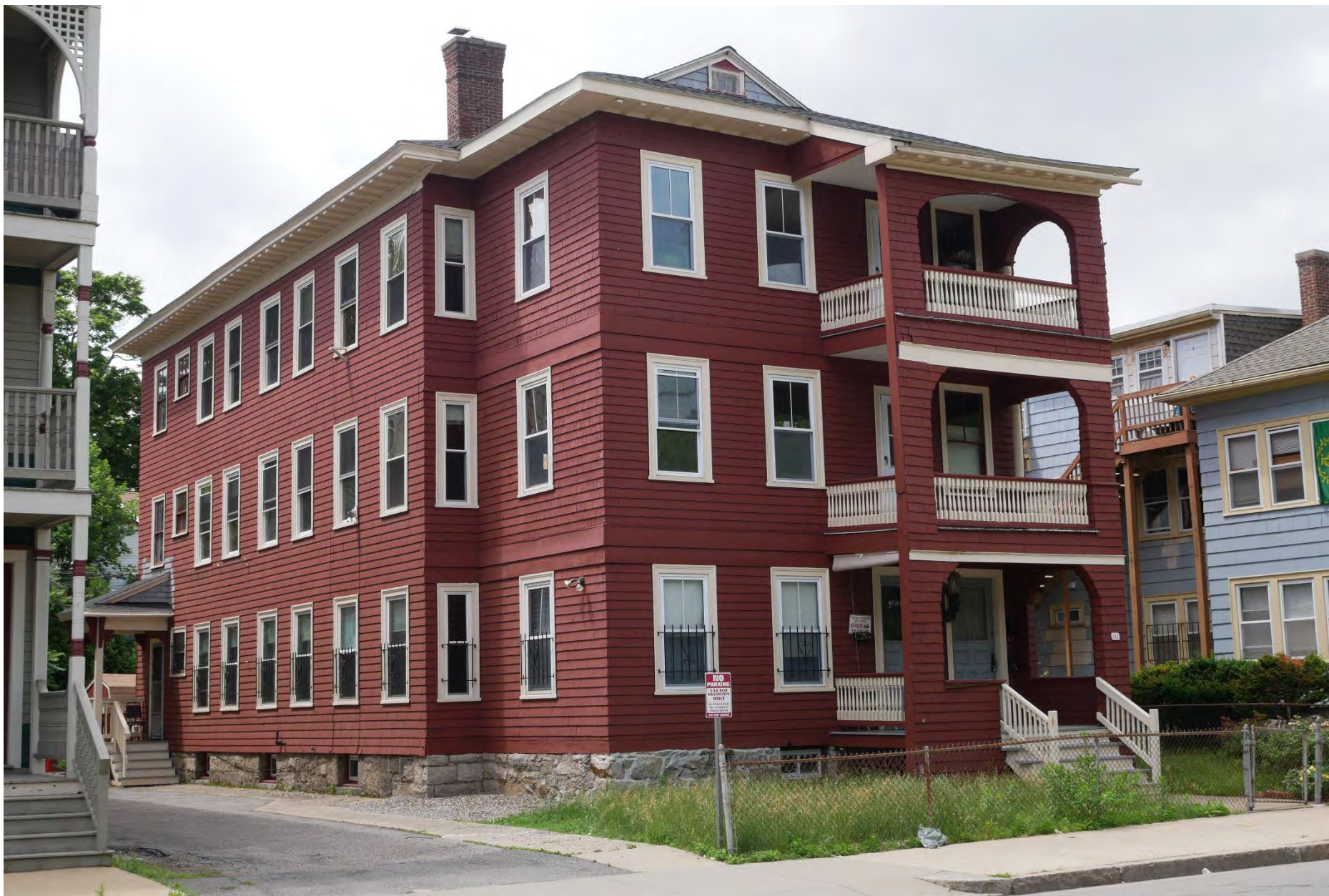
57. 144 Elm Street, looking southwest. Integrity rating: good