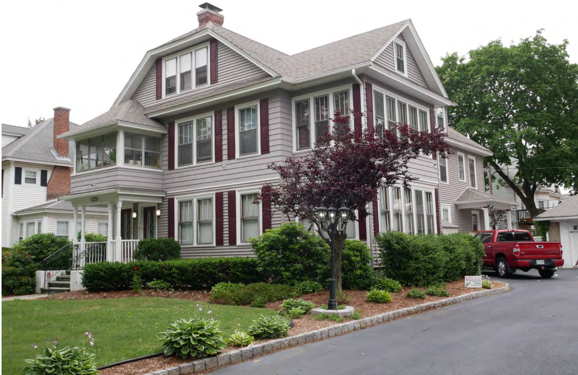
115. 132 Russell Street, house and garage, looking northeast. Integrity rating: good