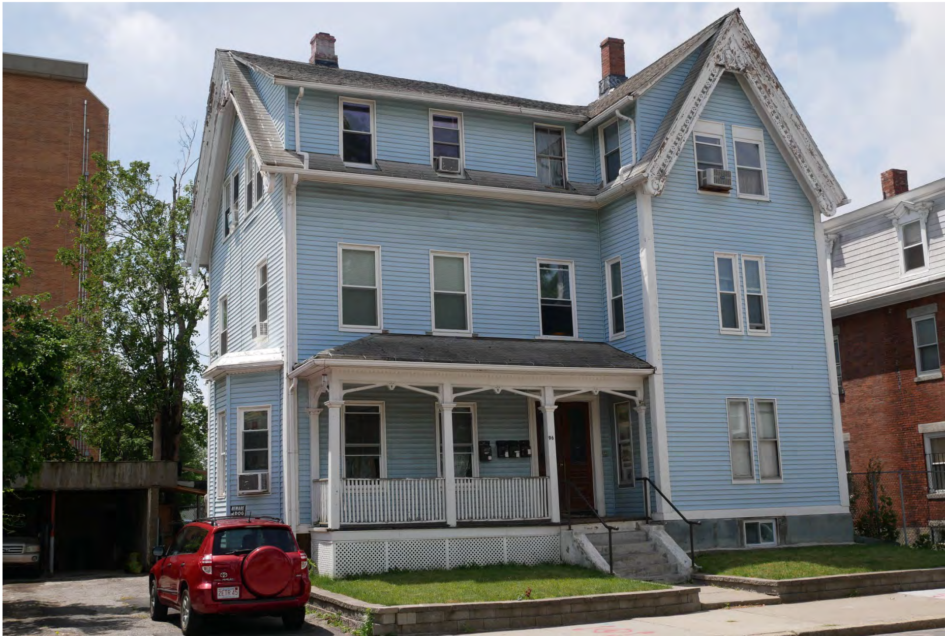
36. 96 Elm Street, looking northwest. Integrity rating: good