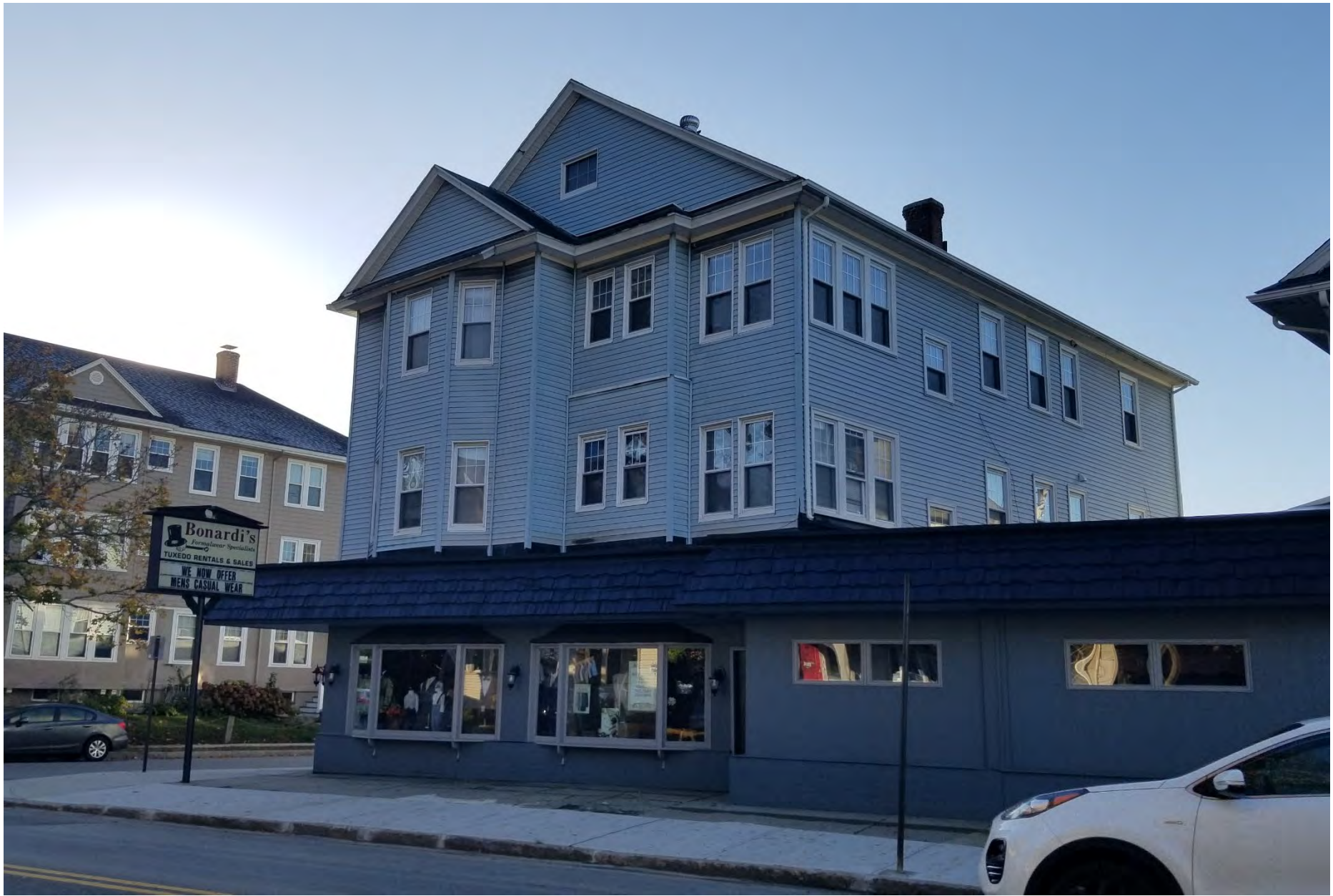
82. 179 Highland Street, looking southeast. Integrity rating: poor