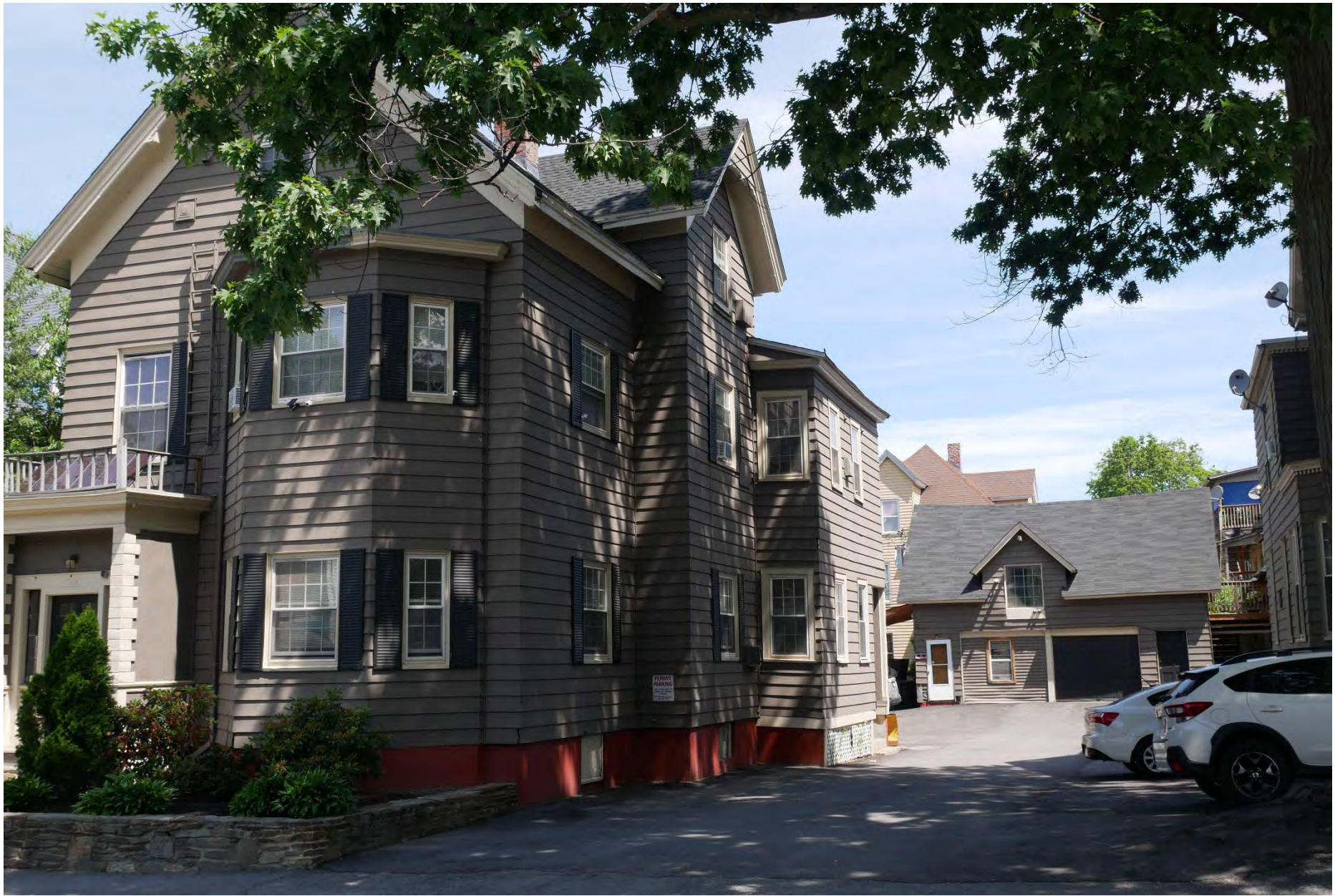
172. 52 William Street, house and carriage house, looking north. Integrity rating: good