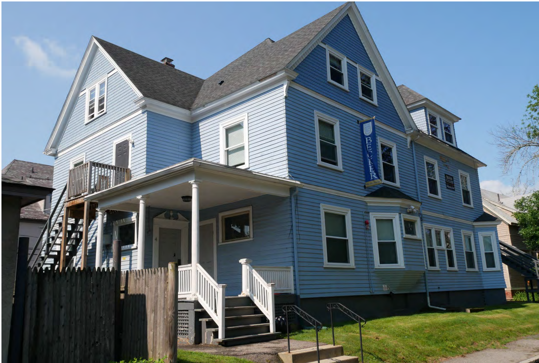
87. 4 Marston Way, looking northeast. Integrity rating: good