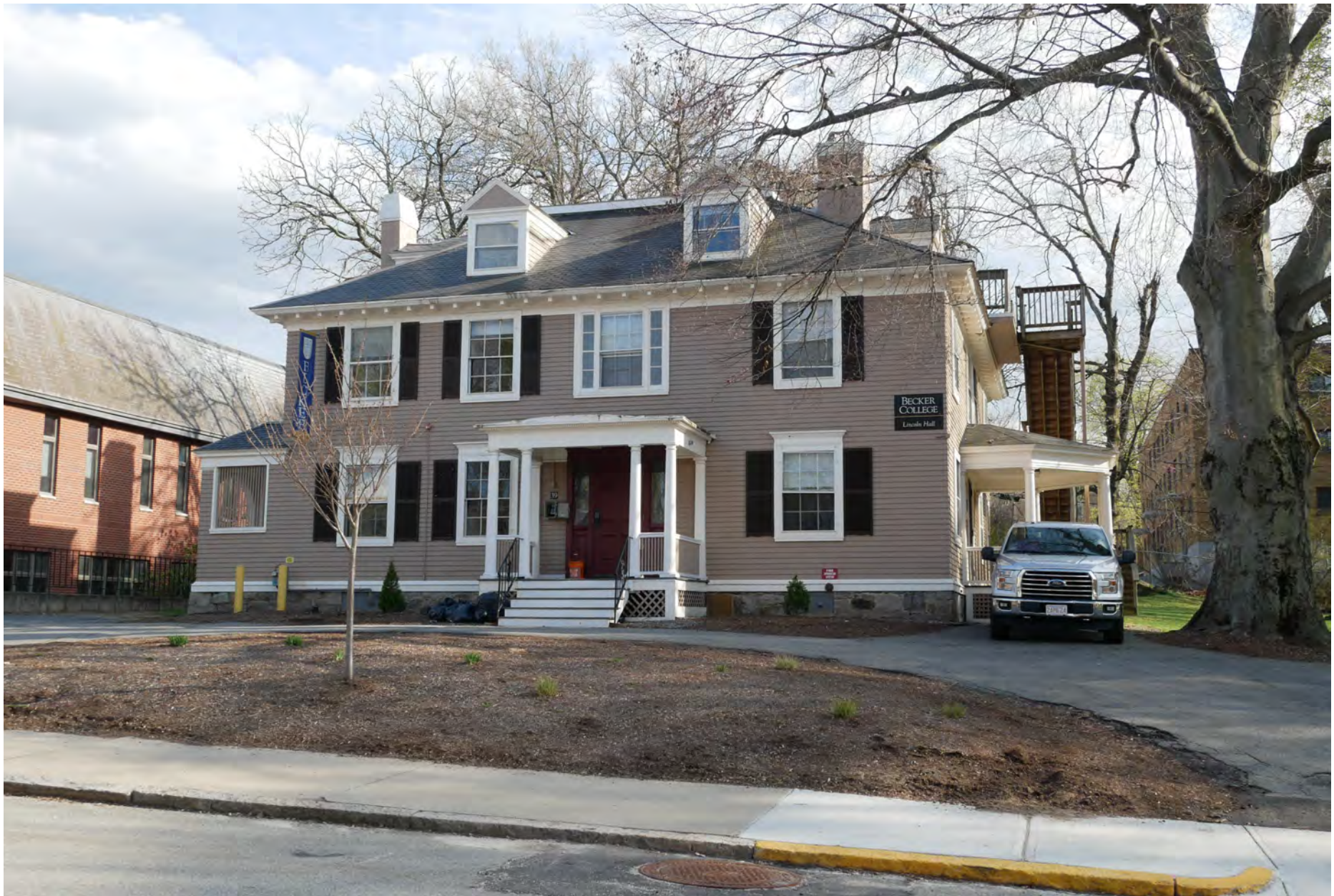
6. 39 Cedar Street, looking southeast. Integrity rating: excellent