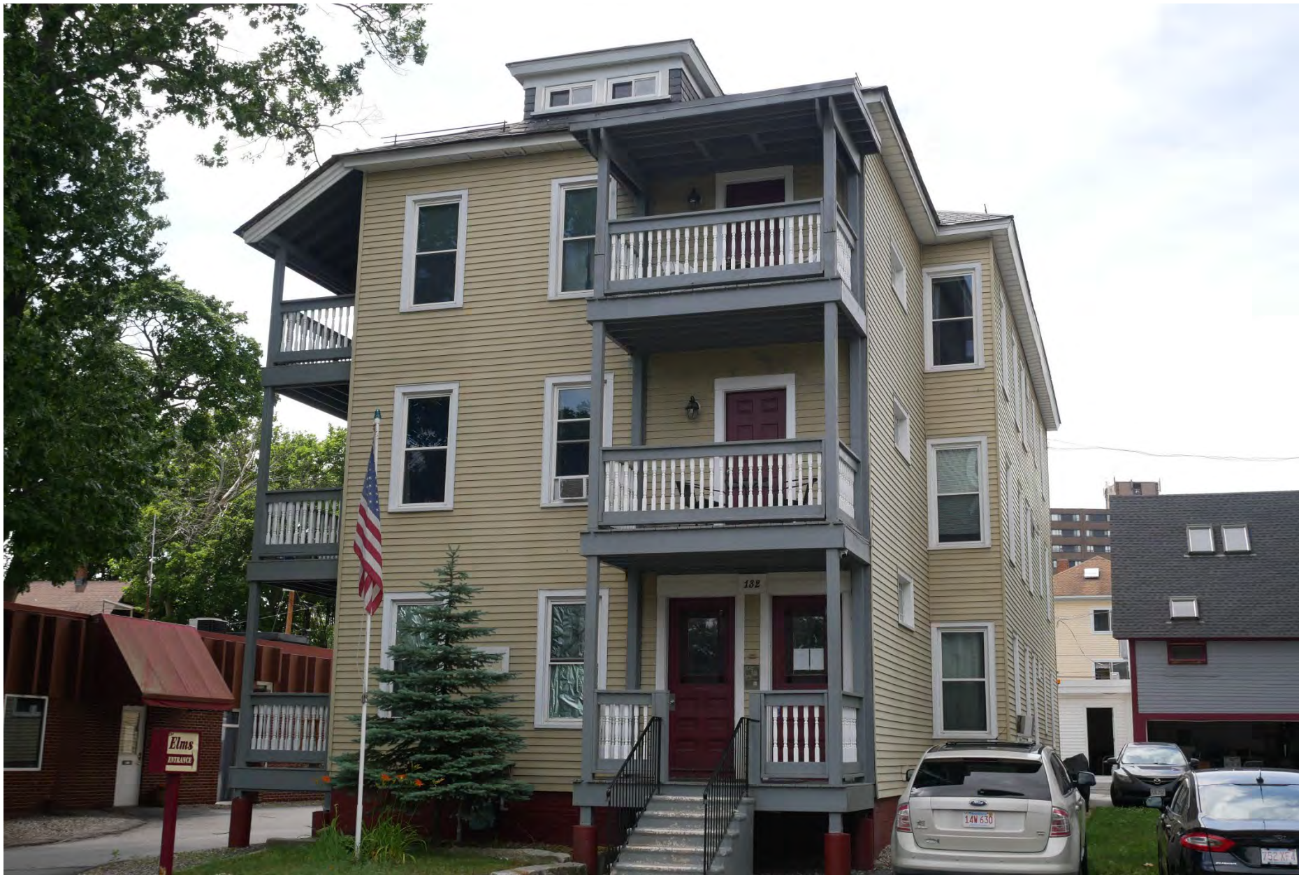
51. 132 Elm Street, looking southeast. Integrity rating: fair