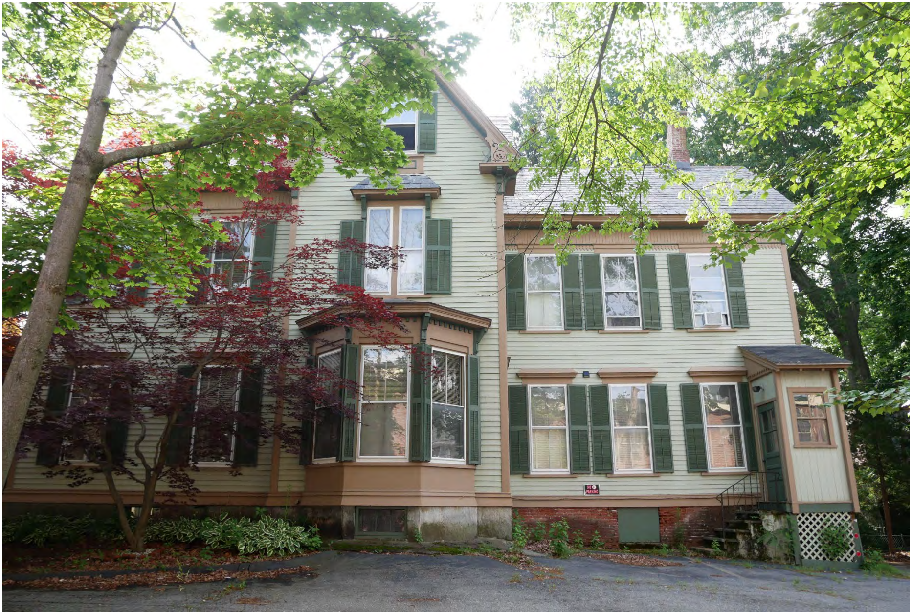
11. 48 Cedar Street, looking west. Integrity rating: very good