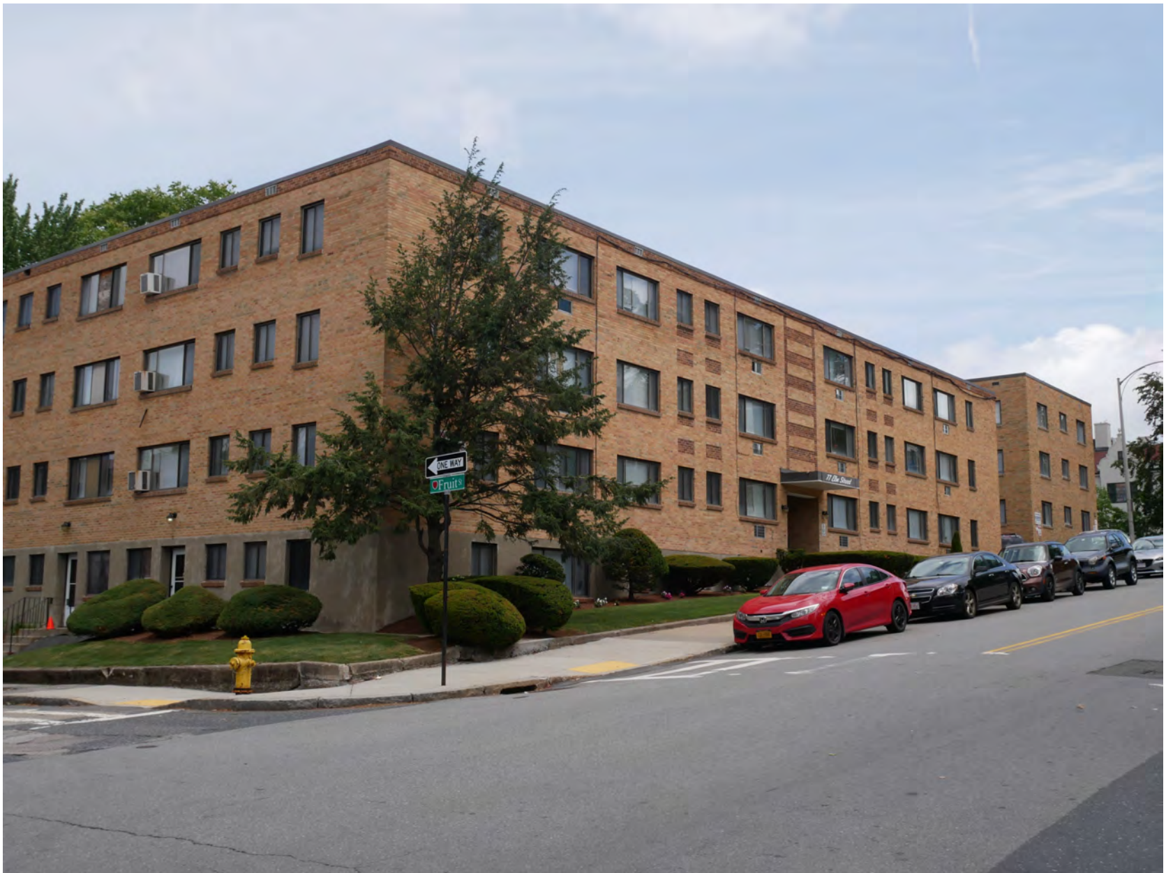
27. 75-77 Elm Street, looking northeast. Integrity rating: excellent