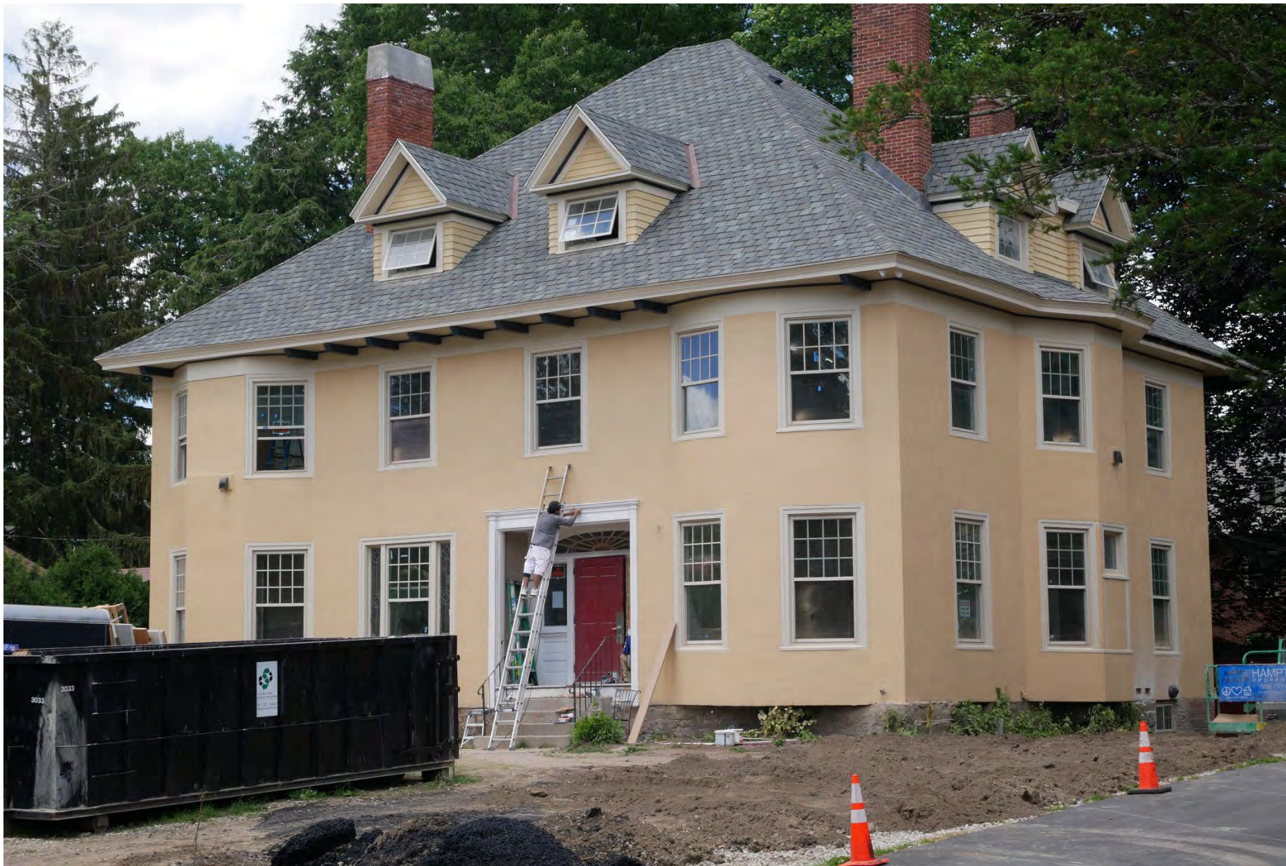
22. 64 Cedar Street, looking northwest. Integrity rating: very good