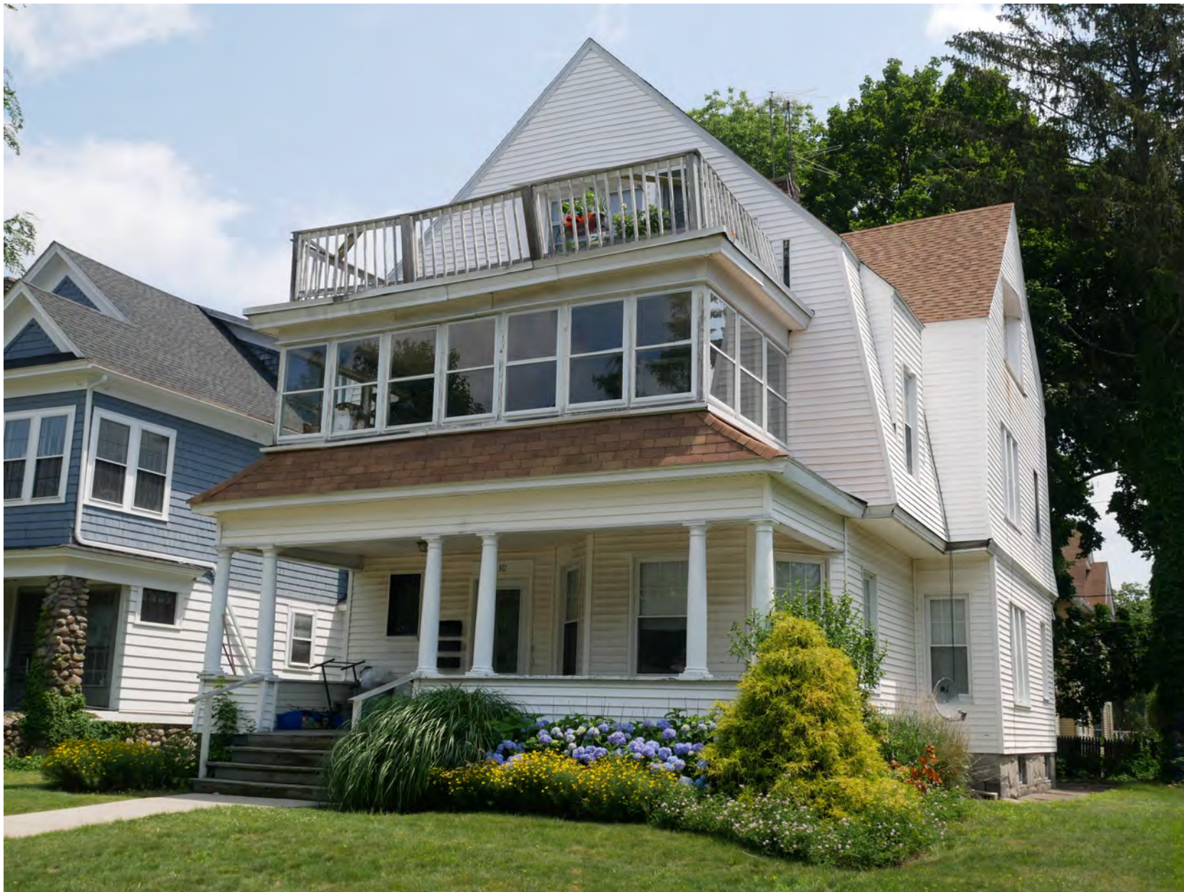
153. 30 Somerset Street, looking northeast. Integrity rating: poor