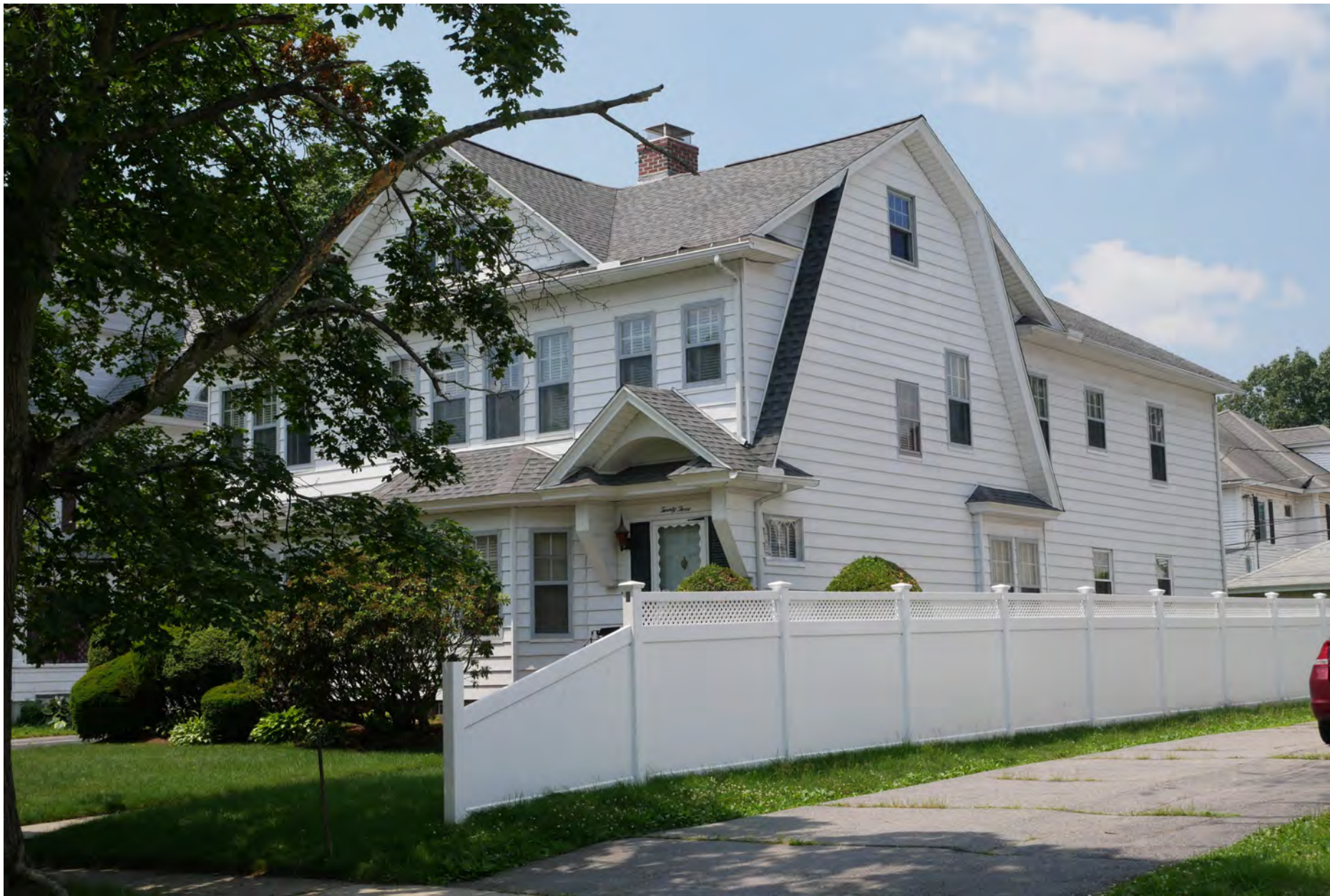
148. 23 Somerset Street, looking southwest. Integrity rating: fair to good