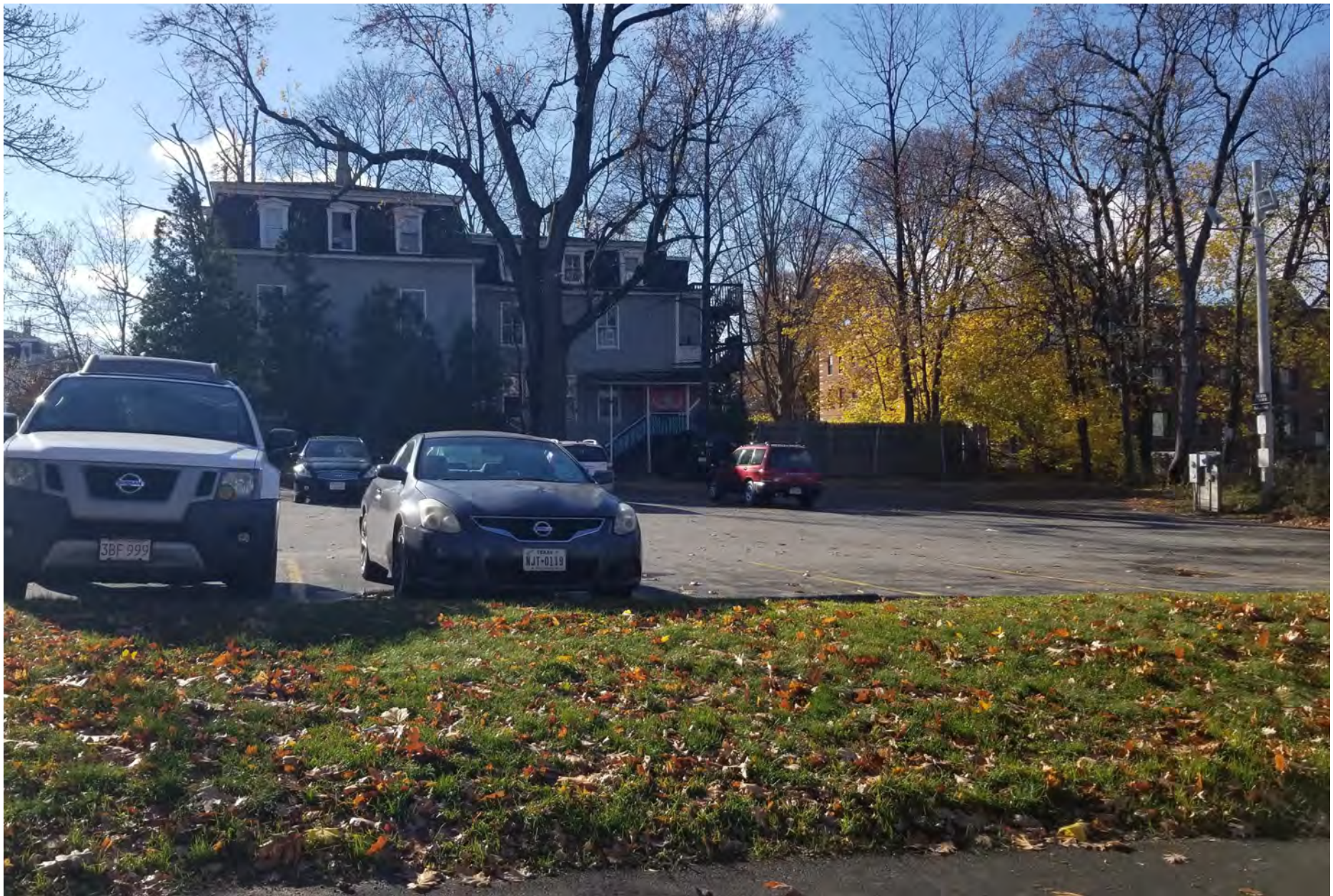
167. Parking lot at 62 West & 49 William Street, looking south from William Street. Integrity rating: N/A