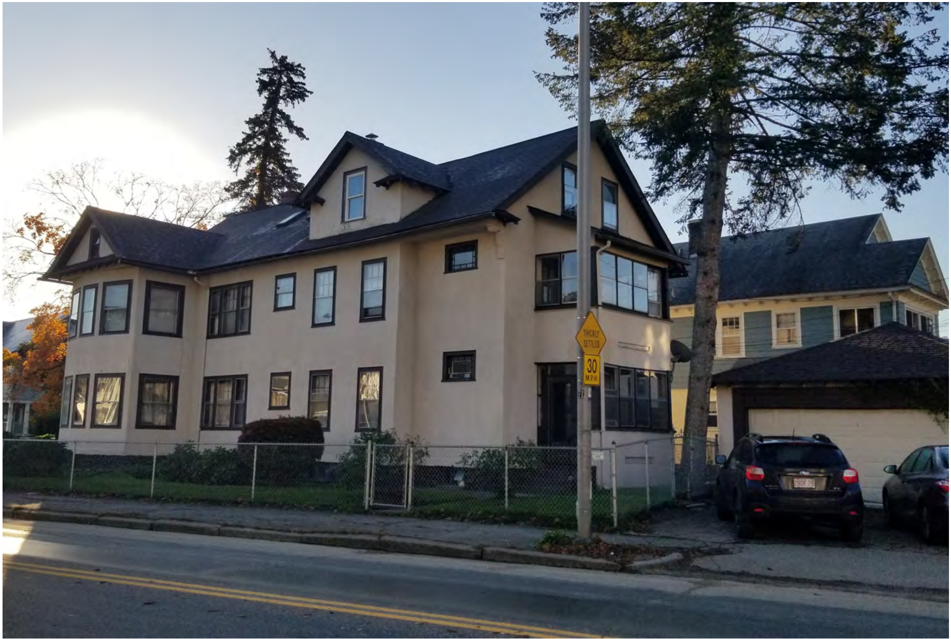
163. 45 Somerset Street, house and garage, looking southeast. Integrity rating: very good