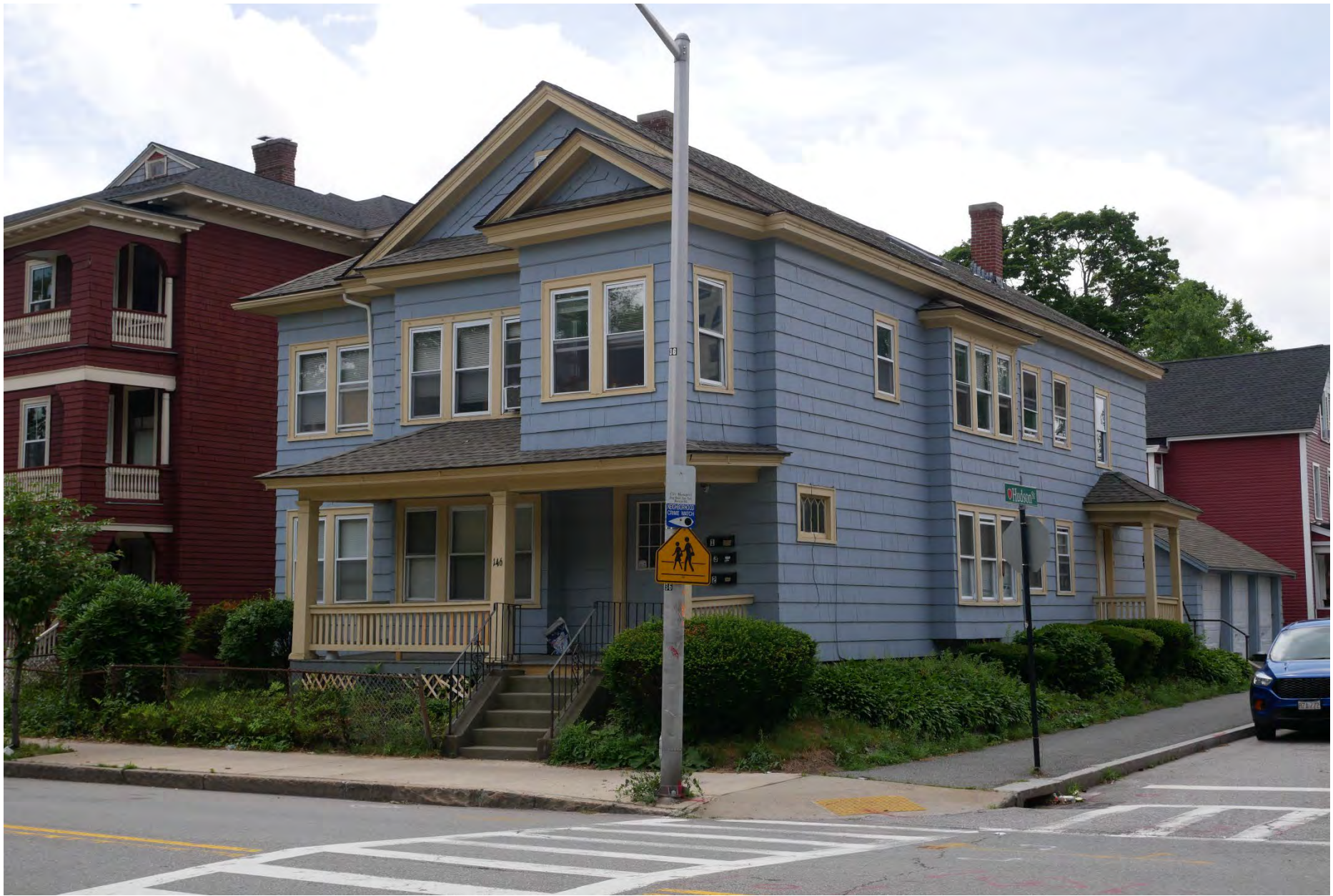
58. 146 Elm Street, looking southeast. Integrity rating: good