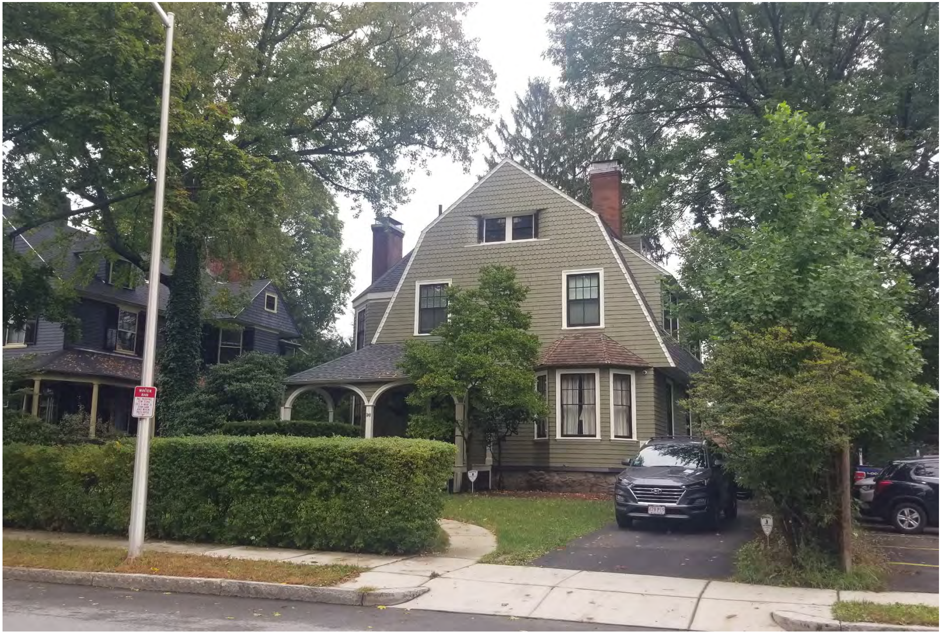
130. 36 Sever Street, looking east. Integrity rating: very good