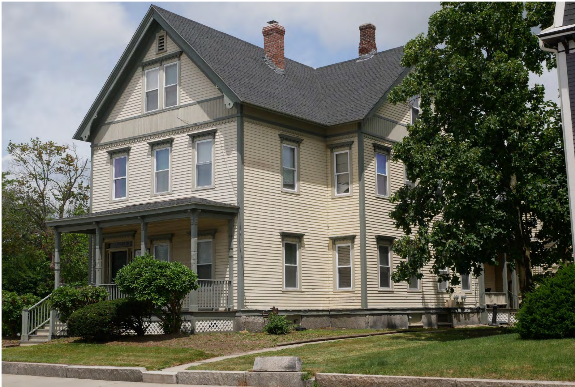
37. 97 Elm Street, looking northwest. Integrity rating: good