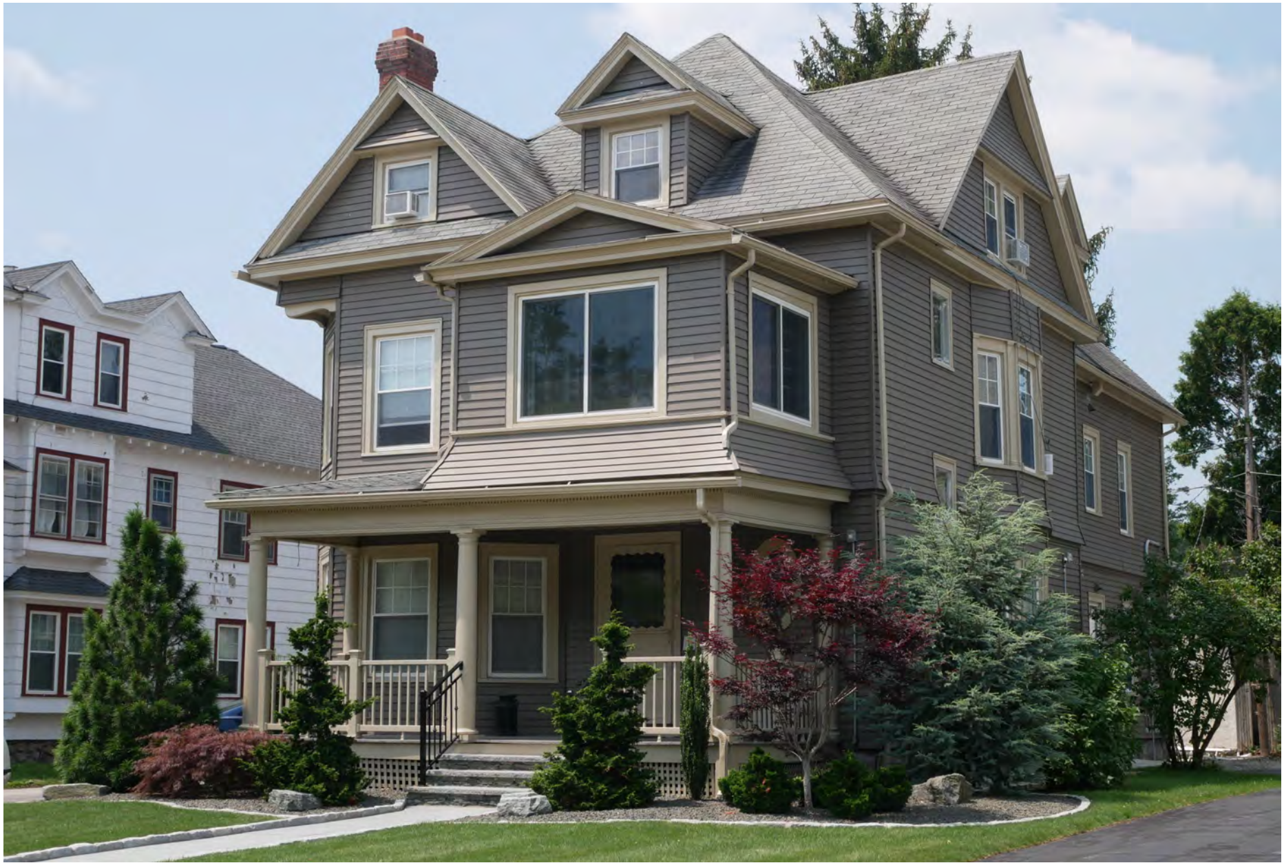
152. 27 Somerset Street, looking southwest. Integrity rating: fair to good