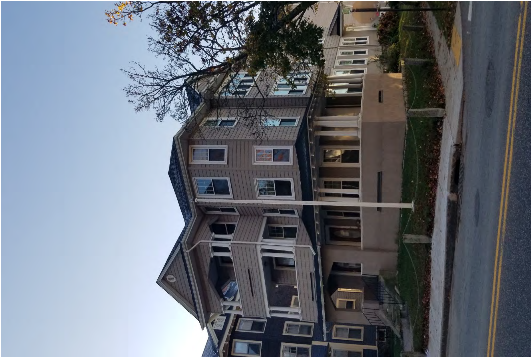
80. 177 Highland Street, looking southeast. Integrity rating: very good