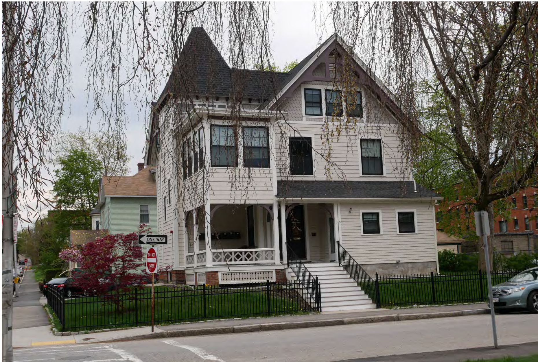
68. 38 Fruit Street, looking southeast. Integrity rating: very good