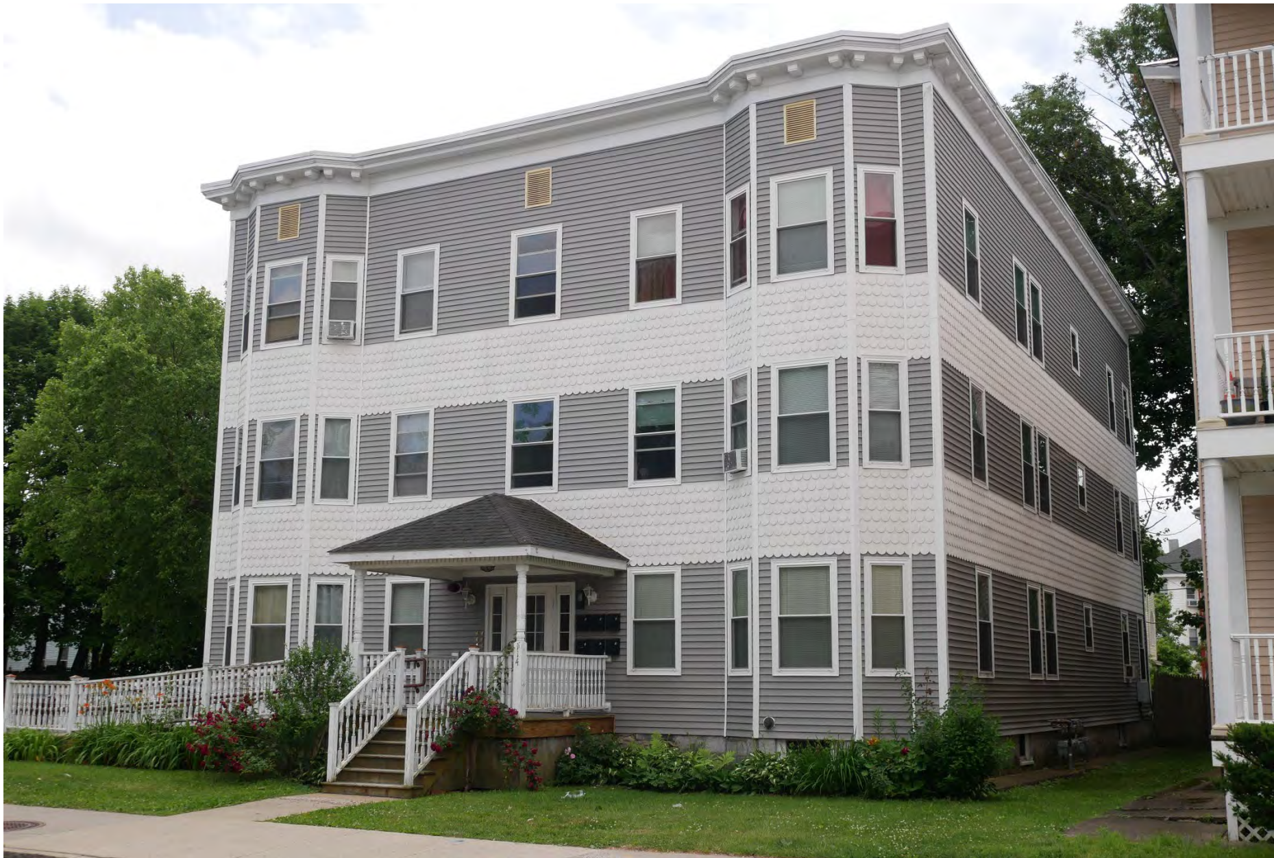
45. 114 Elm Street, looking southeast. Integrity rating: good