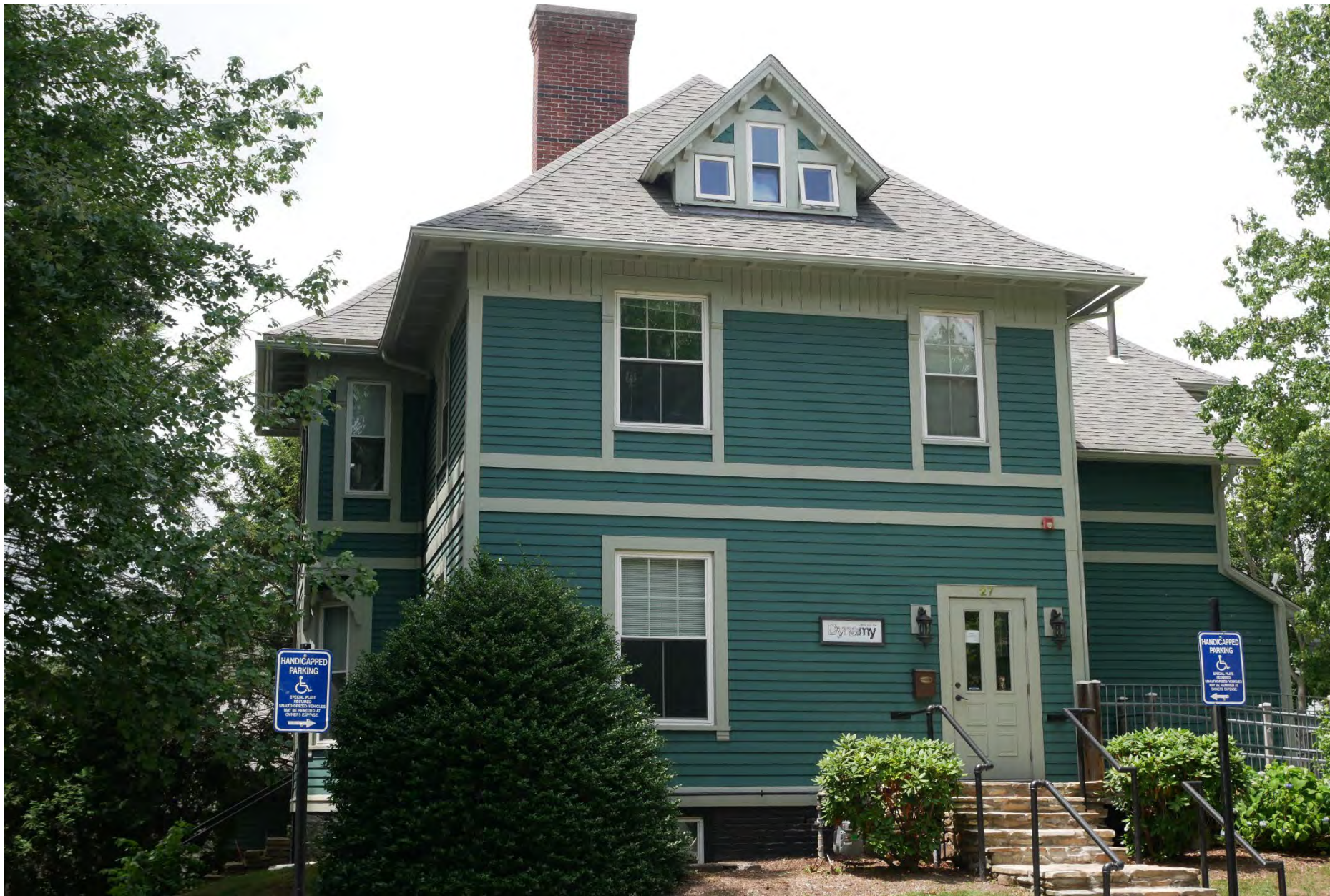
126. 27 Sever Street, looking west. Integrity rating: very good