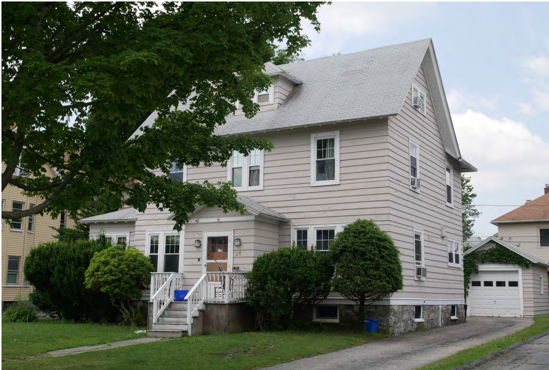
102. 31 Roxbury Street, house and garage, looking southwest. Integrity rating: good