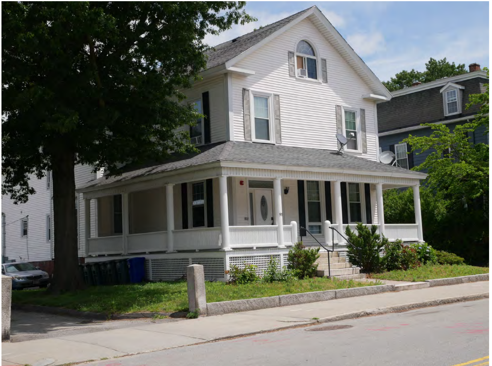
33. 93 Elm Street, looking northwest. Integrity rating: good