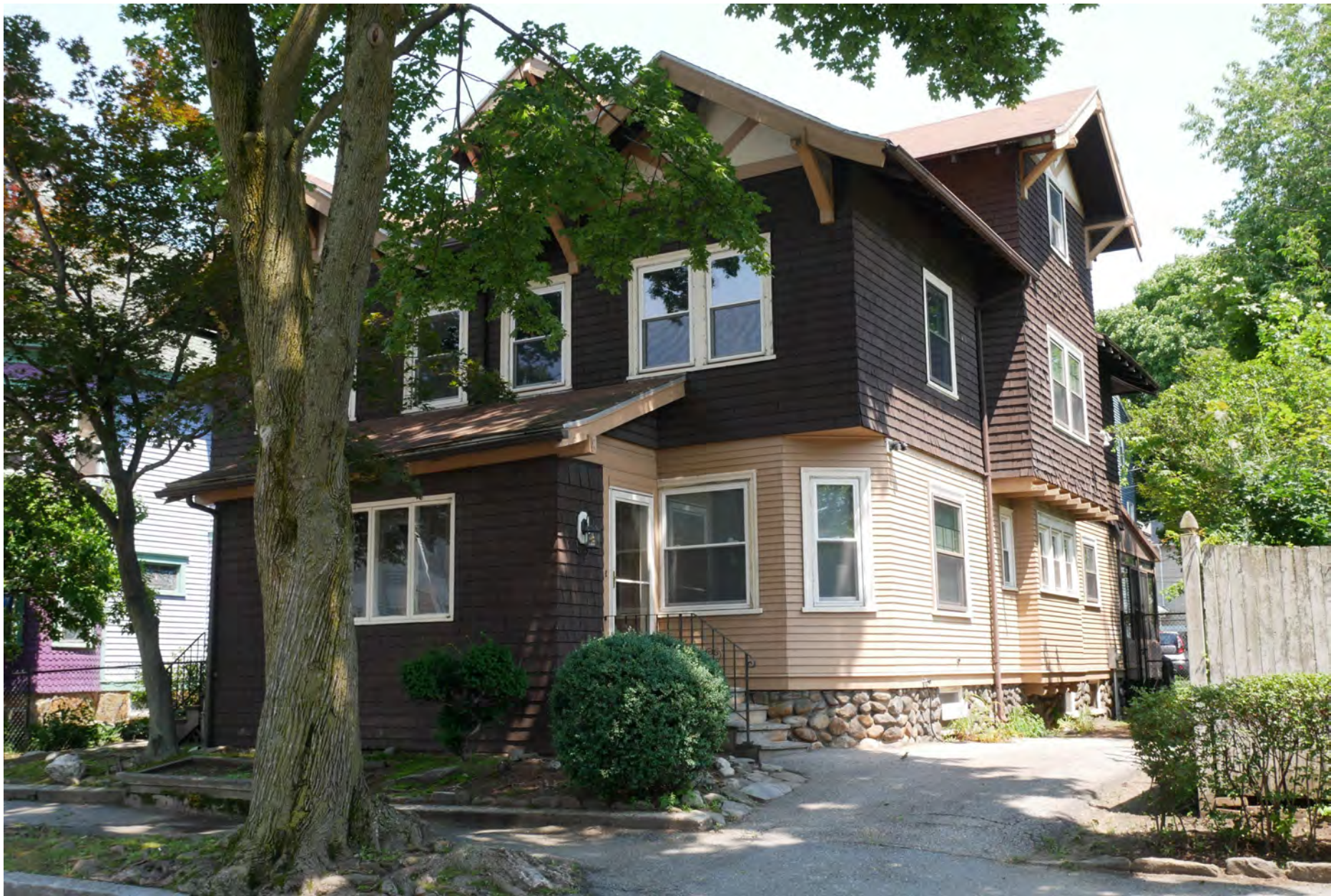
76. 52 Fruit Street, looking northeast. Integrity rating: very good