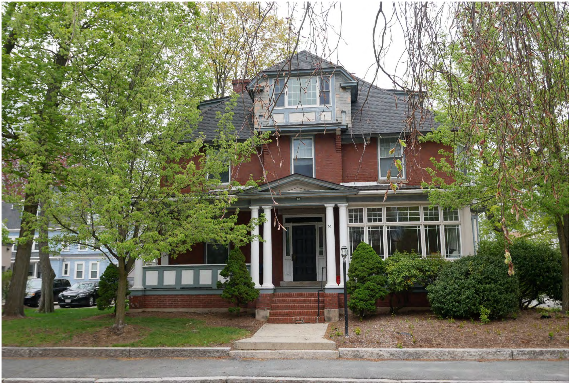
175. 56 William Street, looking north. Integrity rating: very good