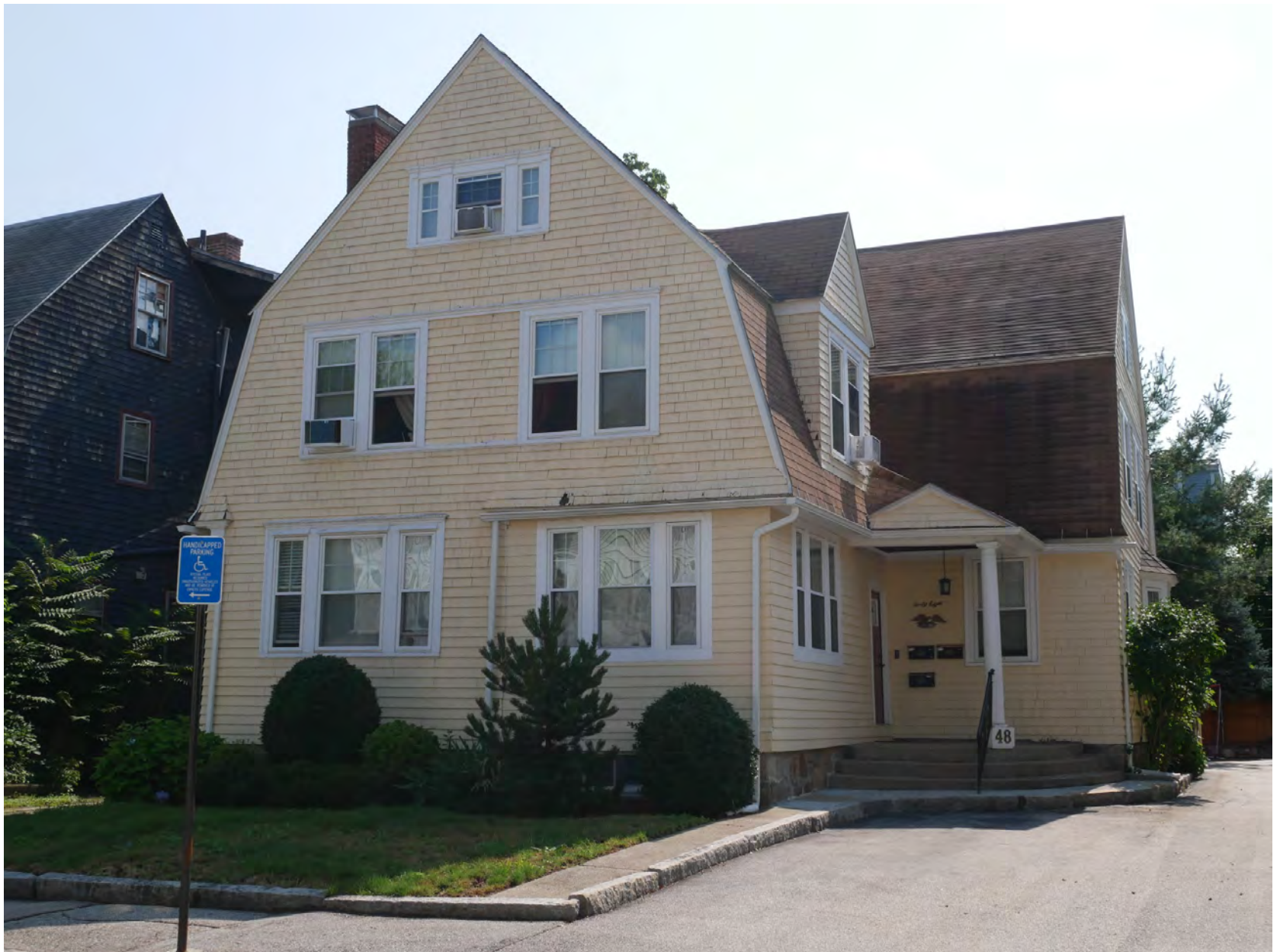
74. 48 Fruit Street, looking northeast. Integrity rating: good