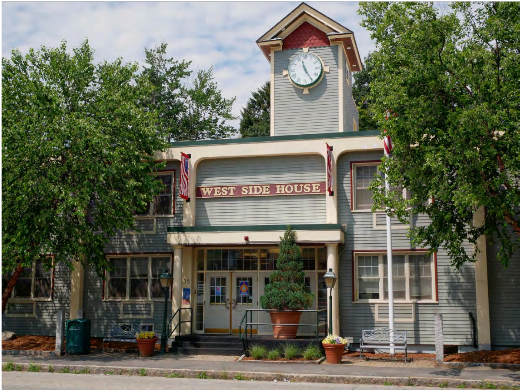
64. 35 Fruit Street, looking northwest. Integrity rating: fair