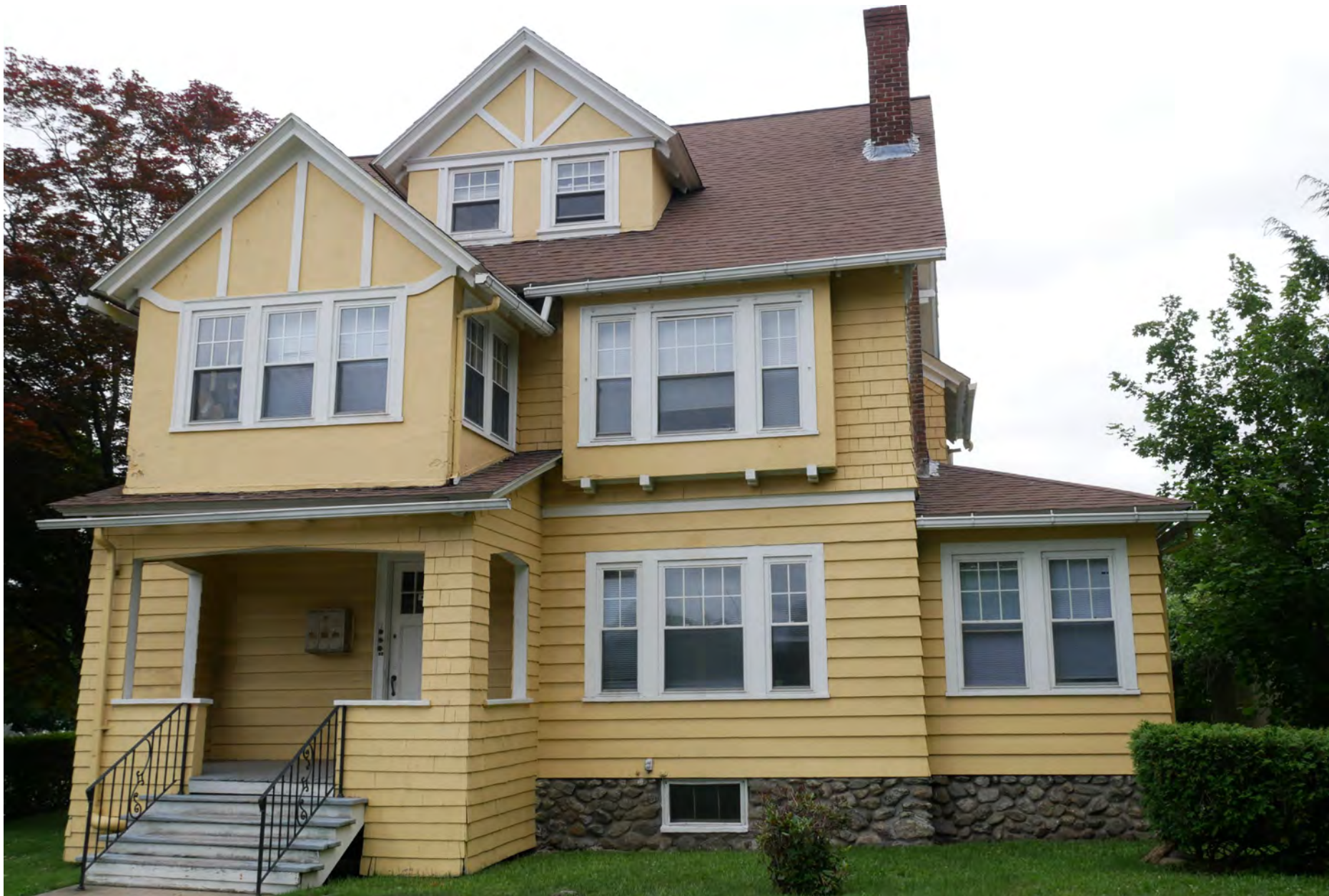
123. 164 Russell Street, looking east. Integrity rating: very good