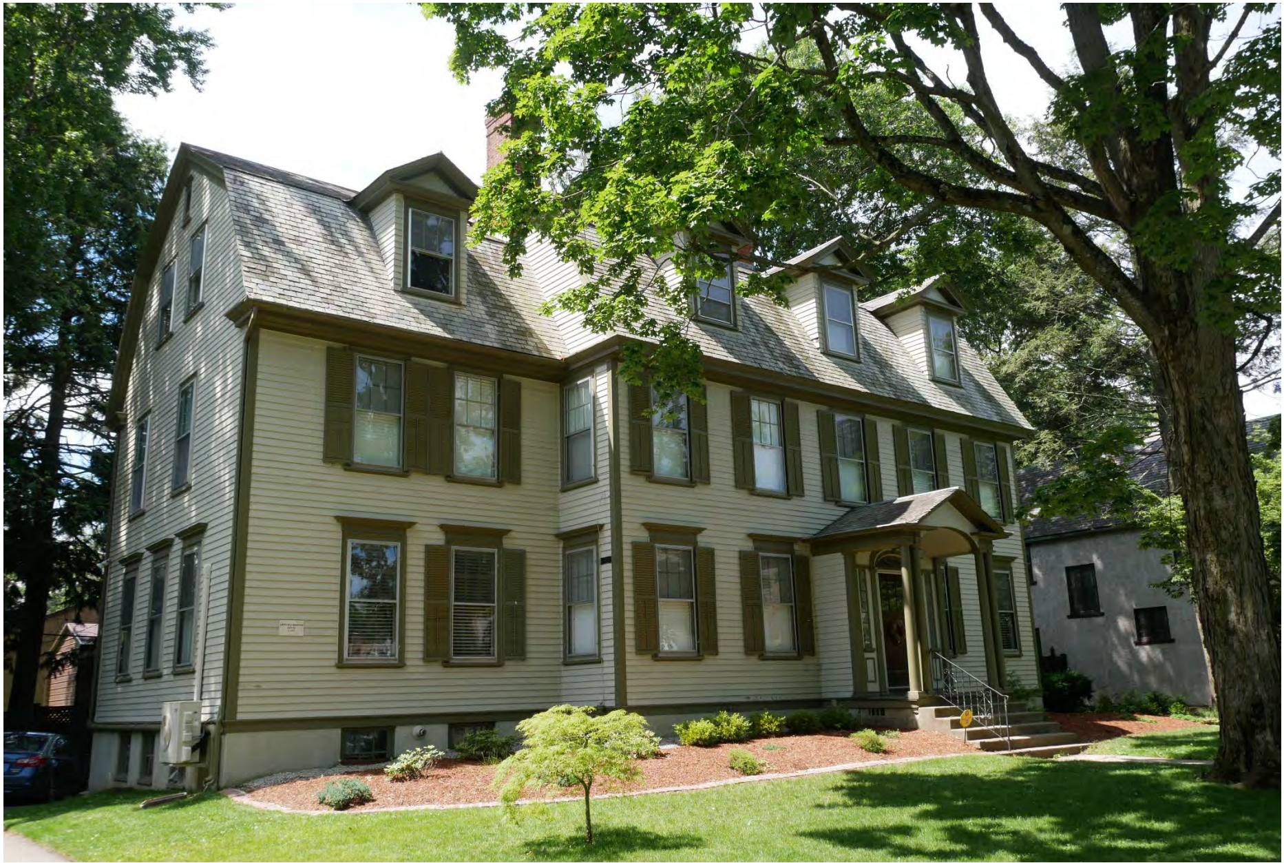
187. 85 William Street, looking southwest. Integrity rating: excellent