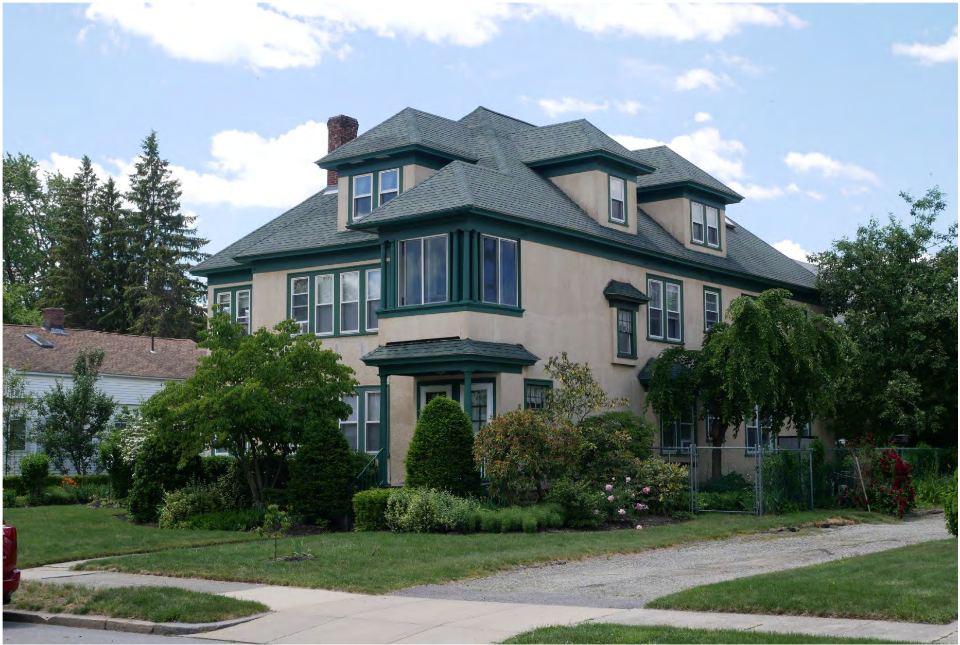
97. 21 Roxbury St, looking southwest. Integrity rating: good