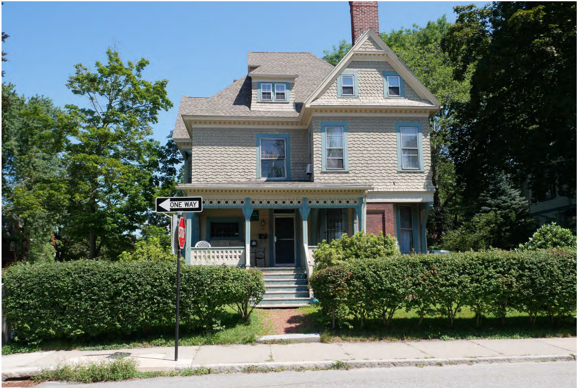
14. 52 Cedar Street, looking north. Integrity rating: very good