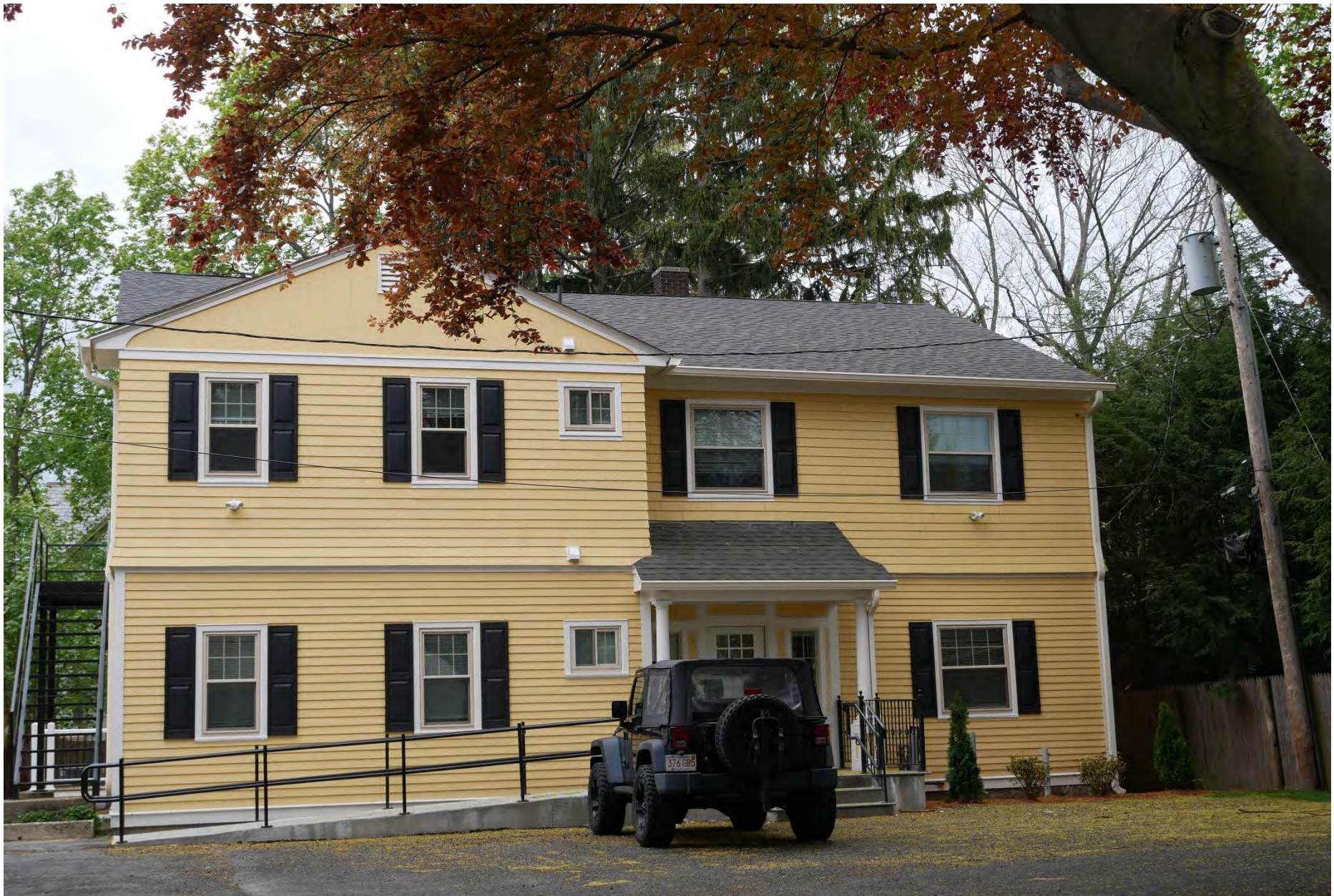
67. 37 Fruit Street, Building 2, looking southwest. Integrity rating: poor