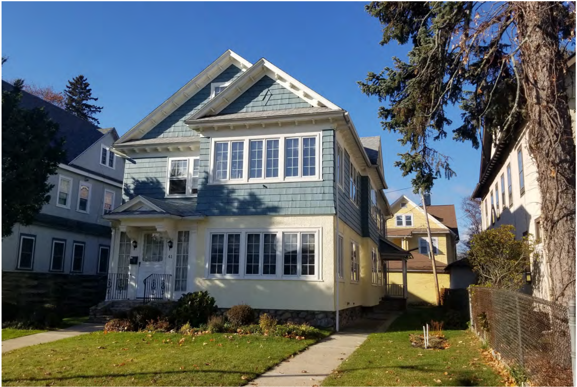
160.41 Somerset Street, looking southwest. Integrity rating: very good