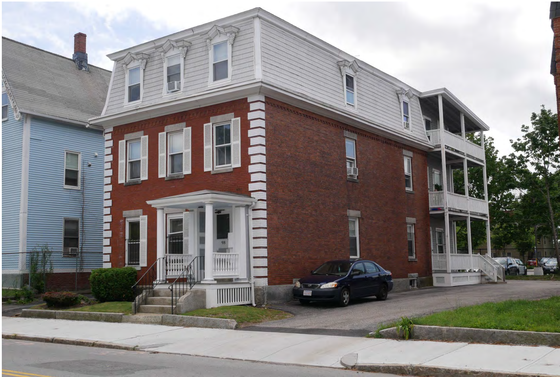
38. 98 Elm Street, looking southeast. Integrity rating: good