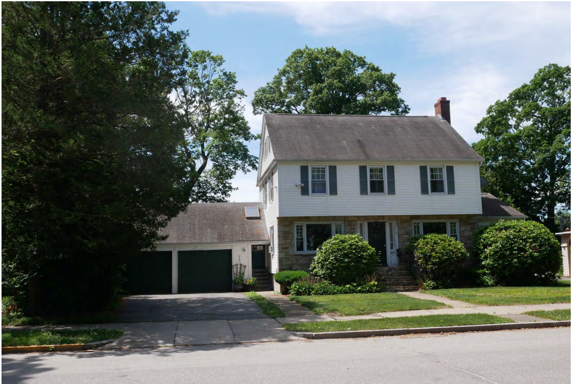
189. 89 William Street, looking south. Integrity rating: good