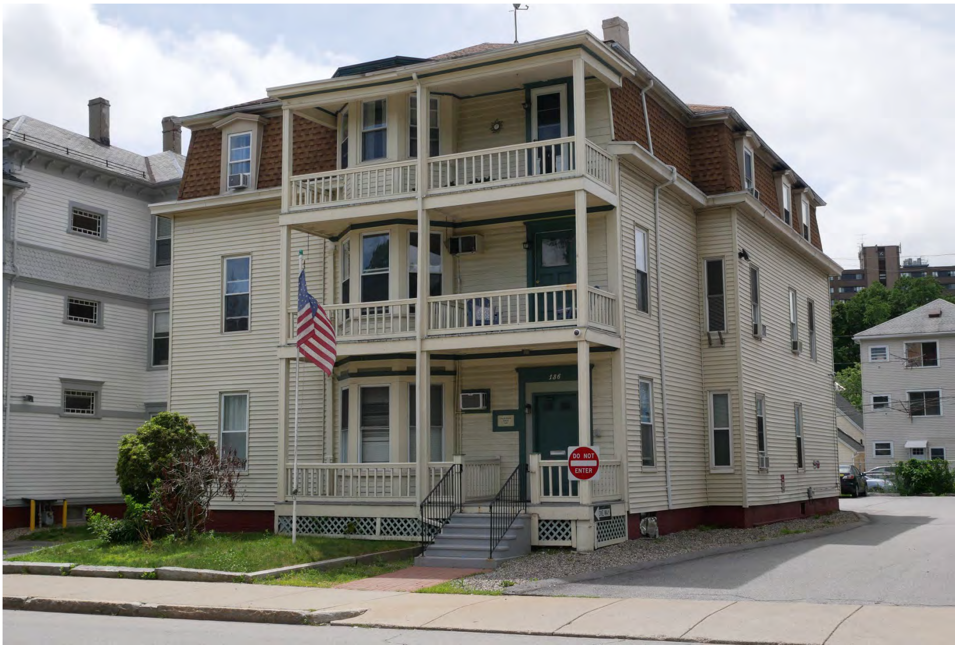
53. 136 Elm Street, looking southeast. Integrity rating: fair