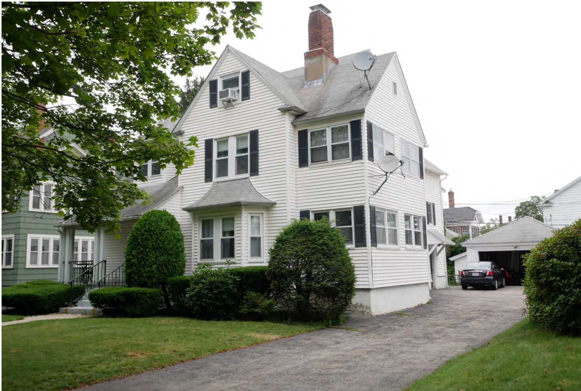
117. 140 Russell Street house and garage, looking northeast. Integrity rating: fair